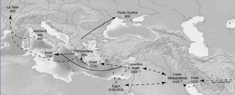
Diffusion map of mirrors