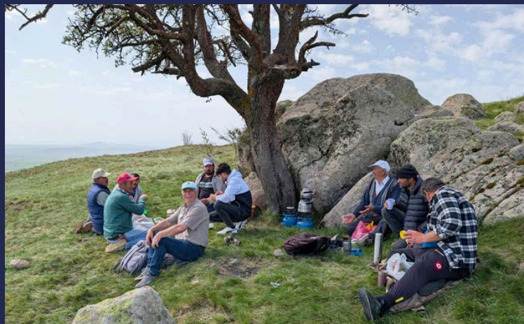
Workers gather to chat and share food and snacks.