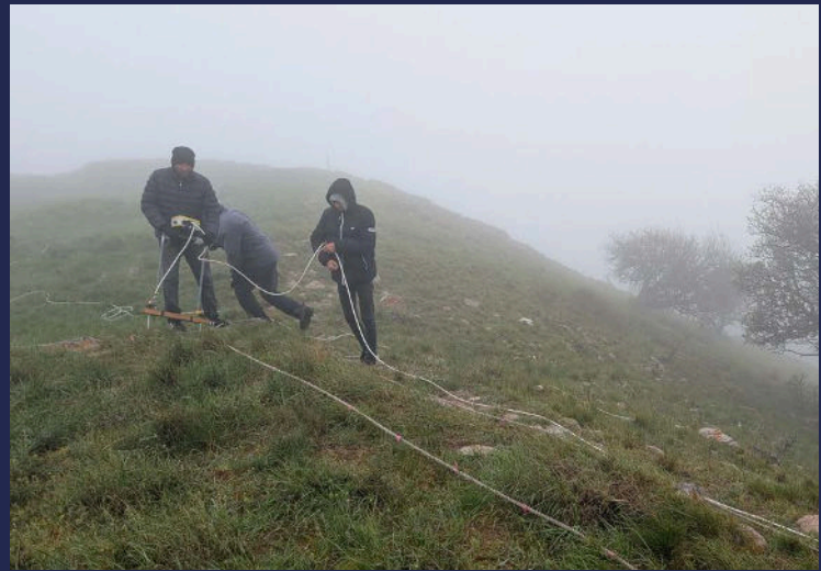
Looking for points for preparing survey grids.

In the summer of 2025, I joined the Kerkenes Project in Yozgat, central Anatolia. For many international scholars, fieldwork in Turkey means collecting evidence, expanding networks, publishing papers, and advancing knowledge of the ancient world. For me, however, it is also deeply personal. Fieldwork is a return home: talking with workers from the village, walking the landscapes of my childhood, breathing the scent of native flowers, and tasting familiar foods that I ate growing up.