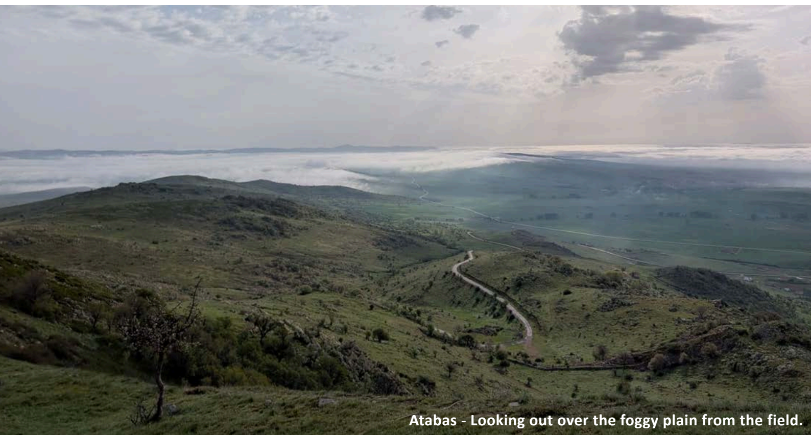
Atabas - Looking out over the foggy plain from the field.

Kerkenes Project, Turkey Khirbat al-Mukhayyat, Jordan Syedra Antik Kenti, Turkey Rural Landscapes of Imperial Iron Age Mesopotamia, Kurdistan Region of Iraq