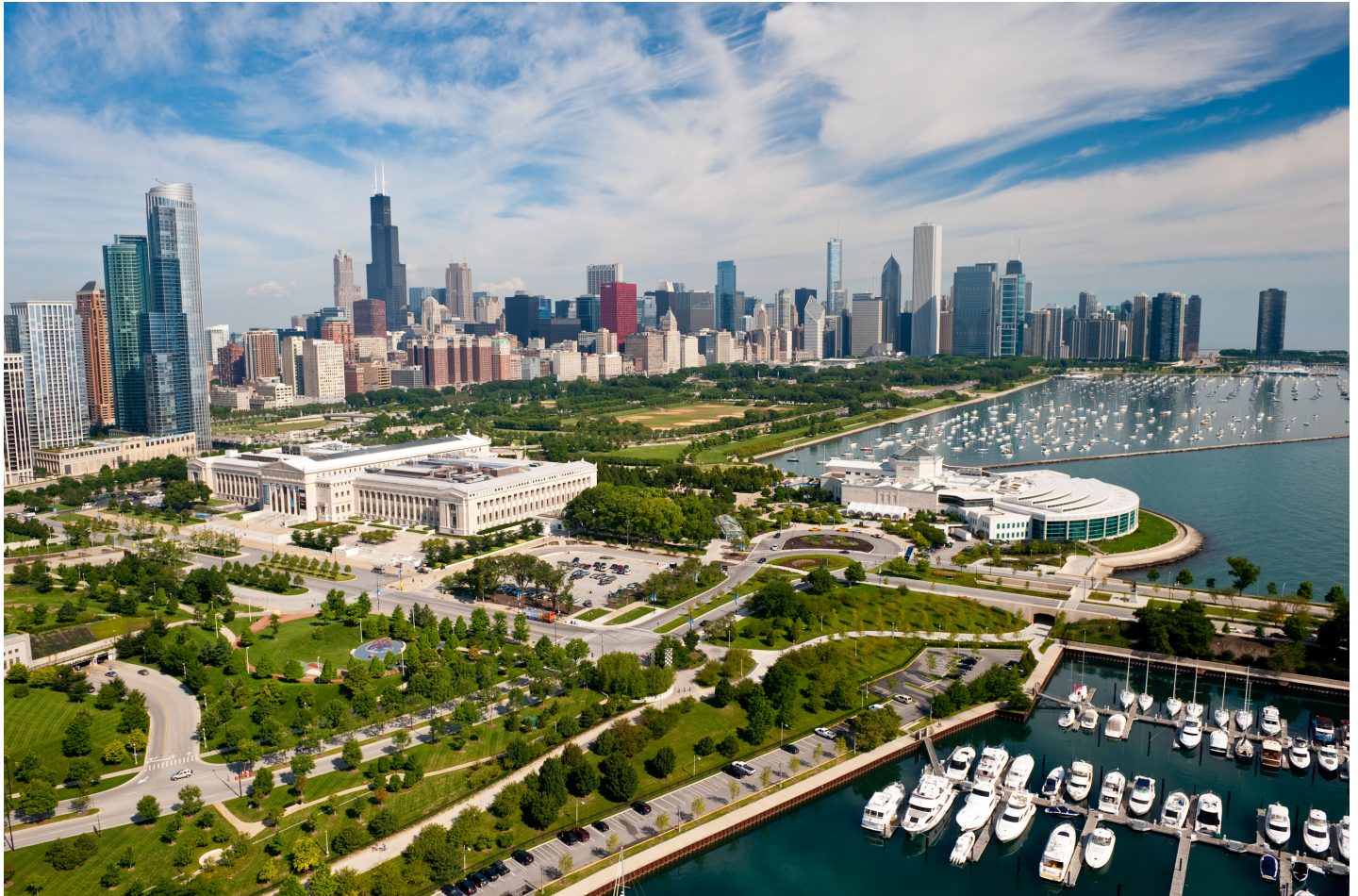
Exhibit | Sponsor | Advertise ASOR 2021 Prospectus