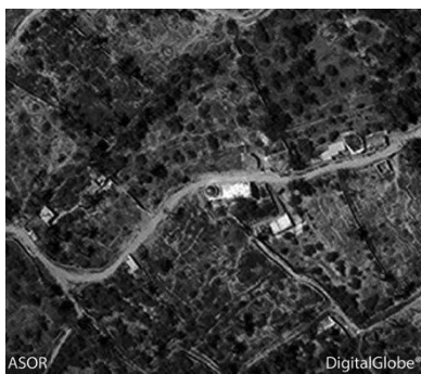
No visible damage (DigitalGlobe; June 16, 2015)