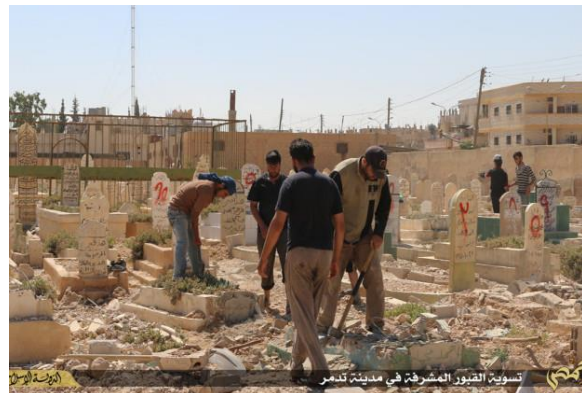
Figure 3: Graves in historic Palmyra being destroyed (ISIL social media; June 15, 2015)

On June 15, 2015 Twitter accounts associated with ISIL published images showing the destruction of a relatively modern Islamic cemetery. 21 The images currently circulating