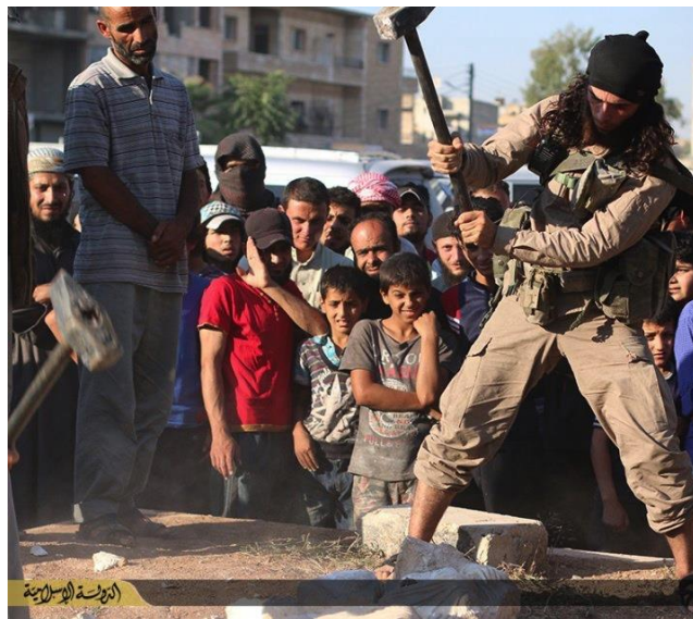
Figure 2: Destruction of Palmyrene statuary in Manbij, Aleppo governorate (ISIL social media; July 3, 2015)

The trafficking and sale of illicit cultural property, especially antiquities, have affected all of Syria and are a byproduct of the civil unrest stemming from the ongoing armed conflict. Museum staff in Palmyra have worked tirelessly to protect artifacts housed at the site, 11 but many of the architectural features around the ancient site have been looted, and stolen Palmyrene objects have appeared in other parts of the country and abroad. 12 On July 2, 2015 ISIL militants in the northern town of Manbij, located in Aleppo governorate, intercepted an individual or multiple individuals transporting Palmyrene funerary sculptures. These fragments were most likely removed from tombs at the archaeological site and/or possibly taken from the collections of the Tadmor Museum.