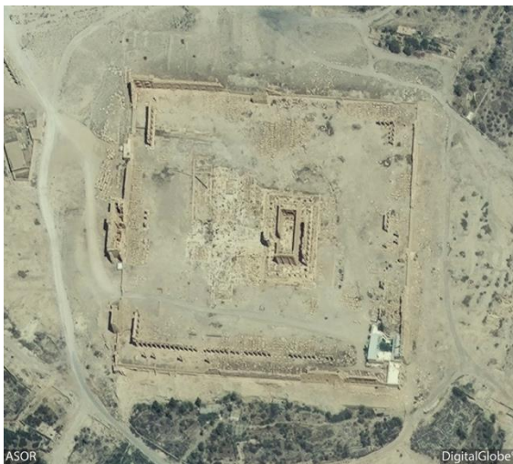
No visible damage (taken June 26, 2015)