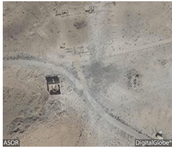
Visible damage (DigitalGlobe; August 27, 2015)