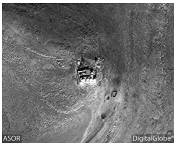
No visible damage (DigitalGlobe; March 1, 2015)