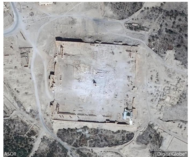
Visible damage (DigitalGlobe; September 2, 2015)