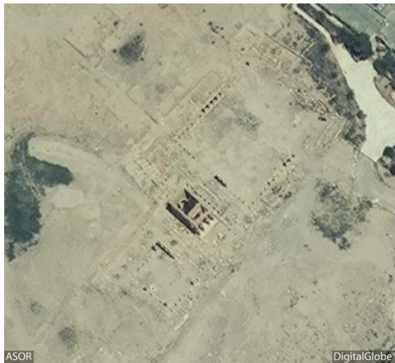
No visible damage (June 26, 2015)

On August 23, 2015 reports surfaced concerning the destruction of the Baalshamin Temple. 28 Baalshamin was the Lord of the Heavens in the pre-Islamic Semitic pantheon. According to Ross Burns, the earliest architectural remains date to 17 CE, though the majority of the structure dates to the early 2nd century CE. The Egyptian motifs that characterize the style of the small temple make it unique in Roman Syria. 29 Following the destruction, photographs released by ISIL depicted the inner and outer walls of the temple lined with bottles and barrels of explosives, which were subsequently detonated. 30 DigitalGlobe satellite imagery taken on August 27, 2015 acquired by ASOR CHI has confirmed this destruction (Figure 15).