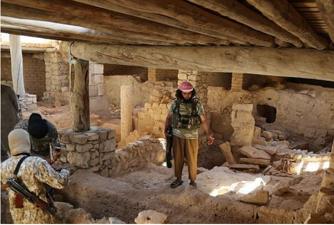
Figure 12: Mar Elian being prepared for destruction

In late July 2015, ISIL militants took control of al-Qaryatain, a neighboring village of Palmyra, from the Syrian government. On August 7, 2015, militants abducted hundreds of local Christians from the village and demolished its ancient monastery of Mar Elian (Figure 12), which was constructed during the Byzantine period and continued to be used as a Christian place of worship in the area. 25 DigitalGlobe satellite imagery of this site corresponding to the time of destruction was not available at the time of this report.