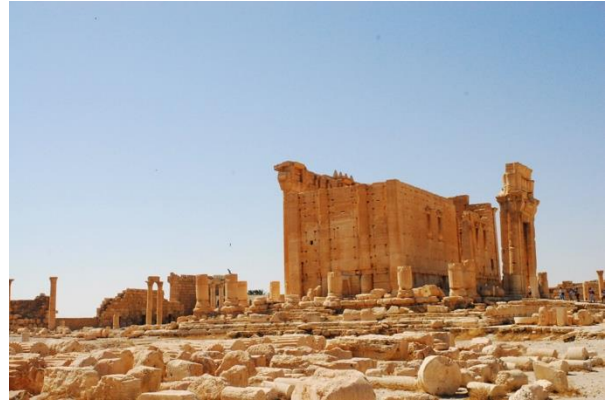
Figure 16: Temple of Bel (Michael Danti; 2010)

On August 30, 2015 it was reported that ISIL destroyed parts of the Temple of Bel with allegedly 30 tons of explosives. 31 DigitalGlobe satellite imagery confirms severe damage to the temple with only the front gateway of the inner cella left standing (Figure 17). Additionally, the temple colonnades, main entrance, and surrounding wall appear to be intact.