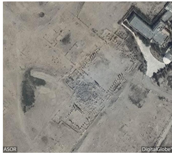
Visible damage (DigitalGlobe: August 27, 2015)