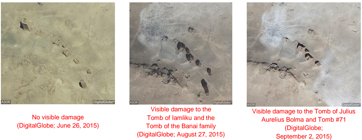
Figure 8: Satellite imagery of tower tombs in Tadmor

Additionally, seven tower tombs located just outside the ancient city of Palmyra have been severely damaged or destroyed since the end of June (Figures 8–11). 24 DigitalGlobe satellite imagery acquired by ASOR CHI shows this damage took place in two phases. Between June 26, 2015 and August 27, 2015 the Tomb of Iamliku was destroyed and the Tomb of the Banai family directly to its east was badly damaged. In addition the Tomb of Atenaten in the northwestern part of the site was destroyed. Within a second phase of destruction, between August 27, 2015 and September 2, 2015, more tower tombs were destroyed. This included the Tomb of Elahbel, the Tomb of Kithoth in the northern part of the necropolis, and Tomb of Julius Aurelius Bolma and Tomb #71 near the Tomb of Iamliku. Collectively, the damage to these tombs is not confined to a single area within the Valley of the Tombs, but instead it is distributed throughout various locations, leaving some towers destroyed and others still standing. The reasoning for this differentiation is unknown. Further investigation will be published in the upcoming Weekly Report 57–58.