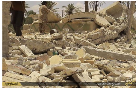
Figure 5: Sufi shrine and tomb of Shagaf/Nizar Abu Behaeddine (June 22, 2015)