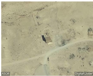
No visible damage (June 26, 2015)