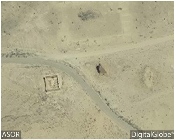
No visible damage (DigitalGlobe; June 26, 2015)