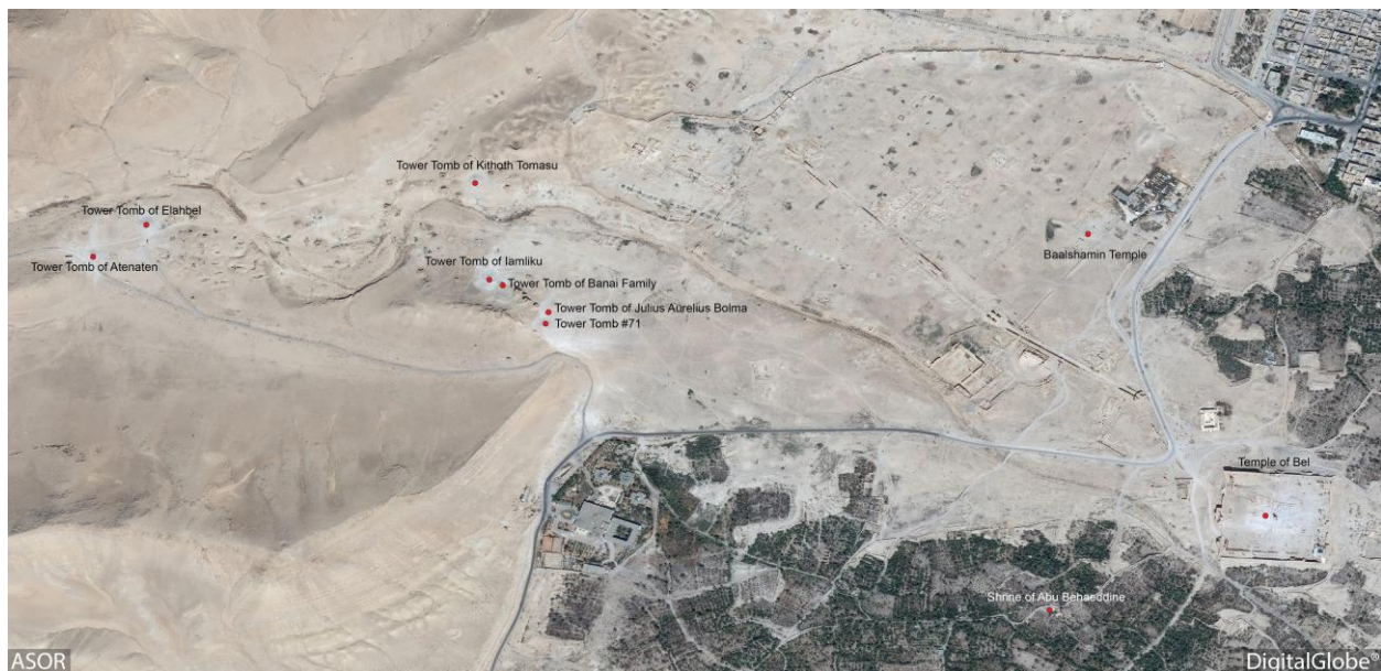
Figure 1: DigitalGlobe satellite imagery depicting multiple destroyed Islamic tombs and ancient architectural features in the Tadmor and Palmyra areas (Digital Globe; September 2, 2015)

Since its capture by ISIL militants in May 2015, the region around the ancient city of Palmyra (modern Tadmor) has been in the midst of a humanitarian crisis, which has escalated dramatically in recent weeks. This report will provide a summary of the current situation in Palmyra and the effects of the conflict on its people and cultural heritage. Atrocities include attacks on civilians and mass abductions. Intentional damage to the cultural materials of the local populations is widespread, including the destruction of Islamic and Christian religious sites, as well as severe damage to the architectural remains within the UNESCO World Heritage Site of Palmyra. Confirmed damage at this archaeological site includes the destruction of the Baalshamin Temple and the Temple of Bel and destruction or severe damage to at least seven tower tombs within the Valley of the Tombs. For more detailed information on the heritage and history of the ancient city, please review the ASOR Cultural Heritage Initiative's Special Report on the Significance of Palmyra . 2