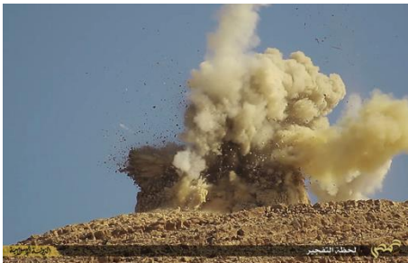
Figure 4: Shrine of Sheikh Mohammad b. ‘Ali (ISIL social media; June 22, 2015)

On June 22, 2015 ISIL published photos depicting the destruction of Islamic shrines near the settlement of Tadmor. 22 The Shiite Shrine of Sheikh Mohammad ibn ‘Ali was demolished between March 1, 2015 and May 22, 2015 based on observations of DigitalGlobe satellite imagery (Figures 4 and 6). ISIL destroyed the Sufi Tomb of Shagaf/Nizar Abu Behaeddine between June 15, 2015 and June 26, 2015 based on DigitalGlobe satellite imagery (Figures 5 and 7). 23