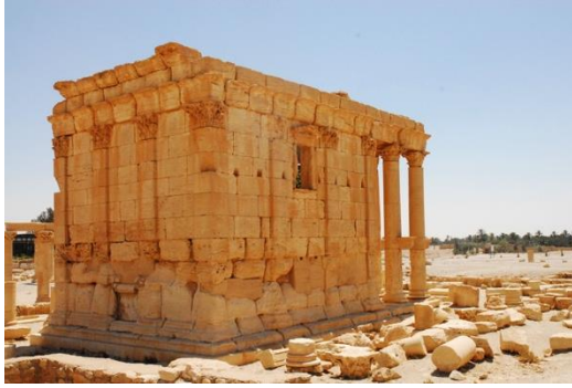
Figure 13: Baalshamin Temple (Michael Danti; 2010)