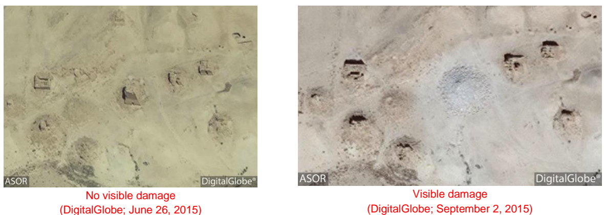
Figure 9: Satellite imagery of Tower Tomb of Kithoth Tomasu