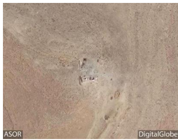
Visible damage (DigitalGlobe; May 28, 2015)