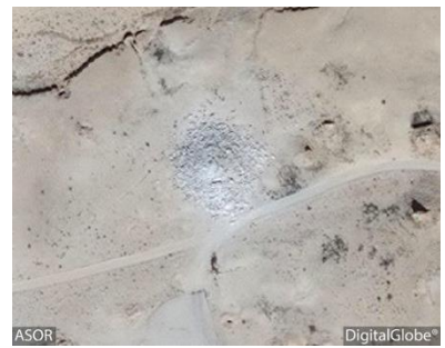
Visible damage (September 2, 2015)