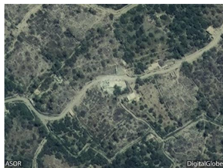
Visible damage (DigitalGlobe; June 26, 2015)