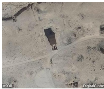
No visible damage (August 27, 2015)