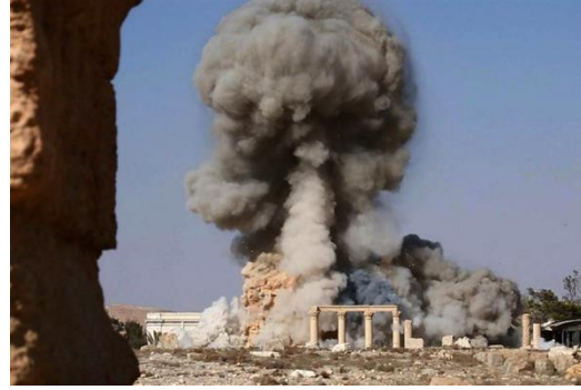
Figure 14: Destruction of the Baalshamin Temple (ISIL social media; August 24, 2015)

On August 23, 2015 reports surfaced concerning the destruction of the Baalshamin Temple. 28 Baalshamin was the Lord of the Heavens in the pre-Islamic Semitic pantheon. According to Ross Burns, the earliest architectural remains date to 17 CE, though the majority of the structure dates to the early 2nd century CE. The Egyptian motifs that characterize the style of the small temple make it unique in Roman Syria. 29 Following the destruction, photographs released by ISIL depicted the inner and outer walls of the temple lined with bottles and barrels of explosives, which were subsequently detonated. 30 DigitalGlobe satellite imagery taken on August 27, 2015 acquired by ASOR CHI has confirmed this destruction (Figure 15).