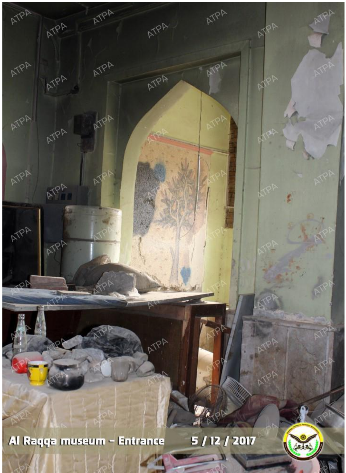
Room 1, seen from the northwest (ATPA; December 11, 2017)