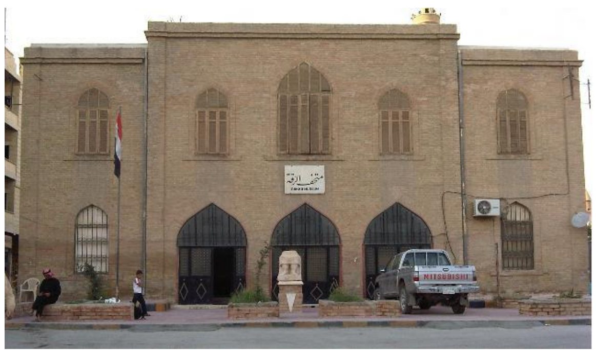
The entrance to the Raqqa Museum before the conflict (Syrian Digital Library of Cuneiform)