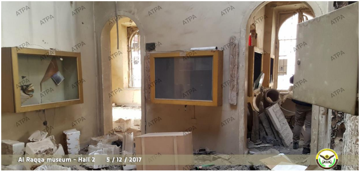
Room 10, seen from the east (ATPA; December 11, 2017)