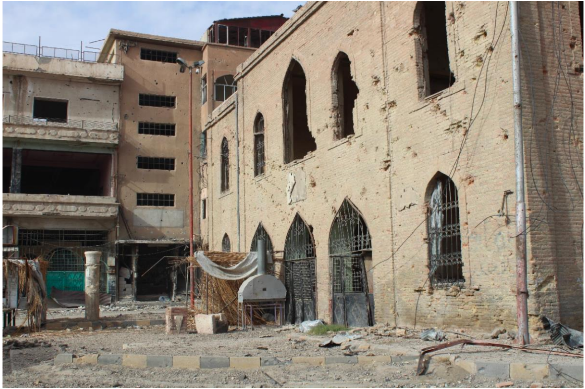
The main façade of the museum (ATPA; December 15, 2017)