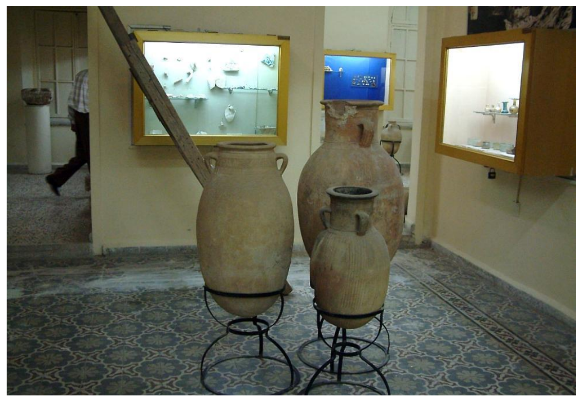
The exhibits in Room 10 before the conflict, seen from the west