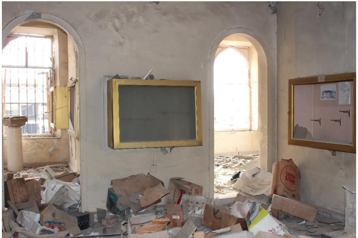
Room 10, seen from the west (ATPA; December 11, 2017)