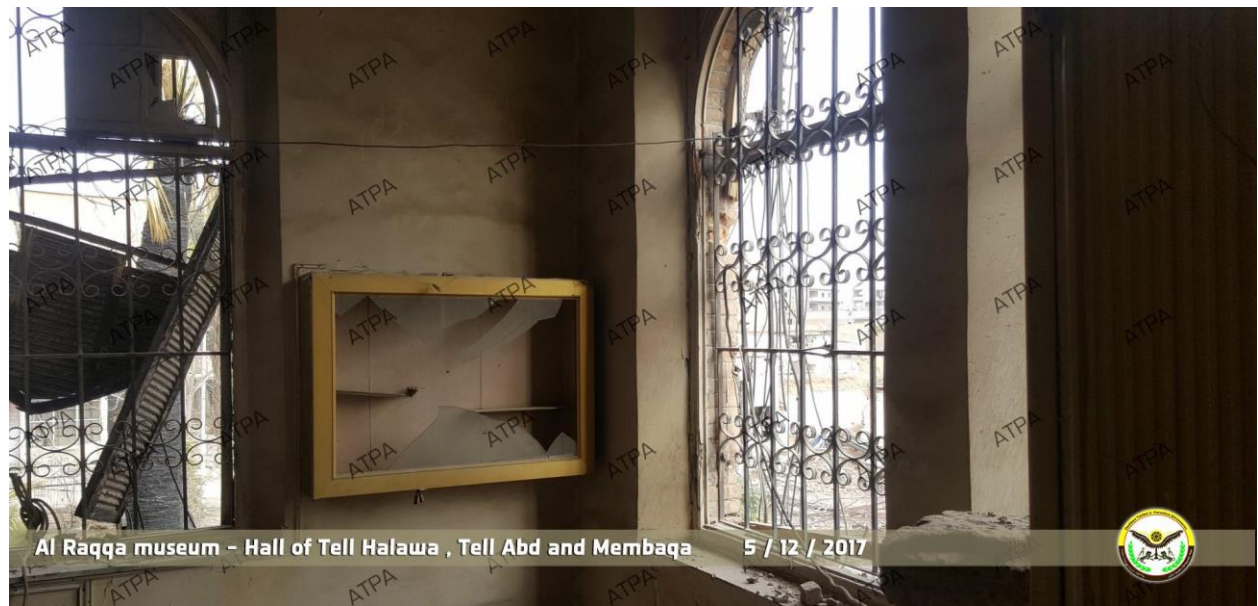
Room 12, seen from the south (ATPA; December 11, 2017)