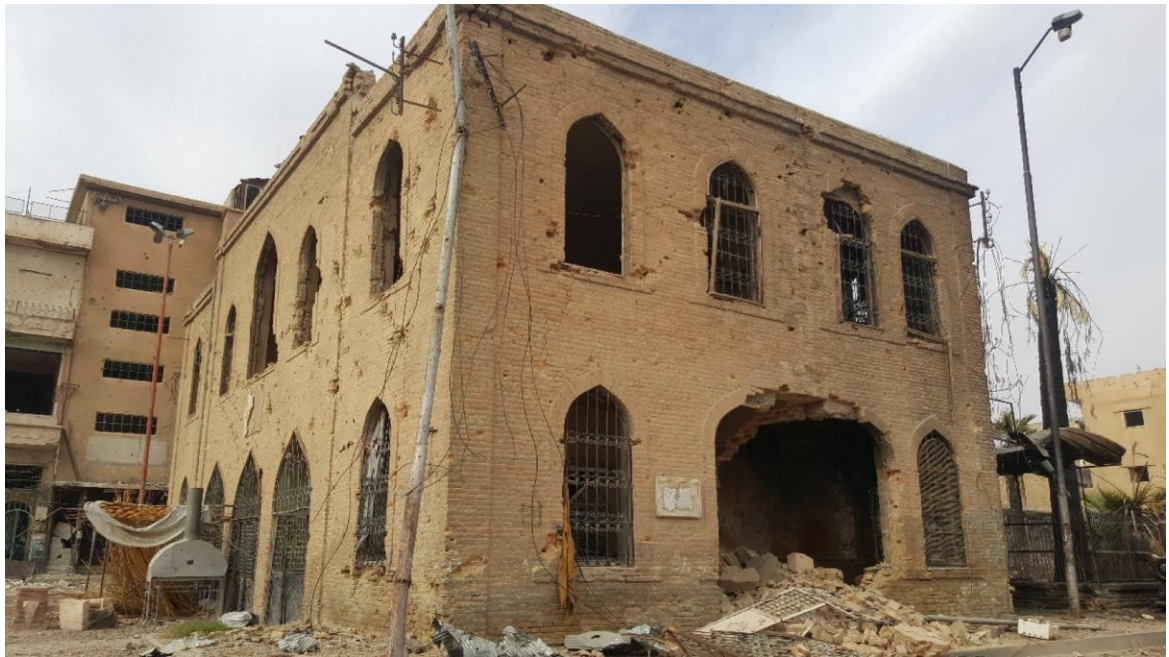
Exterior of Raqqa Museum, seen from the southeast (ATPA; December 15, 2017)