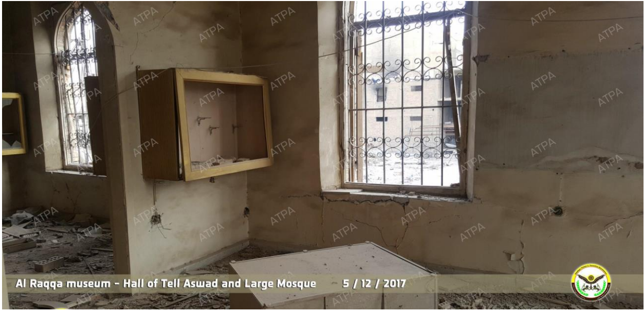
Room 11, seen from the southwest (ATPA; December 11, 2017)