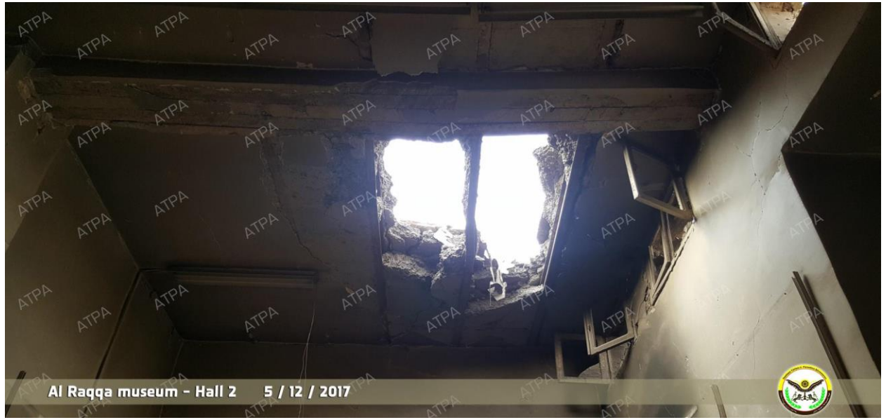
Damage to the roof in Room 10, seen from the east (ATPA; December 11, 2017)