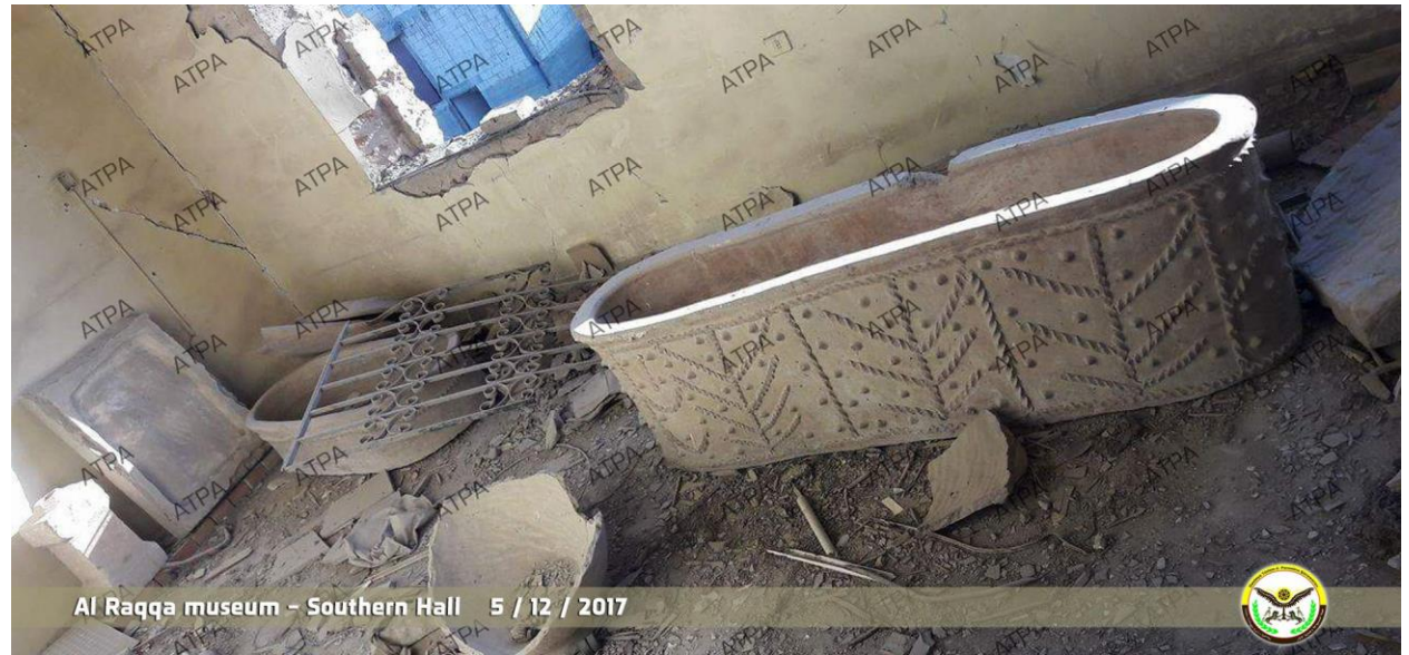
Room 9, seen from the northwest. The coffin decorated with a vegetal motif was exhibited in Room 1 prior to the conflict (ATPA; December 11, 2017)