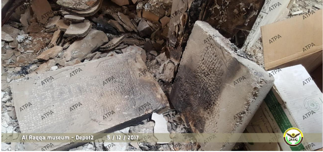
Room 14, seen from the south (ATPA; December 11, 2017)