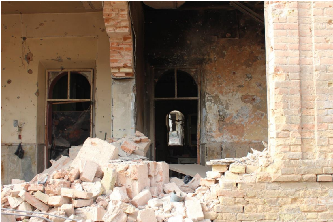
Detail of the damage to the southeast wall of the Raqqa Museum (ATPA; December 15, 2017)