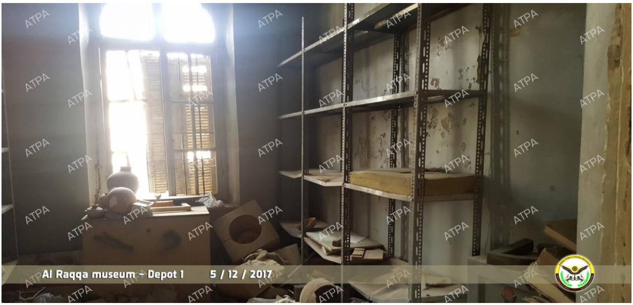
Room 13, seen from the south (ATPA; December 11, 2017)