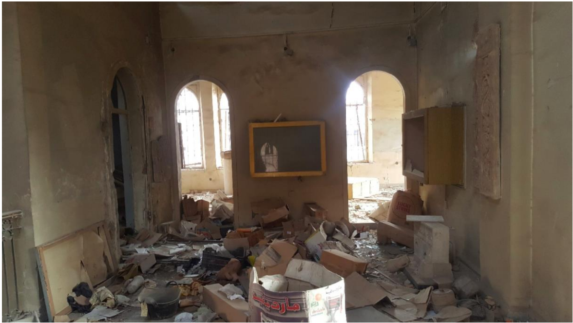
The main showroom of Raqqa Museum (ATPA; December 15, 2017)