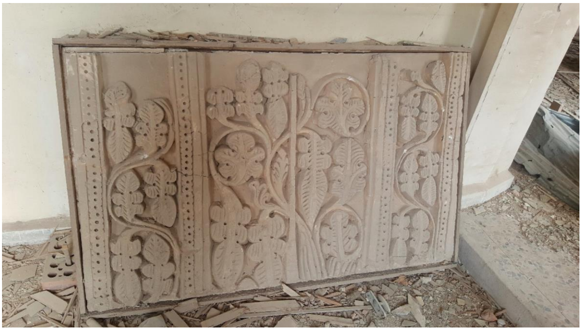
Neglected artifact from the Khrap Sayyar Archaeological Site seen inside the museum (ATPA; December 15, 2017)