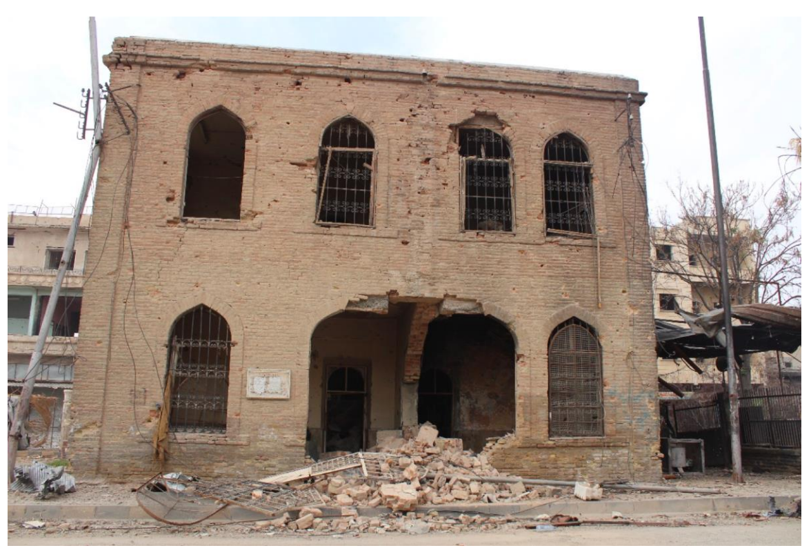
Exterior of Raqqa Museum, seen from the southeast (ATPA; December 15, 2017)