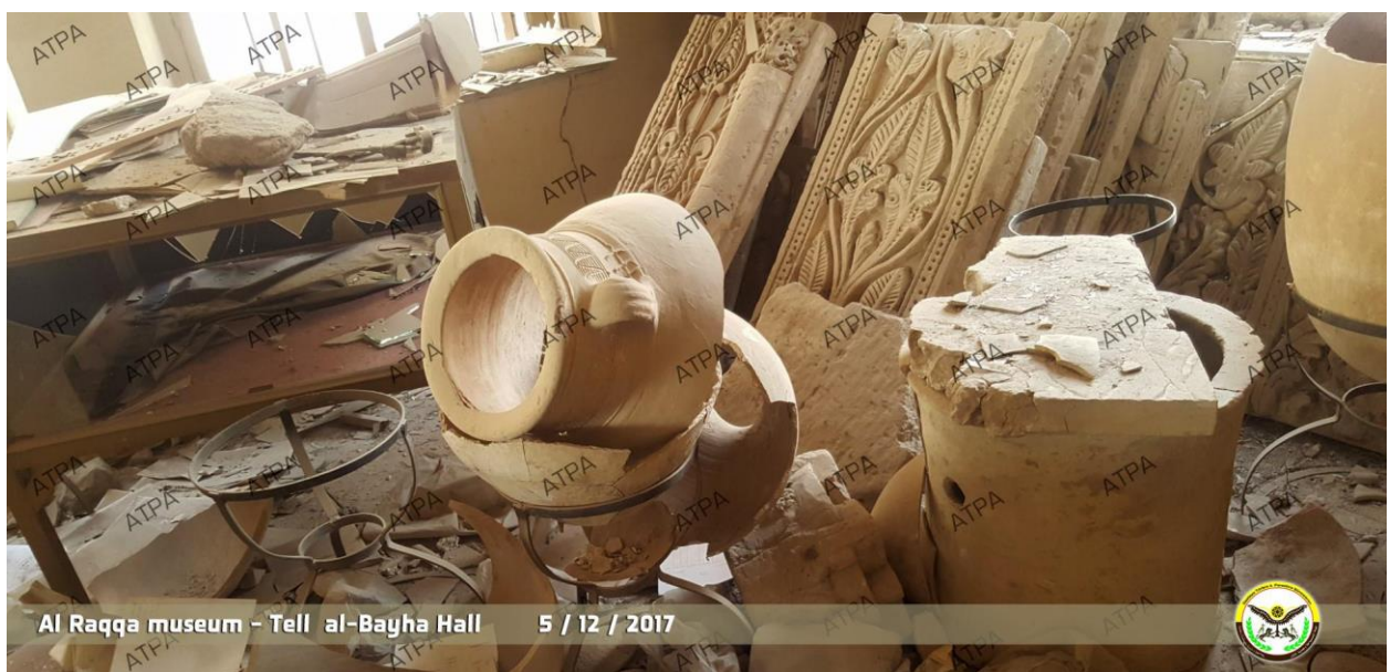
Room 15, seen from the southeast (ATPA; December 11, 2017)