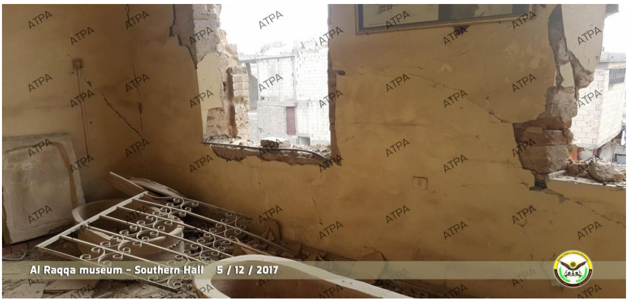
Room 9, seen from the northwest (ATPA; December 11, 2017)

Room 9, seen from the west (ATPA; December 11, 2017)