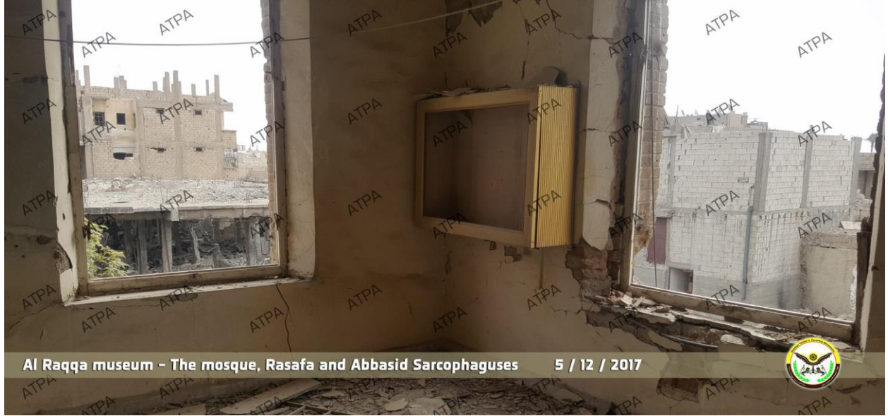
Room 11, seen from the northwest (ATPA; December 11, 2017)