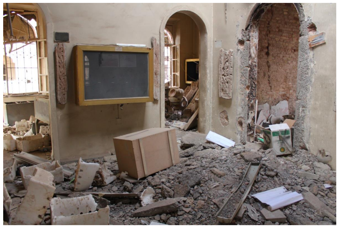
Damages inside the Raqqa Museum (December 15, 2017)