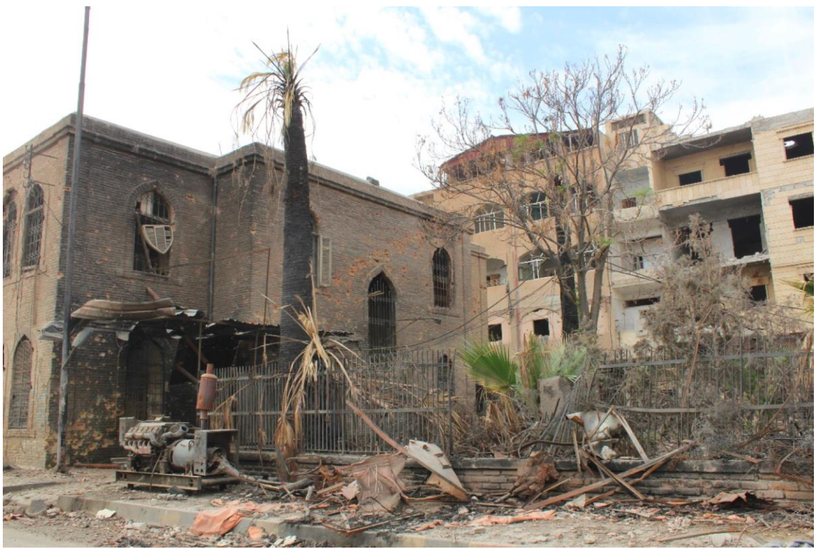
Exterior of the Raqqa Museum and garden, seen from the north (ATPA; December 15, 2017)