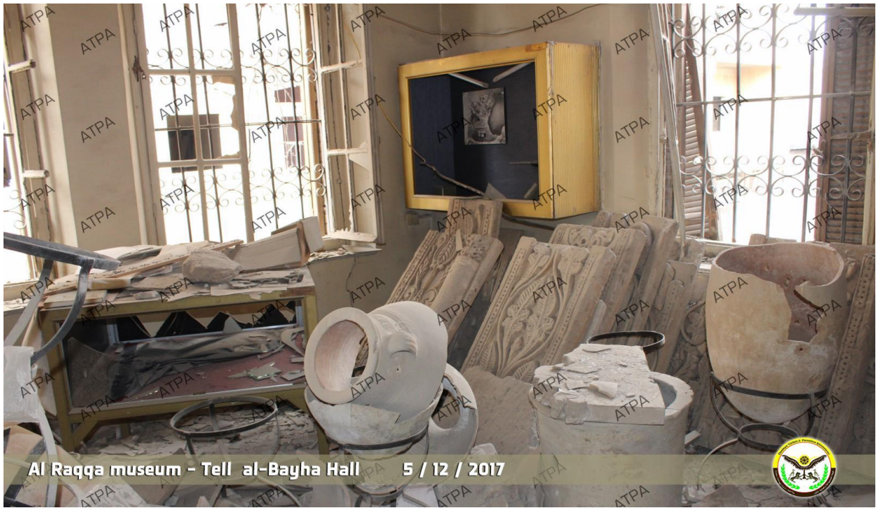
Room 15, seen from the southeast (ATPA; December 11, 2017)