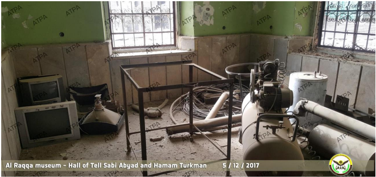
Room 8, seen from the north (ATPA; December 11, 2017)