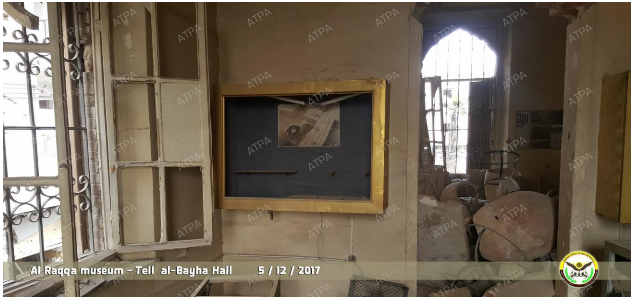
Room 16, seen from the south (ATPA; December 11, 2017)