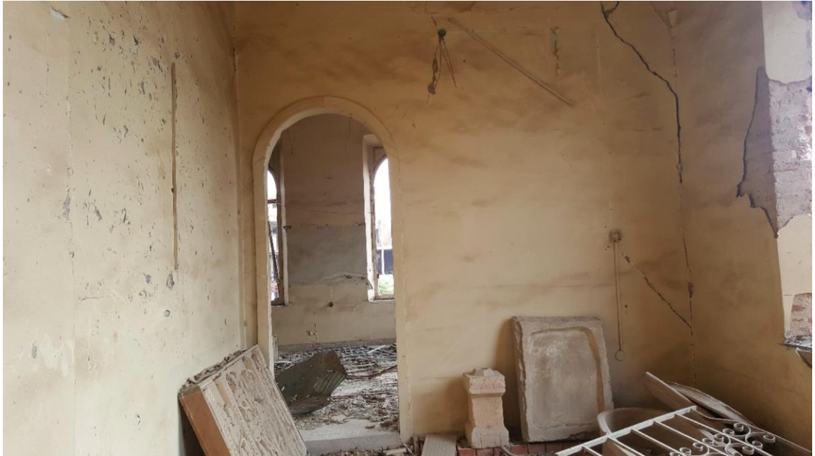
Showroom on the first floor of the Raqqa Museum (ATPA; December 15, 2017)