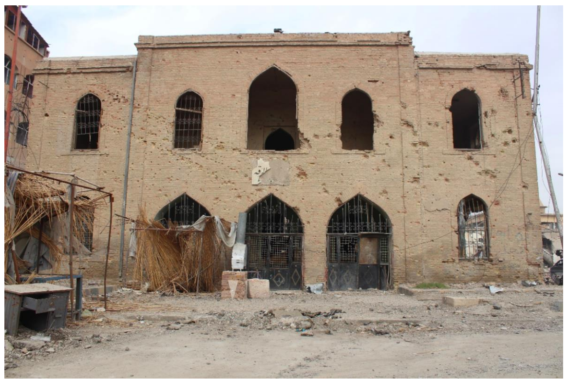
The main façade of the museum (ATPA; December 15, 2017)