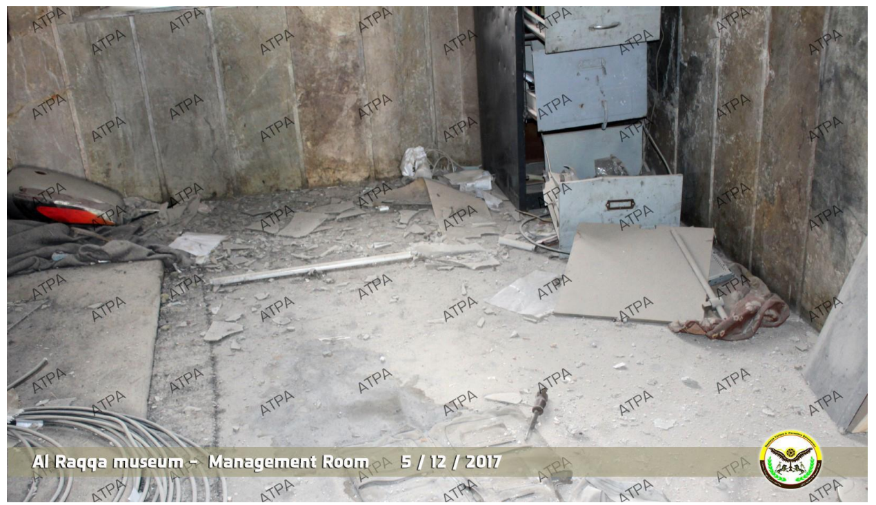
Room 6, seen from the south (ATPA; December 11, 2017)