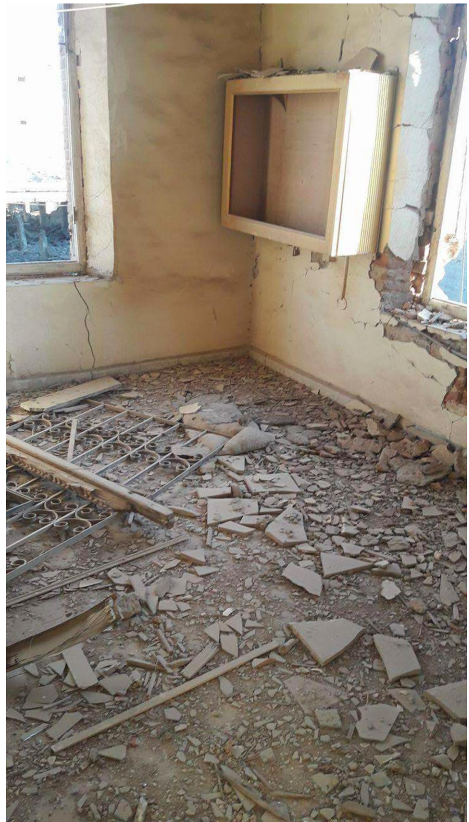
Damage to the interior of the Raqqa Museum (ATPA; December 15, 2017)