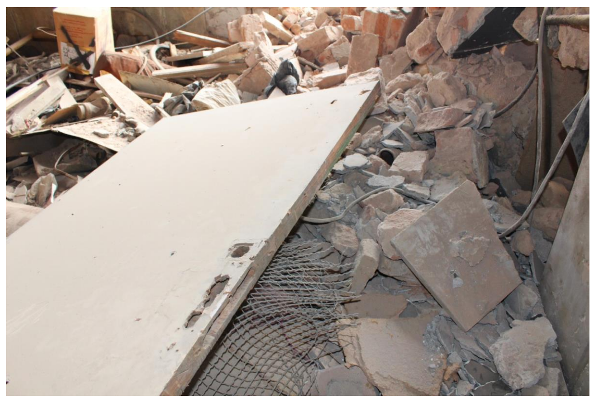
Damage to the interior of the Raqqa Museum (ATPA; December 15, 2017)