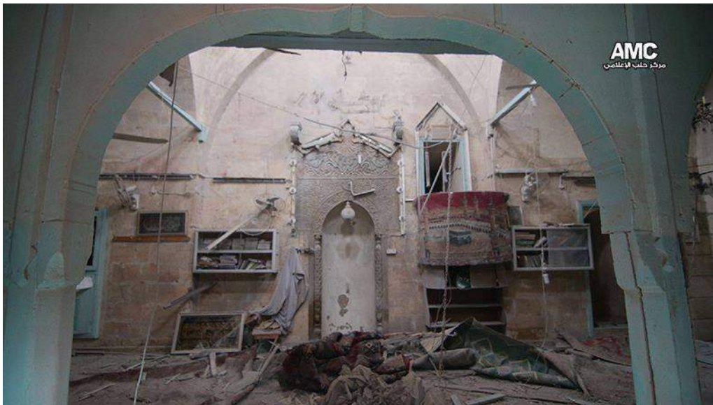
Damage to the interior of the Agha Jaq Mosque (January 12, 2016)