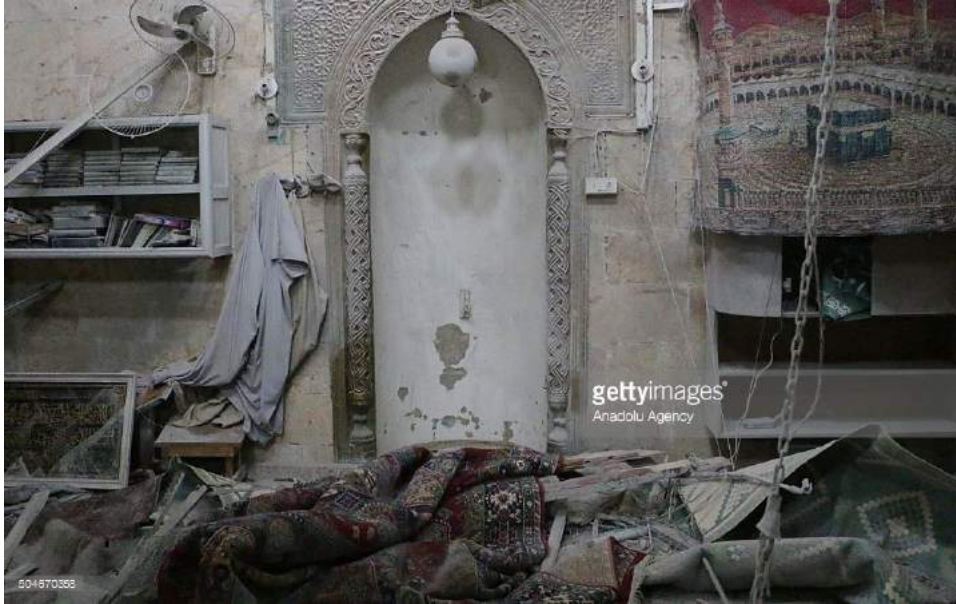
Damage to the Agha Jaq Mosque (January 12, 2016)