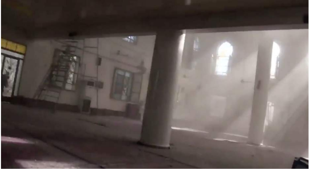
Screenshot from video taken by Sakir Khadir showing damage and debris in the interior of the mosque in the aftermath of the airstrike (Sakir Khadir Twitter; January 15, 2016)