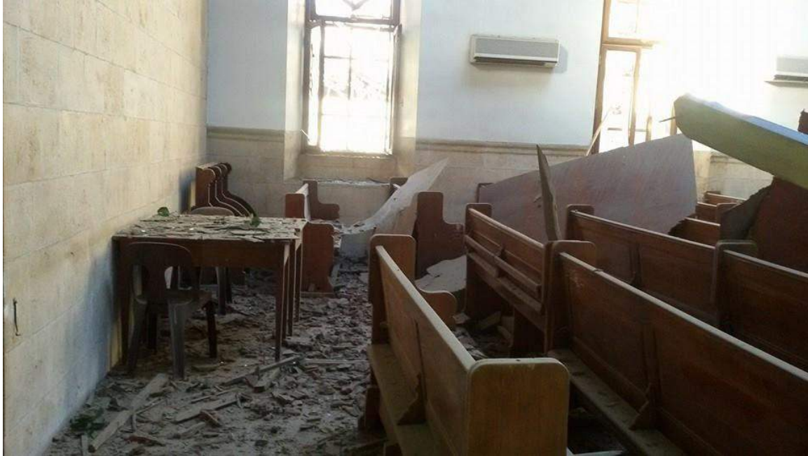
Destruction and debris in church interior (First Armenian Evangelical Church of Emmanuel; January 17, 2016)