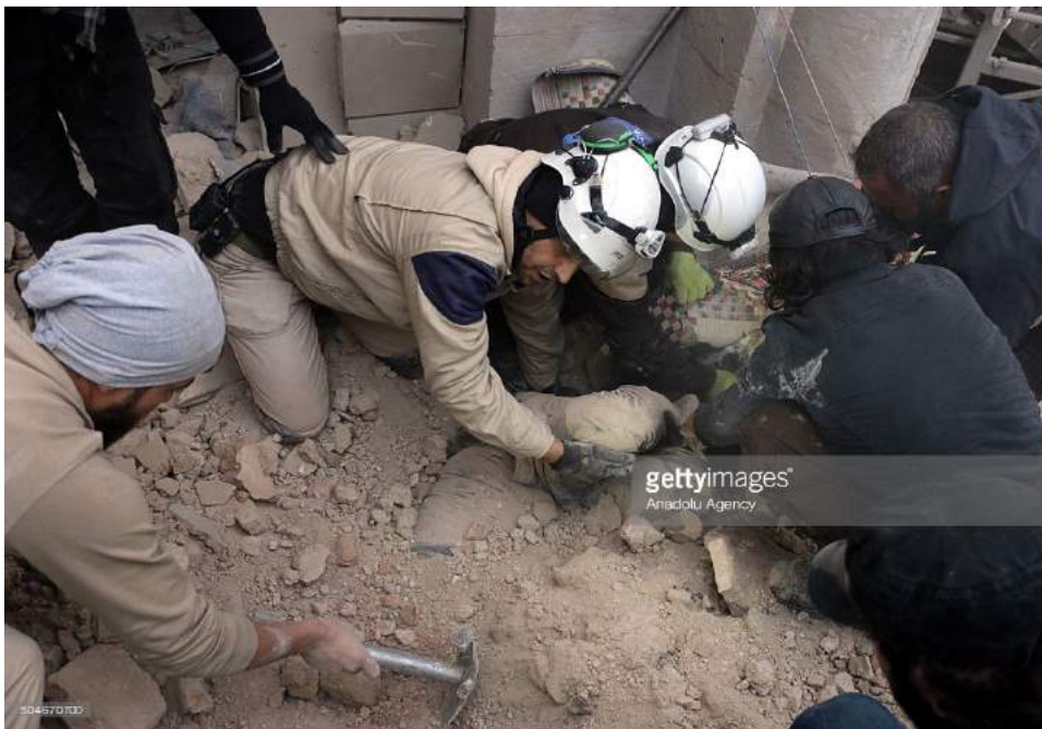
Damage to the Agha Jaq Mosque with Syrian Civil Defense workers searching the rubble (January 12, 2016)