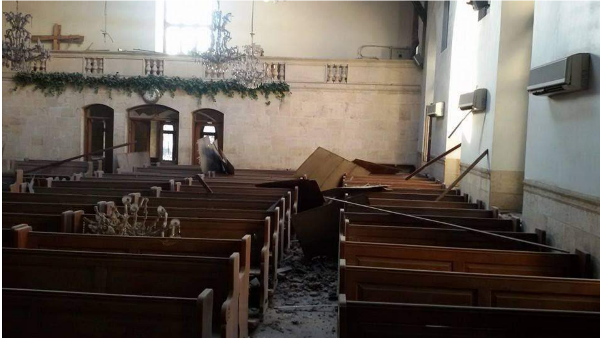
Destruction and debris in church interior (First Armenian Evangelical Church of Emmanuel; January 17, 2016)