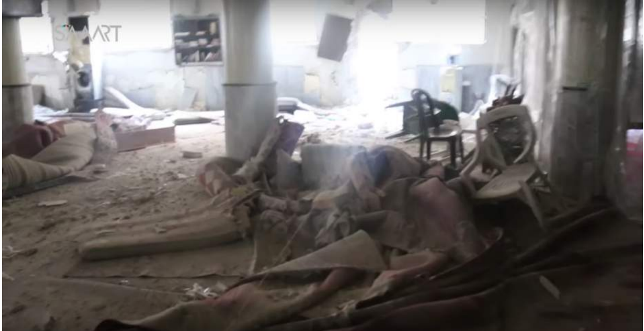
Screenshot from YouTube video showing damage to interior of mosque and large hole in wall (SMART News Agency; January 15, 2016)