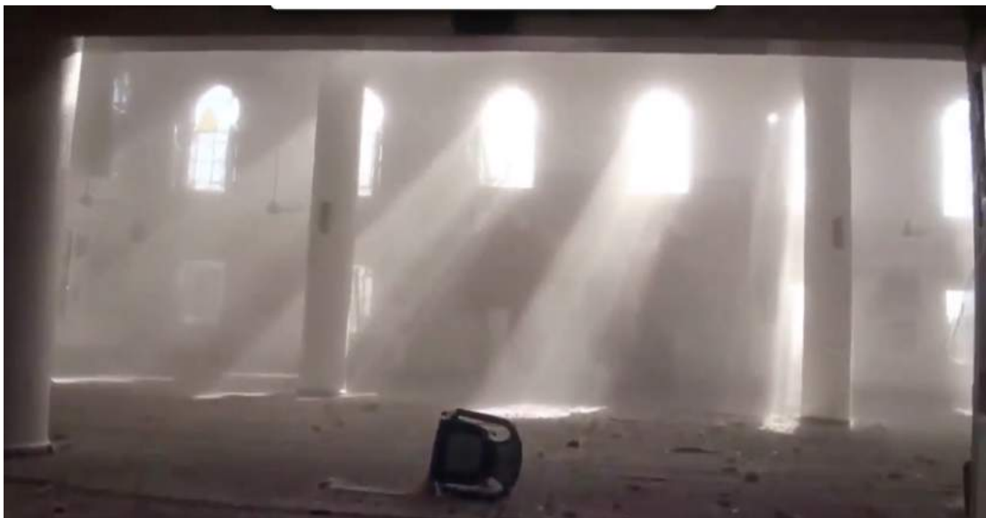
Screenshot from video taken by Sakir Khadir showing damage and debris in the interior of the mosque in the aftermath of the airstrike (Sakir Khadir Twitter; January 15, 2016)