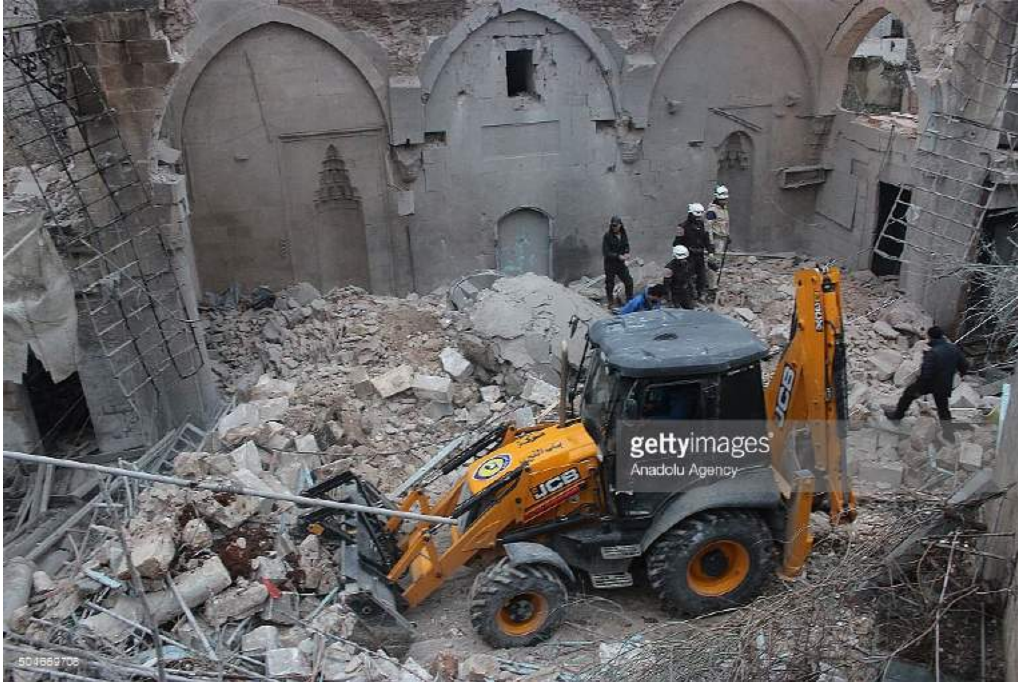
Damage to the Agha Jaq Mosque with Syrian Civil Defense workers searching the rubble (January 12, 2016)