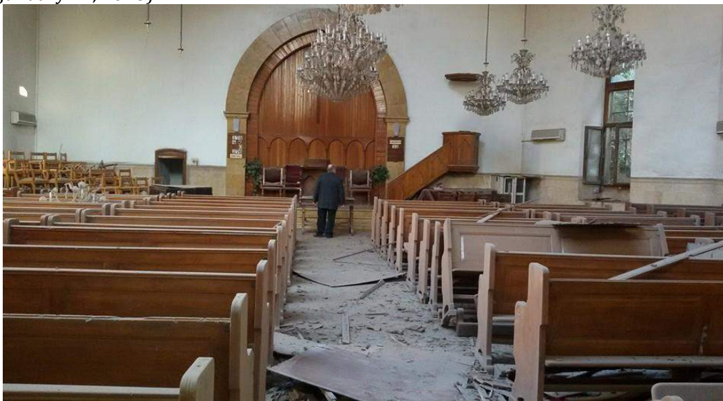
Destruction and debris in church interior (First Armenian Evangelical Church of Emmanuel; January 17, 2016)