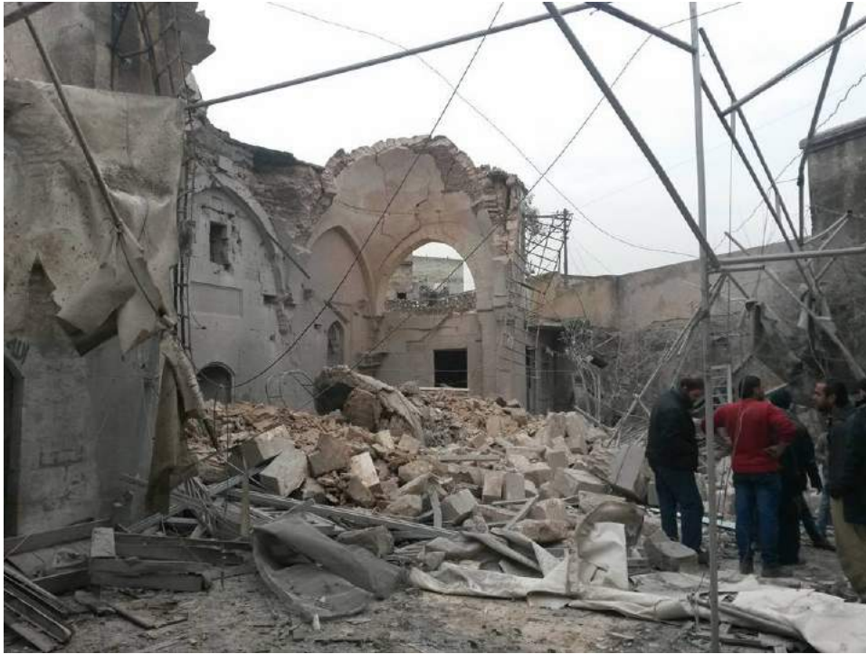
Damage to the Agha Jaq Mosque (posted by APSA; January 12, 2016)