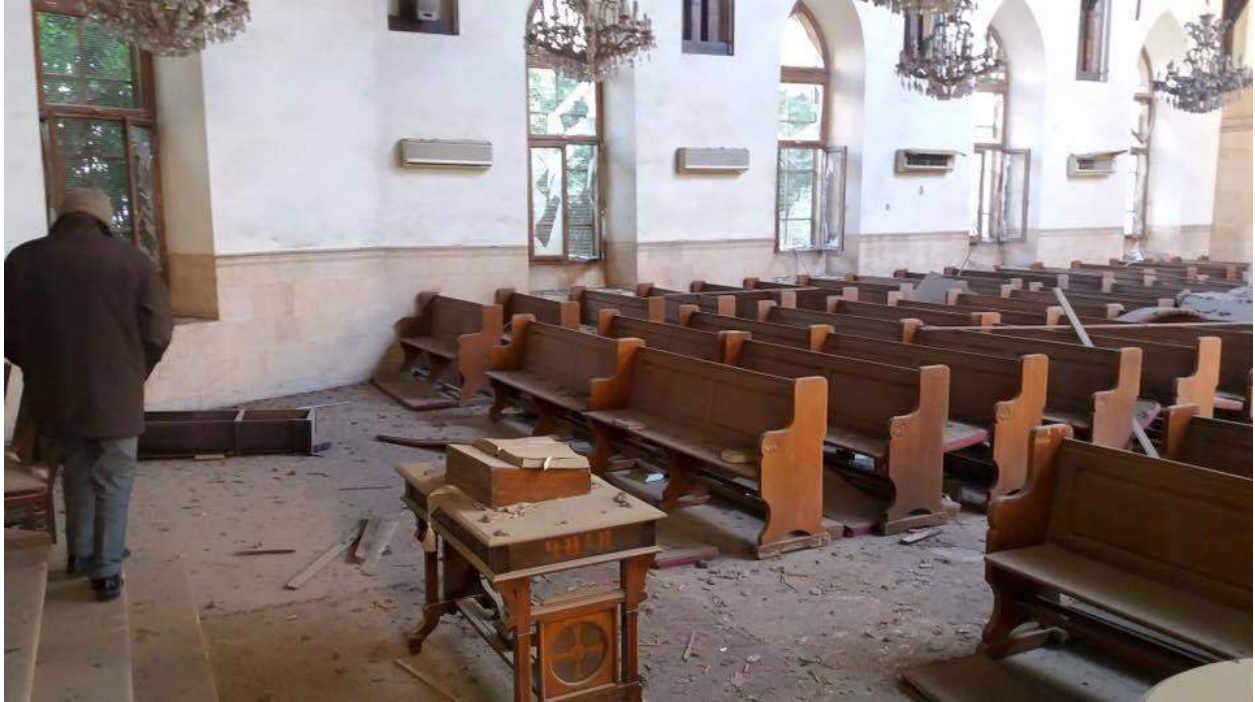
Destruction and debris in church interior (Kantsasar; January 17, 2016)