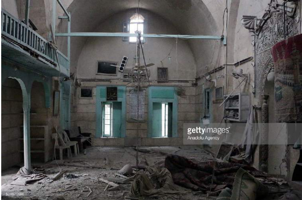
Damage to the interior of the Agha Jaq Mosque (January 12, 2016)