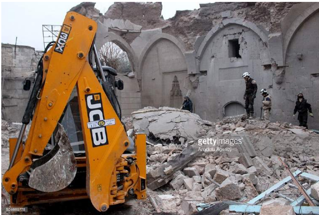
Damage to the Agha Jaq Mosque with Syrian Civil Defense workers searching the rubble (Getty Images; January 12, 2016)