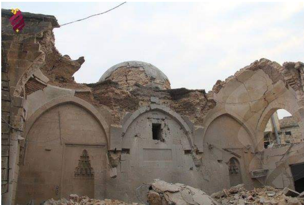
Damage to the Agha Jaq Mosque (reposted by APSA; January 12, 2016)