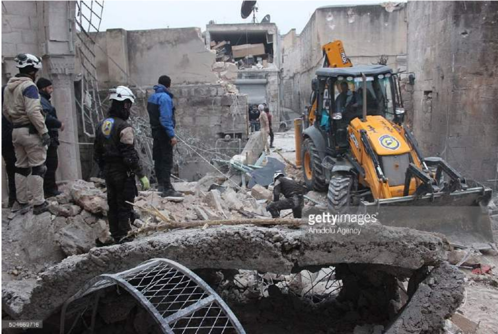
Damage to the Agha Jaq Mosque with Syrian Civil Defense workers searching the rubble (January 12, 2016)