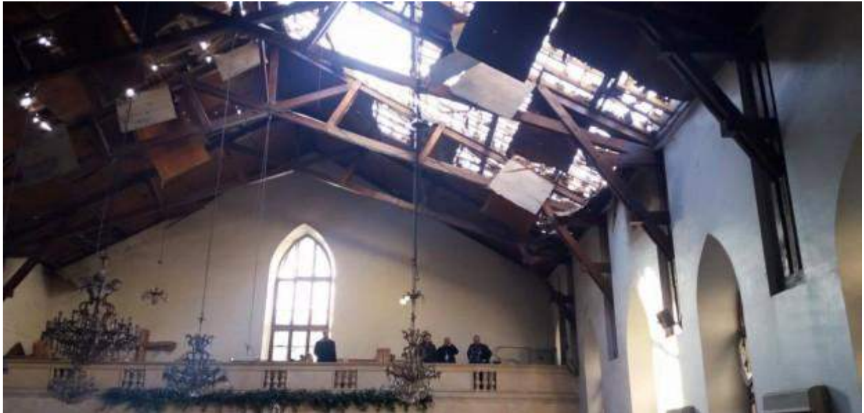
Damage to church roof (Kantsasar; January 17, 2016)