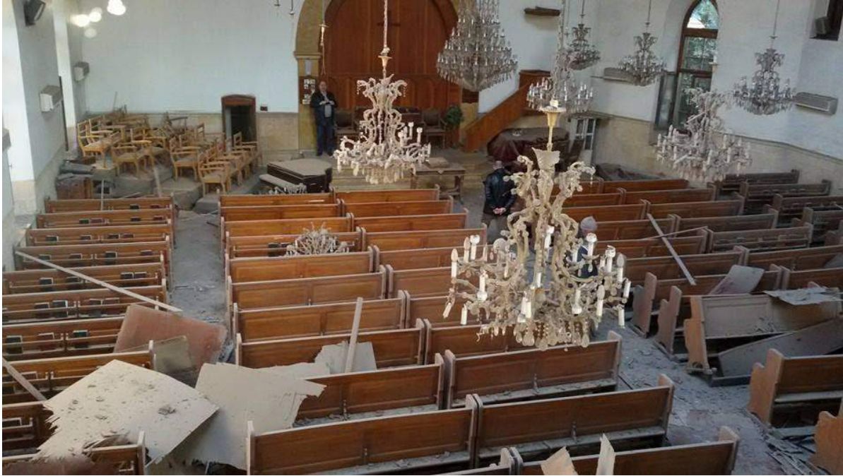
Destruction and debris in church interior (First Armenian Evangelical Church of Emmanuel; January 17, 2016)