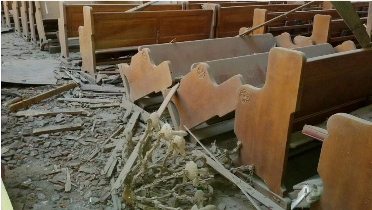
Destruction and debris in church interior (First Armenian Evangelical Church of Emmanuel; January 17, 2016)