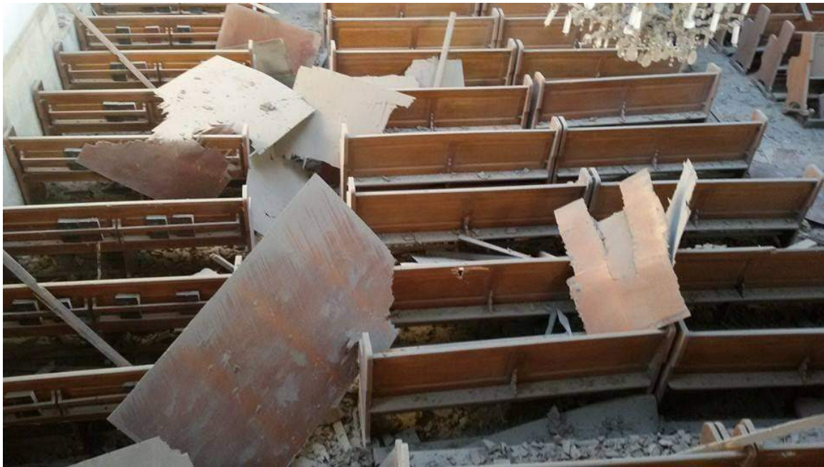
Destruction and debris in church interior (First Armenian Evangelical Church of Emmanuel; January 17, 2016)