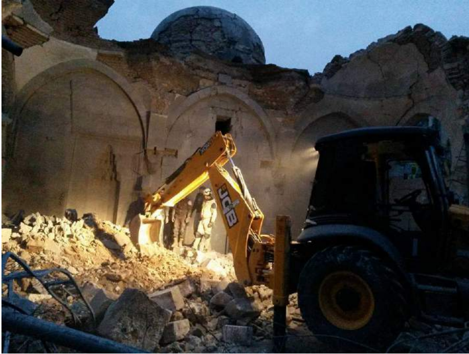
Damage to the Agha Jaq Mosque with Syrian Civil Defense workers searching the rubble (reposted by APSA; January 12, 2016)