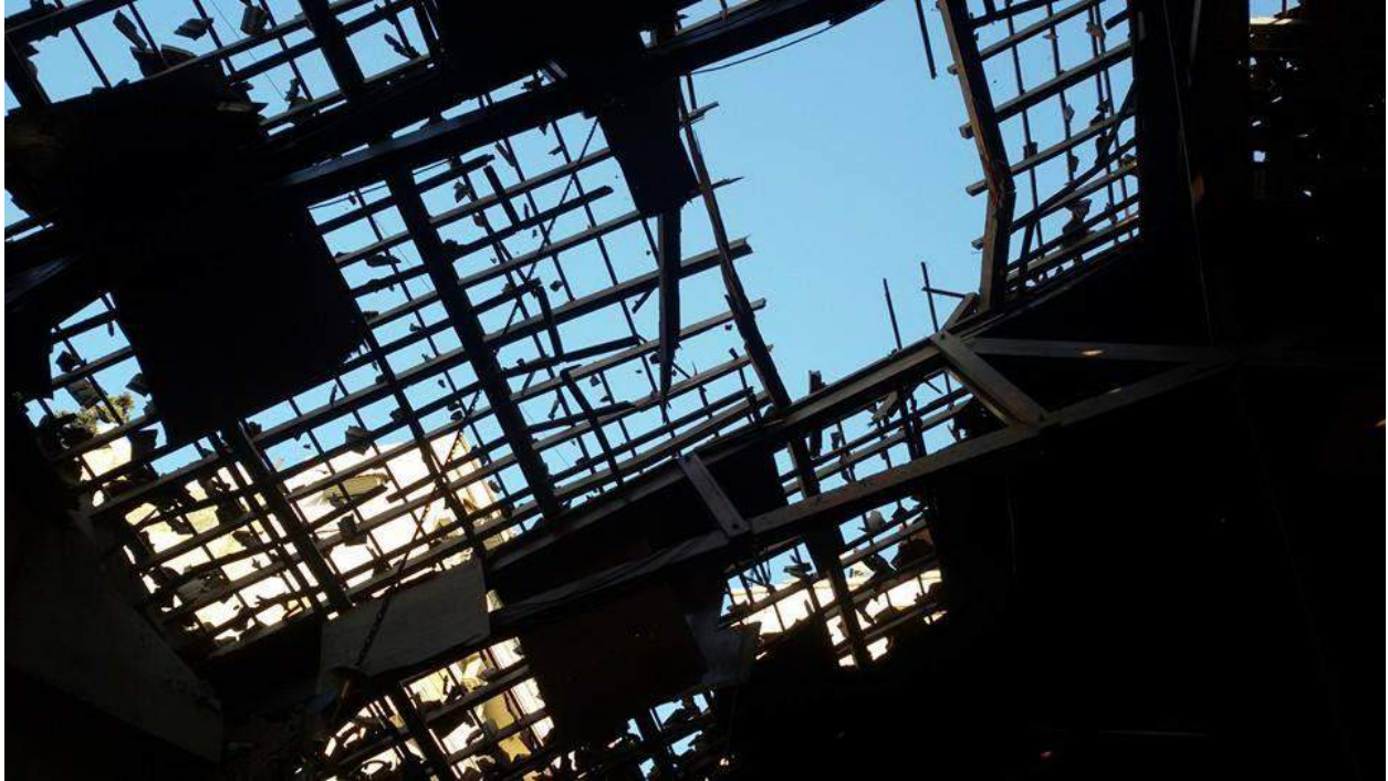
Damage to roof of church (First Armenian Evangelical Church of Emmanuel; January 17, 2016)