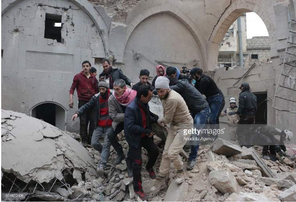
Damage to the Agha Jaq Mosque with Syrian Civil Defense workers searching the rubble (Getty Images; January 12, 2016)