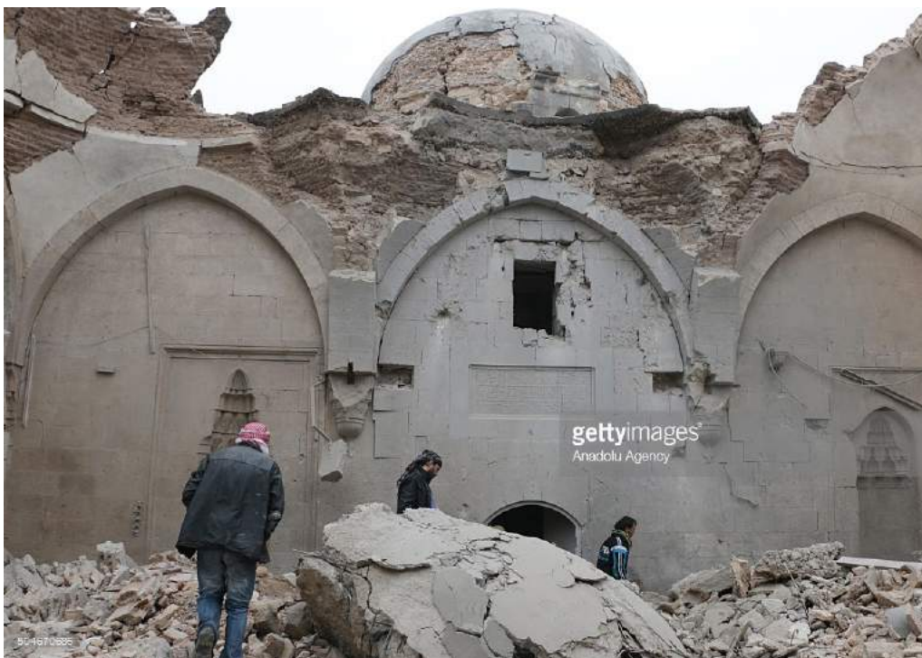
Damage to the Agha Jaq Mosque (January 12, 2016)