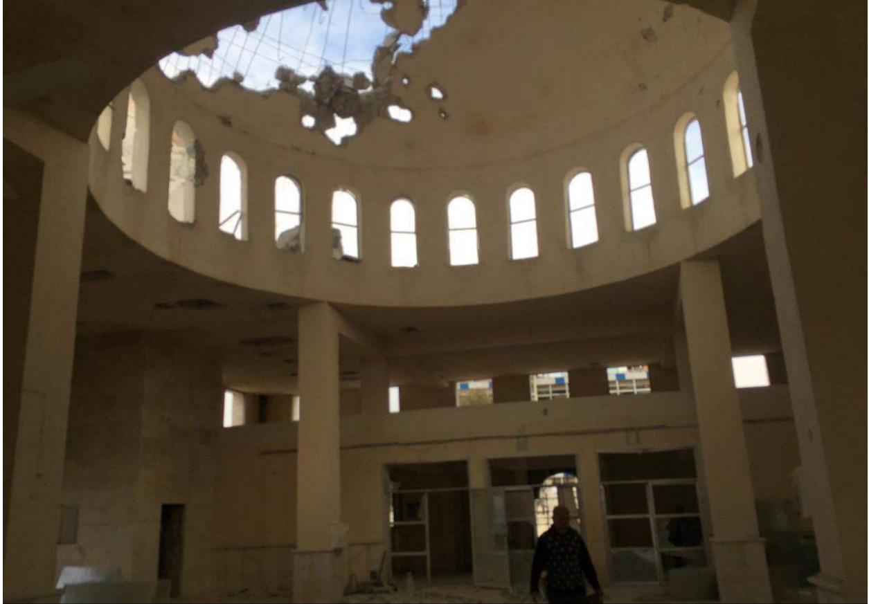
Image shows destruction in Al Hadi Mosque ceiling in Babeis town in Aleppo governorate due to suspected Russian warplanes missiles, January 11, 2016. © SNHR

Destruction to Al Hadi Mosque (SNHR; January 11, 2016)