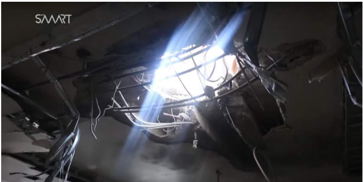
Screenshot from YouTube video showing large hole in mosque roof (SMART News Agency; January 15, 2016)