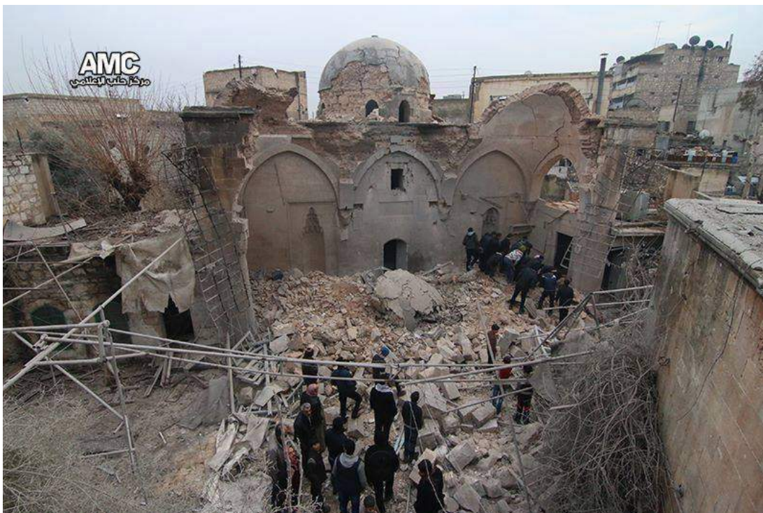
Damage to the Agha Jaq Mosque (Aleppo Media Center; January 12, 2016)

Getty Images: http://www.gettyimages.com/galleries/search?phrase=acu+mosque&family=editorial&sort=