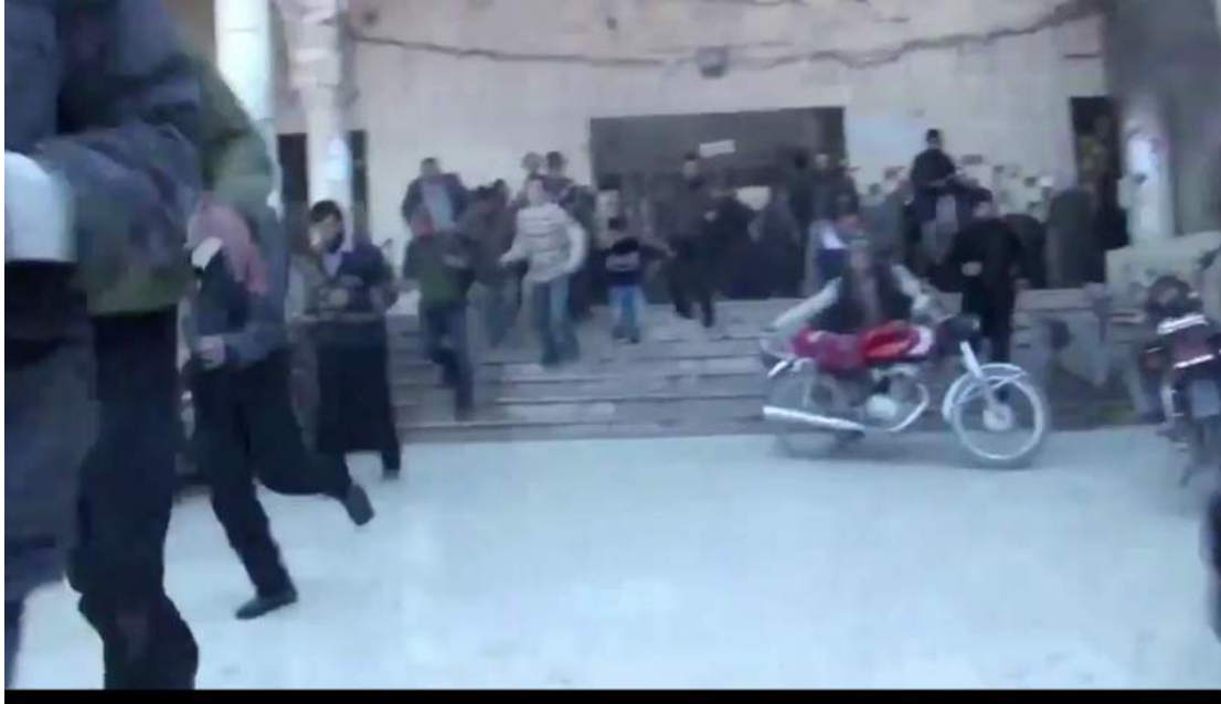
Screenshot from video taken by Sakir Khadir showing dozens fleeing mosque in the aftermath of the airstrike (Sakir Khadir Twitter; January 15, 2016)