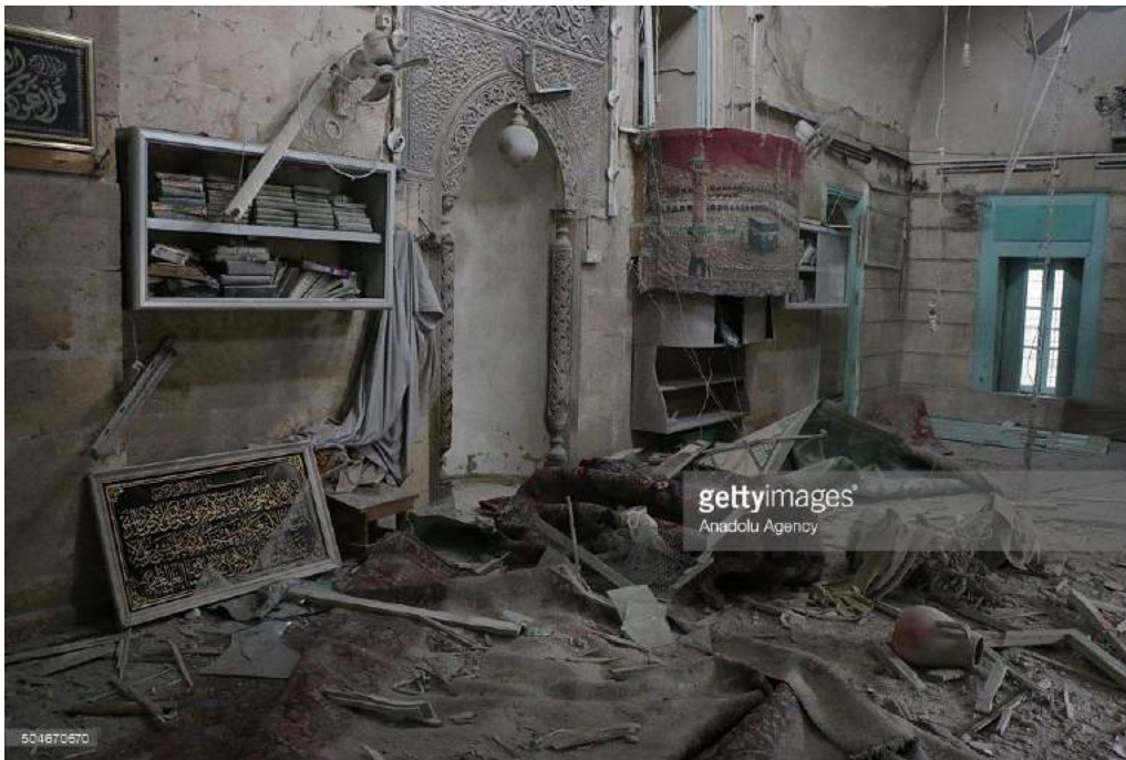
Damage to the Agha Jaq Mosque (January 12, 2016)