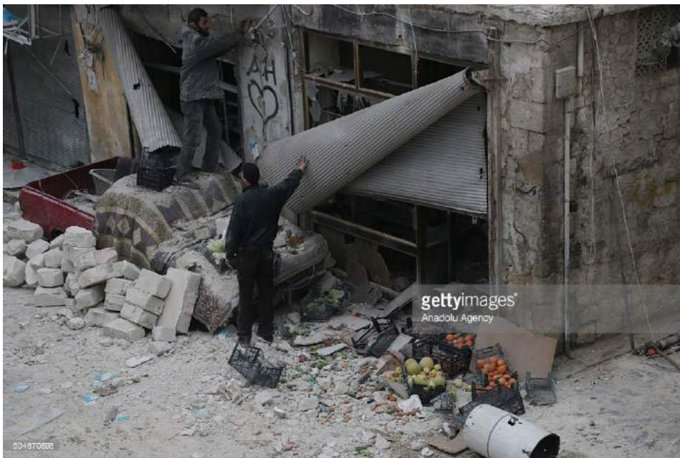
Damage to the surrounding area near the Agha Jaq Mosque (January 12, 2016)