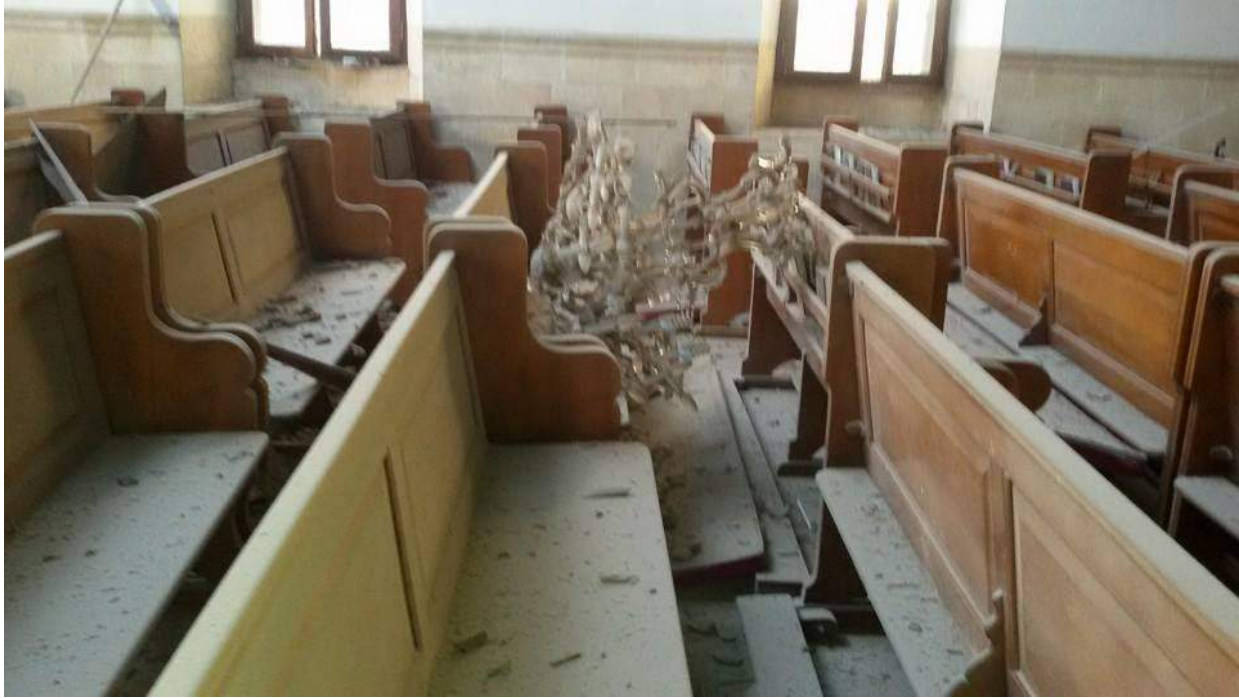
Destruction and debris in church interior (First Armenian Evangelical Church of Emmanuel; January 17, 2016)