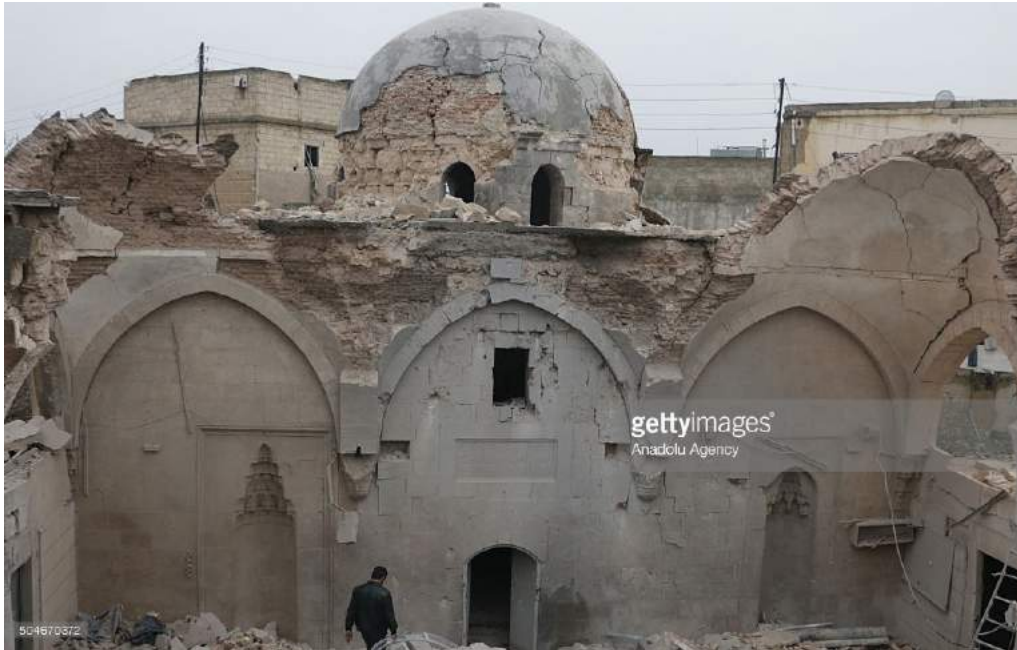
Damage to the Agha Jaq Mosque (January 12, 2016)