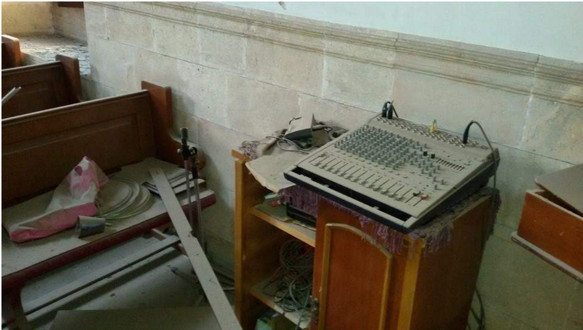
Destruction and debris in church interior (First Armenian Evangelical Church of Emmanuel; January 17, 2016)