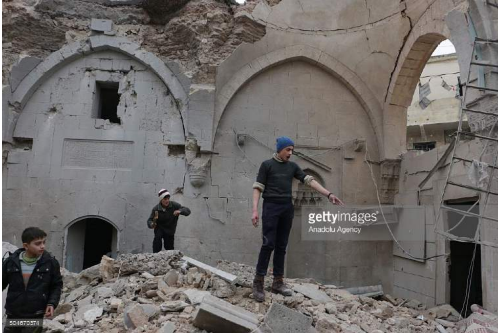
Damage to the Agha Jaq Mosque (January 12, 2016)