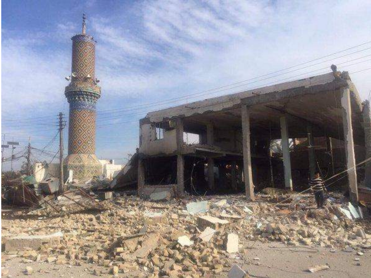
Destruction of Al Qadisiyah Mosque (Diyala Alkhair; January 13, 2016) 69

UN News Centre: http://www.un.org/apps/news/story.asp?NewsID=52984#.VpVZTJMrKYU