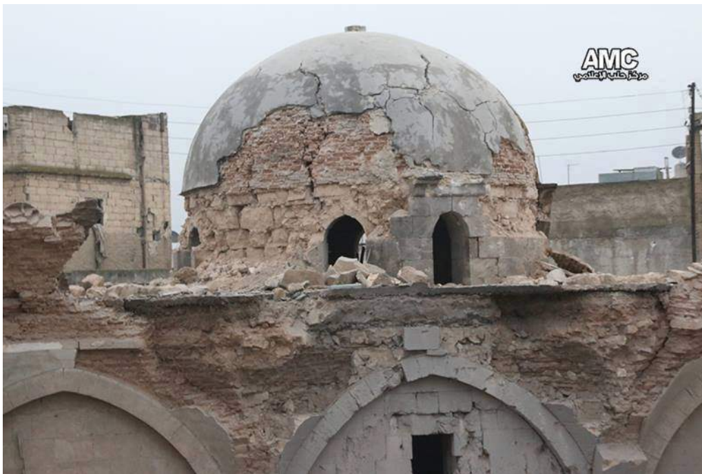
Damage to the Agha Jaq Mosque (Aleppo Media Center; January 12, 2016)