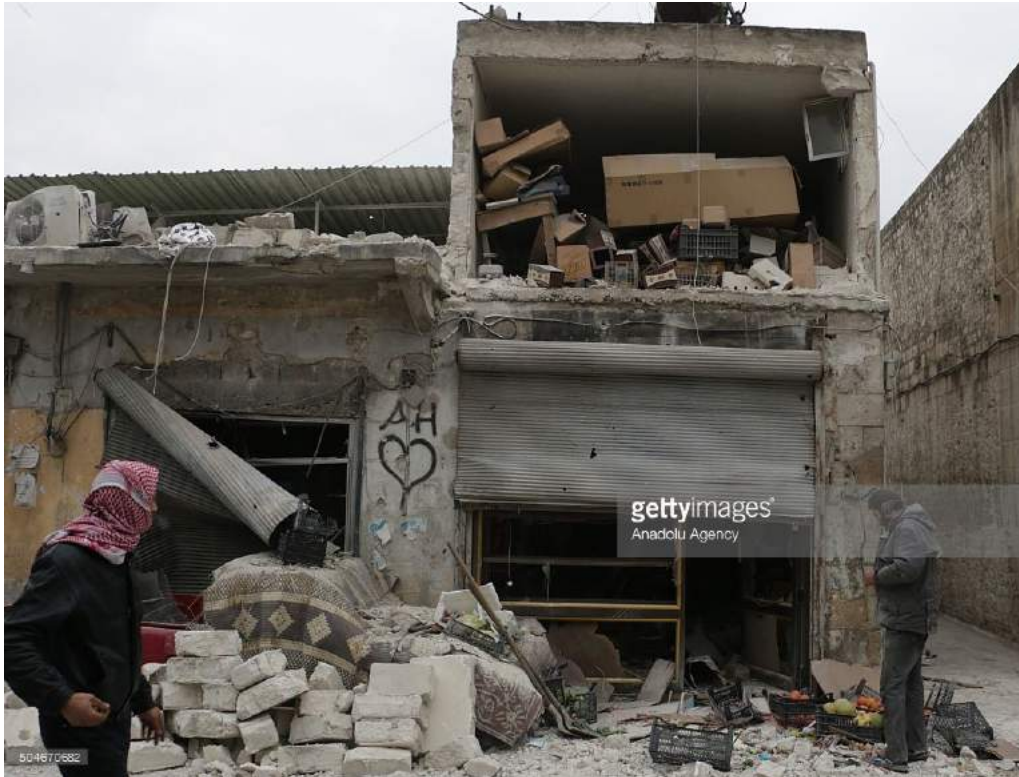
Damage to the surrounding area near the Agha Jaq Mosque (January 12, 2016)