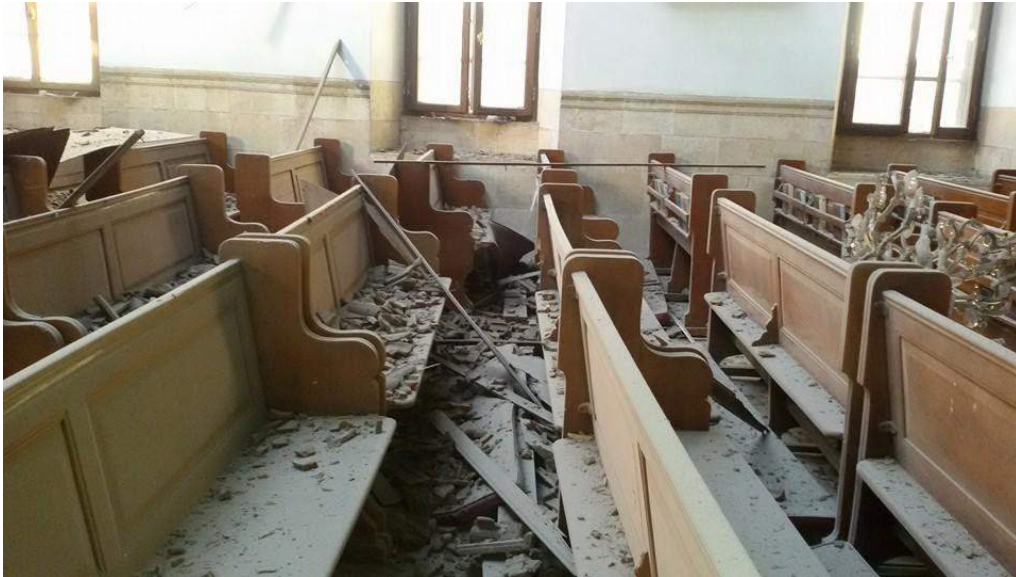
Destruction and debris in church interior (First Armenian Evangelical Church of Emmanuel; January 17, 2016)