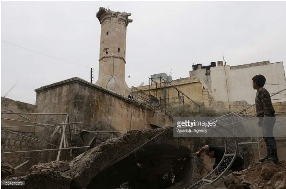
Damage to the Agha Jaq Mosque (January 12, 2016)