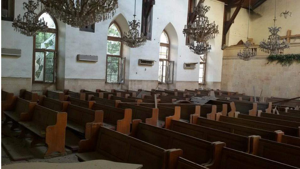
Destruction and debris in church interior (First Armenian Evangelical Church of Emmanuel; January 17, 2016)