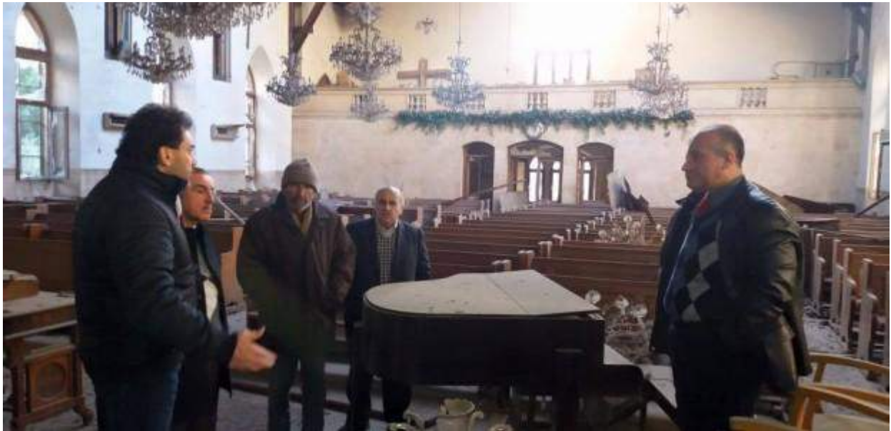
Destruction and debris in church interior (Kantsasar; January 17, 2016)

Kantsasar: https://www.facebook.com/kantsasar/posts/790381267730568