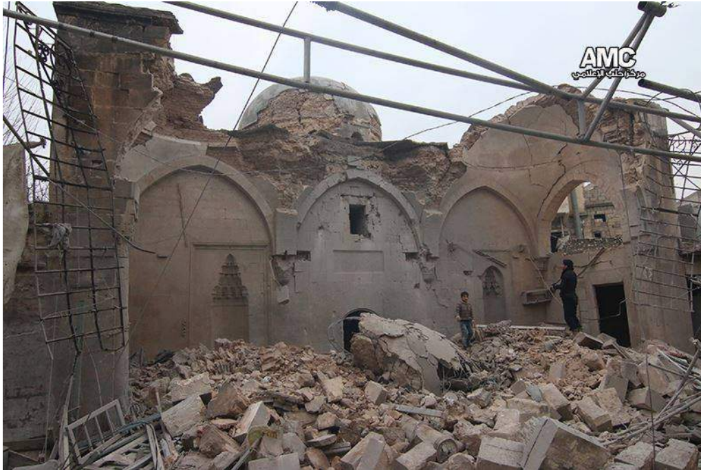
Damage to the Agha Jaq Mosque (Aleppo Media Center; January 12, 2016)