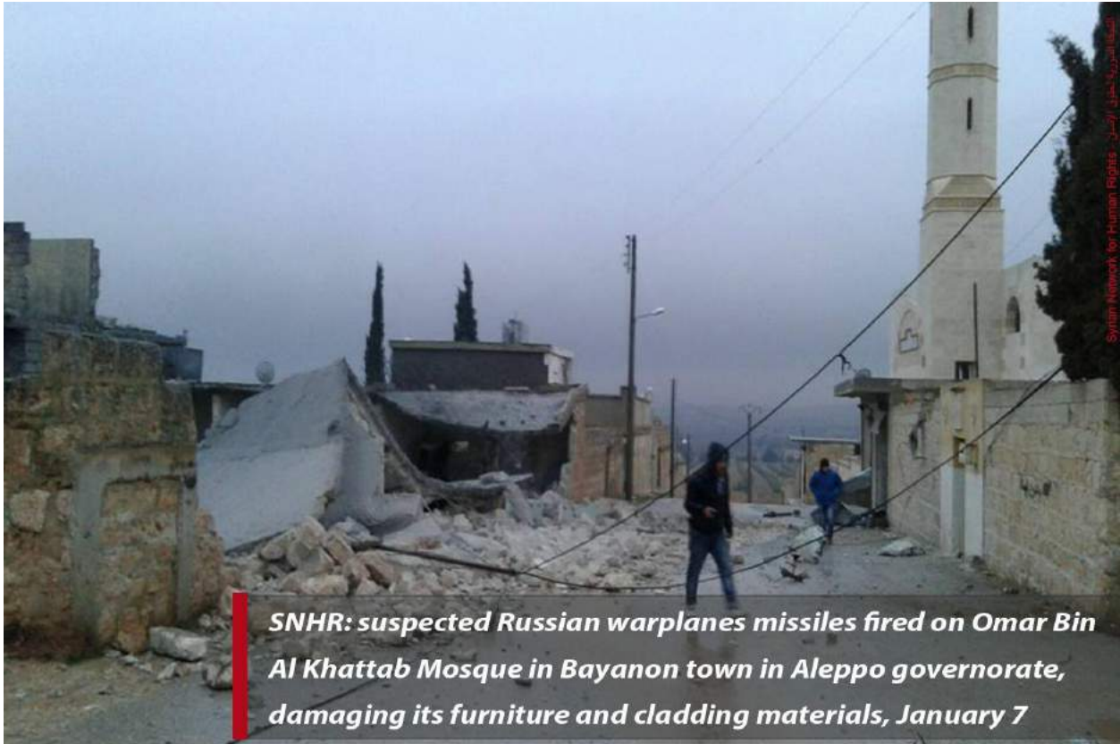
Damage from missile attacks outside Omar Bin Al Khattab Mosque (SNHR; January 7, 2015)