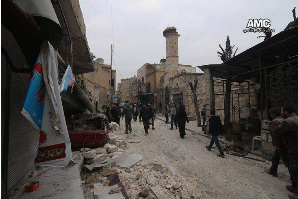
Damage to the surrounding area near the Agha Jaq Mosque (Aleppo Media Center; January 12, 2016)