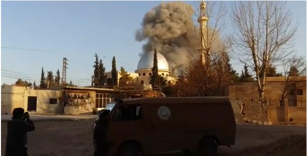
Screenshot from video posted on News.com.au showing aftermath of airstrike (News.com.au; January 16, 2016)

http://video.news.com.au/v/427454/SYRIA-Airstrike-Damages-Mosque-Near-Damascus-January-15