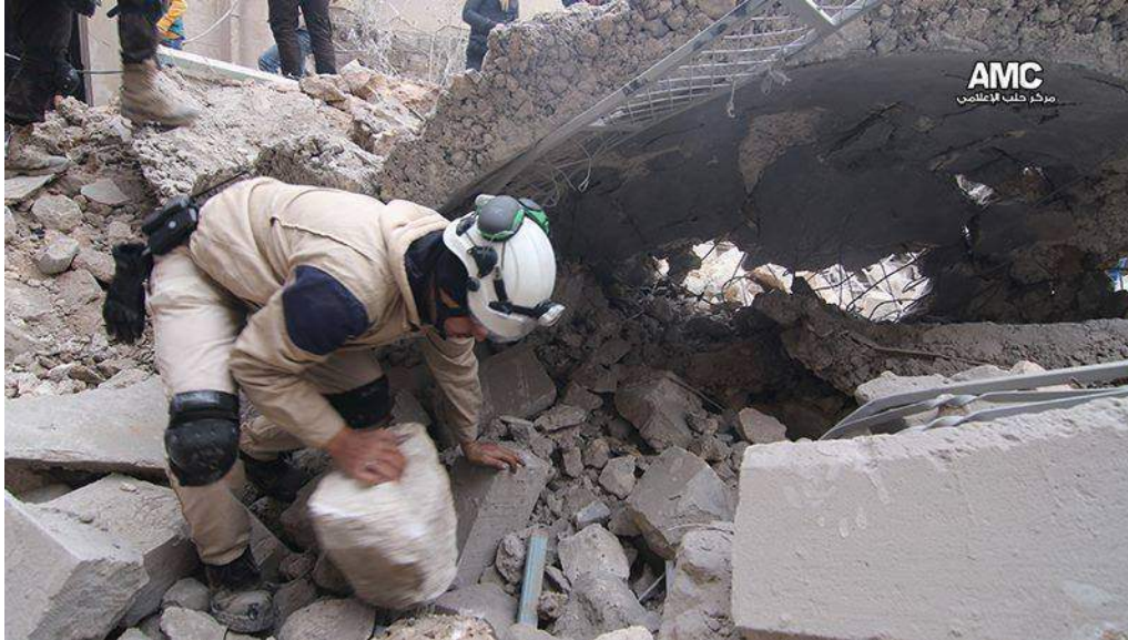
Damage to the Agha Jaq Mosque with Syrian Civil Defense workers searching the rubble (Aleppo Media Center; January 12, 2016)