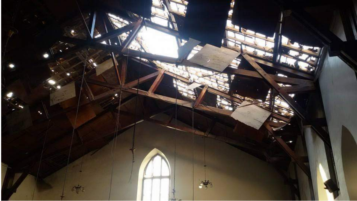
Damage to roof of church (First Armenian Evangelical Church of Emmanuel; January 17, 2016)