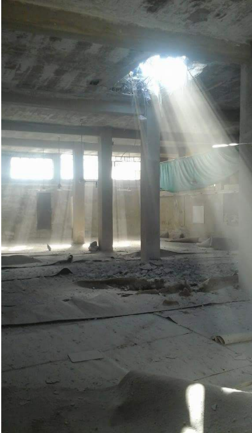
Interior damage in the al-Kabir Mosque in al-Maouzrah (SNHR; January 13, 2016)