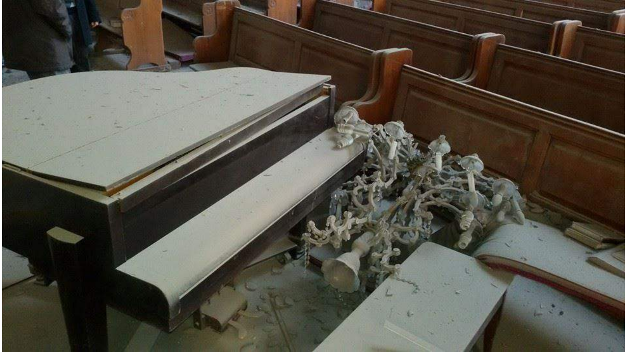
Destruction and debris in church interior (First Armenian Evangelical Church of Emmanuel; January 17, 2016)