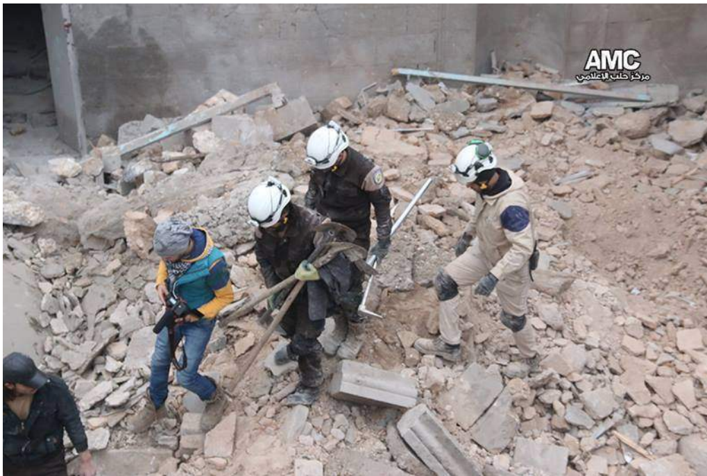
Damage to the Agha Jaq Mosque with Syrian Civil Defense workers searching the rubble (Aleppo Media Center; January 12, 2016)