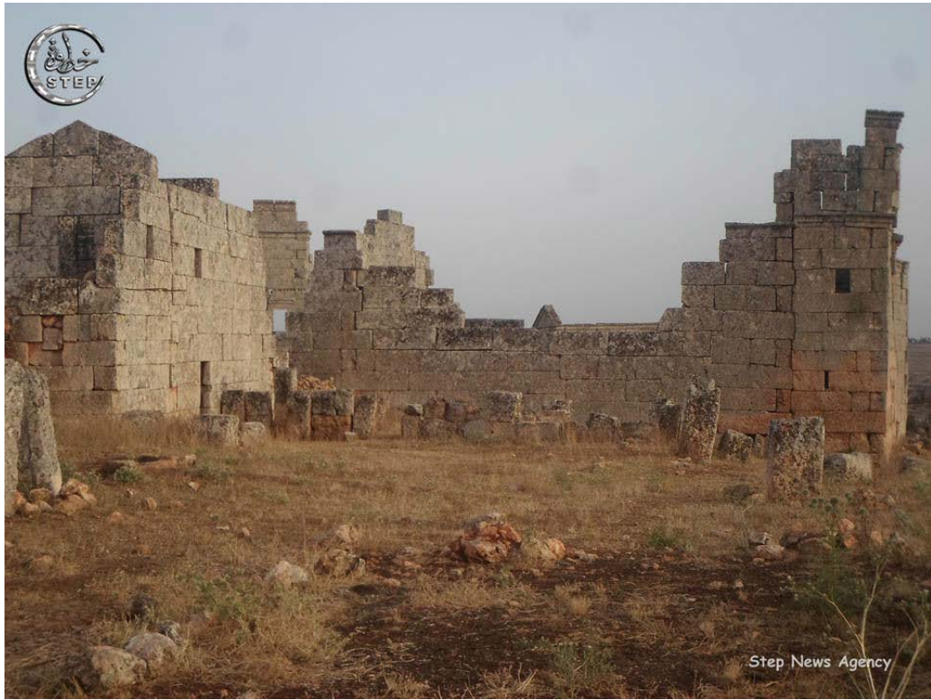
Serjilla (APSA; posted June 5, 2015)