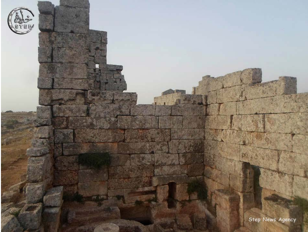
Serjilla (APSA; posted June 5, 2015)