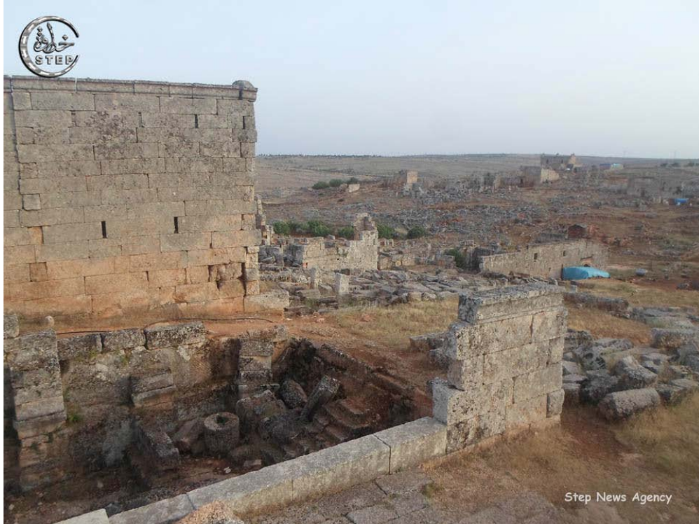
Serjilla (APSA; posted June 5, 2015)