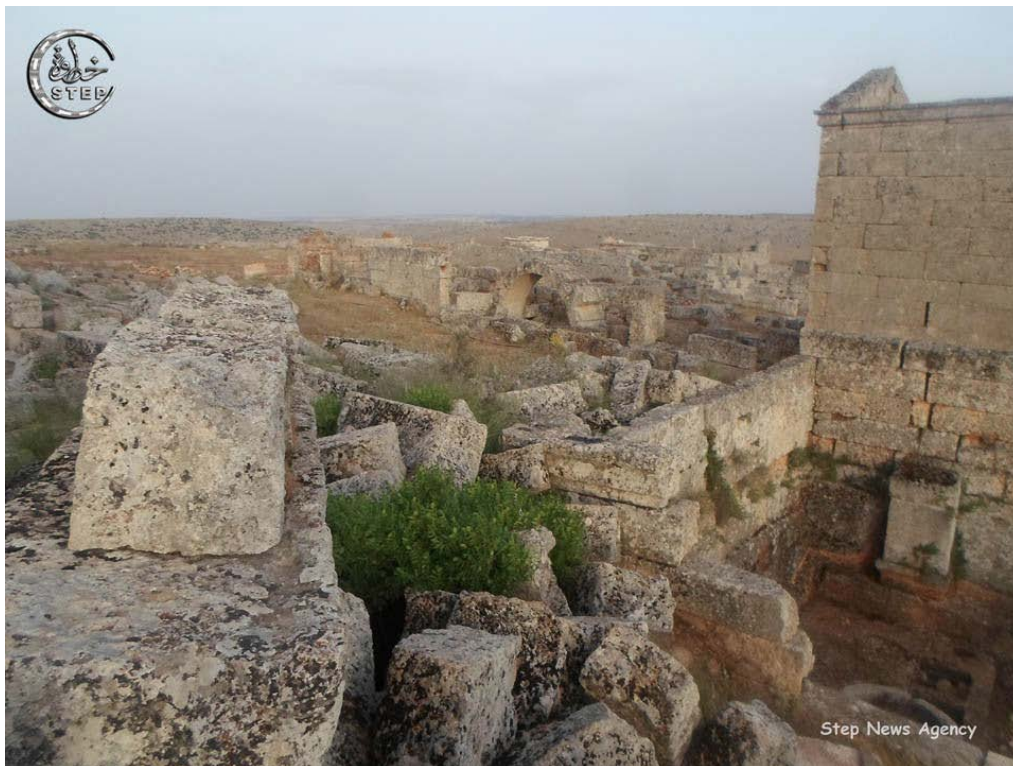
Serjilla (APSA; posted June 5, 2015)