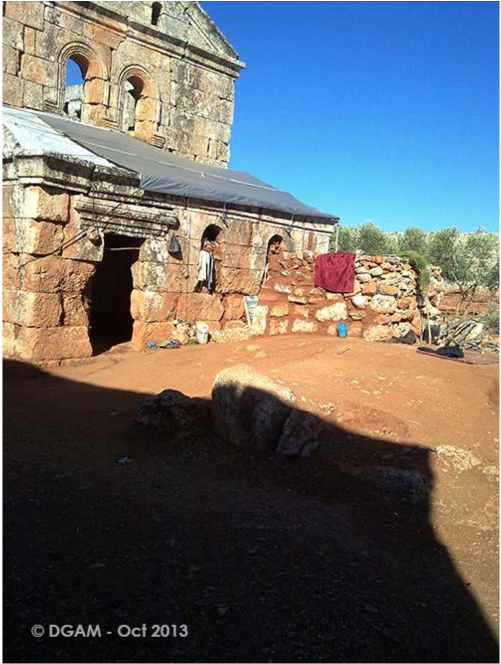
Serjilla, modern occupation (DGAM; posted October 28, 2013)