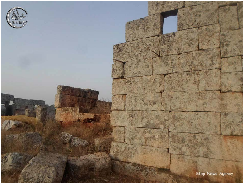
Serjilla (APSA; posted June 5, 2015)