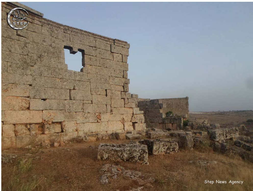
Serjilla (APSA; posted June 5, 2015)