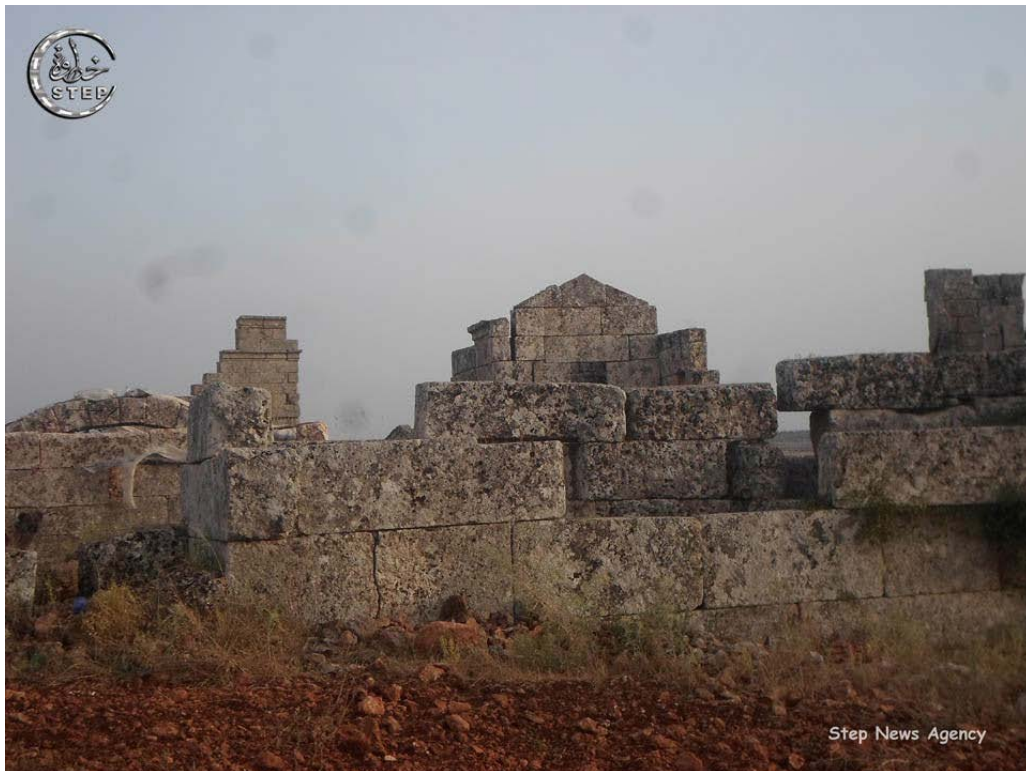
Serjilla (APSA; posted June 5, 2015)