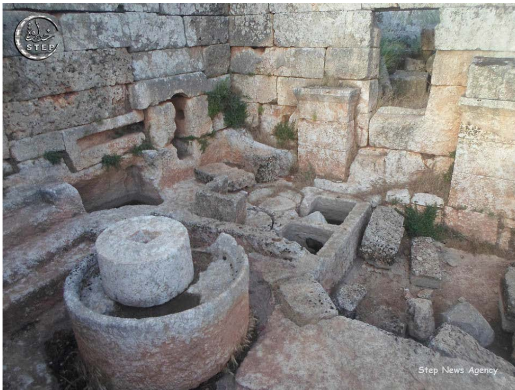
Serjilla, olive oil press (APSA; posted June 5, 2015)