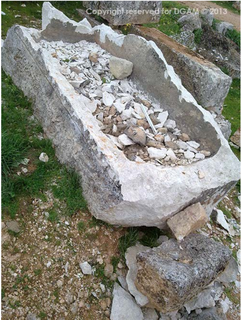
Serjilla, damage to a stone basin (DGAM; posted October 10, 2013)