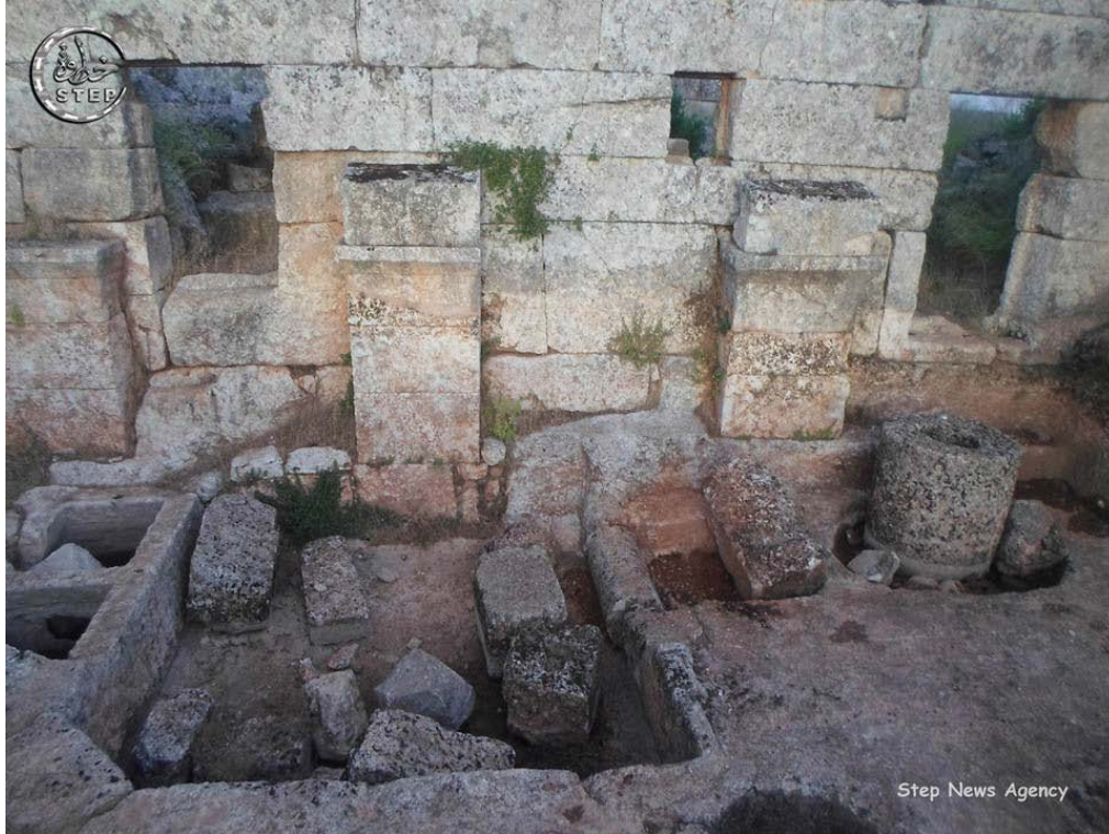
Serjilla, olive oil press (APSA; posted June 5, 2015)