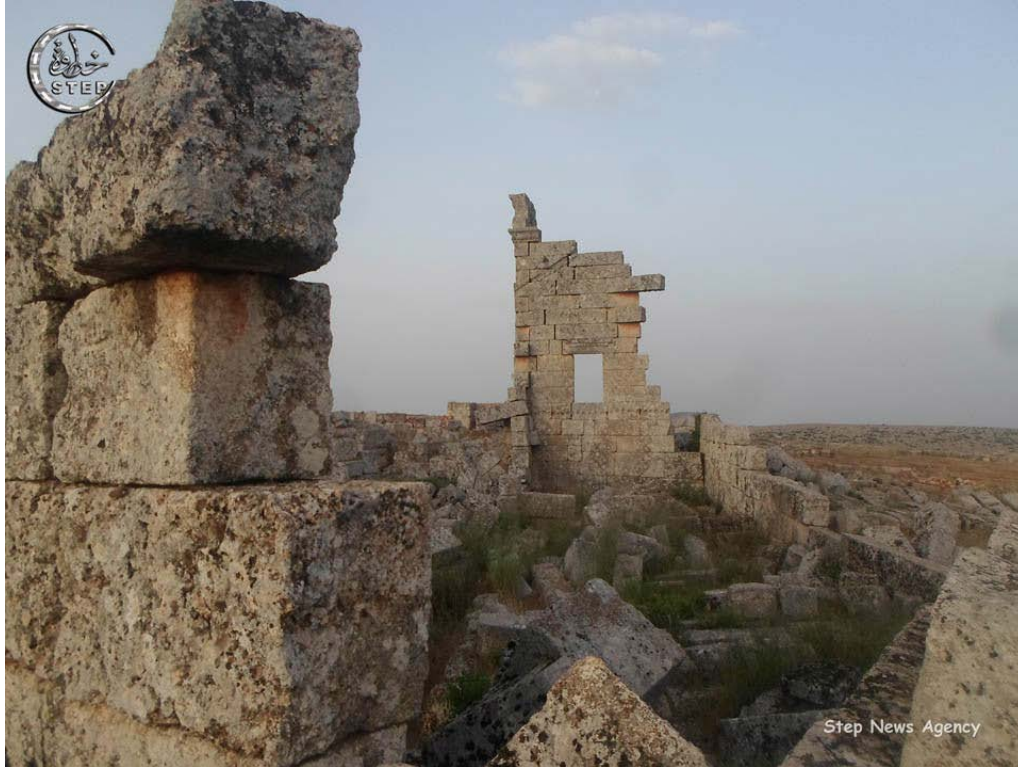
Serjilla (APSA; posted June 5, 2015)