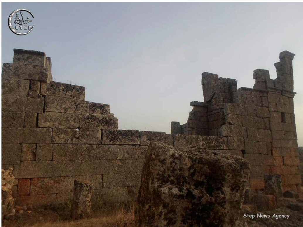
Serjilla (APSA; posted June 5, 2015)