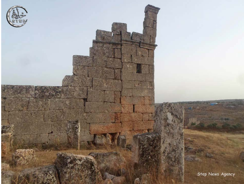
Serjilla (APSA; posted June 5, 2015)