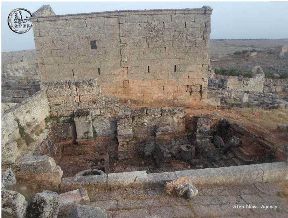
Serjilla (APSA; posted June 5, 2015)