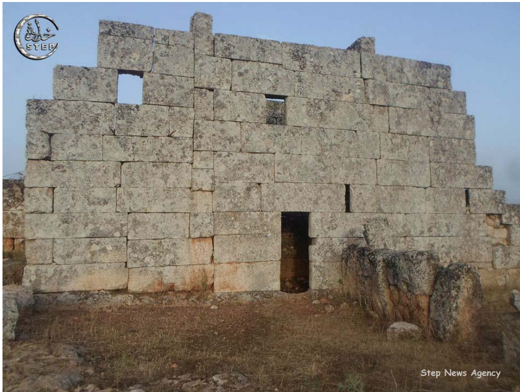
Serjilla (APSA; posted June 5, 2015)