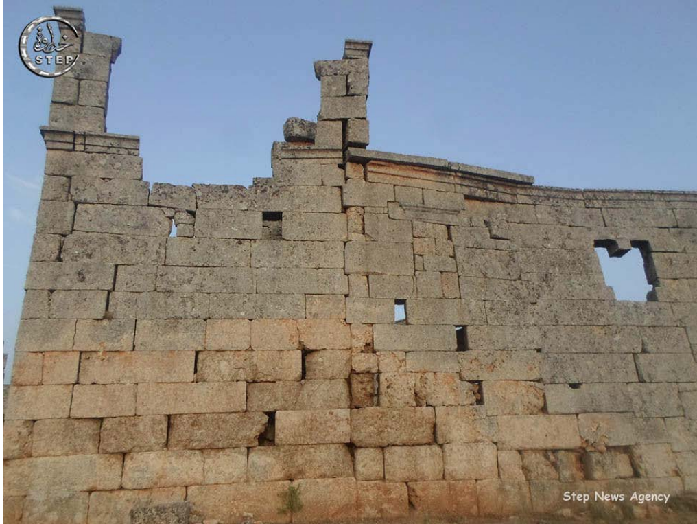
Serjilla (APSA; posted June 5, 2015)