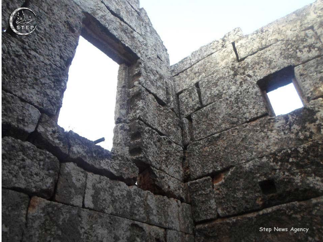
Serjilla (APSA; posted June 5, 2015)