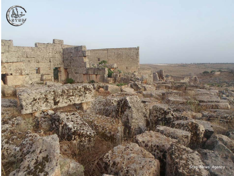
Serjilla (APSA; posted June 5, 2015)