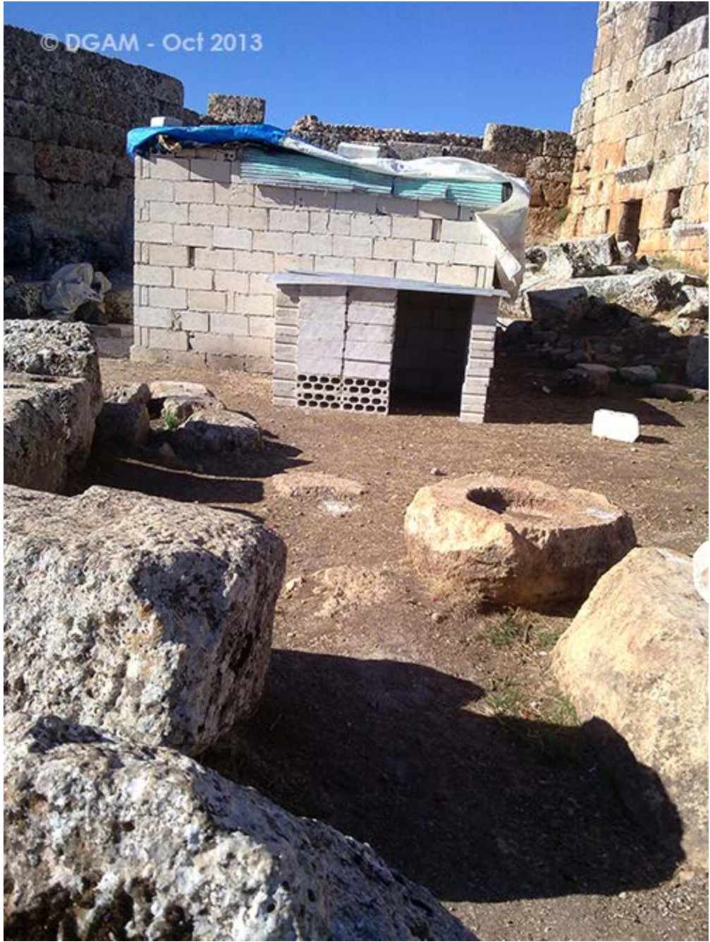
Serjilla, modern occupation (DGAM; posted October 28, 2013)