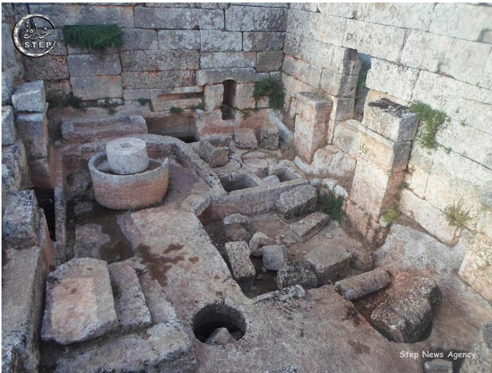
Serjilla, olive oil press (APSA; posted June 5, 2015)