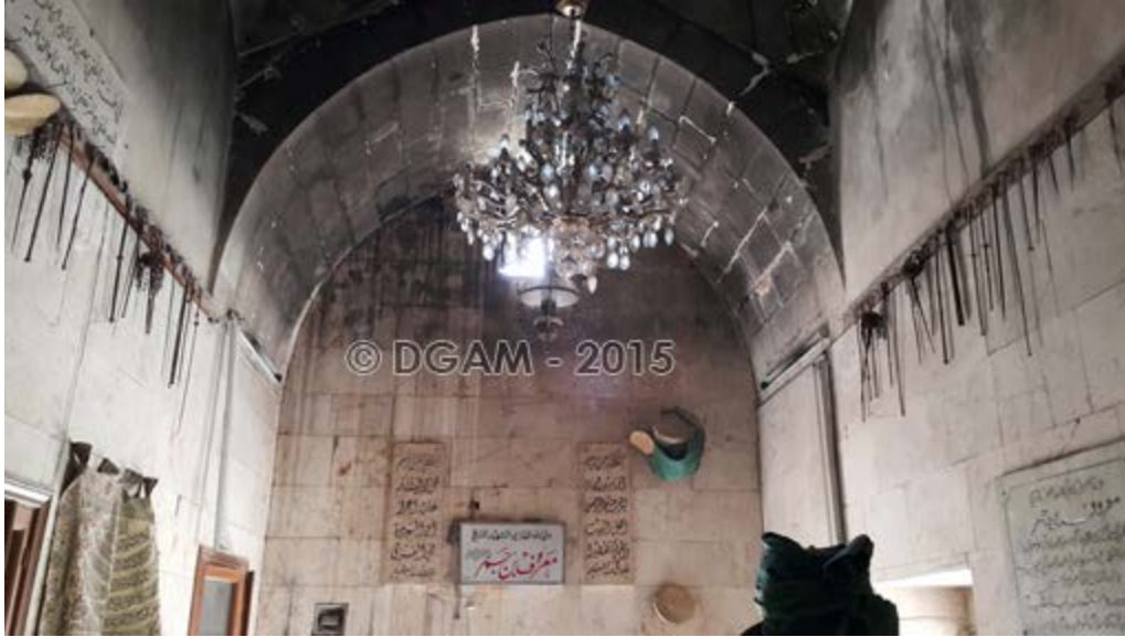
Ma'rouf Ibn Jamr Shrine and Mosque in the Suq Zarb