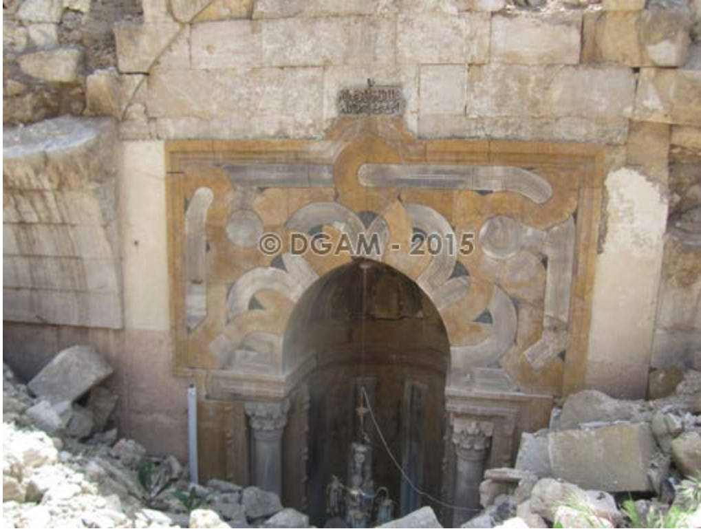
Ma'rouf Ibn Jamr Shrine and Mosque in the Suq Zarb