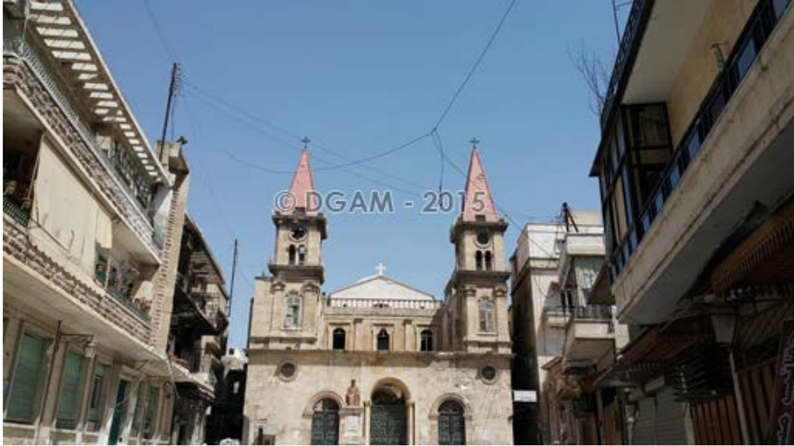
Maronite Cathedral of St. Elias, Aleppo