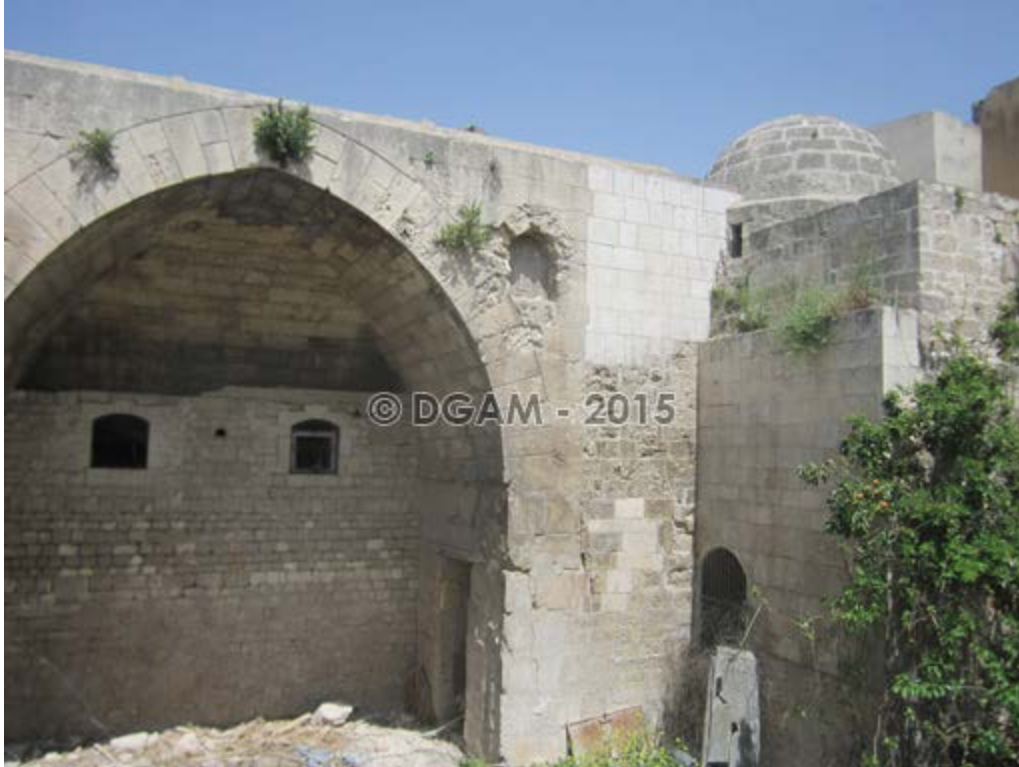
Ma'rouf Ibn Jamr Shrine and Mosque in the Suq Zarb