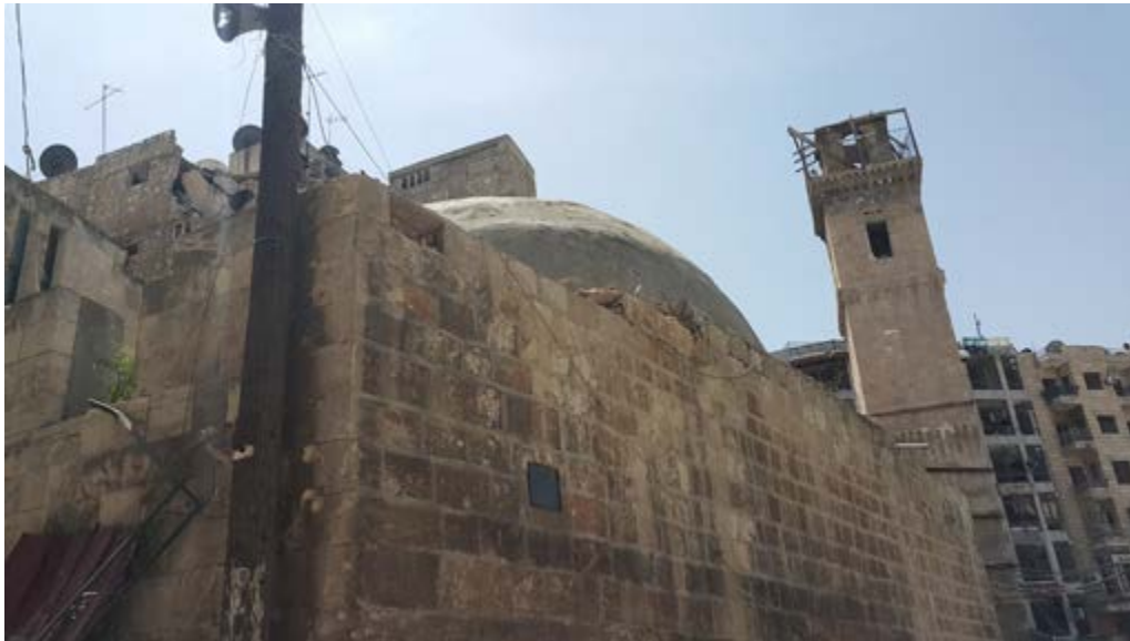
al-Dabagha al-Atiqah Mosque, Aleppo (DGAM; posted May 10, 2015)