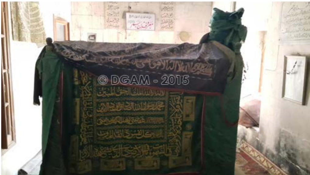
Ma'rouf Ibn Jamr Shrine and Mosque in the Suq Zarb