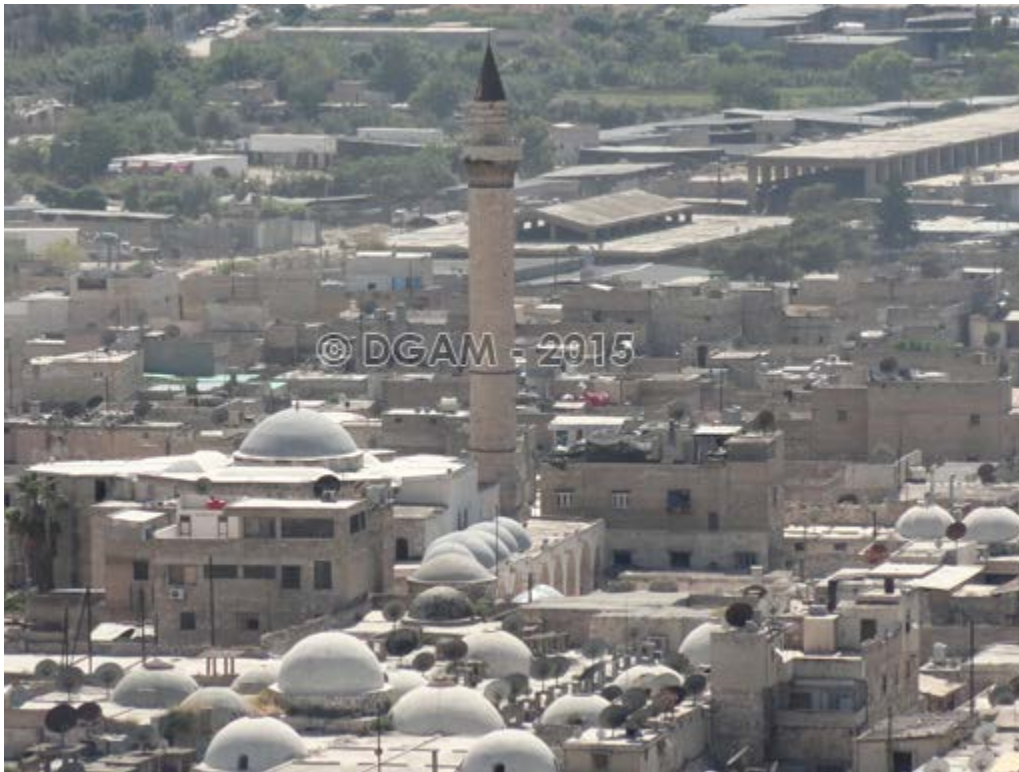
al-Halawiya Madrasa, Aleppo (DGAM; posted May 10, 2015)