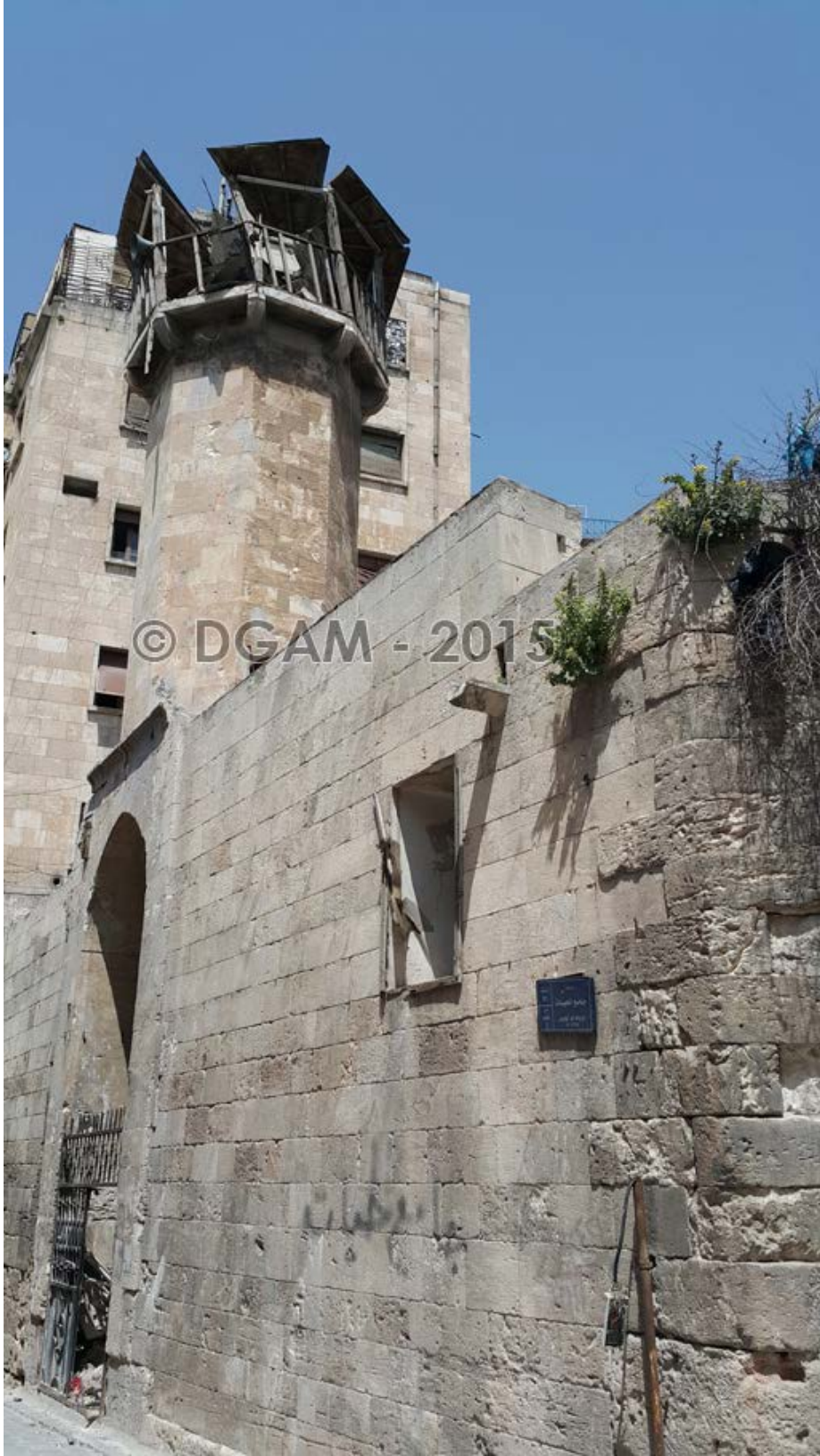
al-Hayyat Mosque, Aleppo (DGAM; posted May 10, 2015)