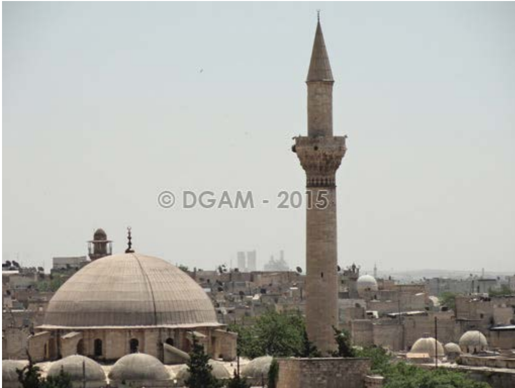
al-Adiliya Madrasa, Aleppo