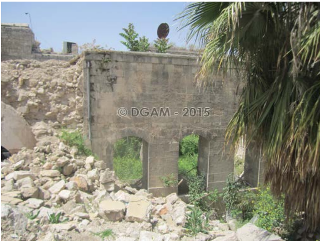
Ma'rouf Ibn Jamr Shrine and Mosque in the Suq Zarb