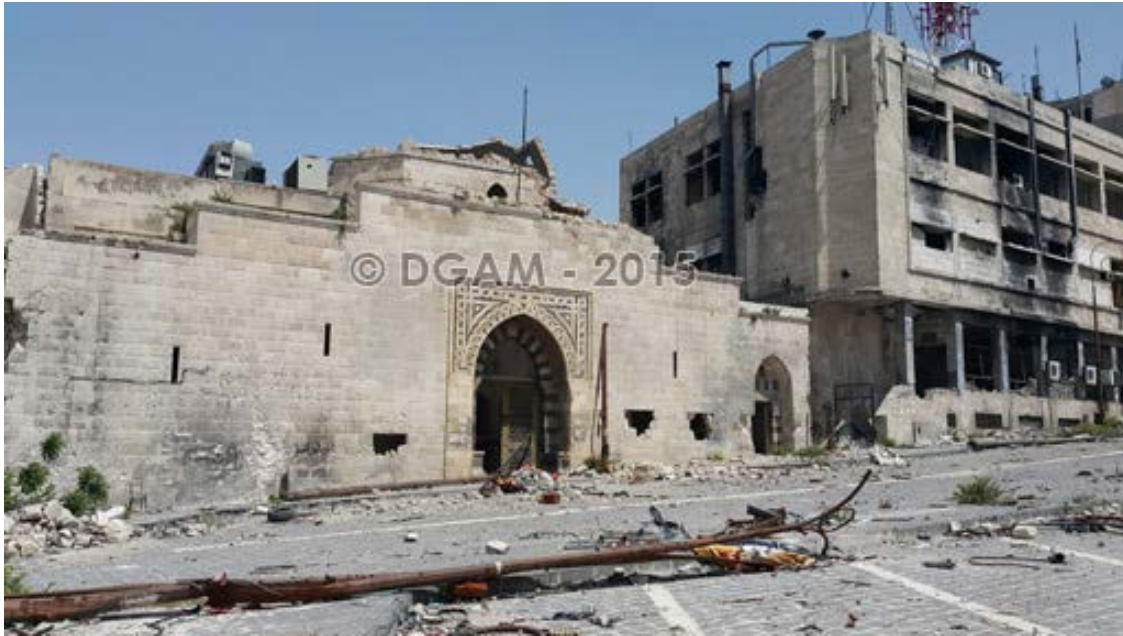
Matbakh al-Ajami, Aleppo (DGAM; posted May 10, 2015)