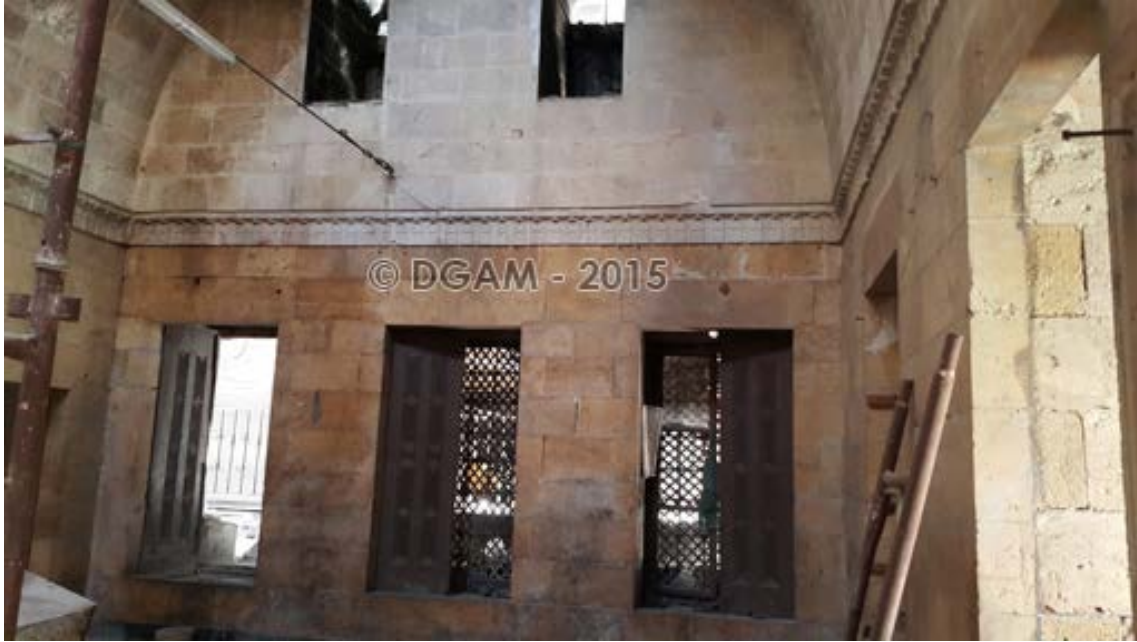
Aslan Dada Mosque, Aleppo (DGAM; posted May 10, 2015)