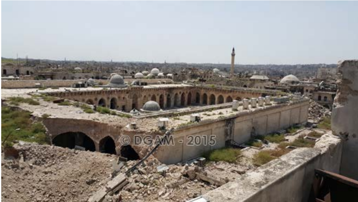
Umayyad Mosque, Aleppo, image taken from across the street to the northeast (DGAM; posted May 10, 2015)