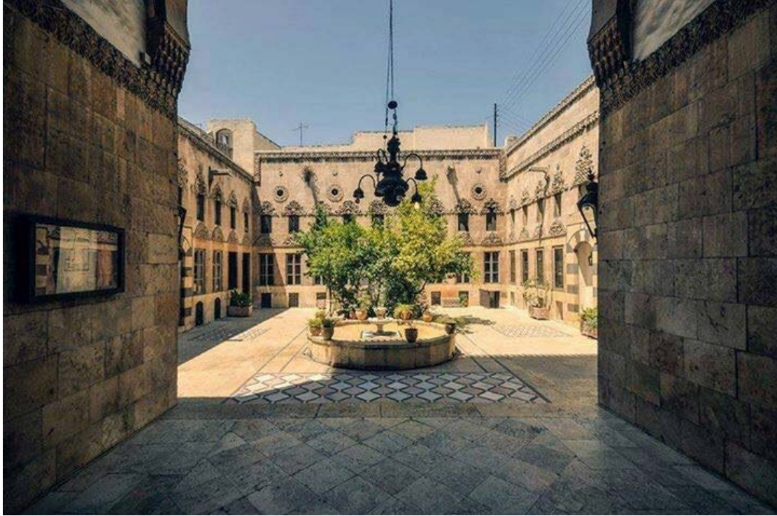
Museum of Popular Traditions, undated image (DGAM; posted May 7, 2015)