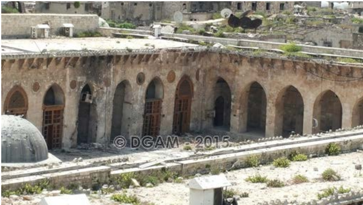
Umayyad Mosque, Aleppo, interior courtyard