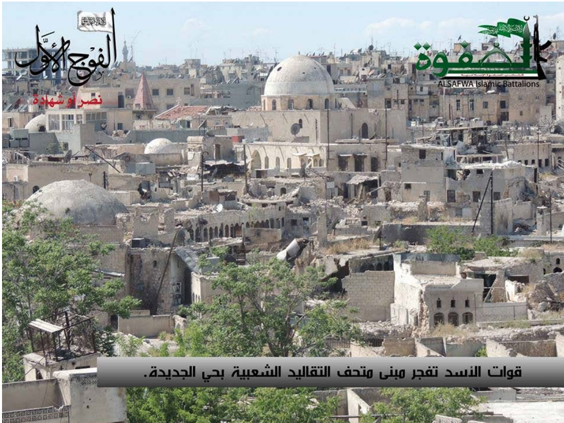
Museum of Popular Traditions (APSA; posted May 6, 2015)