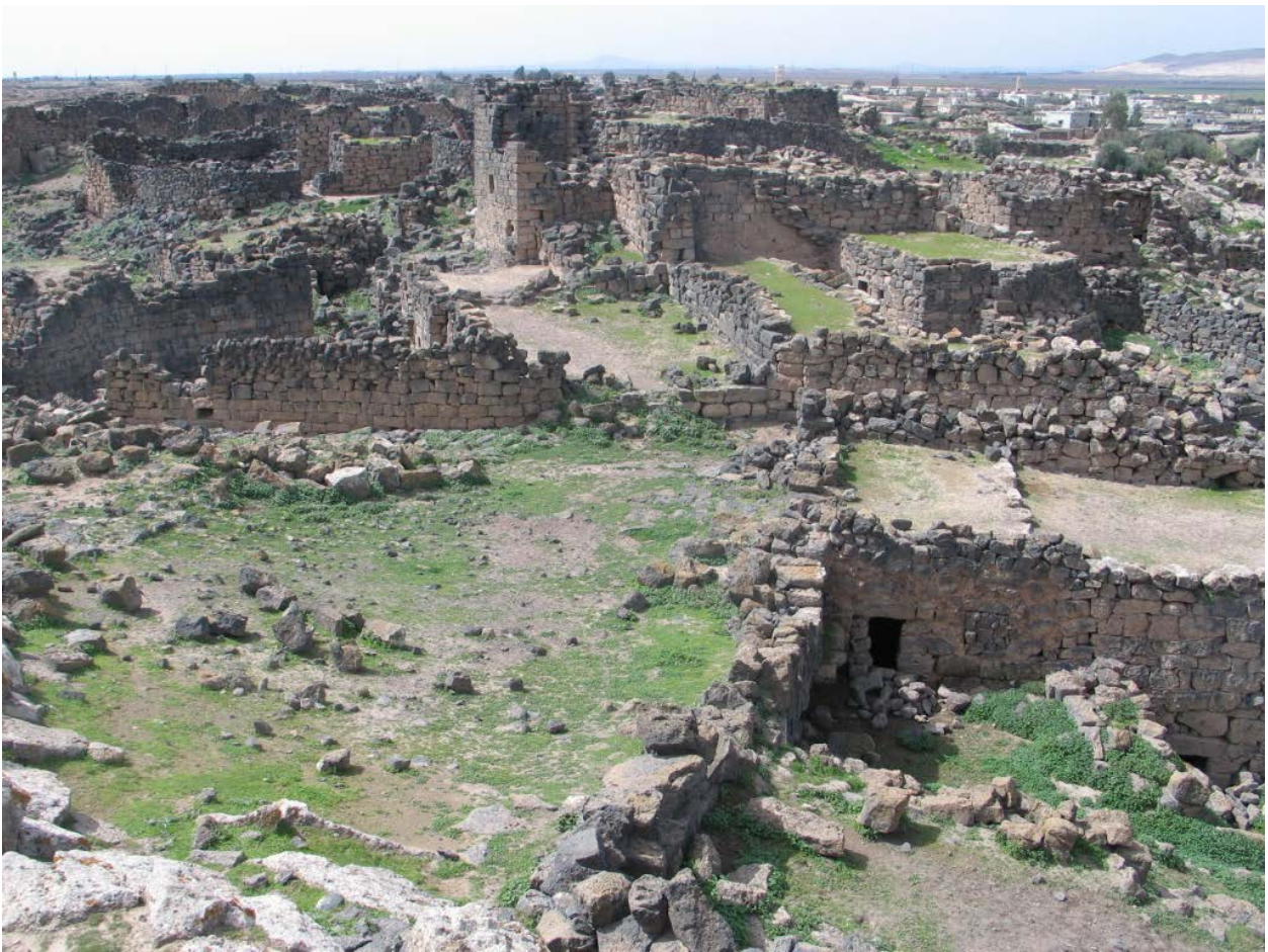
Sharaa archaeological site, undated image (posted May 11, 2015)