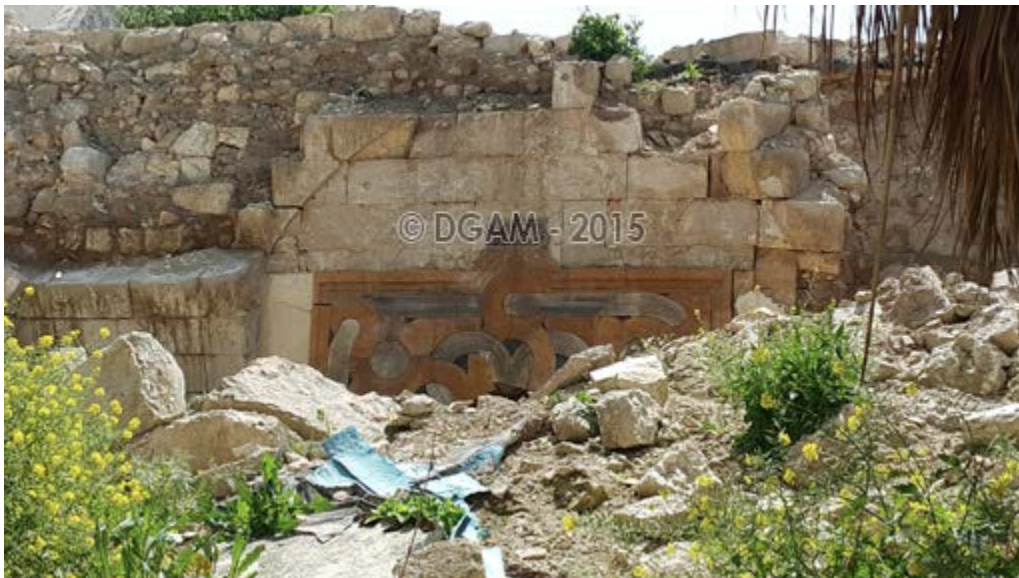
Ma'rouf Ibn Jamr Shrine and Mosque in the Suq Zarb