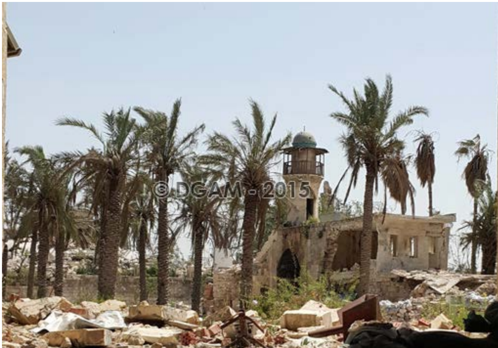
Sultaniya Madrasa, Aleppo (DGAM; posted May 10, 2015)