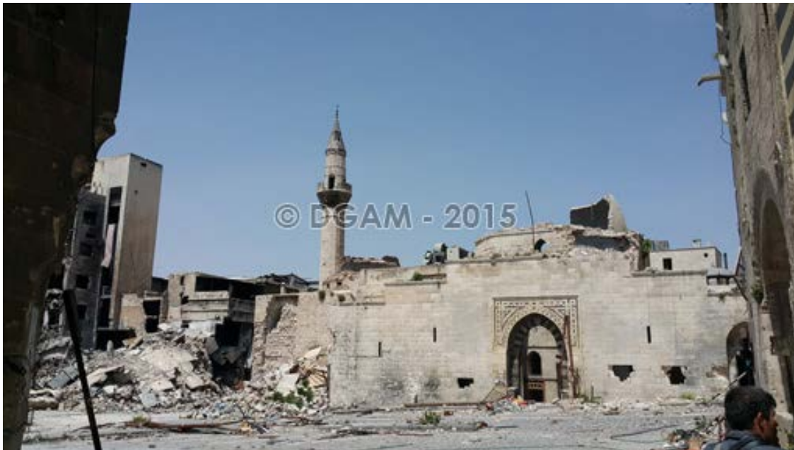
Matbakh al-Ajami, Aleppo