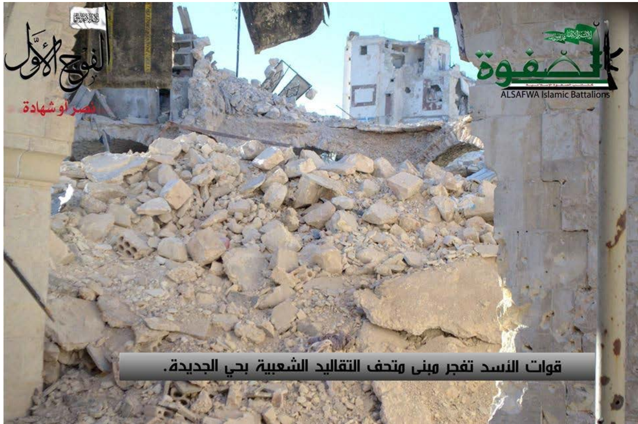
Museum of Popular Traditions (APSA; posted May 6, 2015)