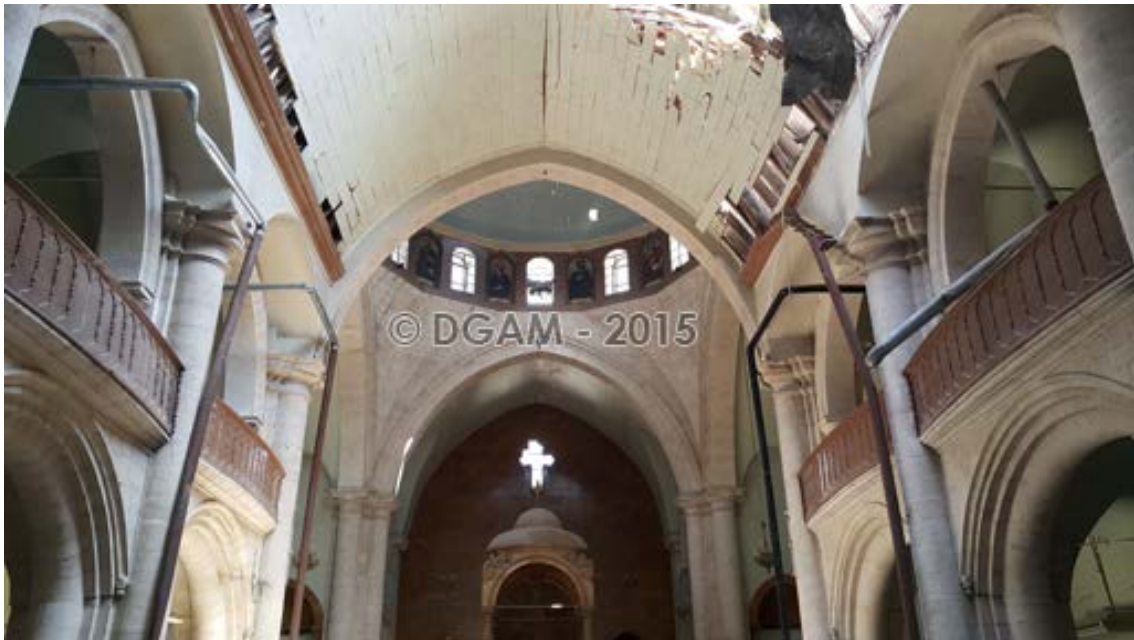
Maronite Cathedral of St. Elias, Aleppo