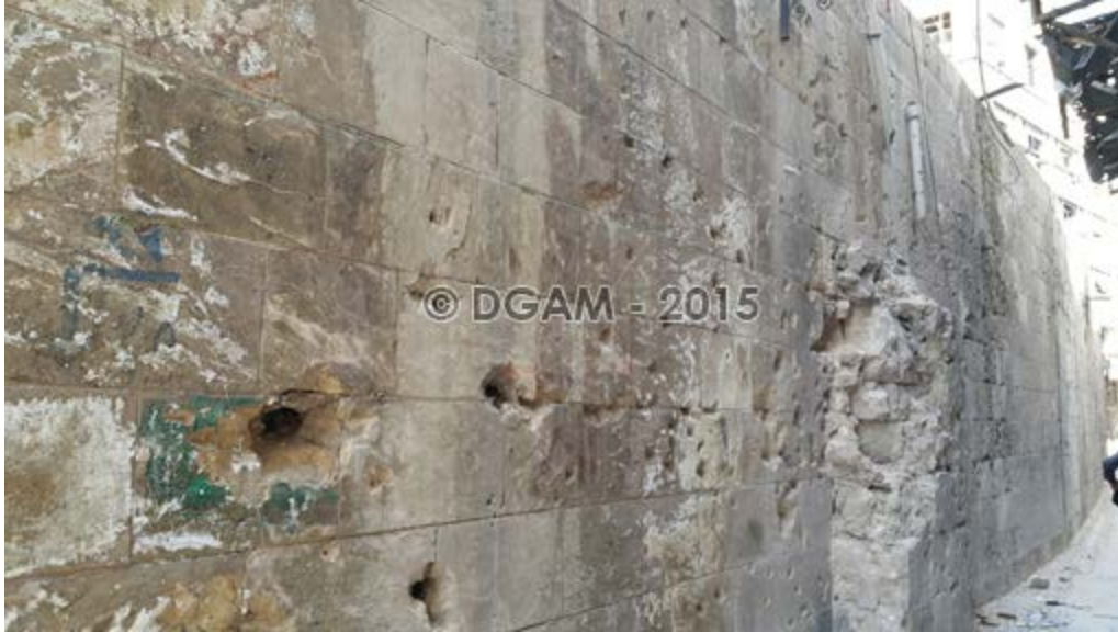
al-Dabagha al-Atiqah Mosque, Aleppo (DGAM; posted May 10, 2015)