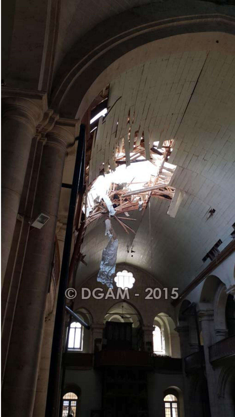
Maronite Cathedral of St. Elias, Aleppo