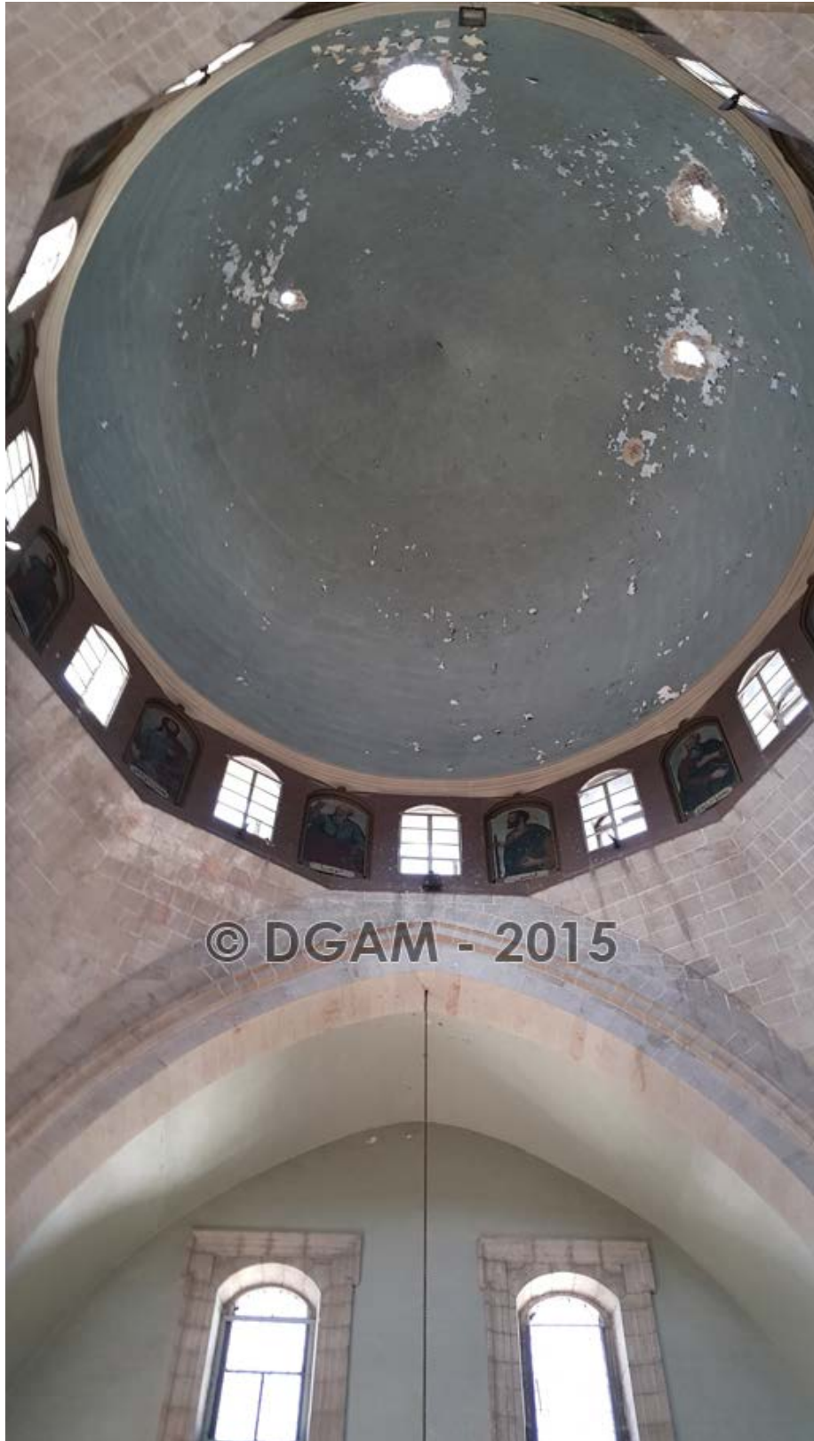
Maronite Cathedral of St. Elias, Aleppo (DGAM; posted May 10, 2015)