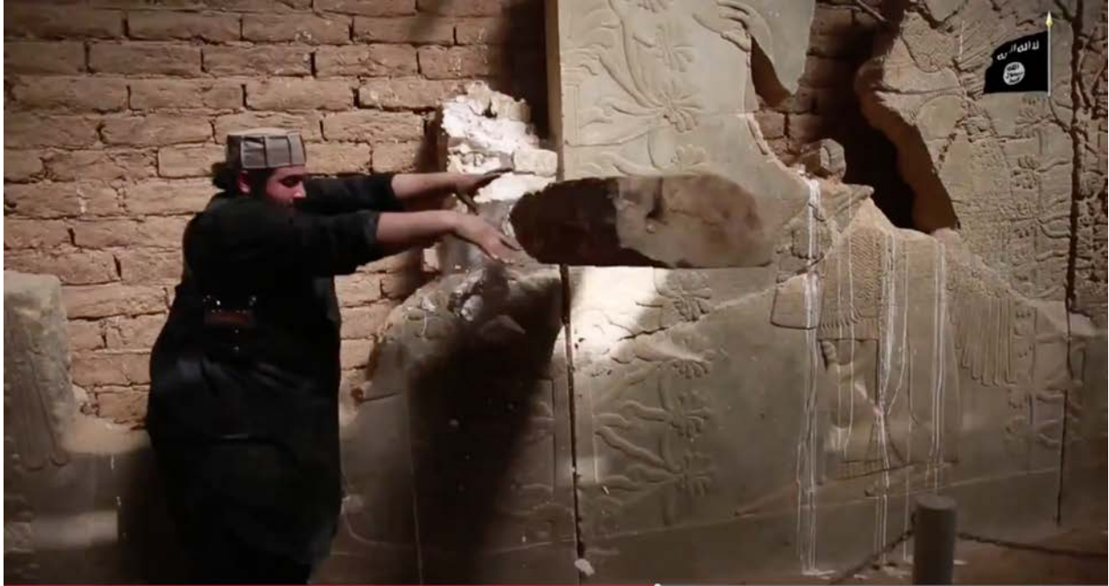
Northwest Palace, Nimrud, Iraq, ISIL militants dismantling the palace wall reliefs (YouTube; screenshot of video posted by ISIL-associated account, showing the demolition of the Northwest Palace)