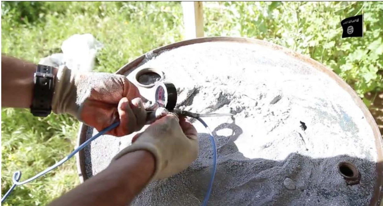
Northwest Palace, Nimrud, Iraq, ISIL militants setting the fuses of the barrel bombs (YouTube; screenshot of video posted by ISIL-associated account, showing the demolition of the Northwest Palace)