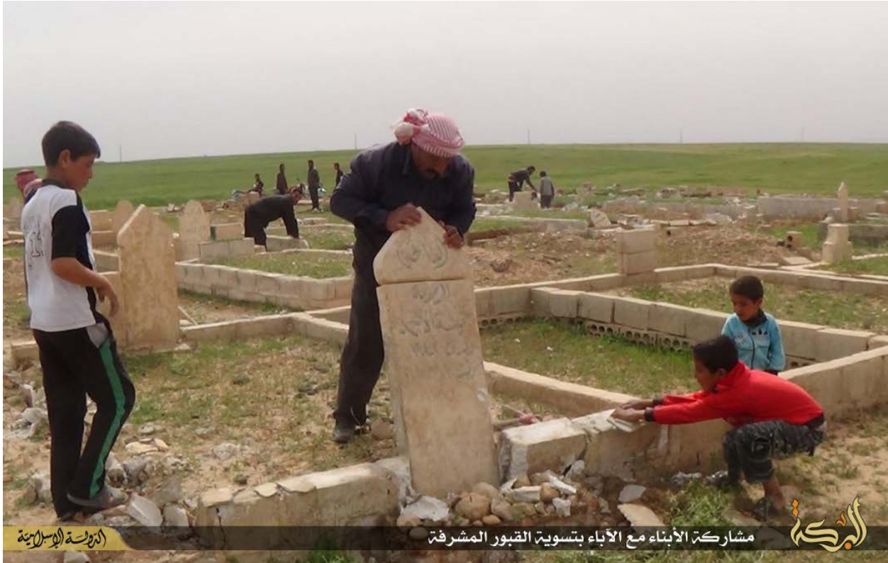
مشاركة الأبناء مع الآباء بتسوية القبور المشرفة الدراسة الإسلامية Destruction of graves in Hasakah Governorate, Syria (Dump.to; posted April 23, 2015)