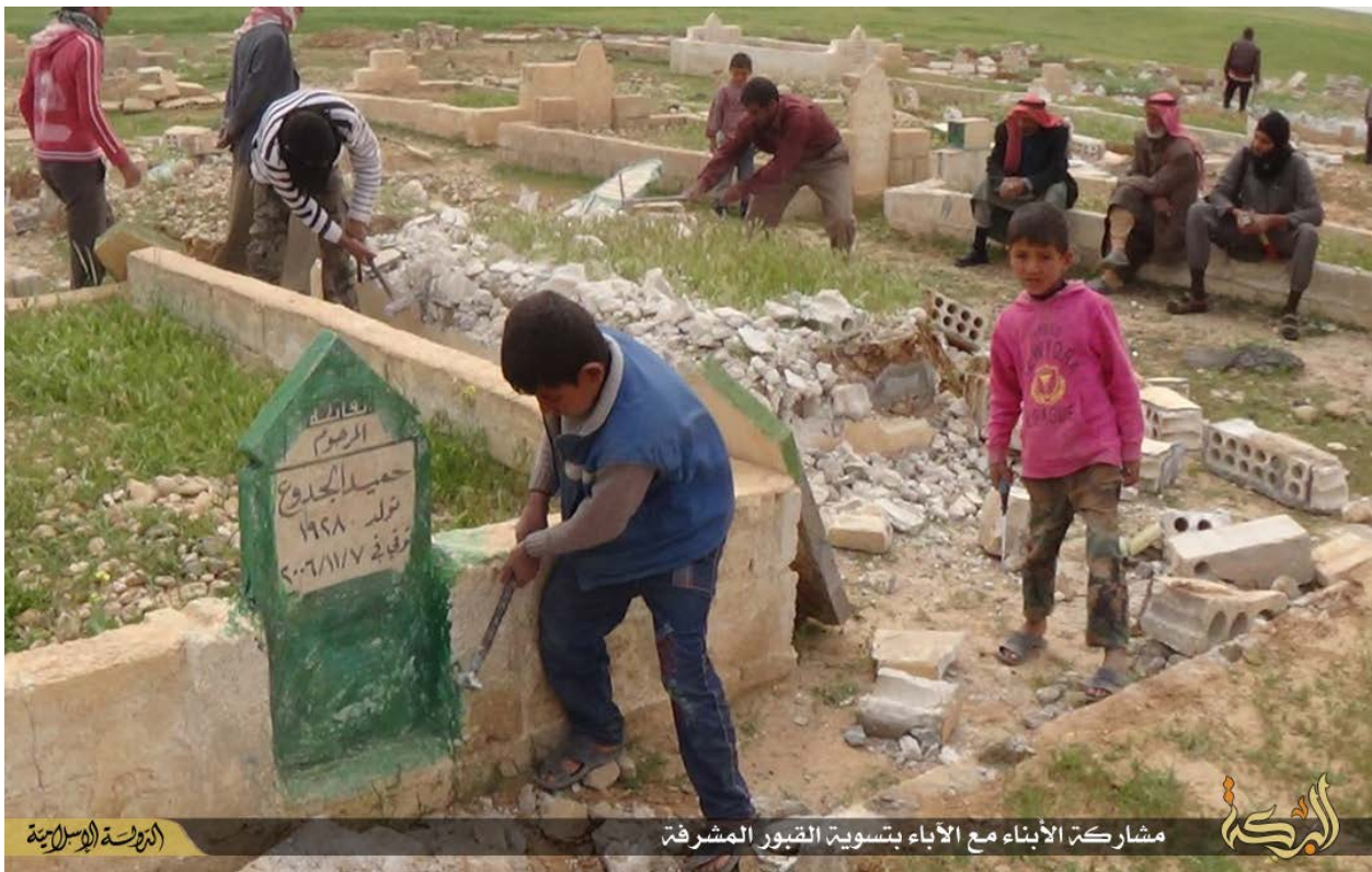
Destruction of graves in Hasakah Governorate, Syria

تسوية القبور المشرفة من طرف أهالي القاطع الغربي لولاية البركة