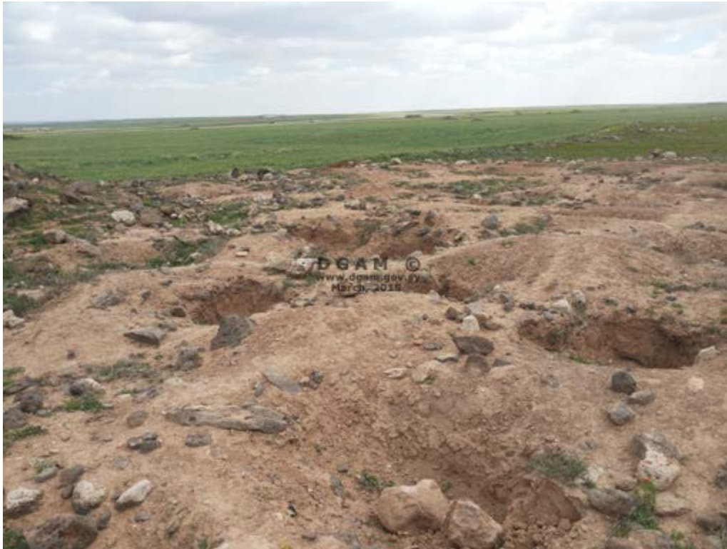
Khirbet al-Suhb (DGAM; posted April 21, 2015)