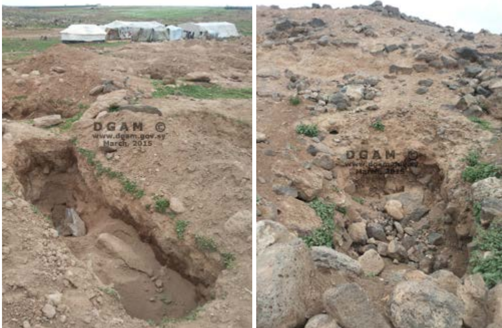
Khirbet al-Qinah (DGAM; posted April 21, 2015)