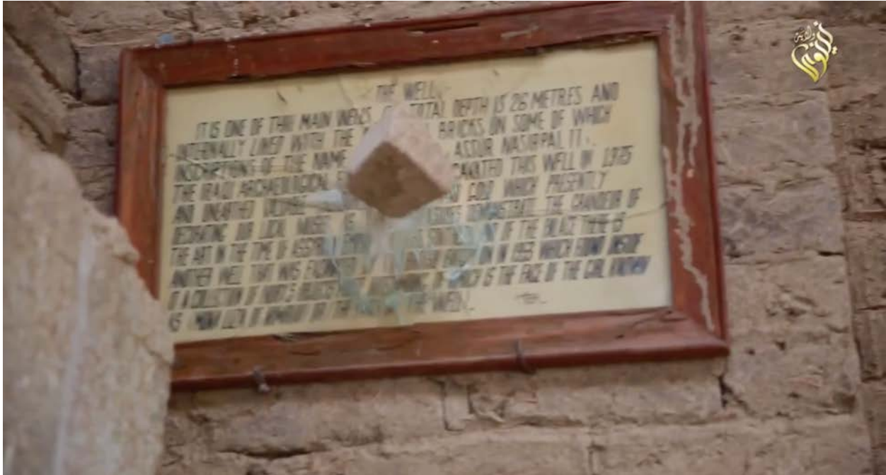
Northwest Palace, Nimrud, Iraq, didactic panel being vandalized (YouTube; screenshot of video posted by ISIL-associated account, showing the demolition of the Northwest Palace)