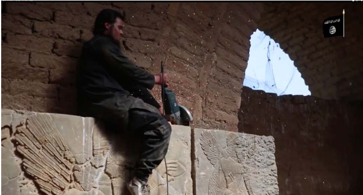
Northwest Palace, Nimrud, Iraq, ISIL militant cutting apart a palace wall relief with a rotary saw (YouTube; screenshot of video posted by ISIL-associated account, showing the demolition of the Northwest Palace)