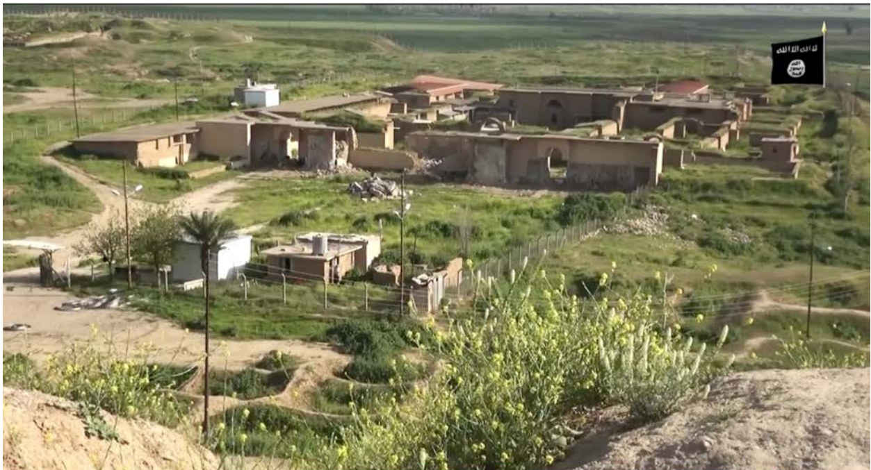
Northwest Palace, Nimrud, Iraq, prior to detonation of barrel bombs (YouTube; screenshot of video posted by ISIL-associated account, showing the demolition of the Northwest Palace)