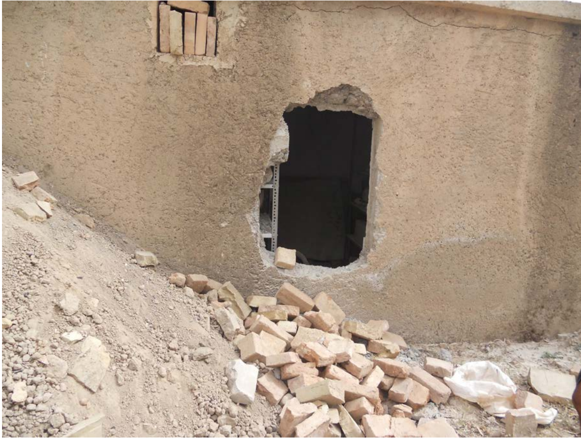
Tell Sabi Abyad storehouse, exterior, showing breach in storehouse wall