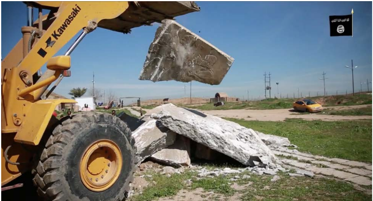
Northwest Palace, Nimrud, Iraq, ISIL militants removing the rubble of the wall relief panels with a bulldozer (YouTube; screenshot of video posted by ISIL-associated account, showing the demolition of the Northwest Palace)