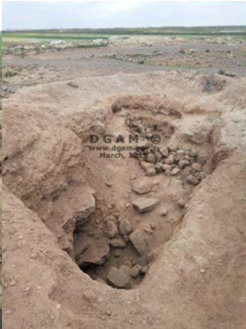
Khirbet al-Qinah (DGAM; posted April 21, 2015)