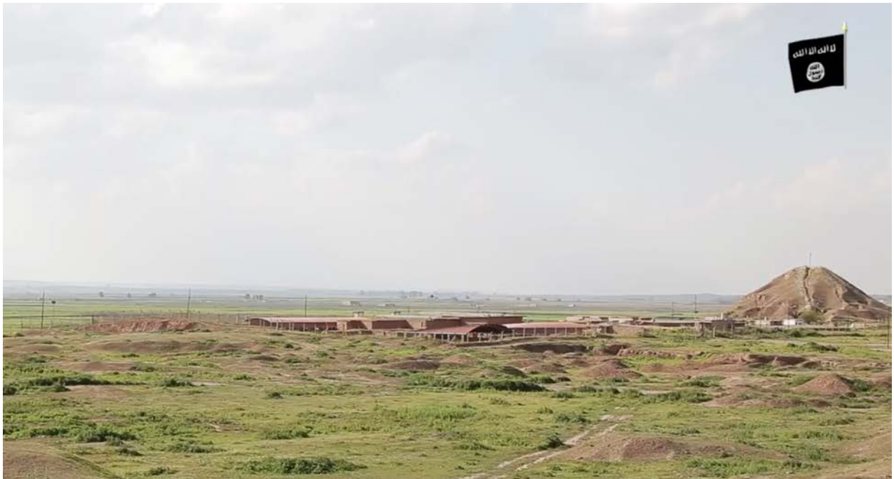
Northwest Palace, Nimrud, Iraq, prior to detonation of barrel bombs (YouTube; screenshot of video posted by ISIL-associated account, showing the demolition of the Northwest Palace)