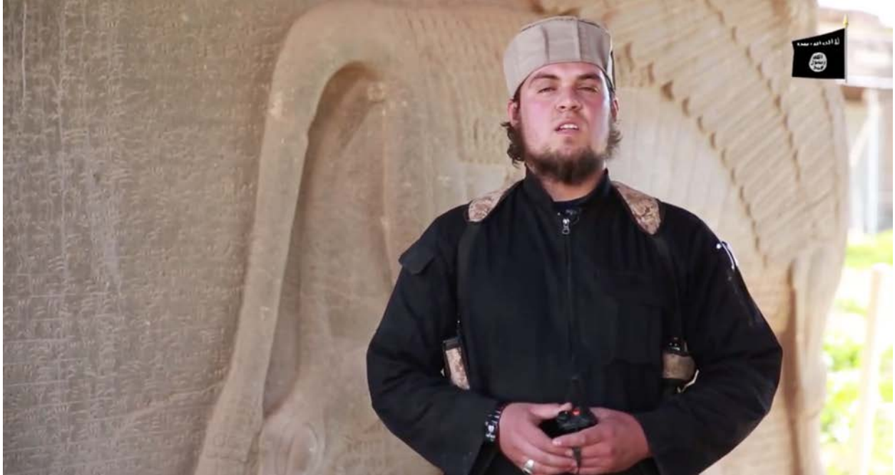
Northwest Palace, Nimrud, Iraq, ISIL militant during a monologue