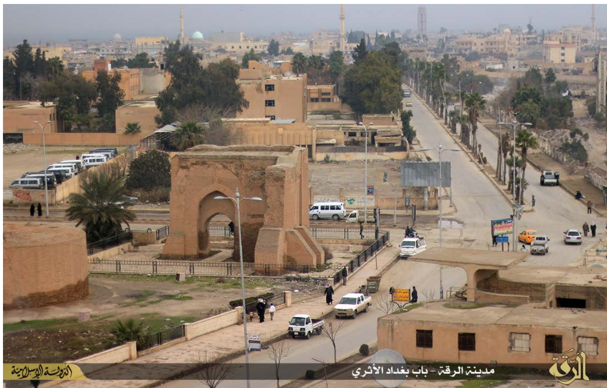
Eastern gate of the city wall of Rafiqa (APSA; posted March 22, 2015; originally posted by ISIL)