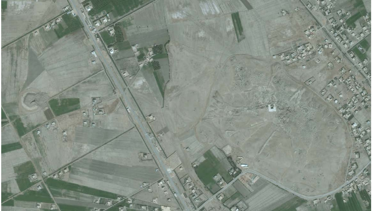
Tell el-Madquq and Mari/Tell Hariri