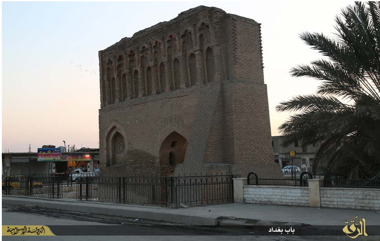
Southeastern gate of the city wall of Rafiqa (APSA; posted March 22, 2015; originally posted by ISIL)