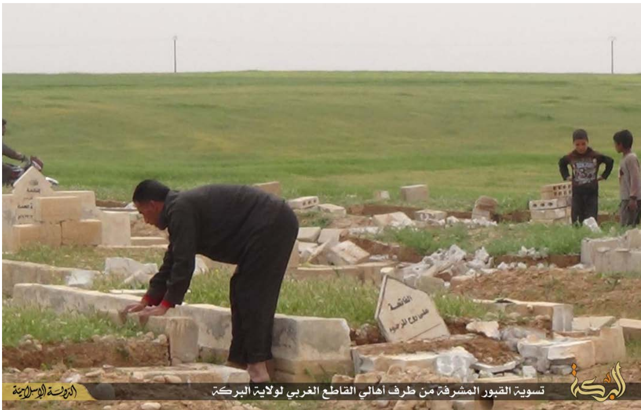
تسوية القبور المشرفة من طرف أهالي القاطع الغربي لولاية البركة الدراسة الإسلامية Destruction of graves in Hasakah Governorate, Syria (Dump.to; posted April 23, 2015)