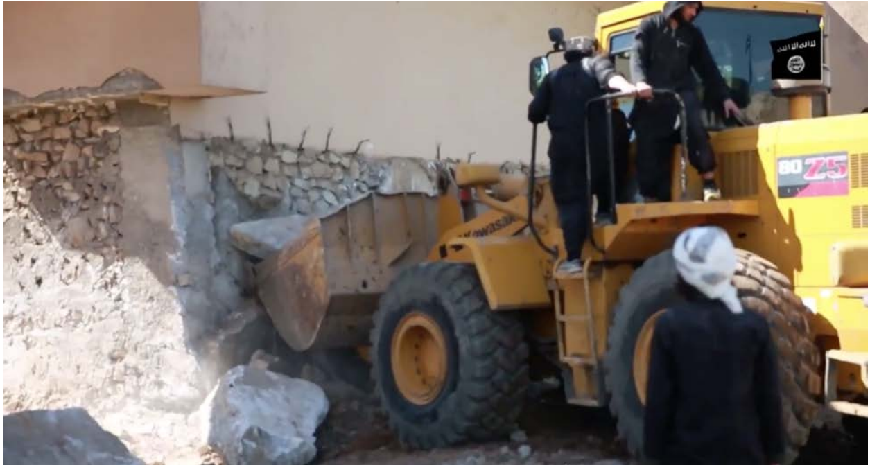
Northwest Palace, Nimrud, Iraq, ISIL militants removing the rubble of the wall relief panels with a bulldozer (YouTube; screenshot of video posted by ISIL-associated account, showing the demolition of the Northwest Palace)