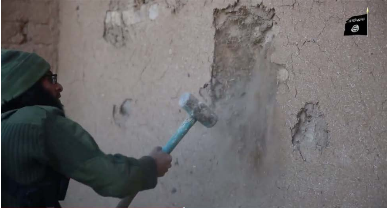
Northwest Palace, Nimrud, Iraq, ISIL militant attacking the site with a sledgehammer (YouTube; screenshot of video posted by ISIL-associated account, showing the demolition of the Northwest Palace)