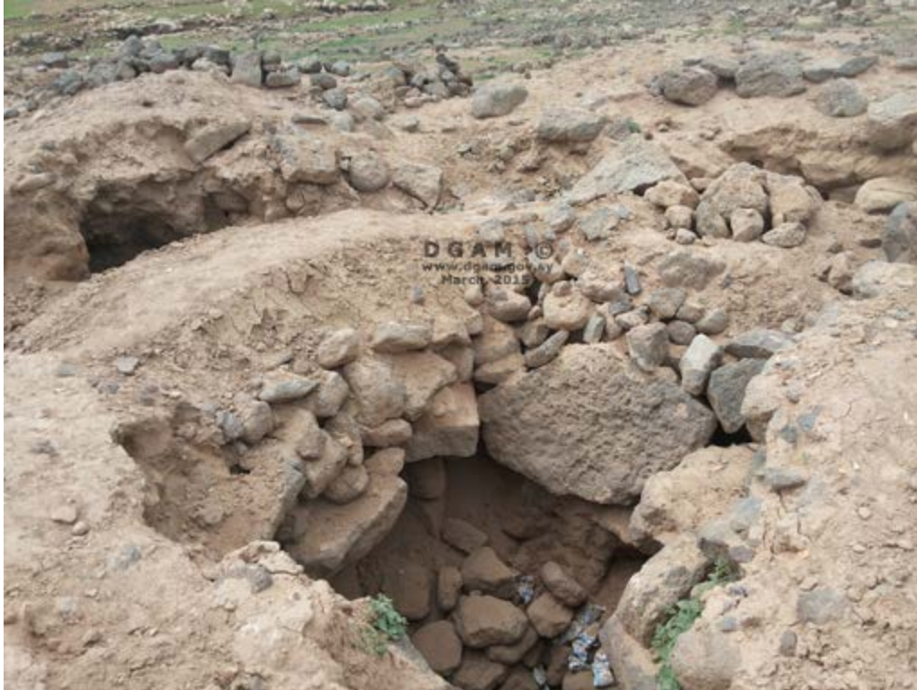
Khirbet al-Qinah (DGAM; posted April 21, 2015)