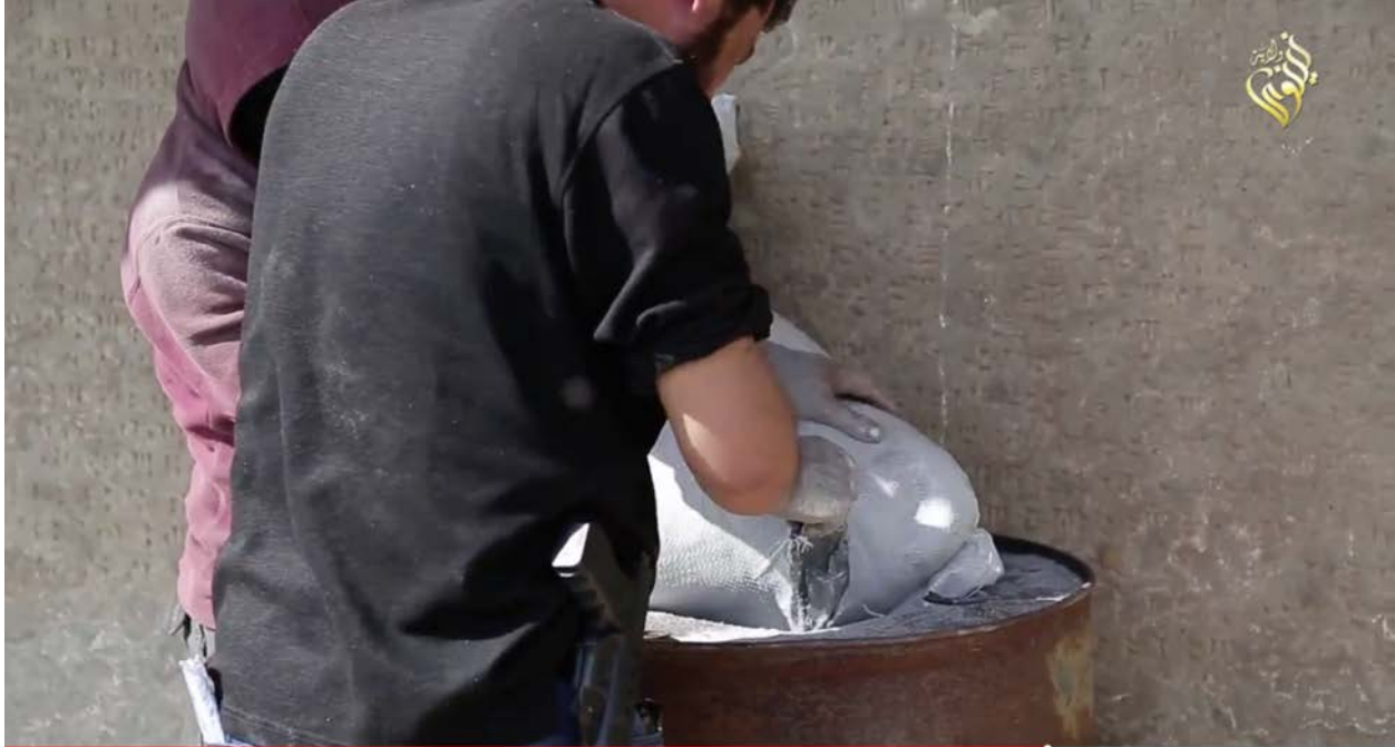
Northwest Palace, Nimrud, Iraq, ISIL militants filling barrels with explosives (YouTube; screenshot of video posted by ISIL-associated account, showing the demolition of the Northwest Palace)