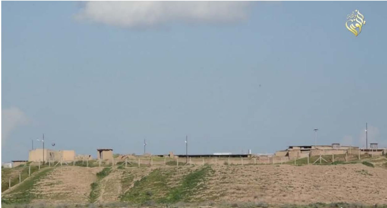
Northwest Palace, Nimrud, Iraq, prior to detonation of barrel bombs (YouTube; screenshot of video posted by ISIL-associated account, showing the demolition of the Northwest Palace)