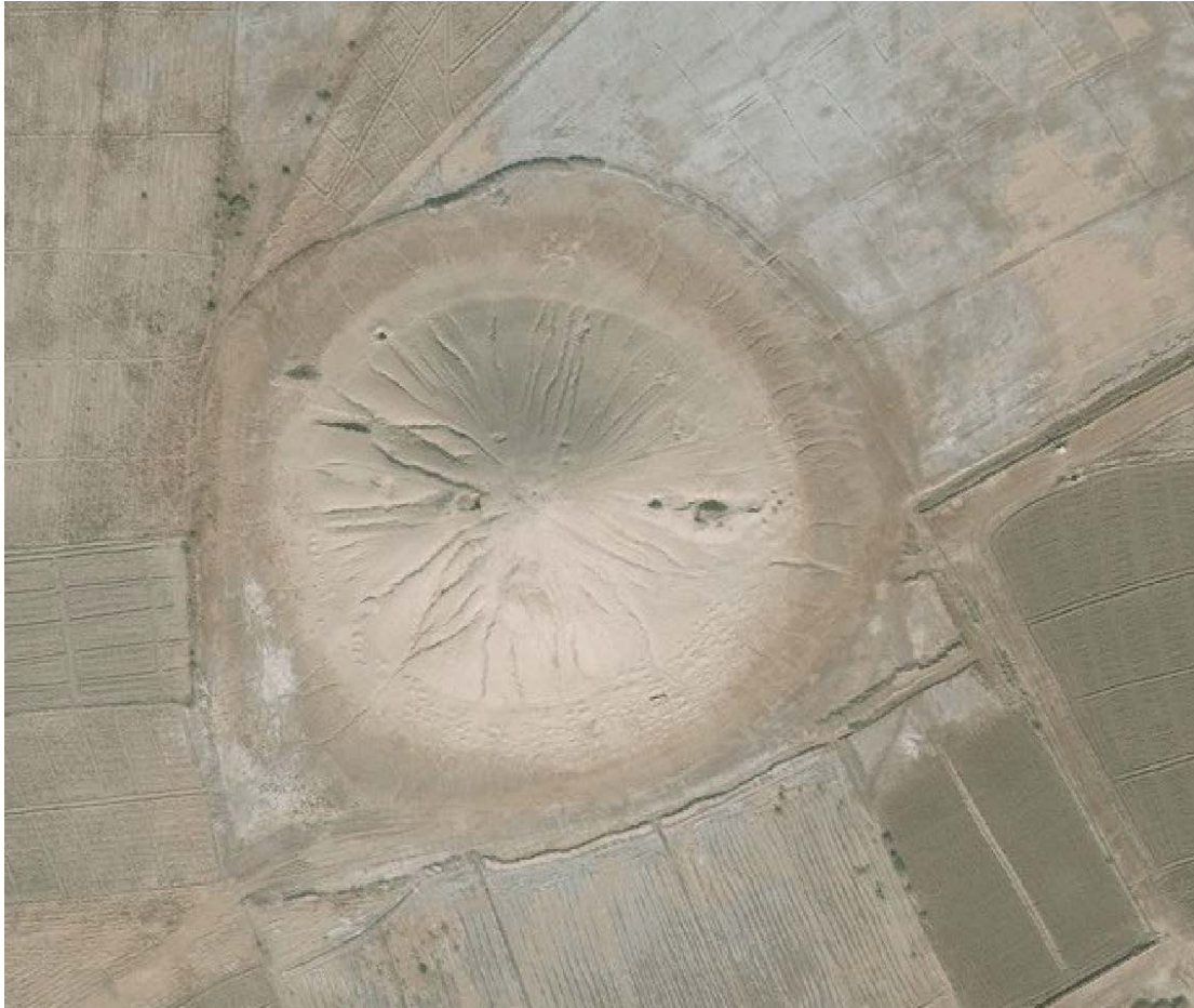
Tell el-Madquq, conical crown of the mound still intact (ASOR CHI; DigitalGlobe, image dates to November 11, 2014)