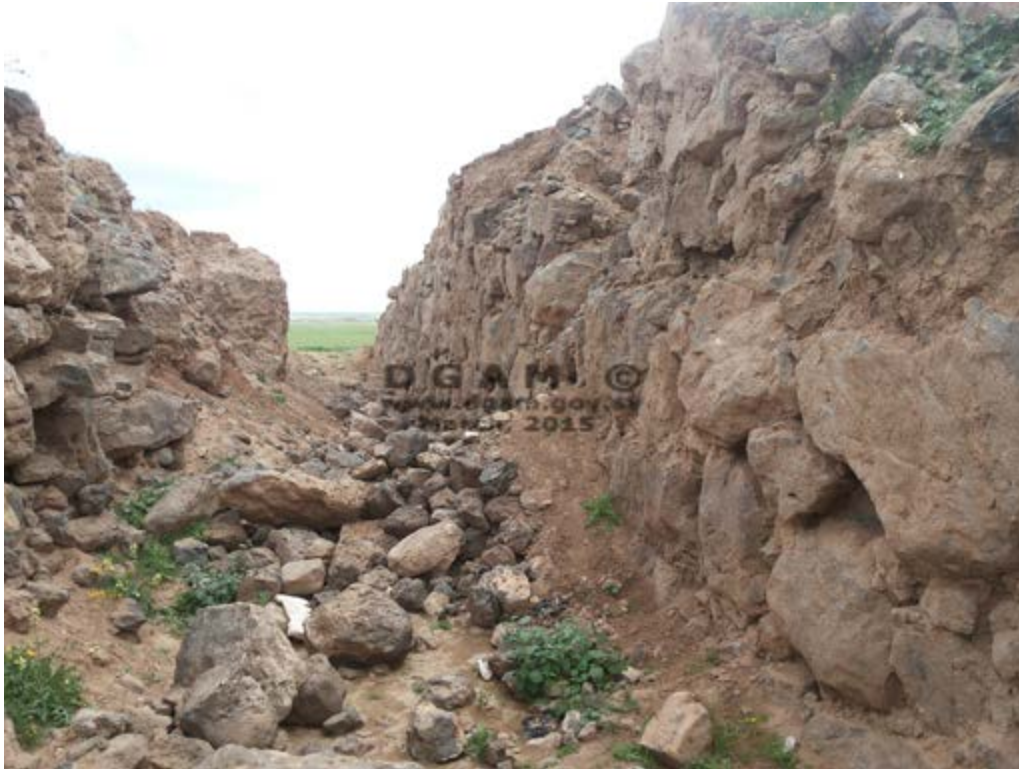
Khirbet al-Suhb (DGAM; posted April 21, 2015)