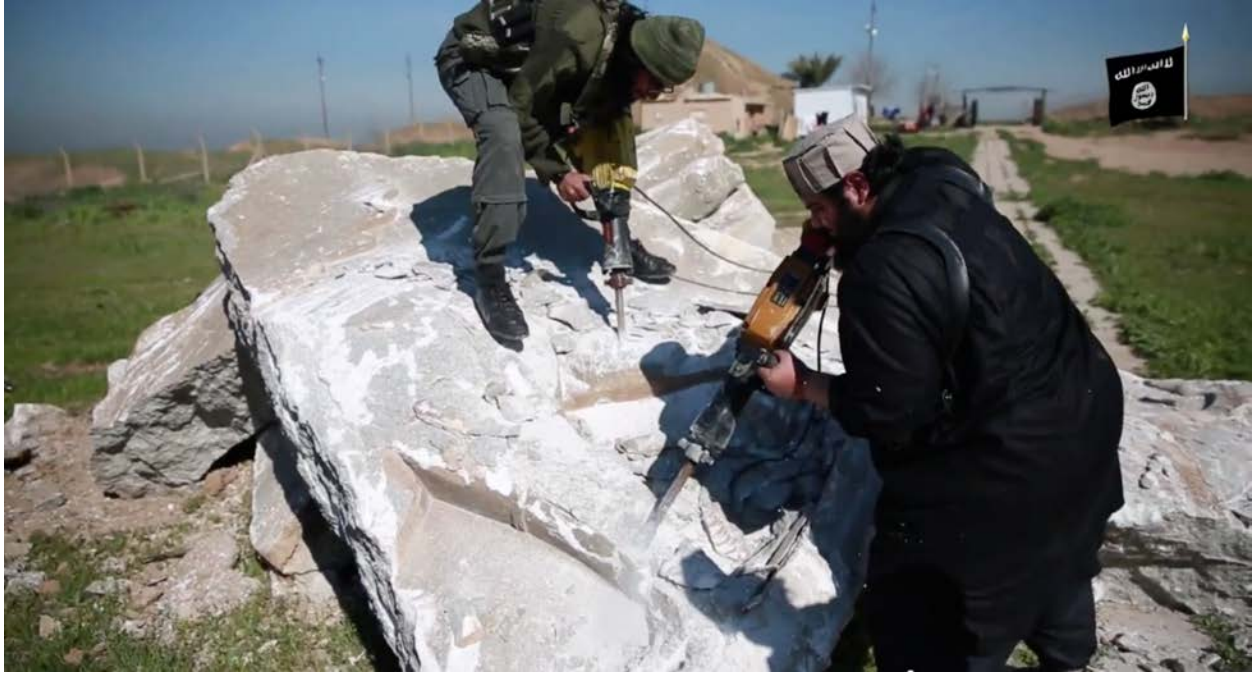
Northwest Palace, Nimrud, Iraq, ISIL militants further defacing the removed palace wall reliefs with jackhammers (YouTube; screenshot of video posted by ISIL-associated account, showing the demolition of the Northwest Palace)