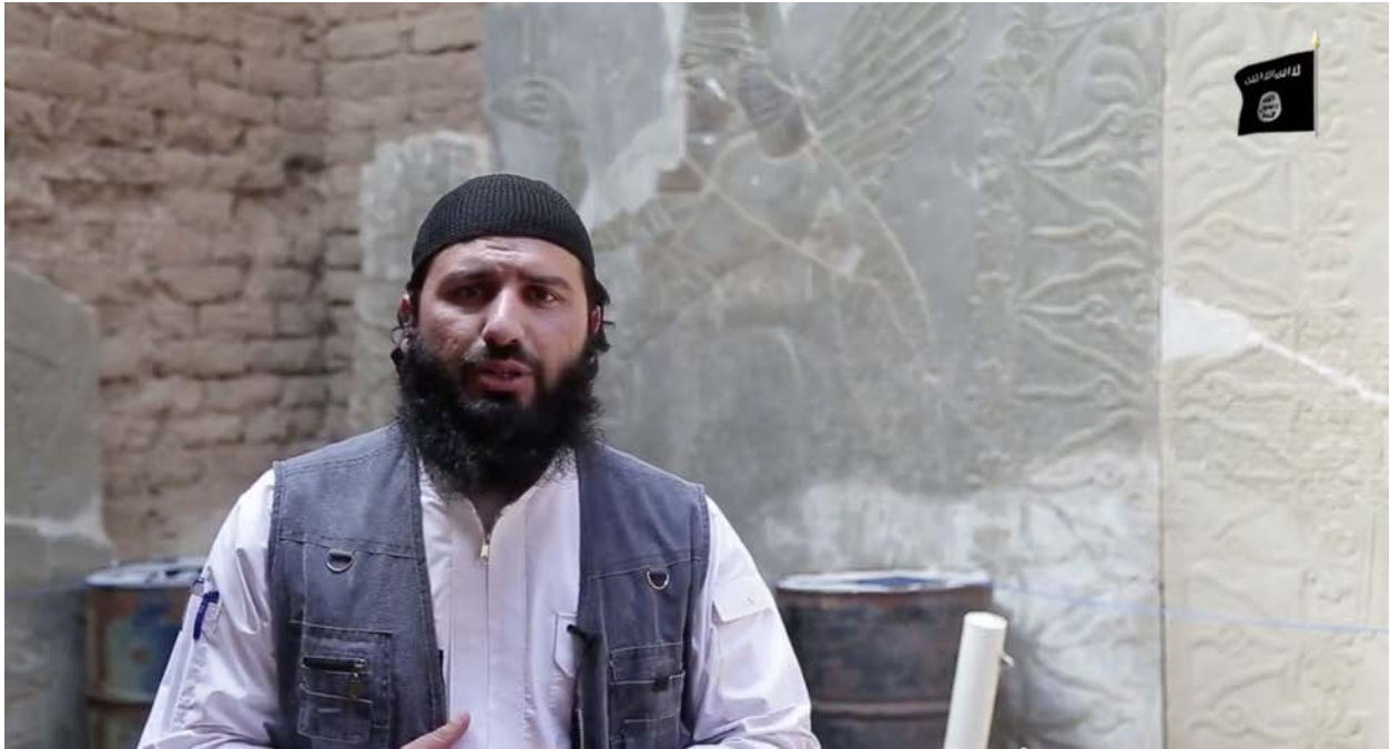
Northwest Palace, Nimrud, Iraq, ISIL militant during a monologue (YouTube; screenshot of video posted by ISIL-associated account, showing the demolition of the Northwest Palace)