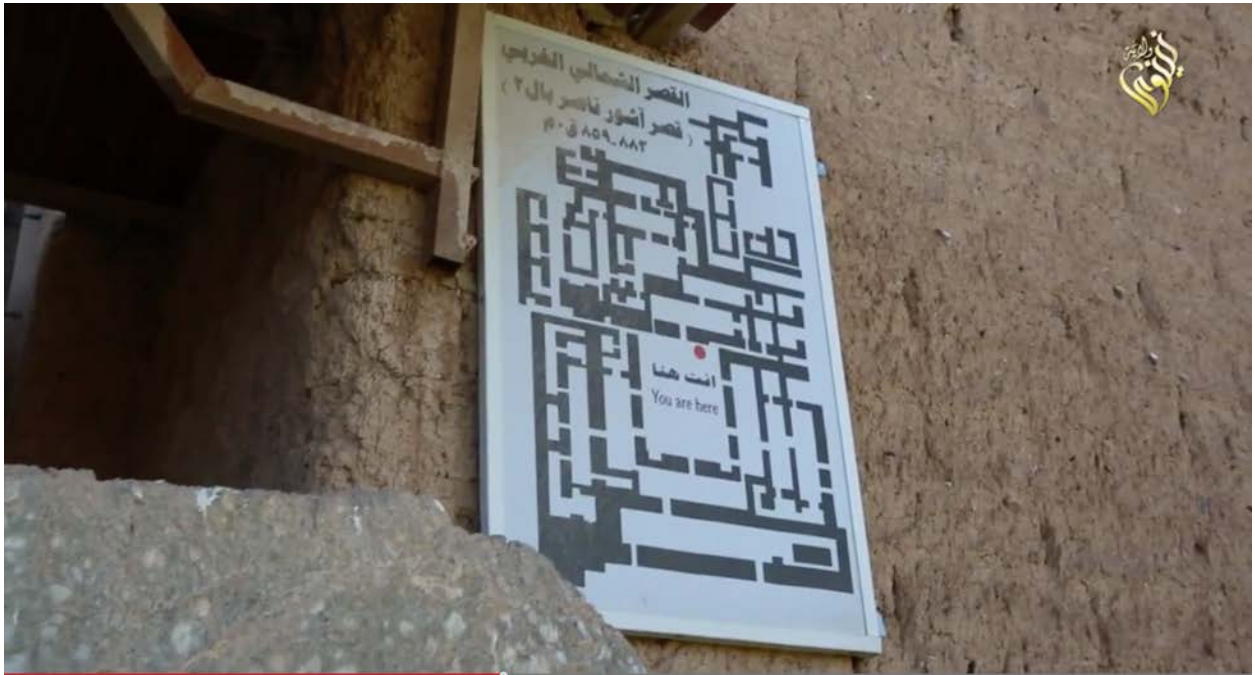
Northwest Palace, Nimrud, Iraq, map of the archaeological site (YouTube; screenshot of video posted by ISIL-associated account, showing the demolition of the Northwest Palace)