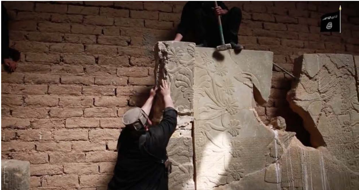
Northwest Palace, Nimrud, Iraq, ISIL militants dismantling the palace wall reliefs (YouTube; screenshot of video posted by ISIL-associated account, showing the demolition of the Northwest Palace)