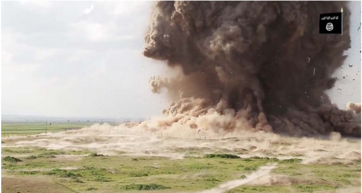
Northwest Palace, Nimrud, Iraq, detonation of the palace (YouTube; screenshot of video posted by ISIL-associated account, showing the demolition of the Northwest Palace)