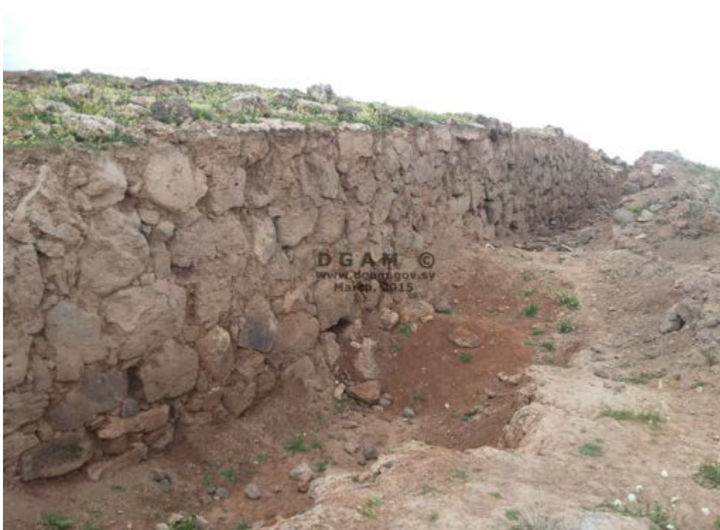
Khirbet al-Suhb (DGAM; posted April 21, 2015)