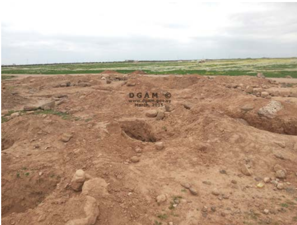
Khirbet al-Qinah (DGAM; posted April 21, 2015)