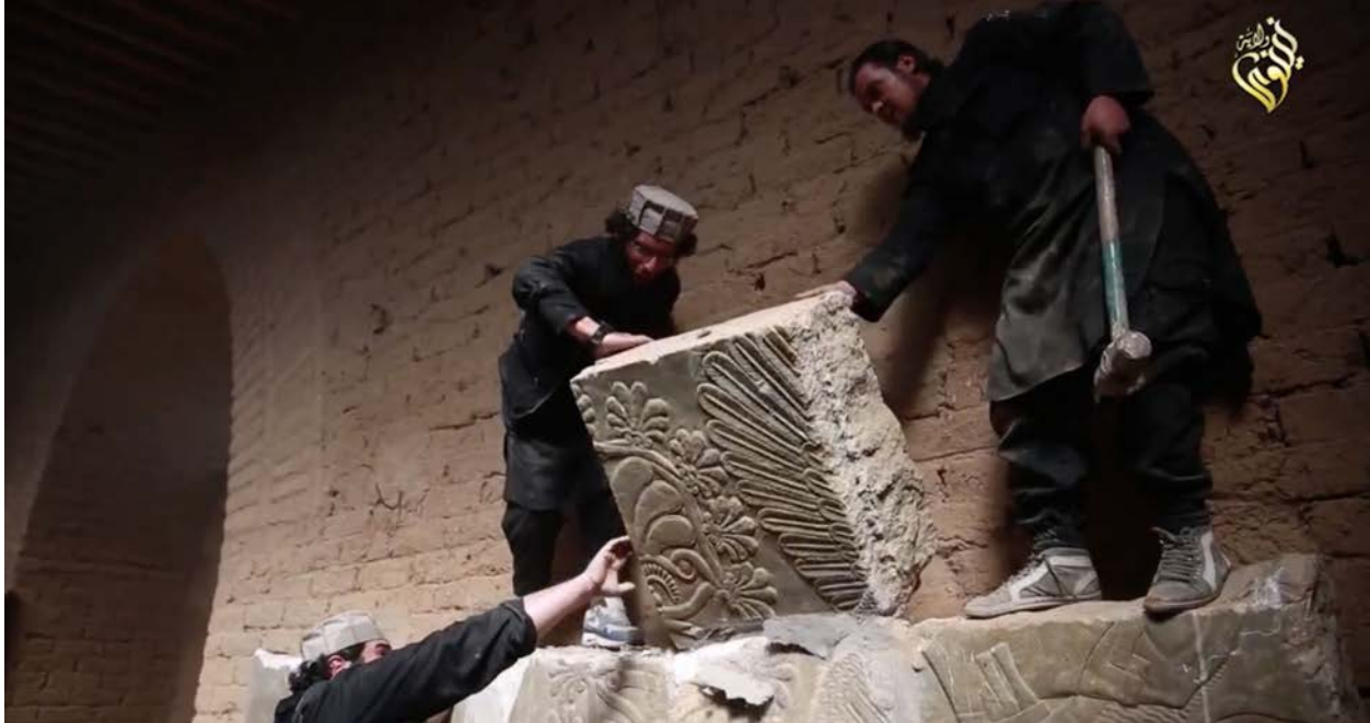
Northwest Palace, Nimrud, Iraq, ISIL militants dismantling the palace wall reliefs (YouTube; screenshot of video posted by ISIL-associated account, showing the demolition of the Northwest Palace)