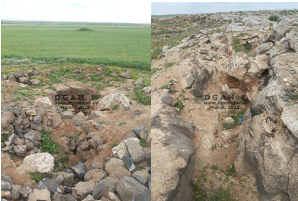
Khirbet al-Suhb (DGAM; posted April 21, 2015)