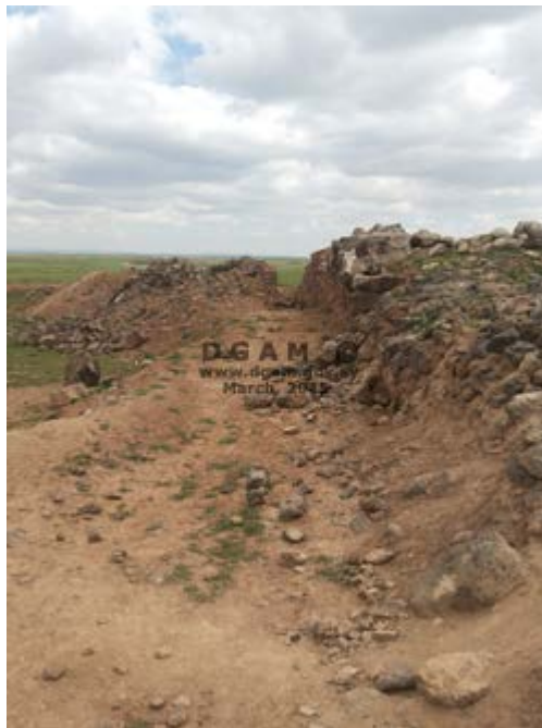
Khirbet al-Suhb (DGAM; posted April 21, 2015)