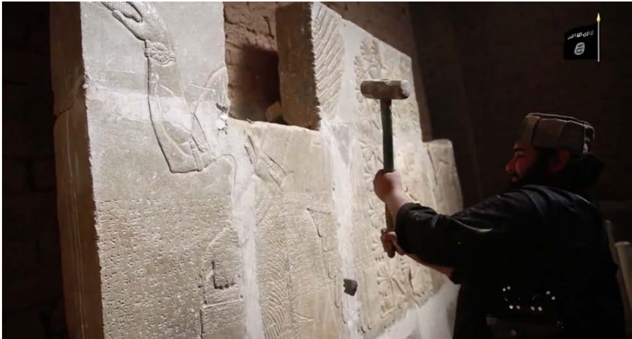
Northwest Palace, Nimrud, Iraq, ISIL militant vandalizing a palace wall relief with a sledgehammer (YouTube; screenshot of video posted by ISIL-associated account, showing the demolition of the Northwest Palace)