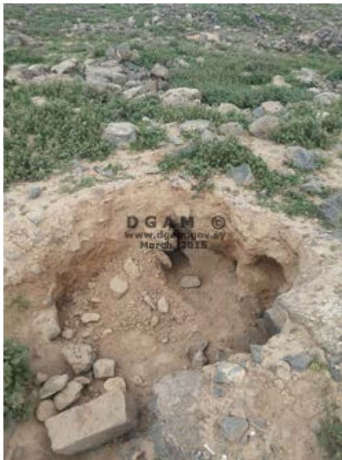
Khirbet al-Suhb (DGAM; posted April 21, 2015)