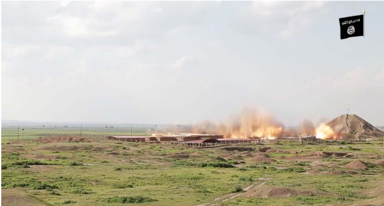
Northwest Palace, Nimrud, Iraq, detonation of the palace (YouTube; screenshot of video posted by ISIL-associated account, showing the demolition of the Northwest Palace)