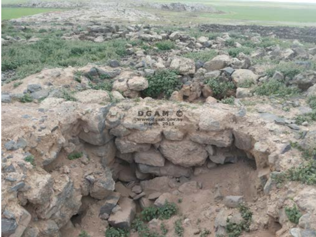
Khirbet al-Suhb (DGAM; posted April 21, 2015)