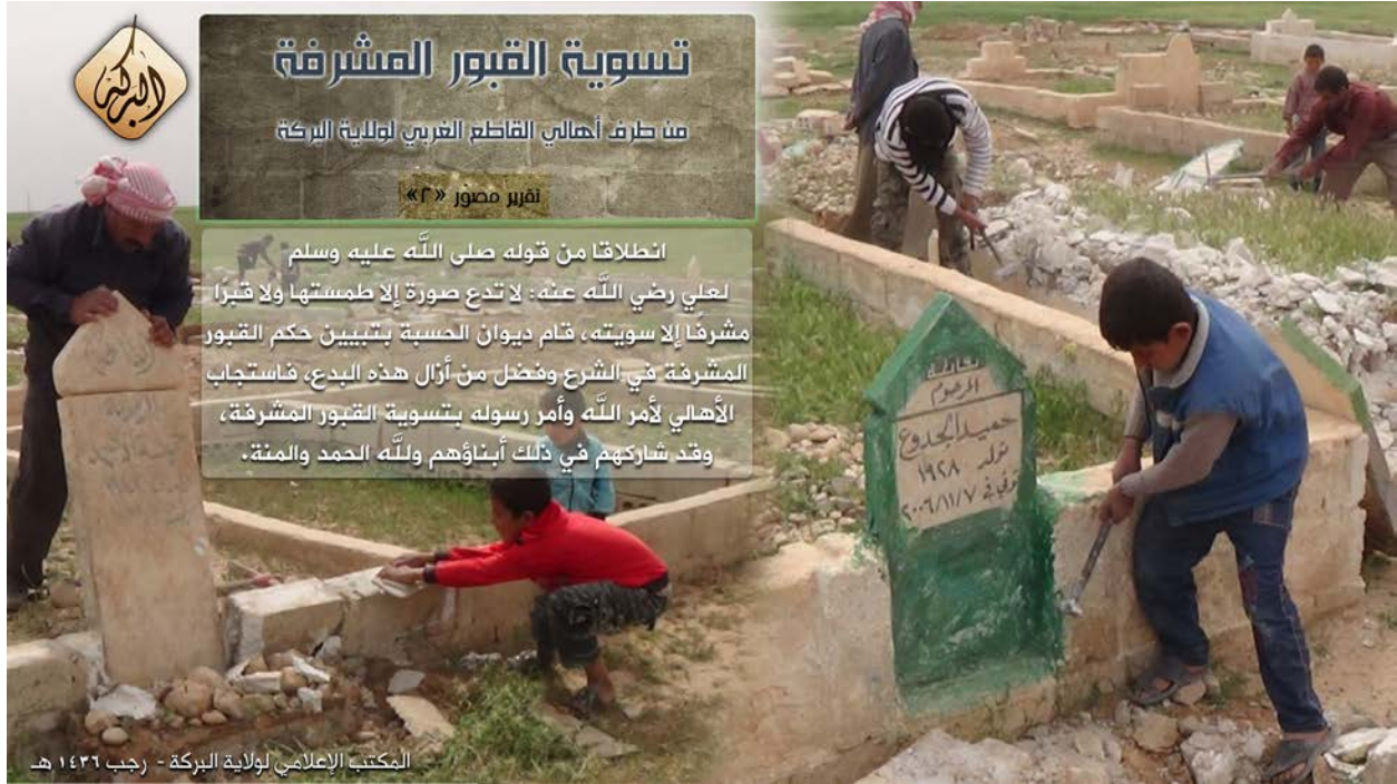
Destruction of graves in Hasakah Governorate, Syria