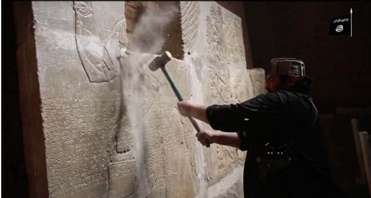
Northwest Palace, Nimrud, Iraq, ISIL militant vandalizing a palace wall relief with a sledgehammer (YouTube; screenshot of video posted by ISIL-associated account, showing the demolition of the Northwest Palace)