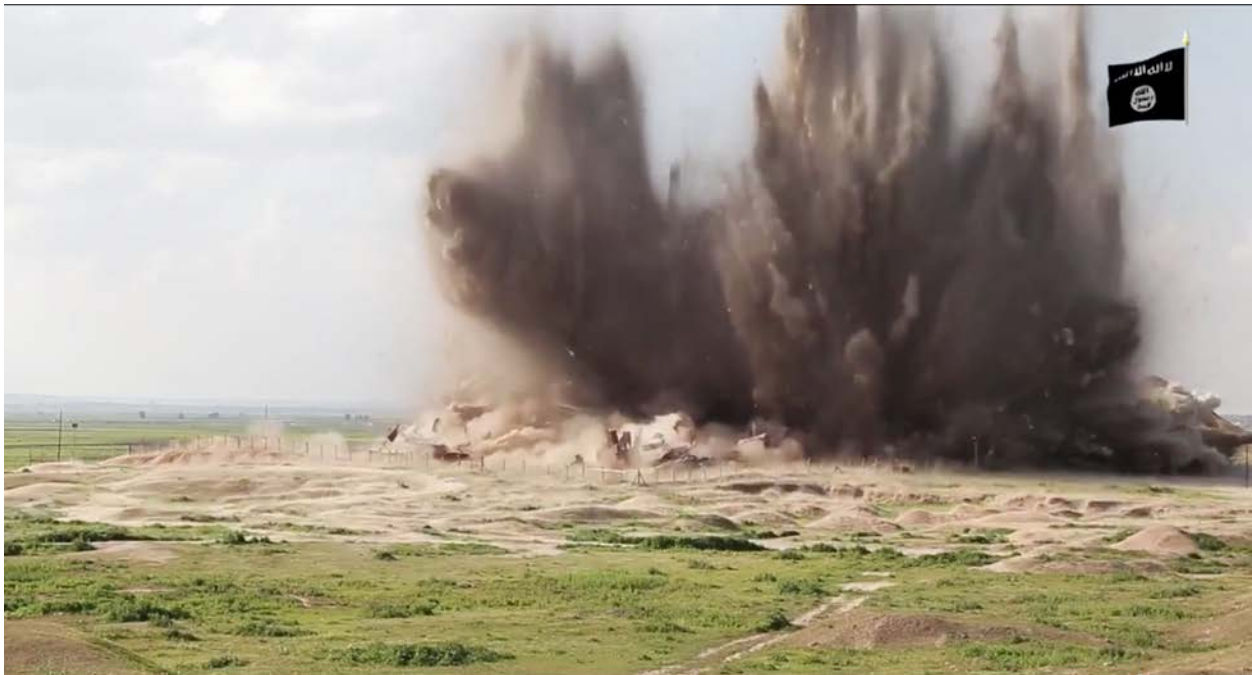
Northwest Palace, Nimrud, Iraq, detonation of the palace (YouTube; screenshot of video posted by ISIL-associated account, showing the demolition of the Northwest Palace)