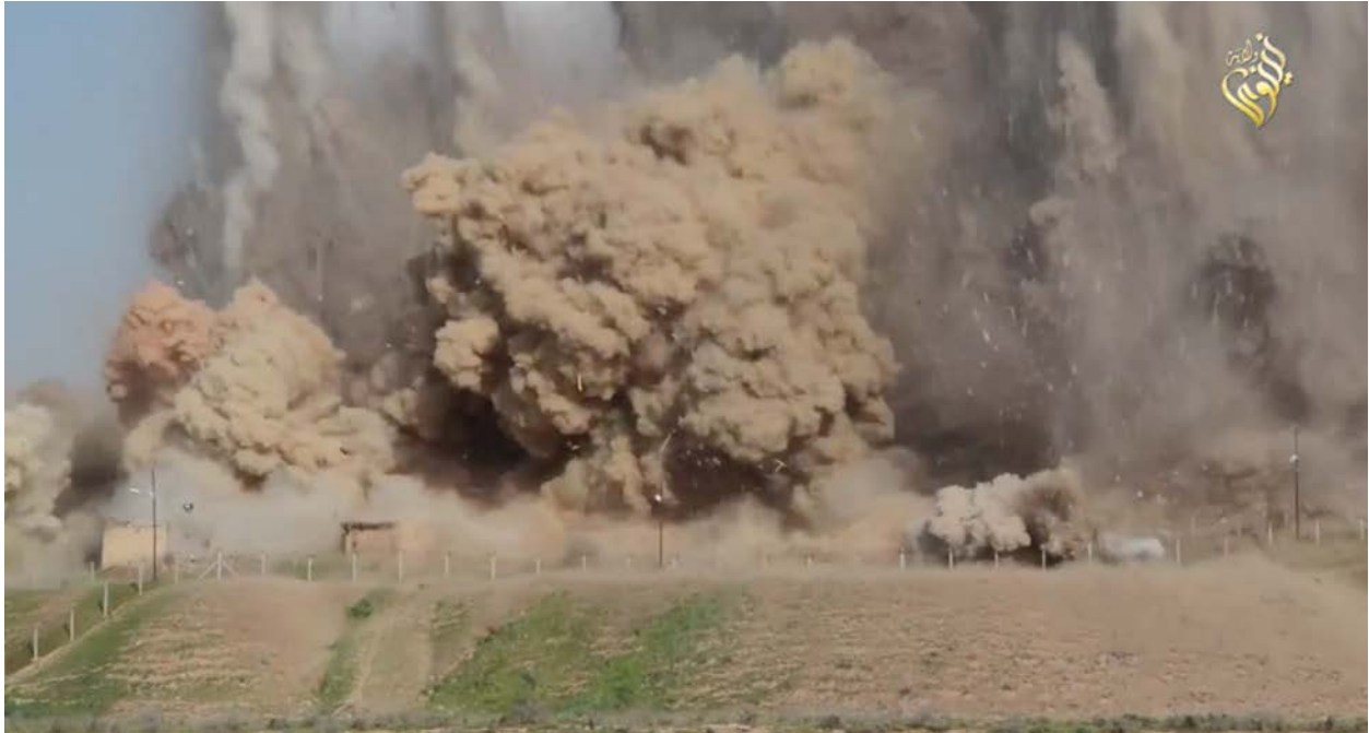
Northwest Palace, Nimrud, Iraq, detonation of the palace (YouTube; screenshot of video posted by ISIL-associated account, showing the demolition of the Northwest Palace)