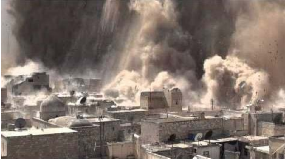
Jdeideh Quarter, Aleppo, still image from footage of tunnel bombing