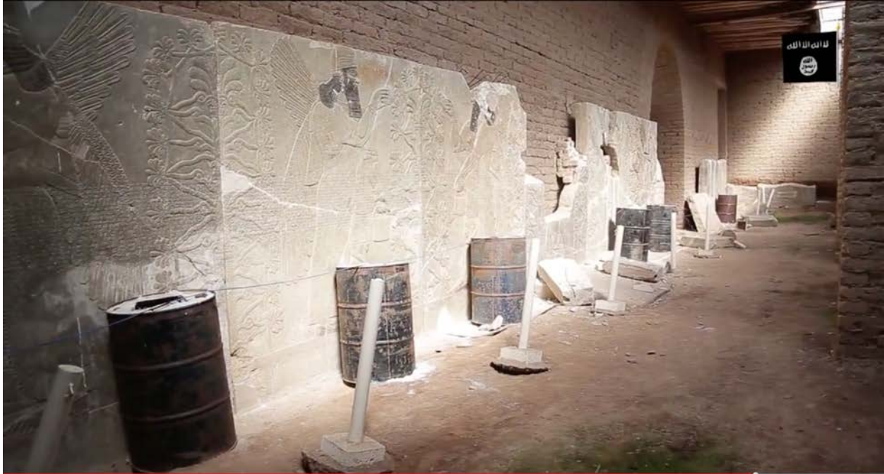
Northwest Palace, Nimrud, Iraq, barrel bombs placed next to the palace wall reliefs (YouTube; screenshot of video posted by ISIL-associated account, showing the demolition of the Northwest Palace)