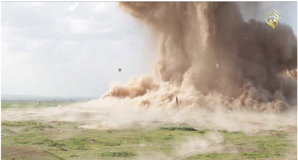
Northwest Palace, Nimrud, Iraq, detonation of the palace (YouTube; screenshot of video posted by ISIL-associated account, showing the demolition of the Northwest Palace)