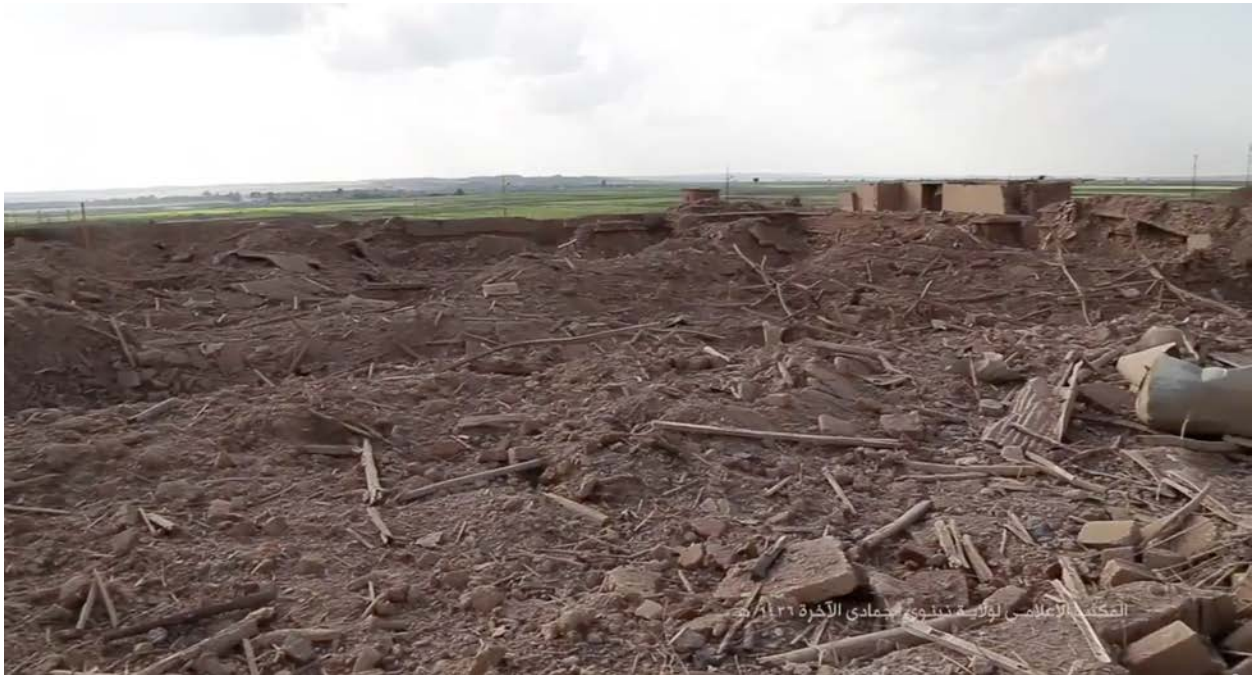
Northwest Palace, Nimrud, Iraq, following detonation (YouTube; screenshot of video posted by ISIL-associated account, showing the demolition of the Northwest Palace)