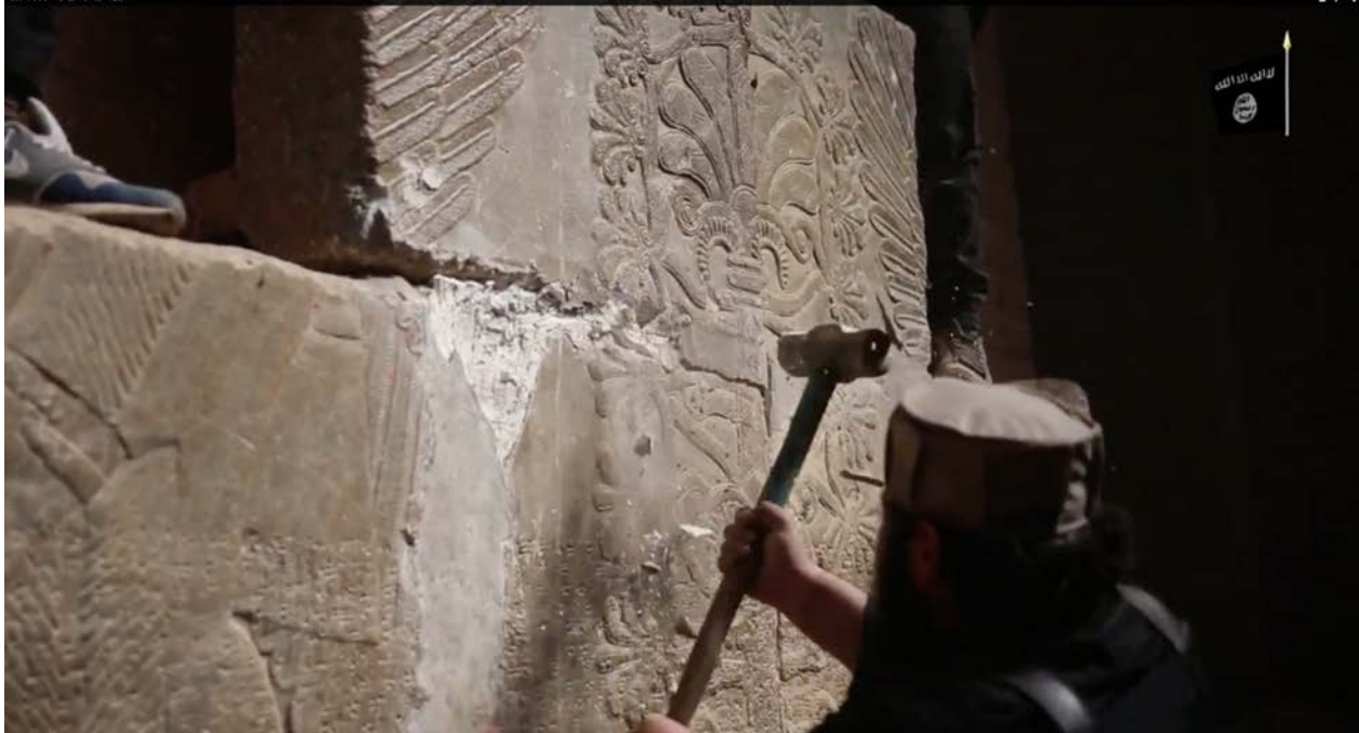
Northwest Palace, Nimrud, Iraq, ISIL militant vandalizing a palace wall relief with a sledgehammer (YouTube; screenshot of video posted by ISIL-associated account, showing the demolition of the Northwest Palace)