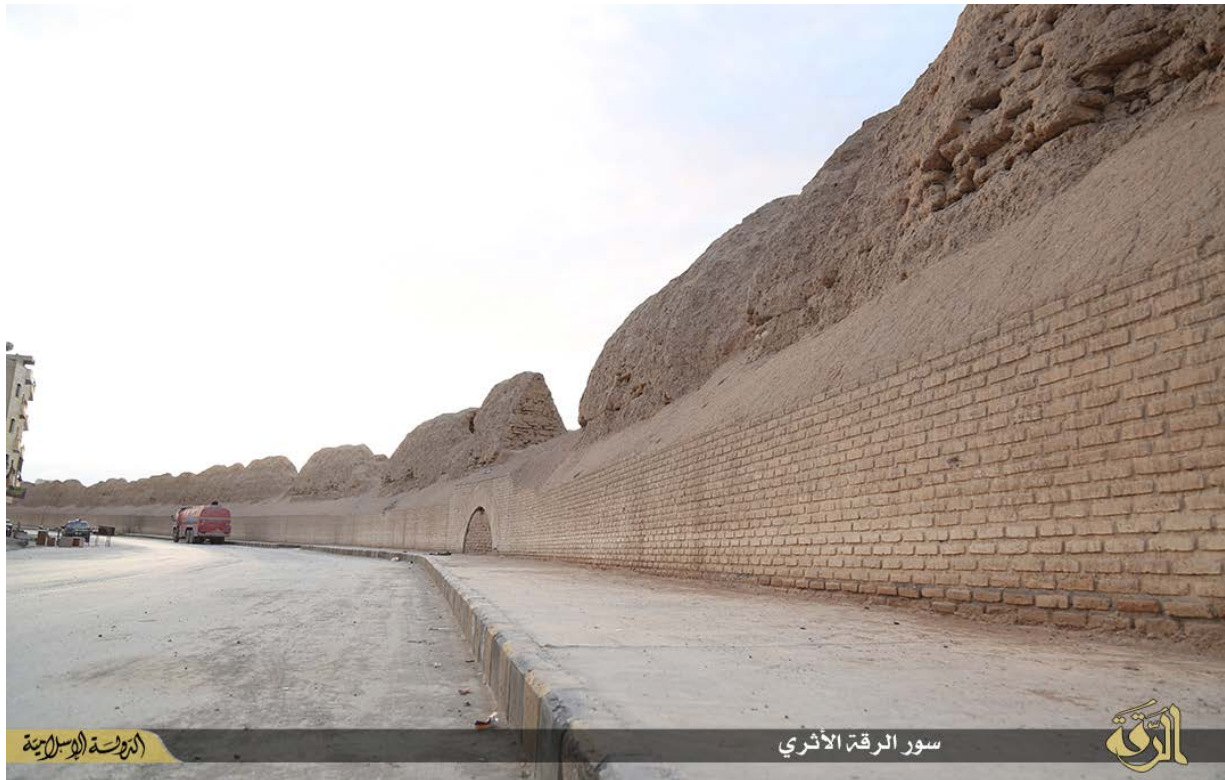
City wall of Rafiqa (APSA; posted March 22, 2015; originally posted by ISIL)