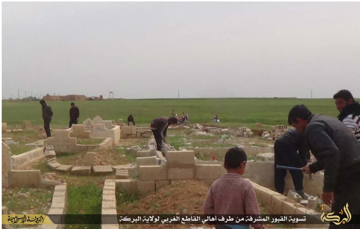
Destruction of graves in Hasakah Governorate, Syria (Dump.to; posted April 23, 2015)