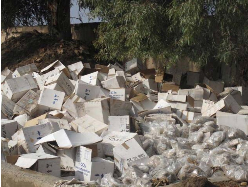
Tell Sabi Abyad storehouse, garbage pile where boxes and bags of archaeological material kept in the storehouse have been dumped