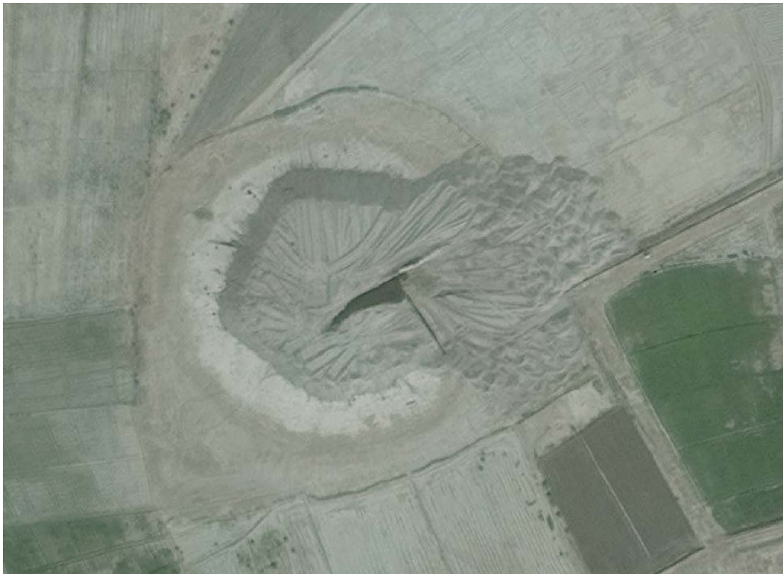
Tell el-Madquq, conical crown of the mound removed and leveled (ASOR CHI; DigitalGlobe, image dates to April 11, 2015)