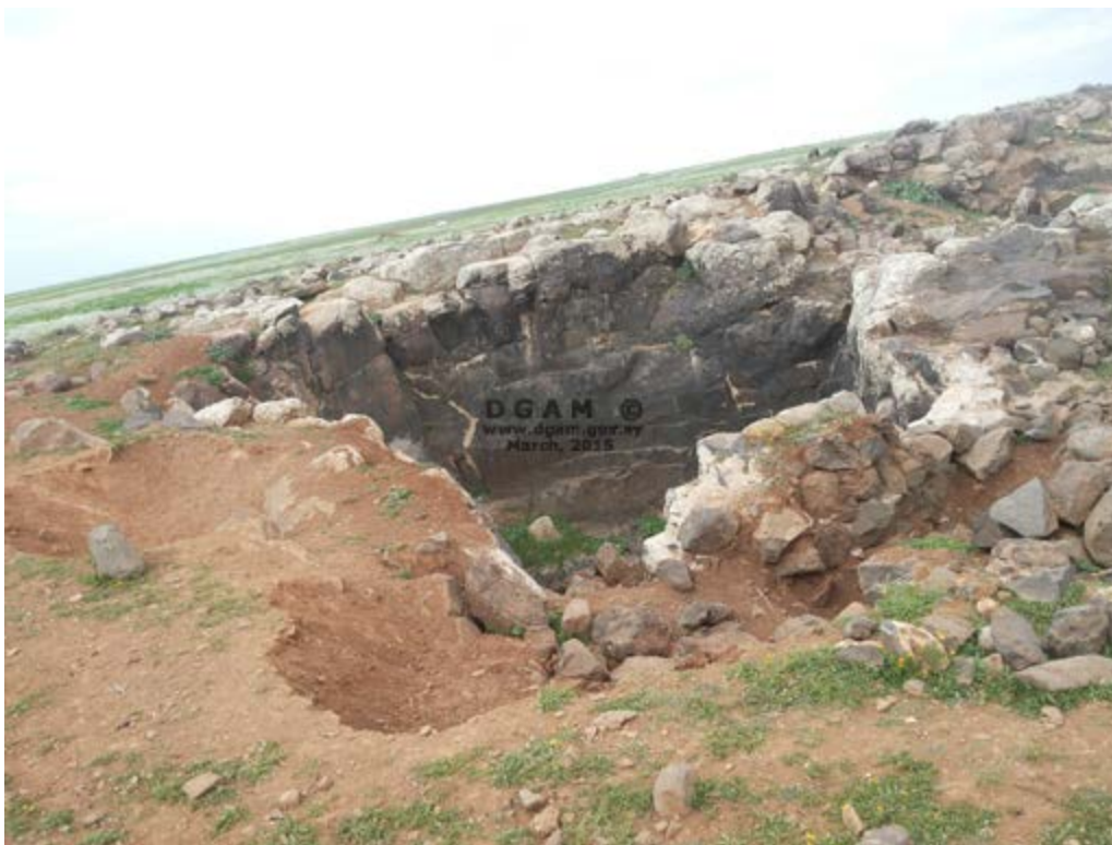
Khirbet al-Suhb (DGAM; posted April 21, 2015)