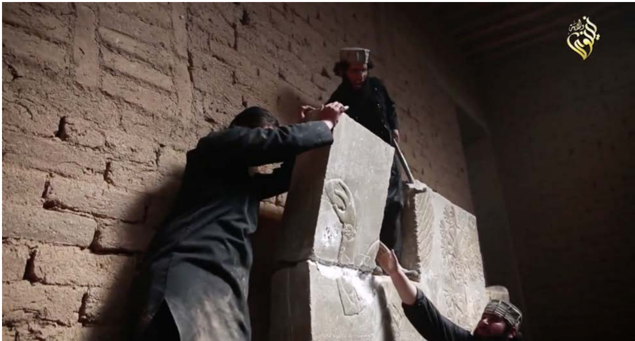
Northwest Palace, Nimrud, Iraq, ISIL militants dismantling the palace wall reliefs (YouTube; screenshot of video posted by ISIL-associated account, showing the demolition of the Northwest Palace)