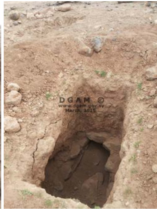
Khirbet al-Qinah (DGAM; posted April 21, 2015)