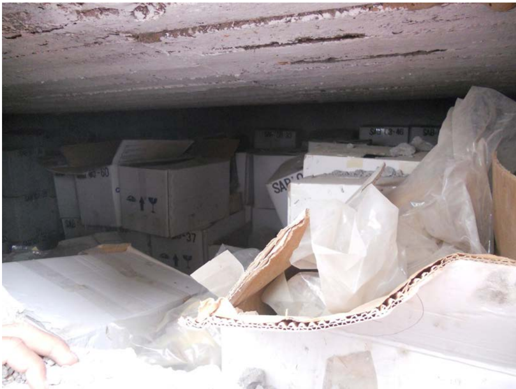
Tell Sabi Abyad storehouse, interior