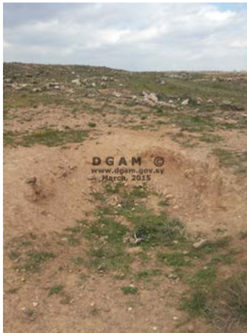
Khirbet al-Suhb (DGAM; posted April 21, 2015)