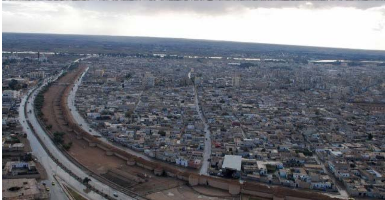
City wall of Rafiq, Raqq, Syria, showing location of the most recent damage to the wall