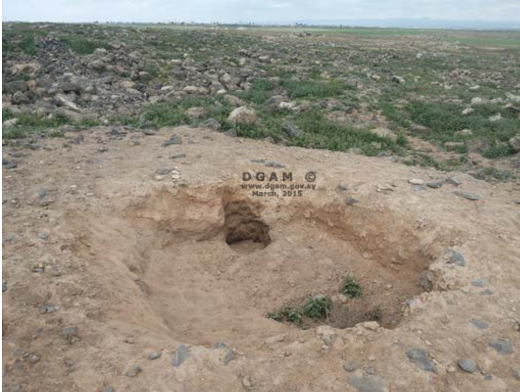
Khirbet al-Suhb (DGAM; posted April 21, 2015)