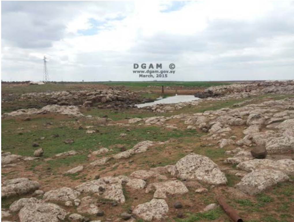
Khirbet al-Qinah (DGAM; posted April 21, 2015)