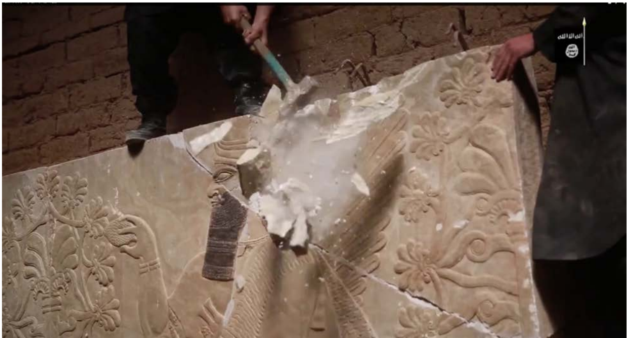
Northwest Palace, Nimrud, Iraq, ISIL militants vandalizing a palace wall relief with a sledgehammer (YouTube; screenshot of video posted by ISIL-associated account, showing the demolition of the Northwest Palace)