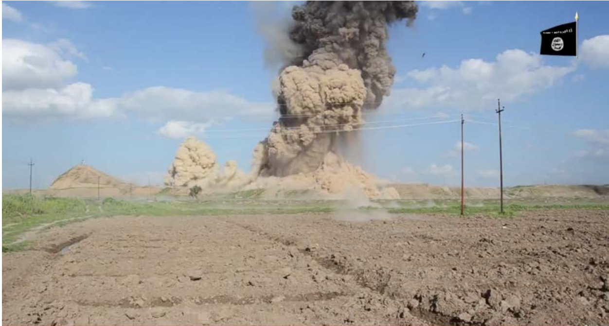
Northwest Palace, Nimrud, Iraq, detonation of the palace (YouTube; screenshot of video posted by ISIL-associated account, showing the demolition of the Northwest Palace)