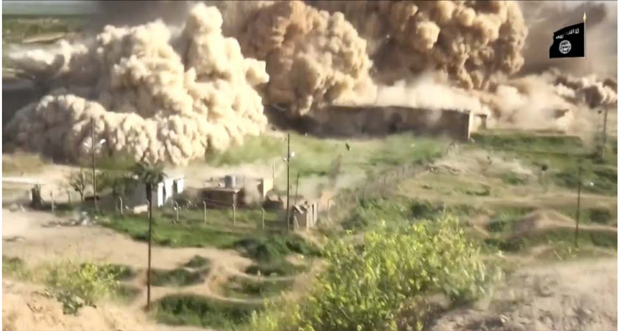
Northwest Palace, Nimrud, Iraq, detonation of the palace (YouTube; screenshot of video posted by ISIL-associated account, showing the demolition of the Northwest Palace)