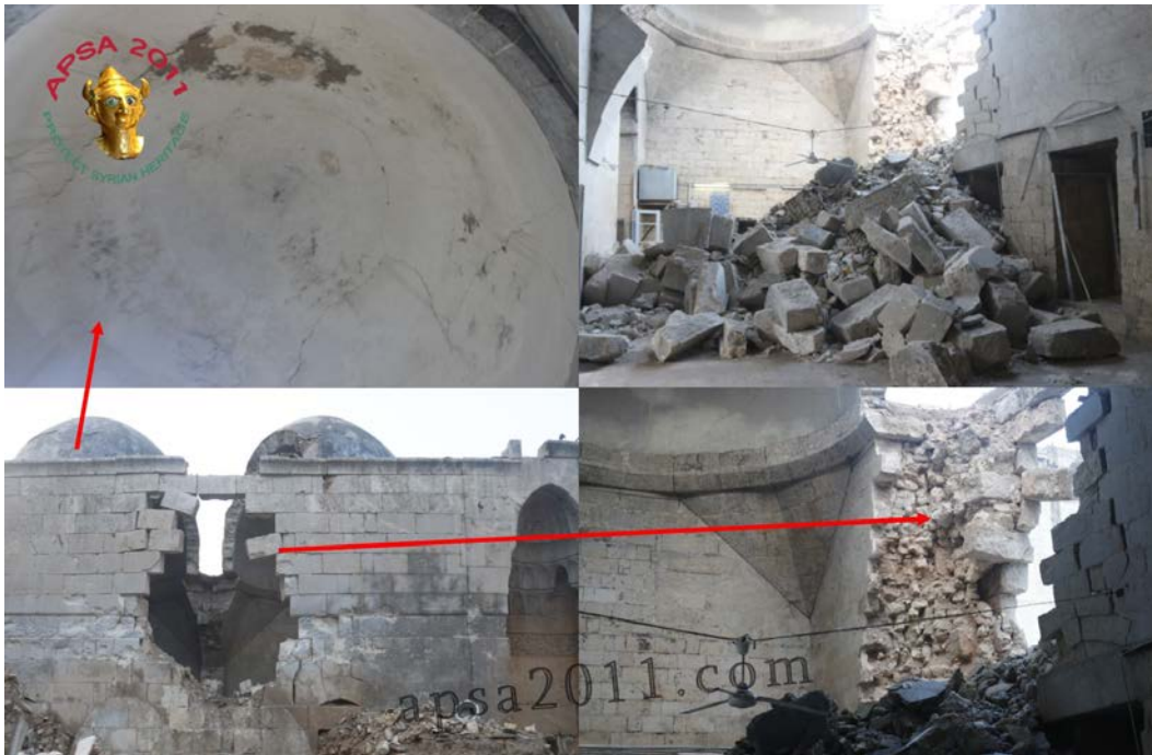
Interior of the Madrasa Firdows in Aleppo (APSA).