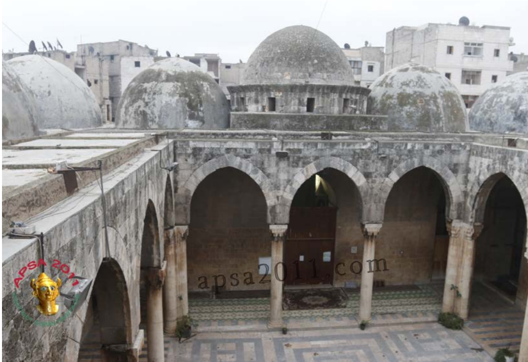
Interior of the Madrasa Firdows in Aleppo (APSA).