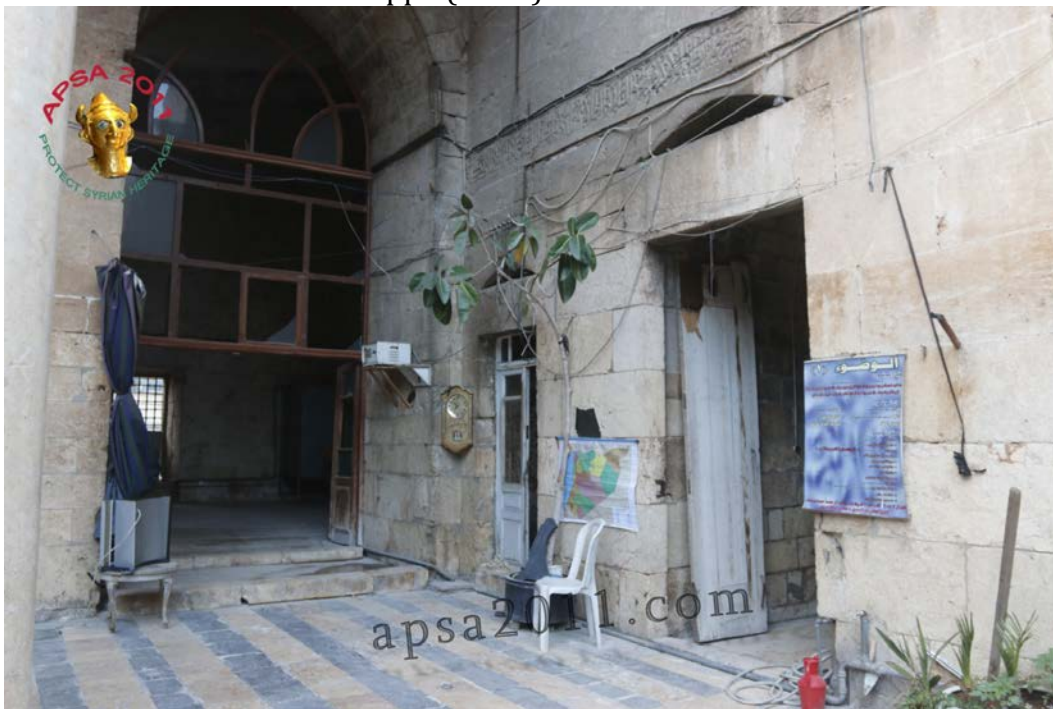
Interior of the Madrasa Firdows in Aleppo (APSA).