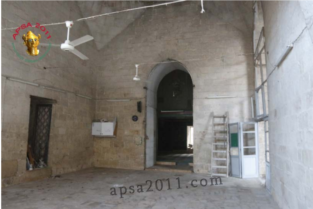
Interior of the Madrasa Firdows in Aleppo (APSA).