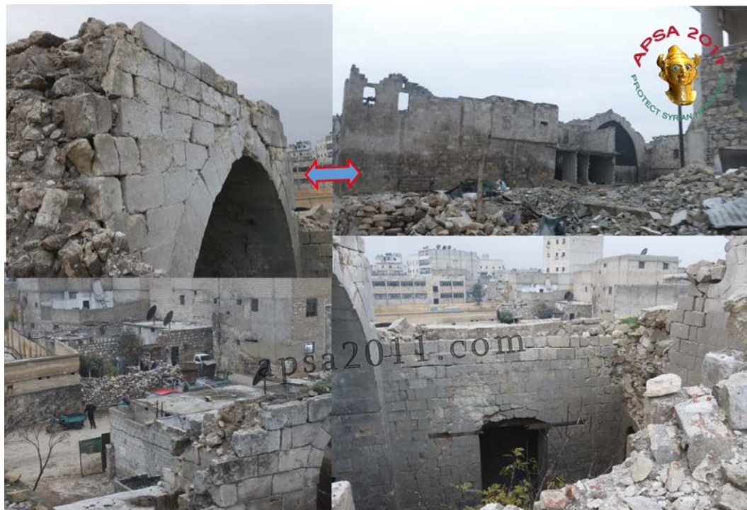
The Madrasa Firdows in Aleppo (APSA).