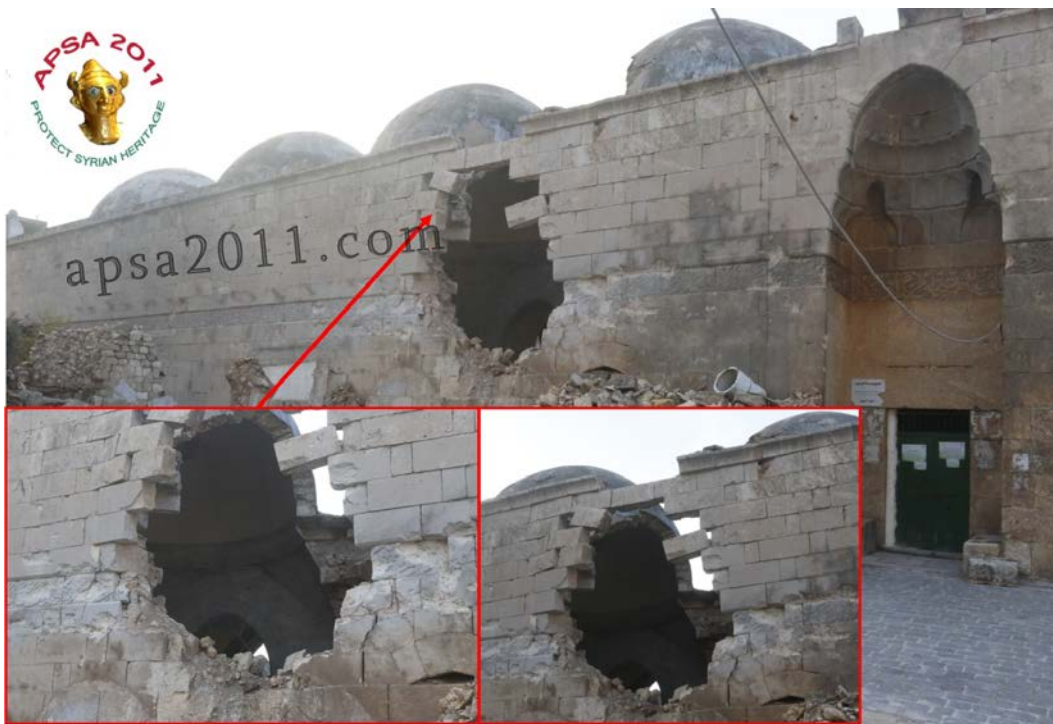
The Madrasa Firdows in Aleppo (APSA).