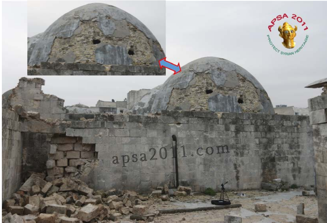
The Madrasa Firdows in Aleppo (APSA).