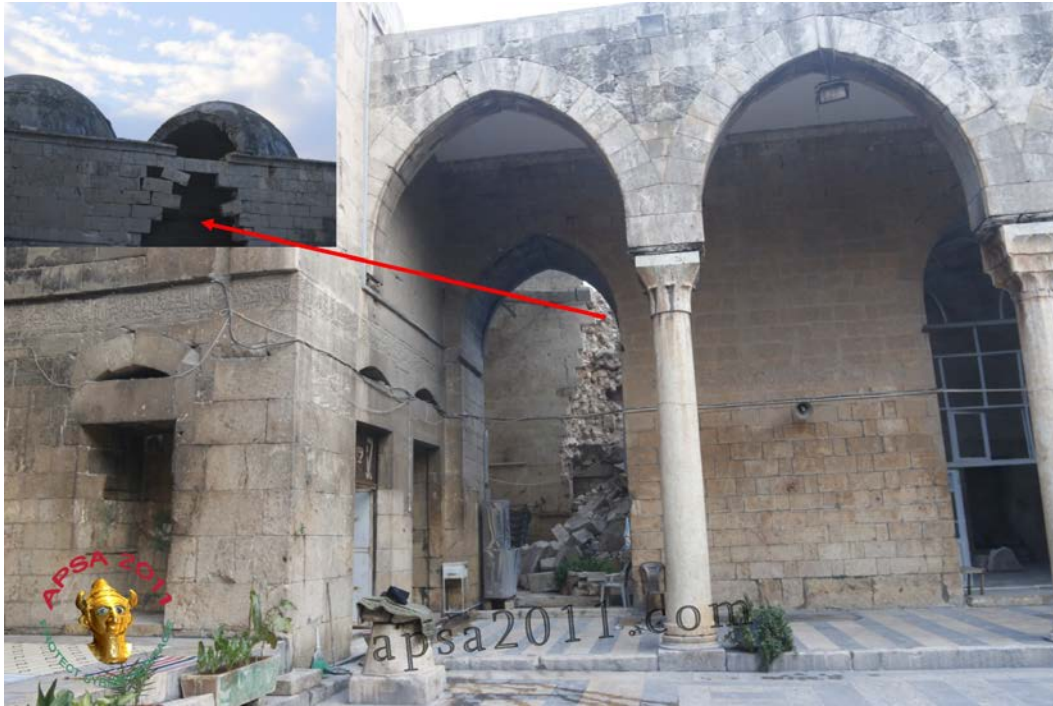
Interior of the Madrasa Firdows in Aleppo (APSA).