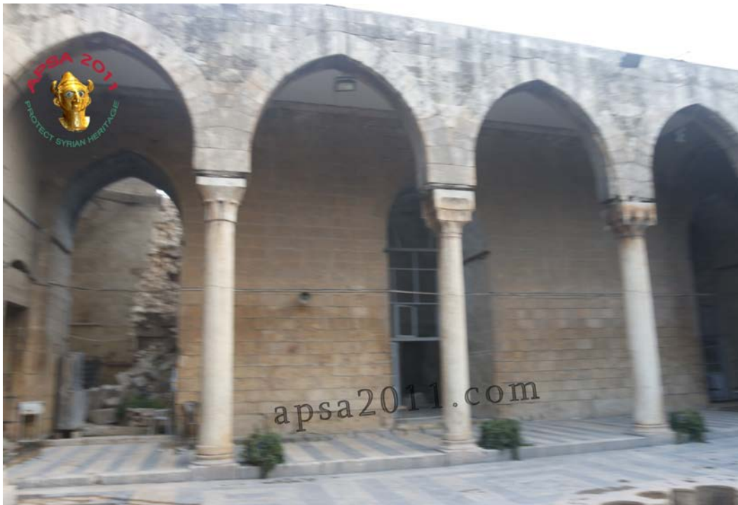
Interior of the Madrasa Firdows in Aleppo (APSA).