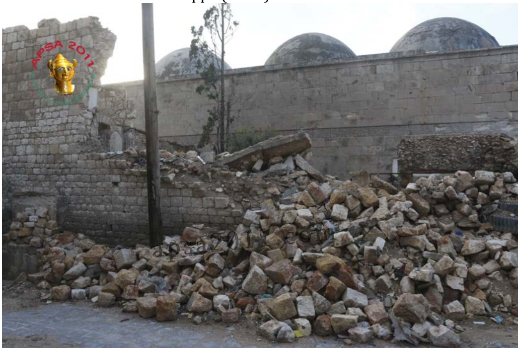
The Madrasa Firdows in Aleppo (APSA).