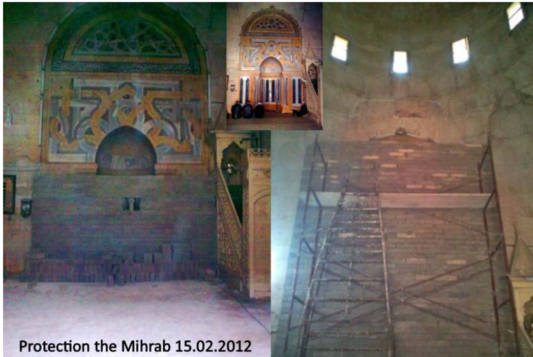
Protection the Mihrab 15.02.2012 Mihrab of the Madrasa Firdows in Aleppo.