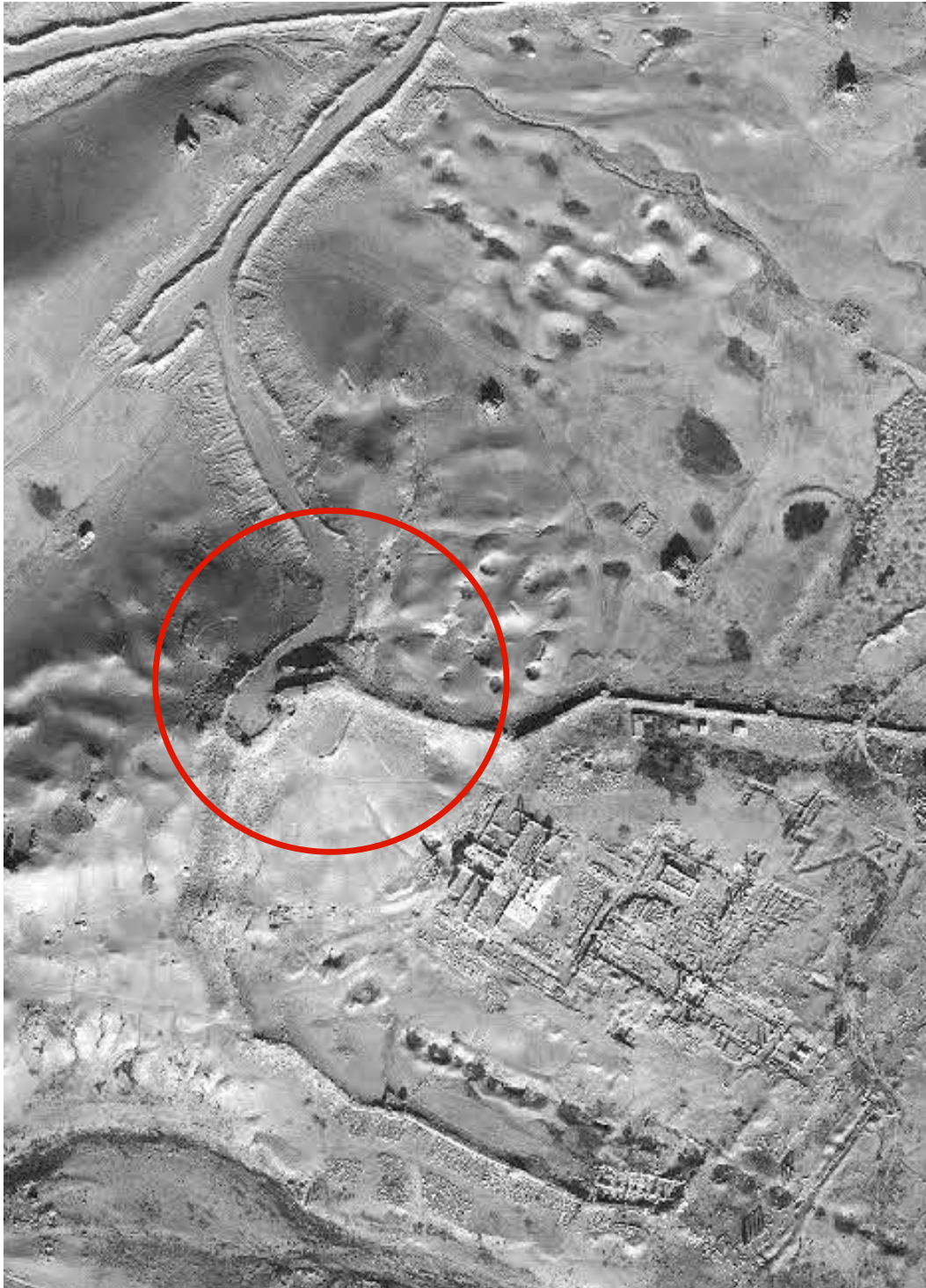
Digital Globe image from December 19, 2014 showing one of the military installations at Palmyra near the Camp of Diocletian (Digital Globe 2014).