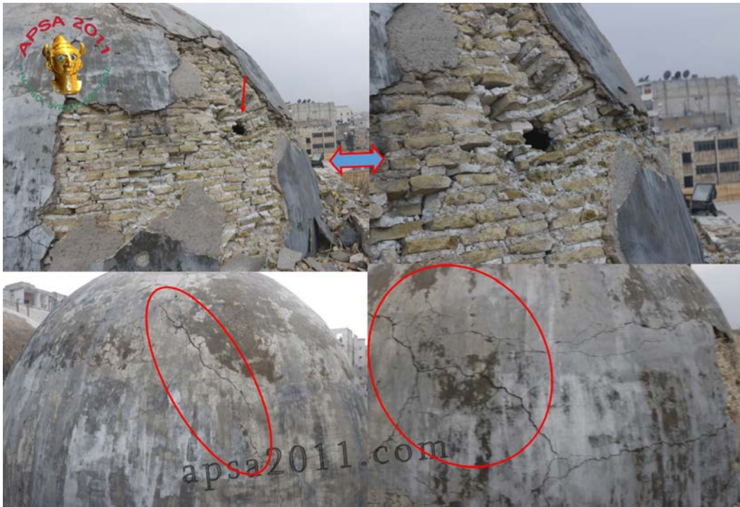
The Madrasa Firdows in Aleppo.