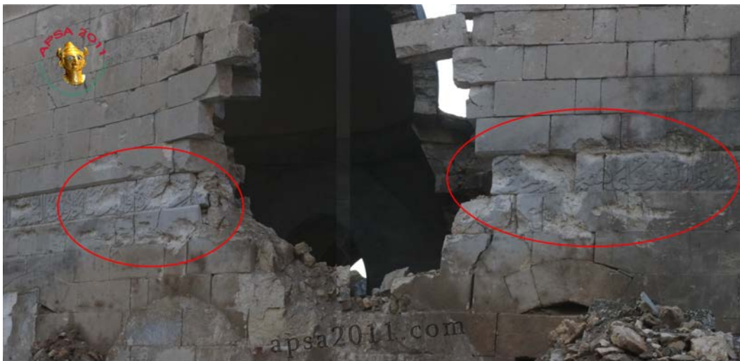
The Madrasa Firdows in Aleppo showing damage to the inscriptions.