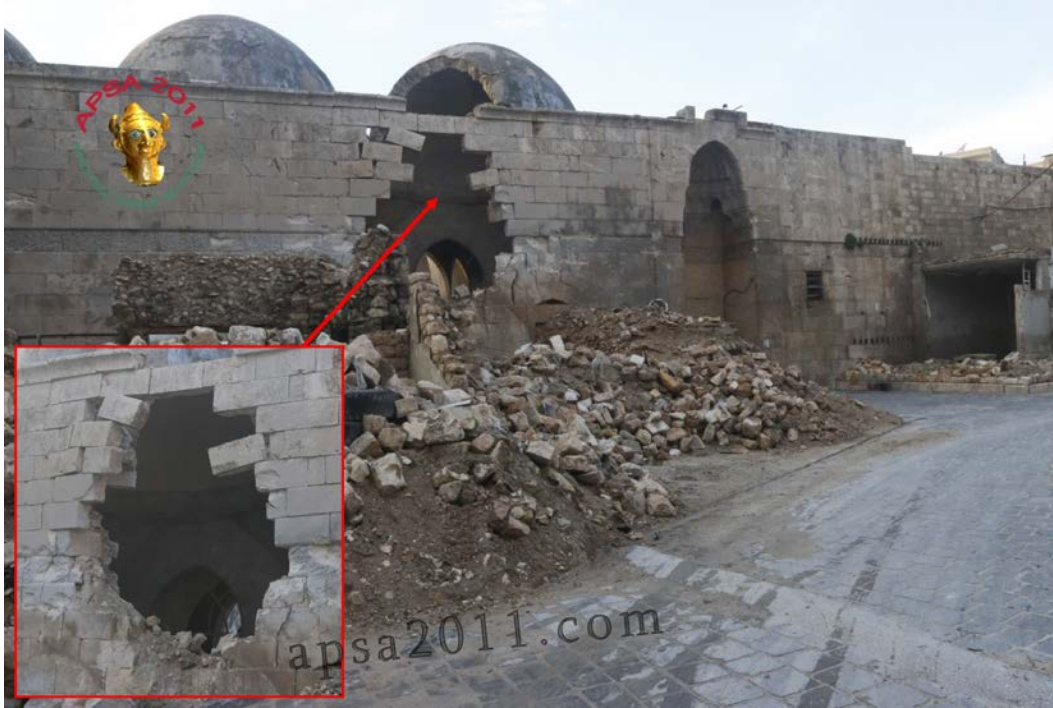
The Madrasa Firdows in Aleppo (APSA).