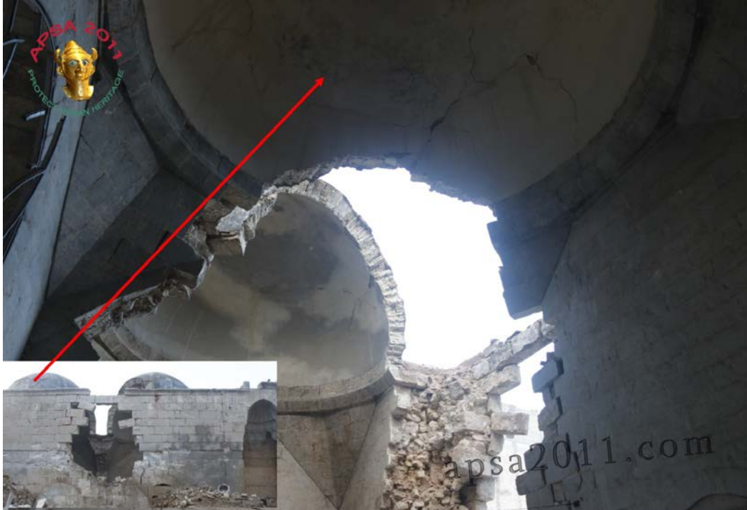
Interior of the Madrasa Firdows in Aleppo (APSA).