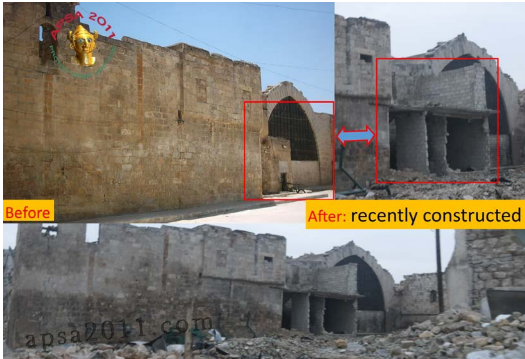
Iwan of the Madrasa Firdows in Aleppo.