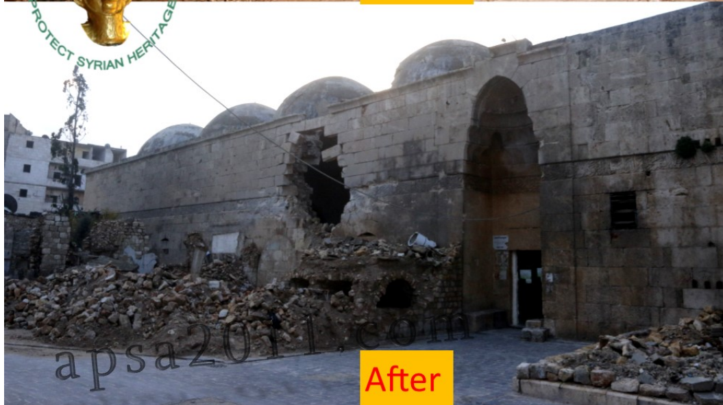
The Madrasa Firdows in Aleppo (APSA).