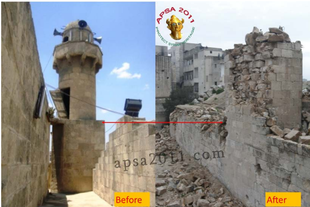
Minaret of the Madrasa Firdows in Aleppo (APSA).