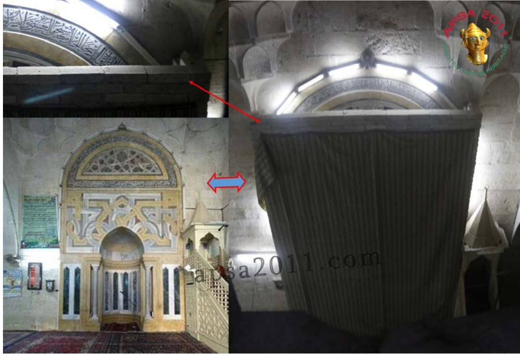
Interior of the Madrasa Firdows in Aleppo.