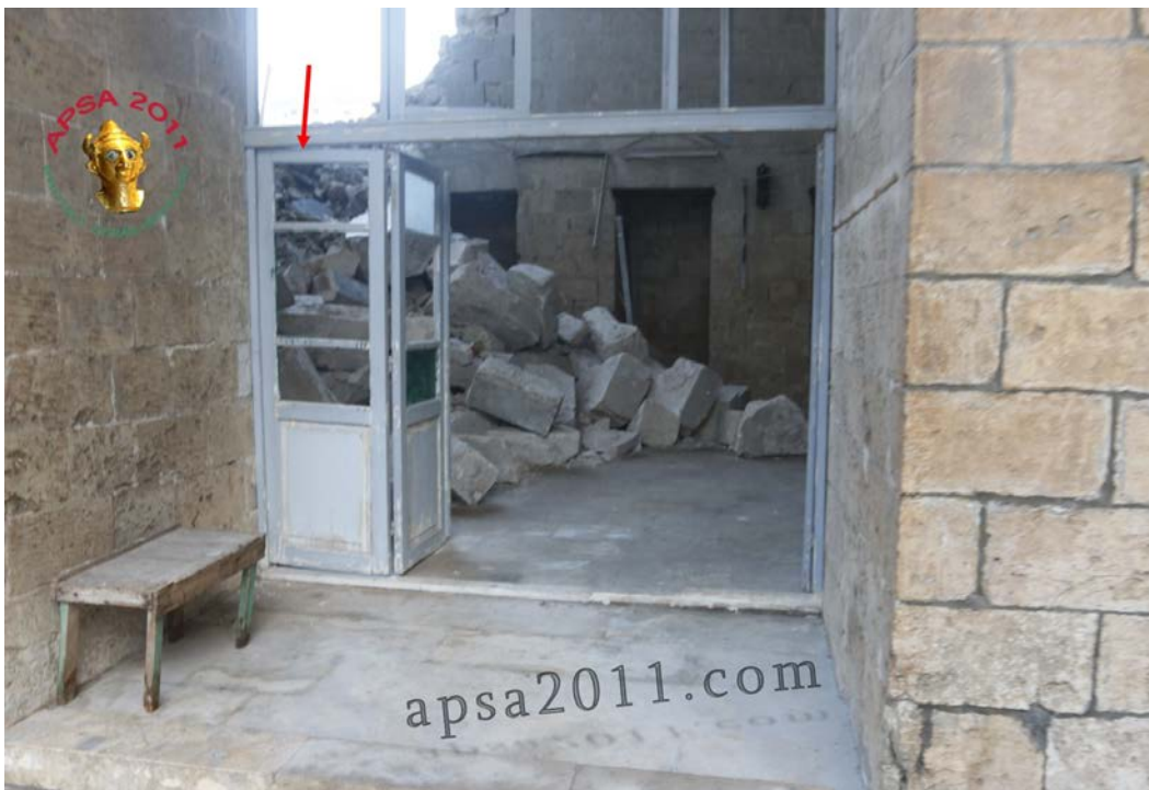
Interior of the Madrasa Firdows in Aleppo (APSA).