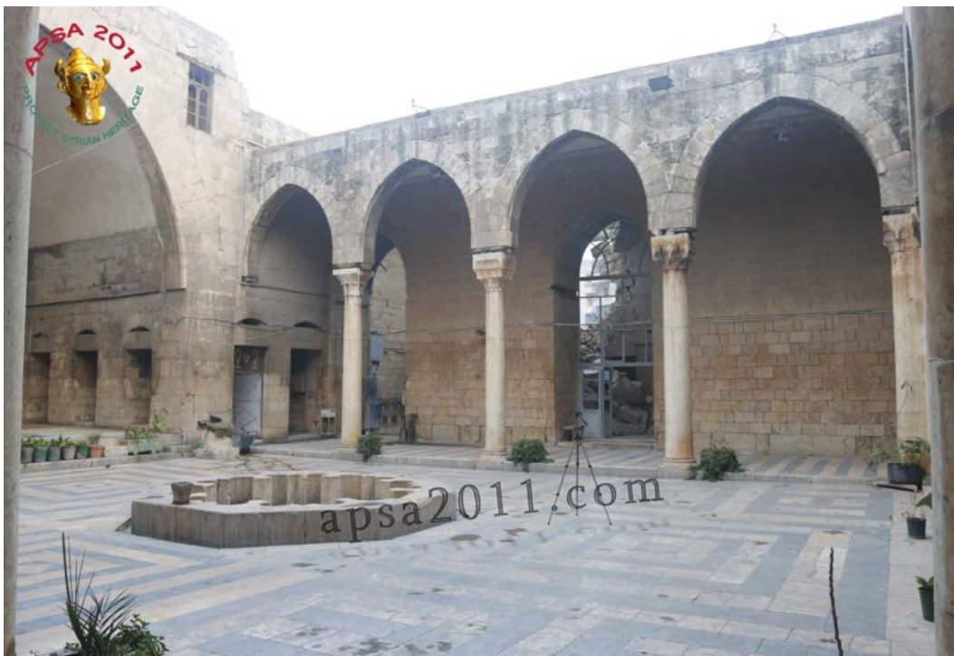
Interior of the Madrasa Firdows in Aleppo (APSA).