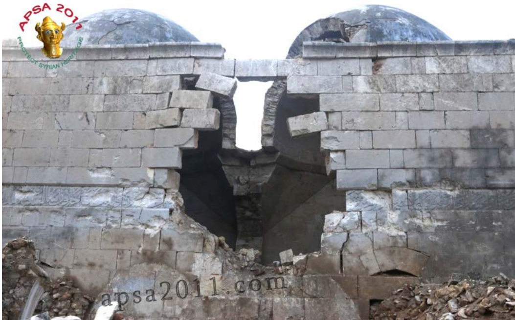
The Madrasa Firdows in Aleppo — the structure has 11 domes (APSA).