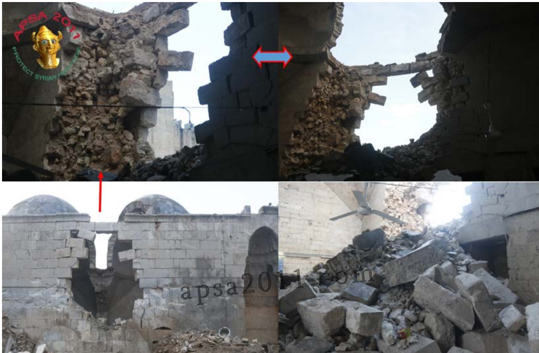
Interior of the Madrasa Firdows in Aleppo (APSA).