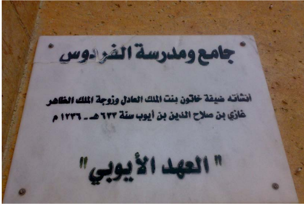
The Madrasa Firdows in Aleppo (APSA).