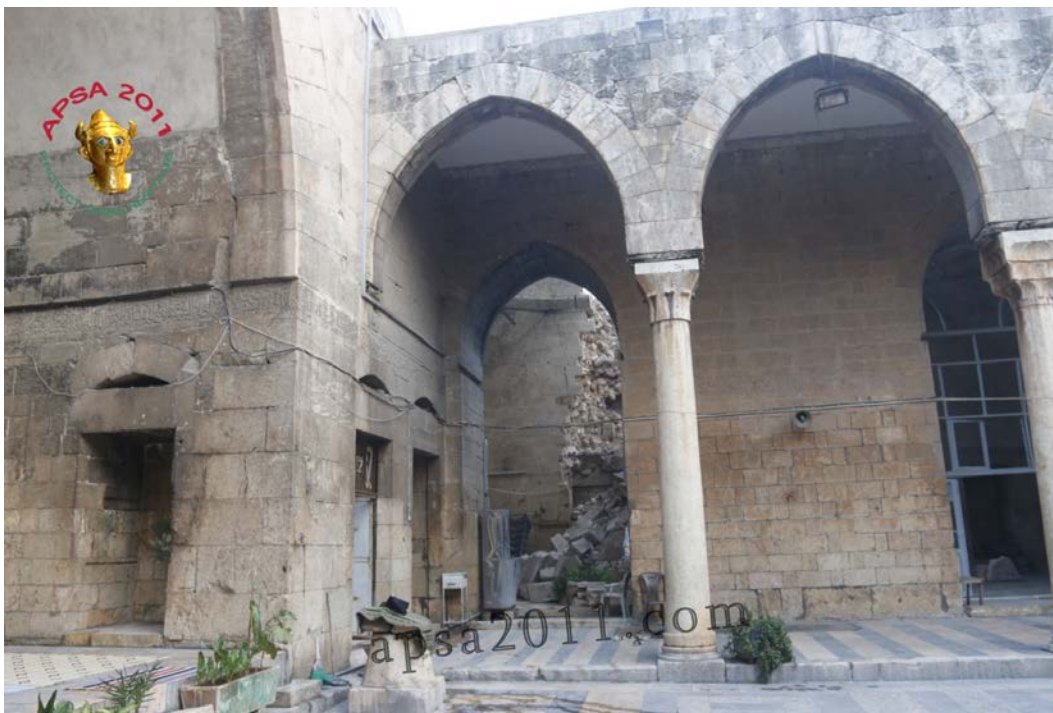
Interior of the Madrasa Firdows in Aleppo (APSA).