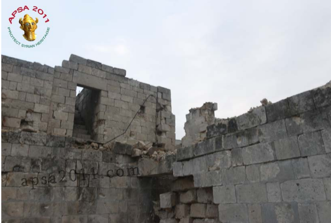
The Madrasa Firdows in Aleppo (APSA).