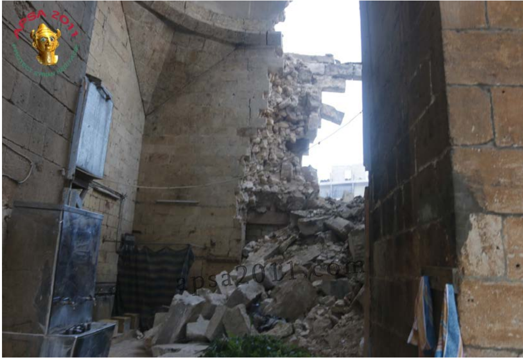
Interior of the Madrasa Firdows in Aleppo (APSA).