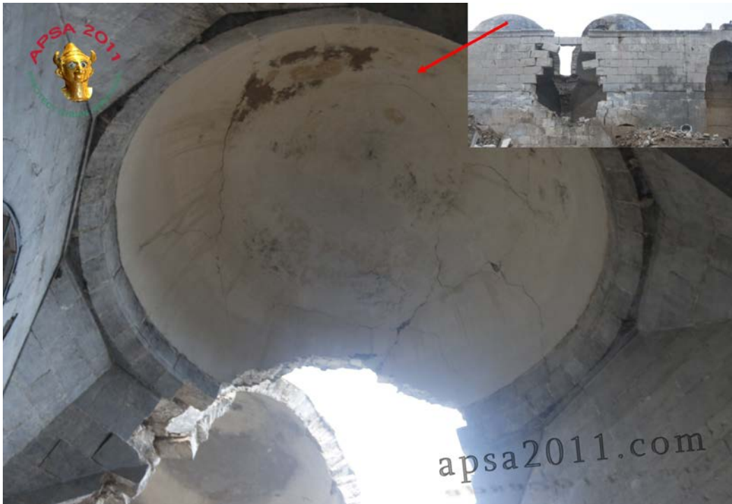
Interior of the Madrasa Firdows in Aleppo (APSA).