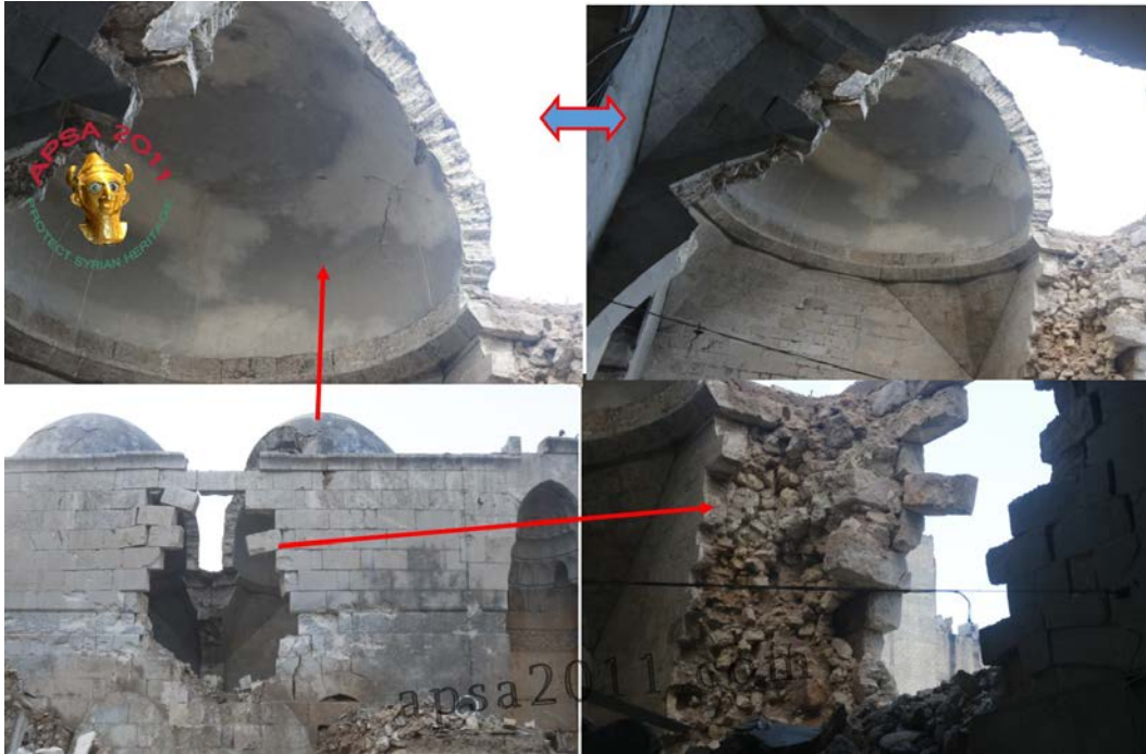
Interior of the Madrasa Firdows in Aleppo.