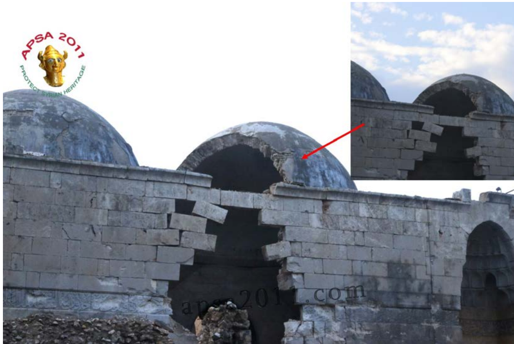
The Madrasa Firdows in Aleppo (APSA).