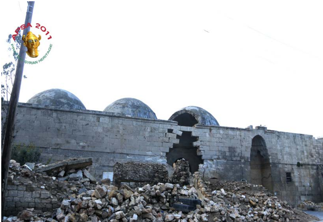
The Madrasa Firdows in Aleppo (APSA).