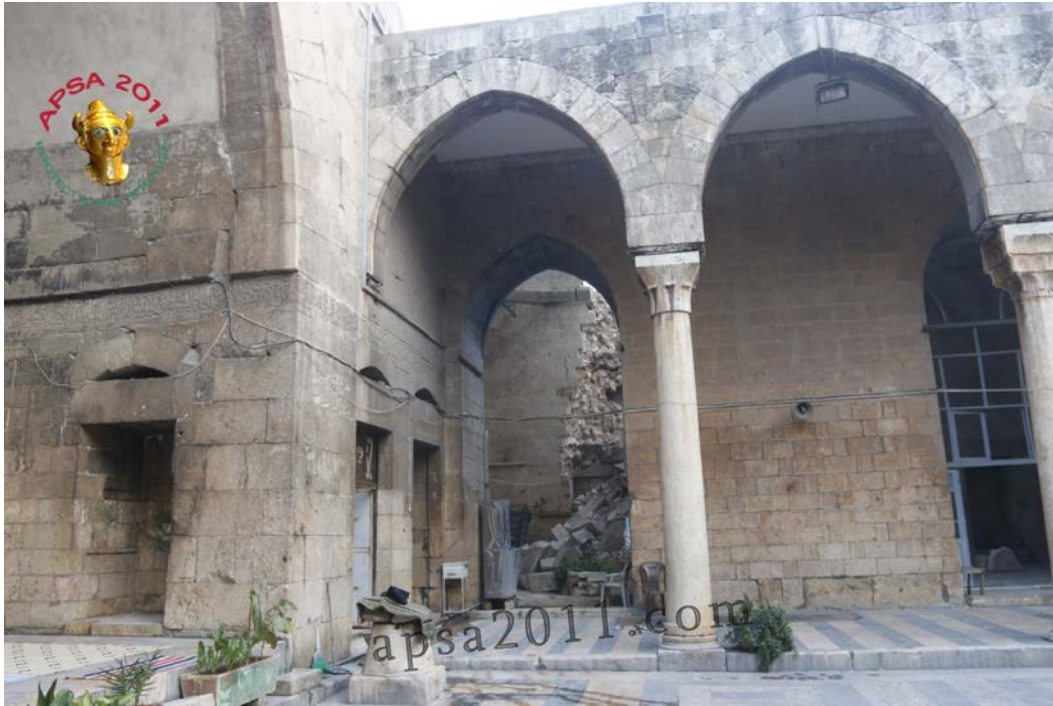
Interior of the Madrasa Firdows in Aleppo (APSA).