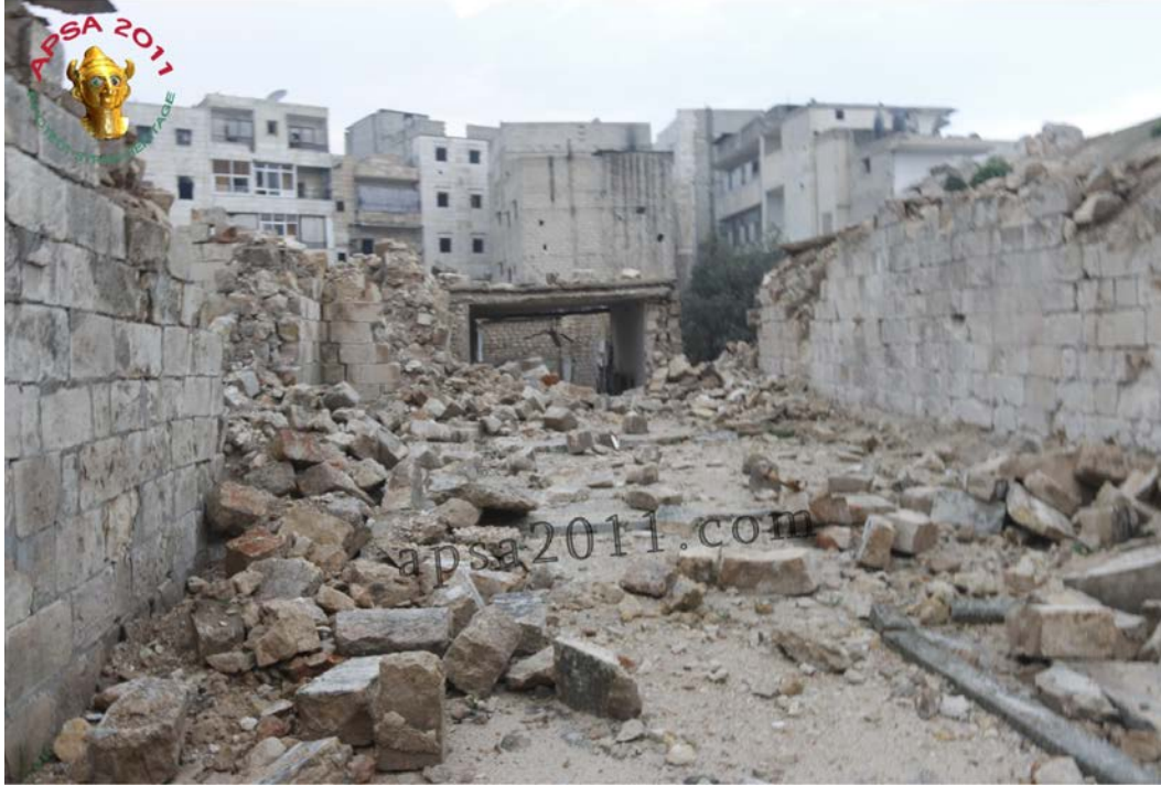
The Madrasa Firdows in Aleppo (APSA).