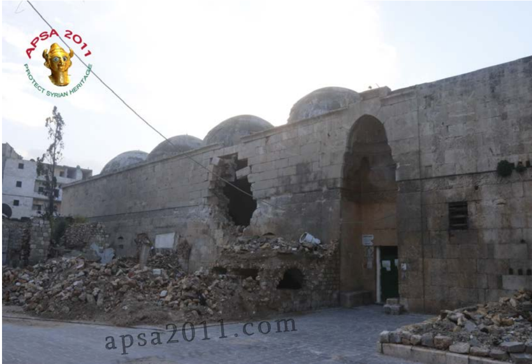
The Madrasa Firdows in Aleppo (APSA).