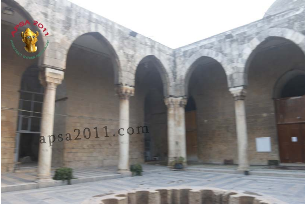
Interior of the Madrasa Firdows in Aleppo (APSA).