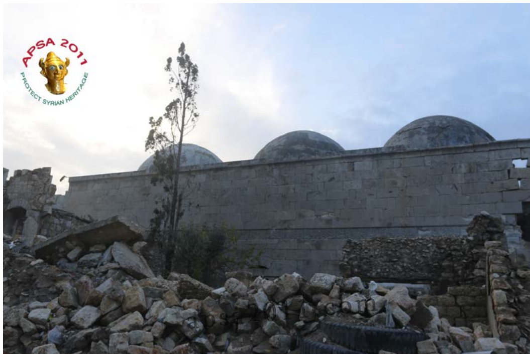
The Madrasa Firdows in Aleppo (APSA).