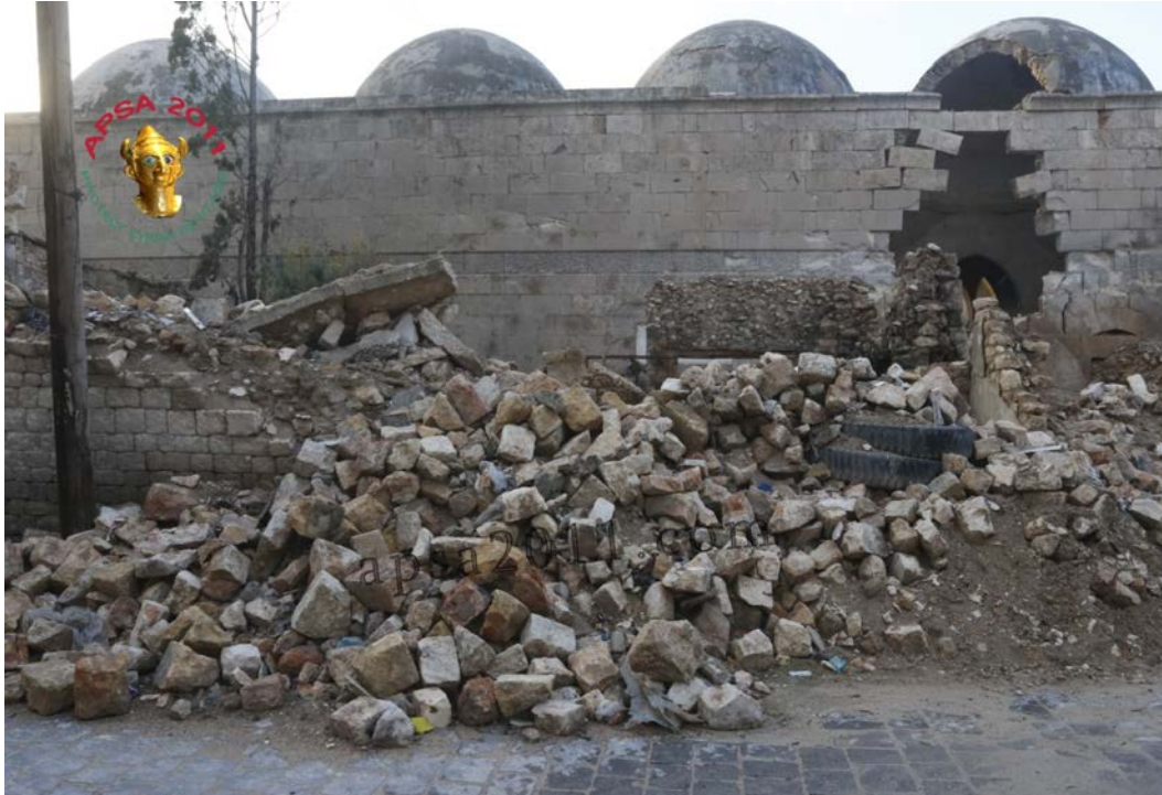
The Madrasa Firdows in Aleppo (APSA).