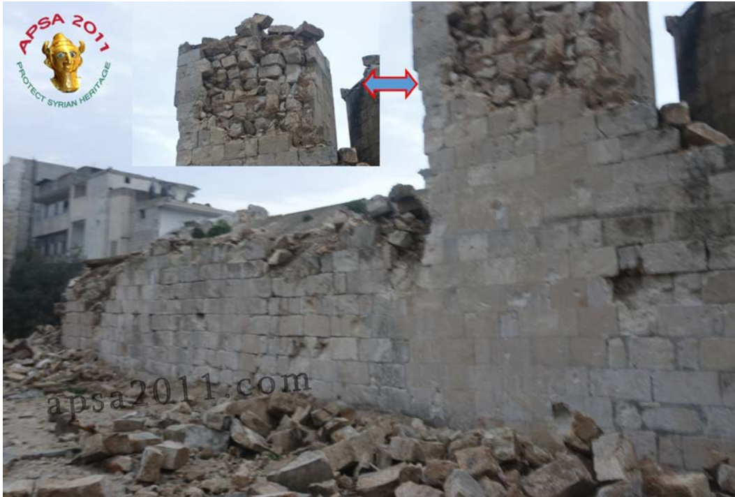
The Madrasa Firdows in Aleppo (APSA).