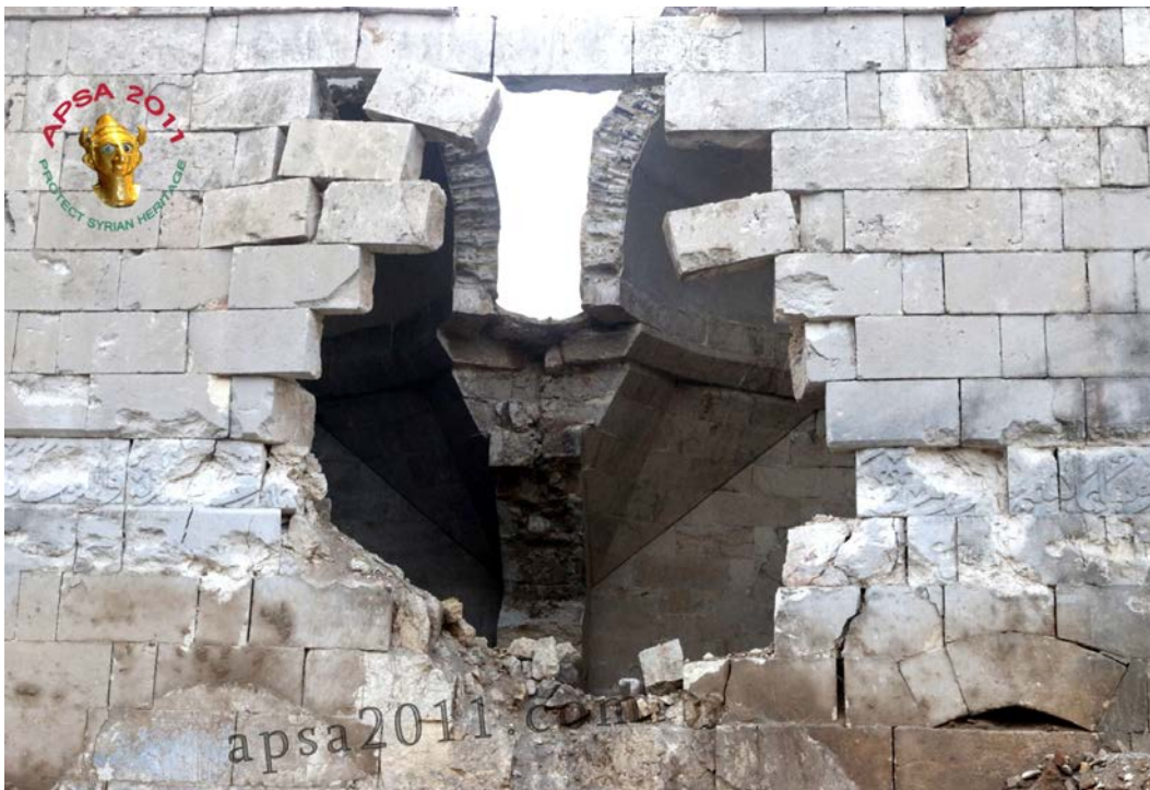
The Madrasa Firdows in Aleppo (APSA).