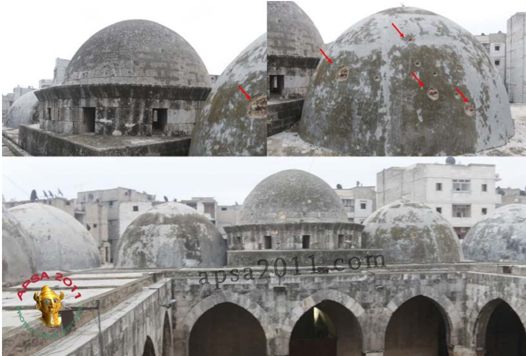
The Madrasa Firdows in Aleppo (APSA).