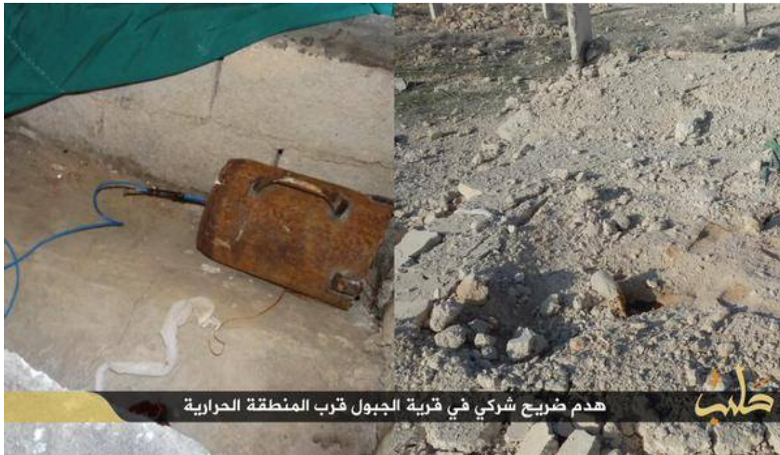
The Sufi mausoleum in Safirah with explosive device planted and after the Islamic State deliberate destruction (APSA).