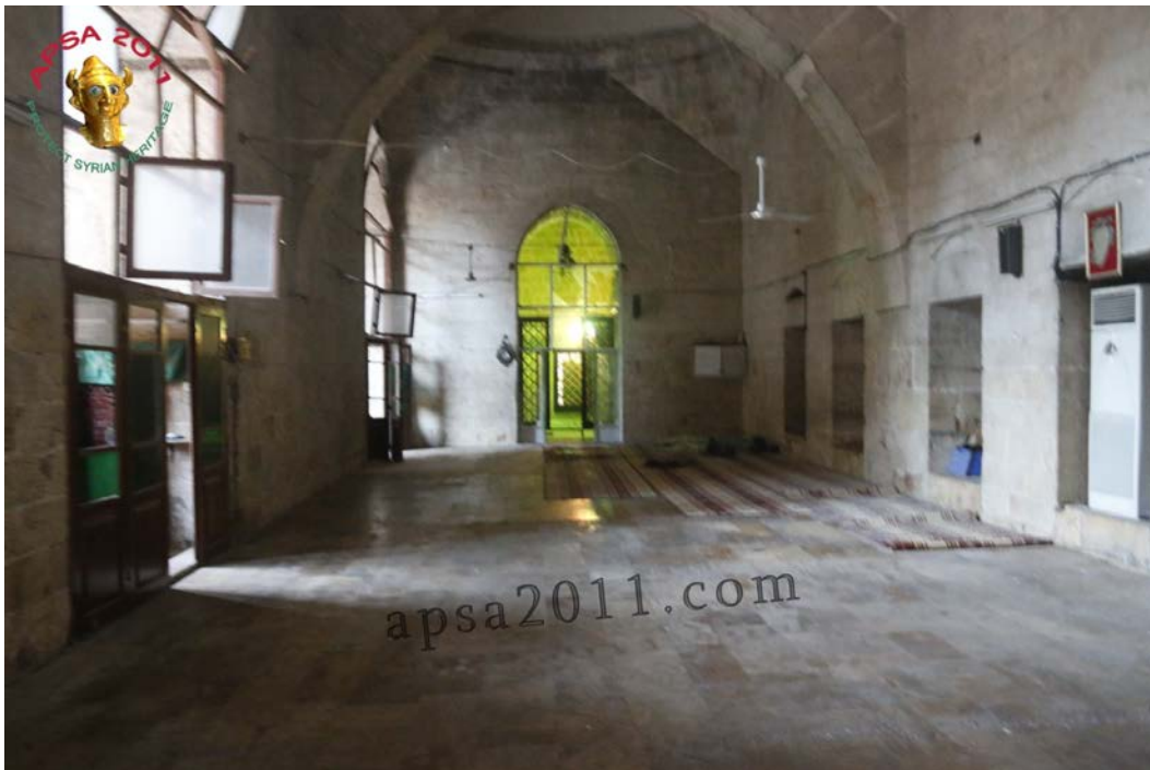
Interior of the Madrasa Firdows in Aleppo (APSA).