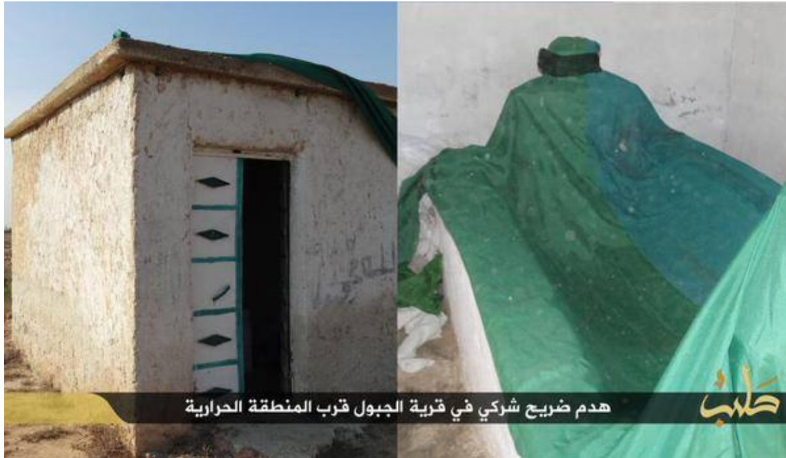
The Sufi mausoleum in Safirah before the Islamic State deliberate destruction.