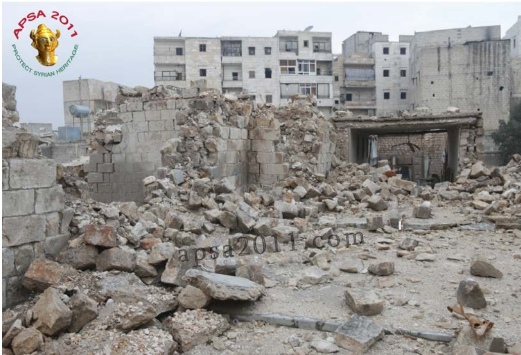
The Madrasa Firdows in Aleppo (APSA).