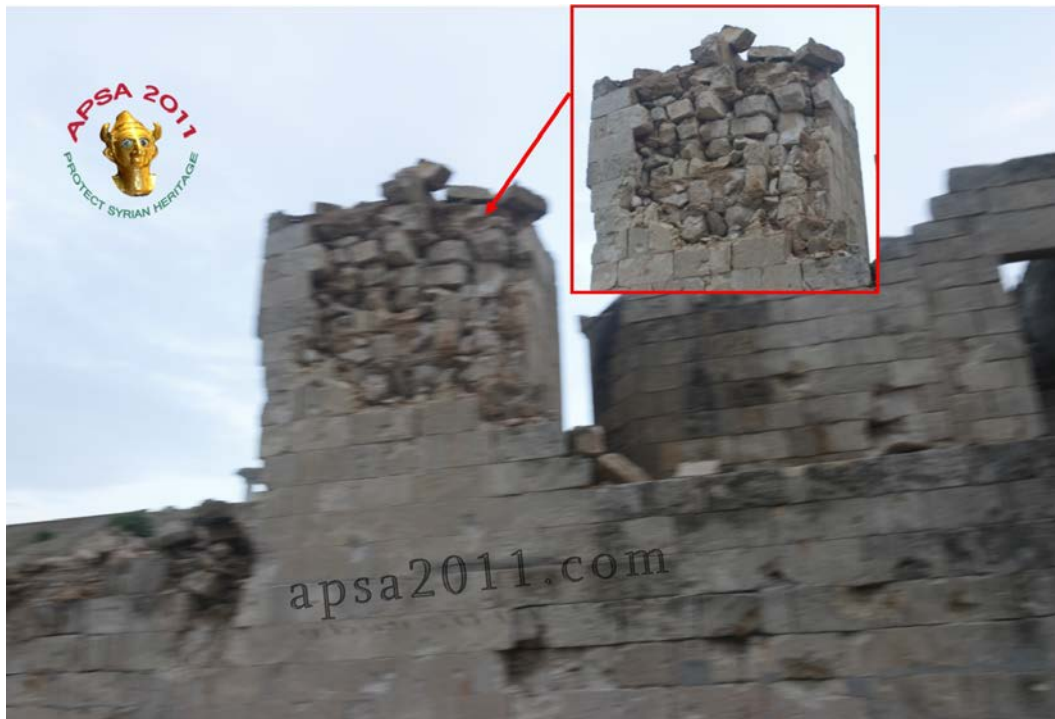
The Madrasa Firdows in Aleppo (APSA).