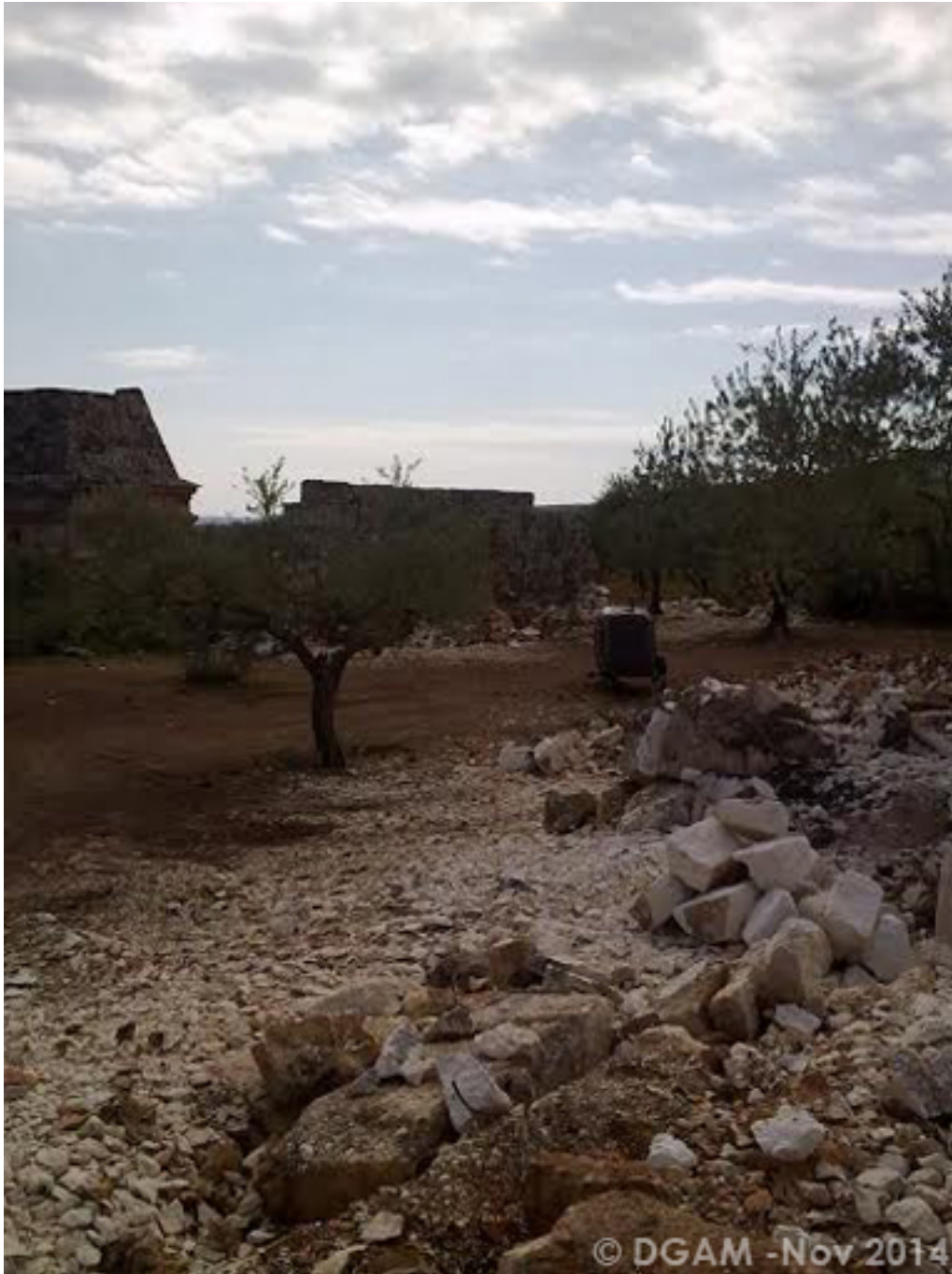
Smashing of ancient stone masonry at the Byzantine site of Al-Bara.