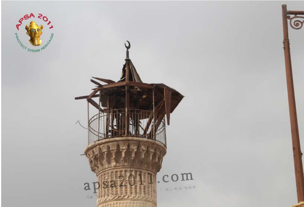
Damage to the Al-Maidani Mosque in Aleppo (APSA).