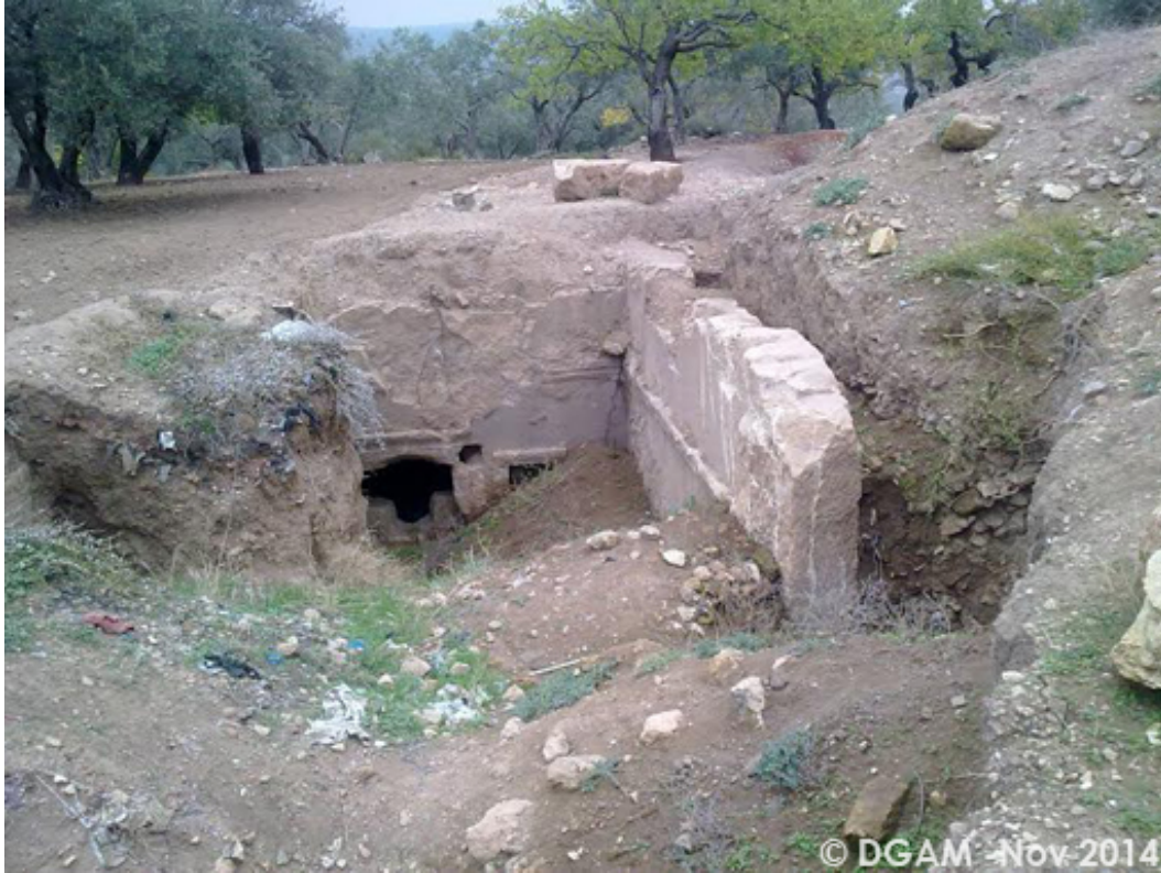
Recently looted tomb at the site of Al-Bara (DGAM).