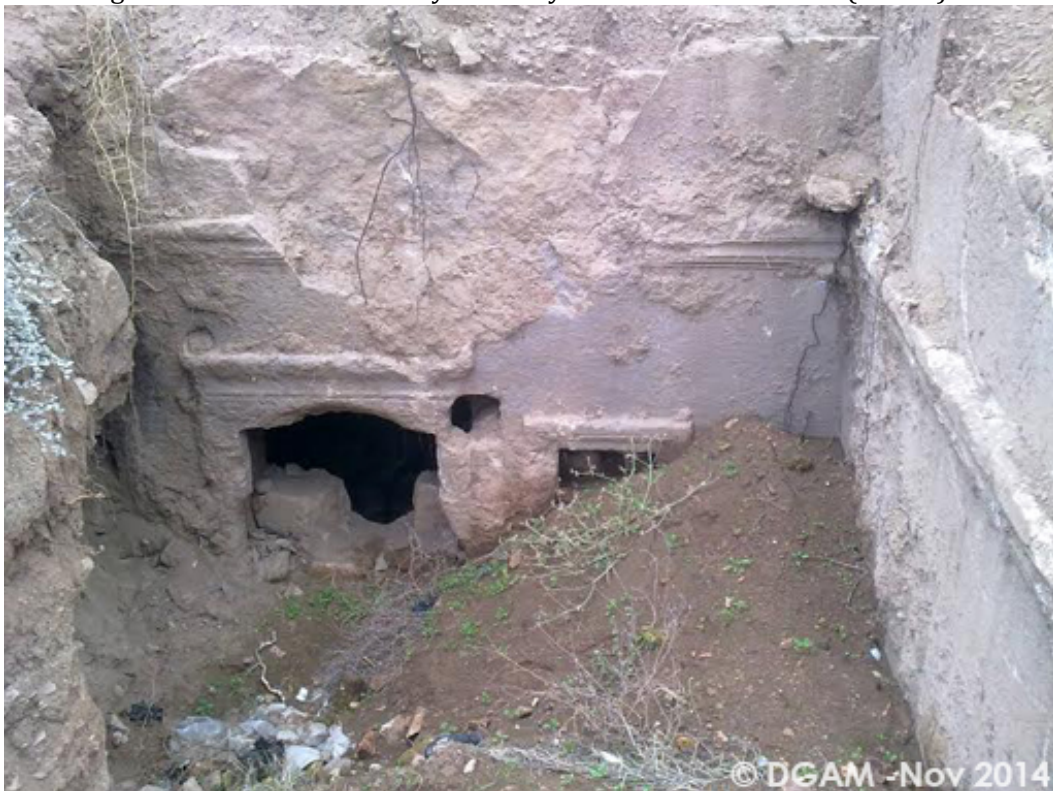
Recently looted tomb at the Byzantine site of Al-Bara (DGAM).