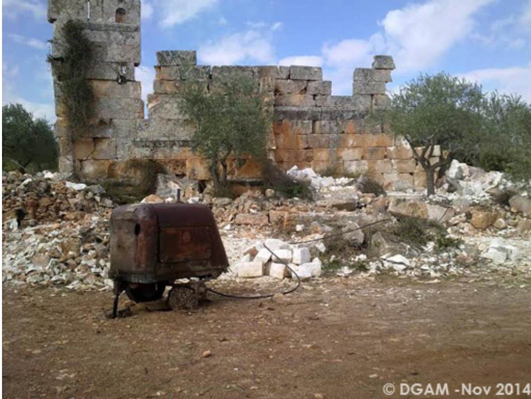
Smashing of ancient stone masonry at the Byzantine site of Al-Bara (DGAM).