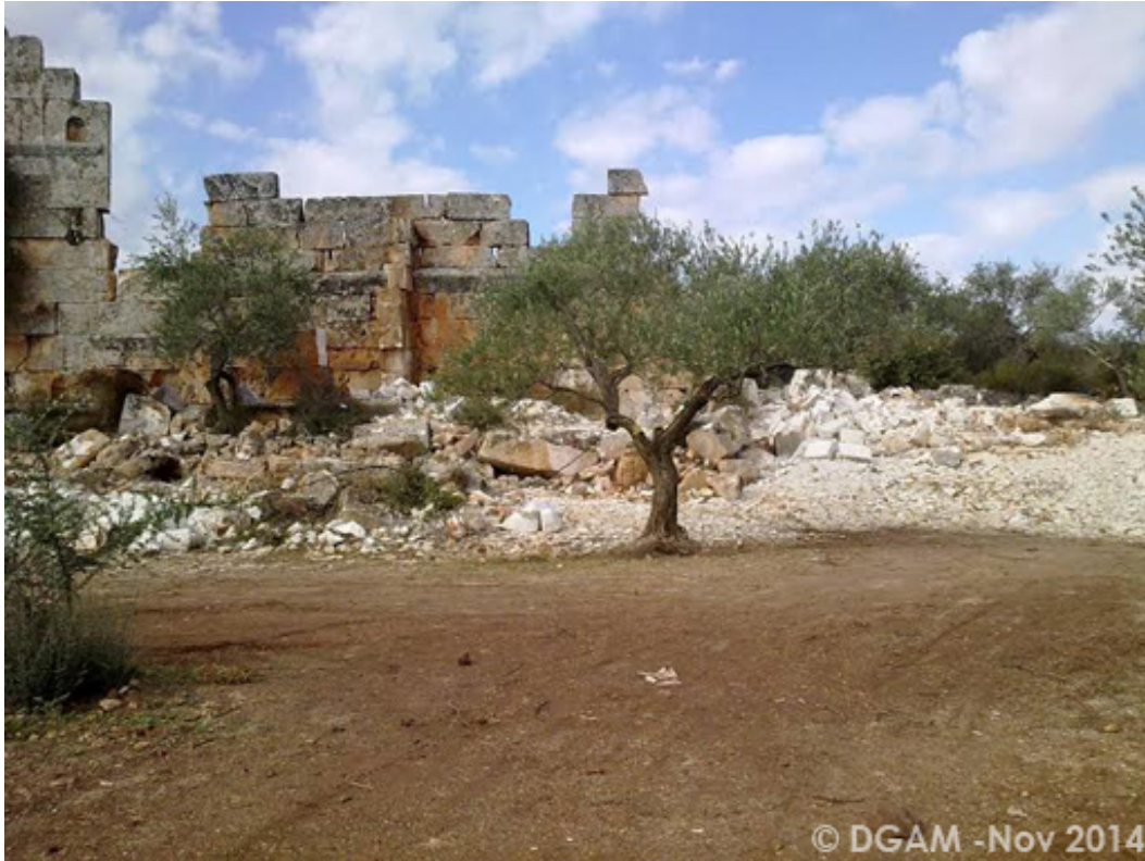
Smashing of ancient stone masonry at the Byzantine site of Al-Bara.