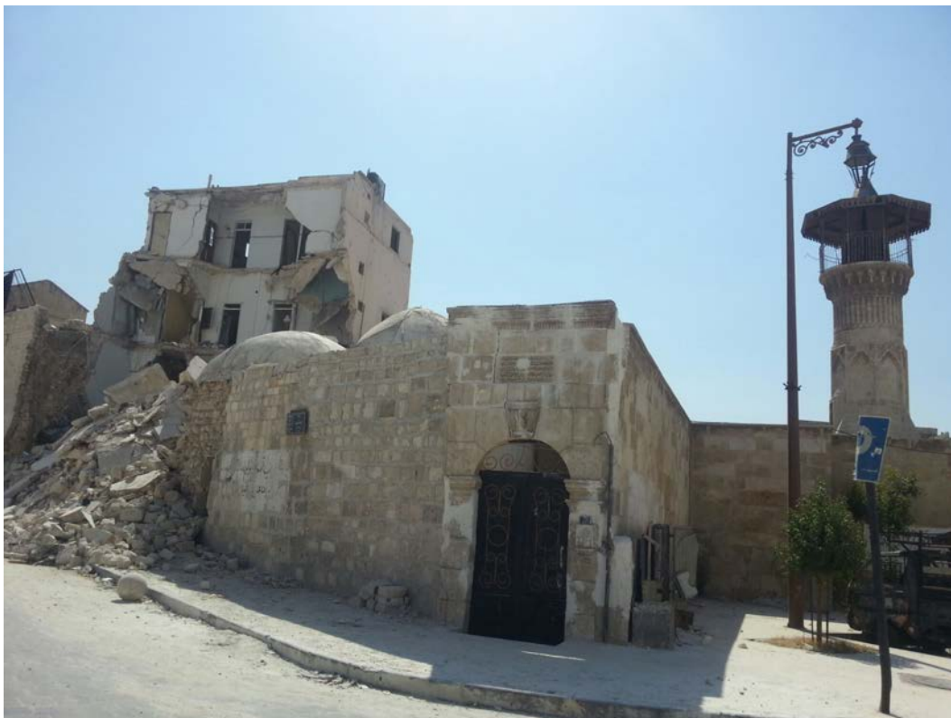
The Maidani Mosque prior to severe combat damage.