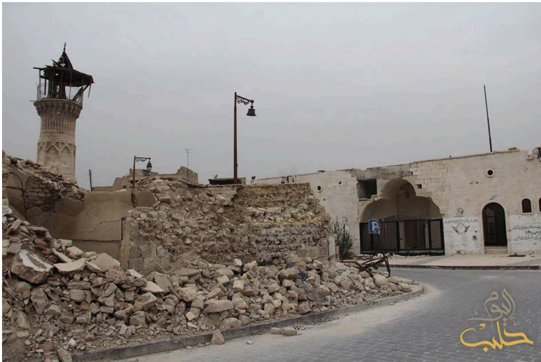
Damage to the Maidani Mosque area in Aleppo (APSA).