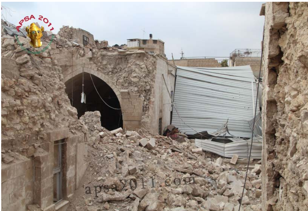
Damage to the Bab al-Nasr in Aleppo (APSA).