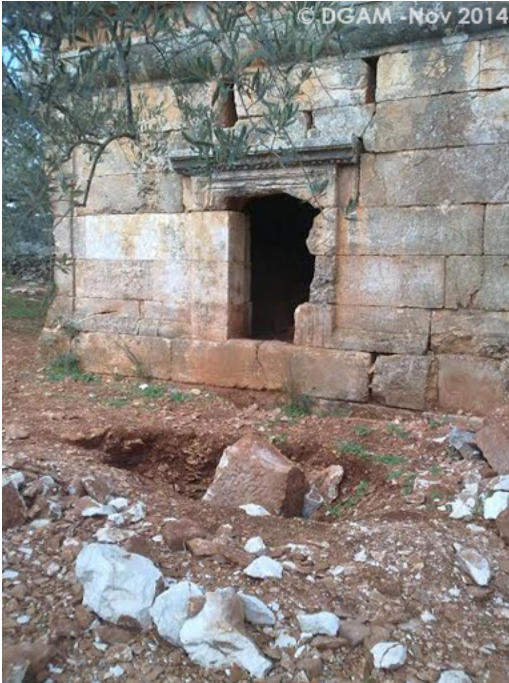
Damage caused by smashing ancient masonry with heavy machinery for building material near the pyramidal-roofed tomb of Al-Bara (DGAM).