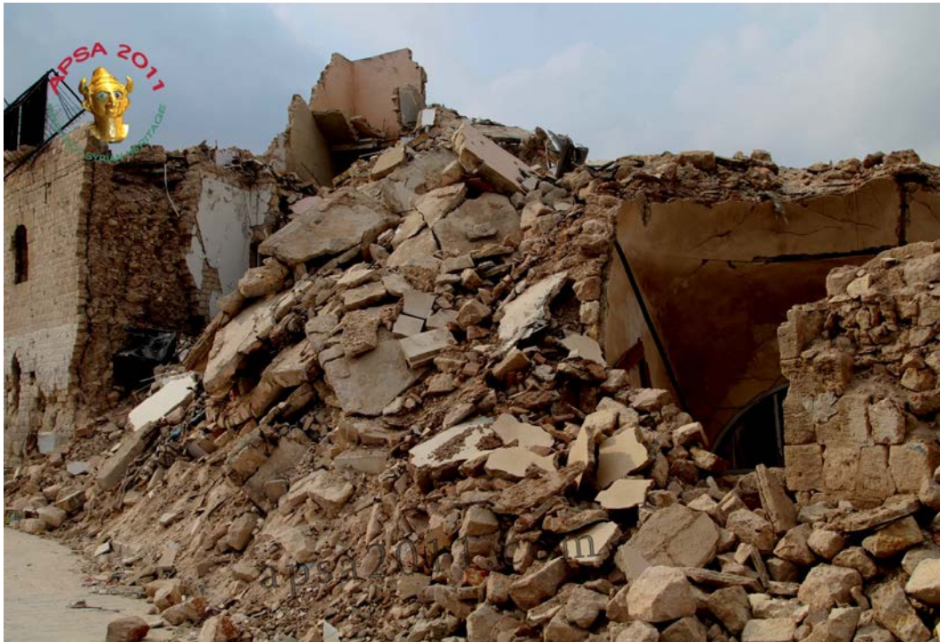
Damage to the Bab al-Nasr area in Aleppo (APSA).