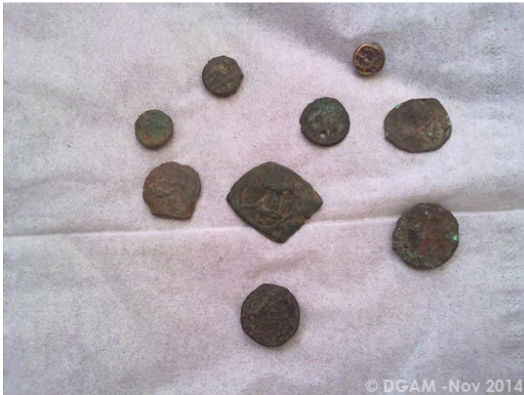
Coins recently looted at the site of Al-Bara (DGAM).