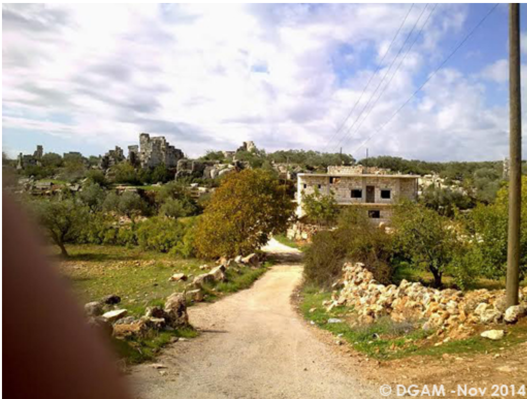
The site of Al-Bara in the UNESCO WHS, Ancient Villages of Northern Syria (DGAM).