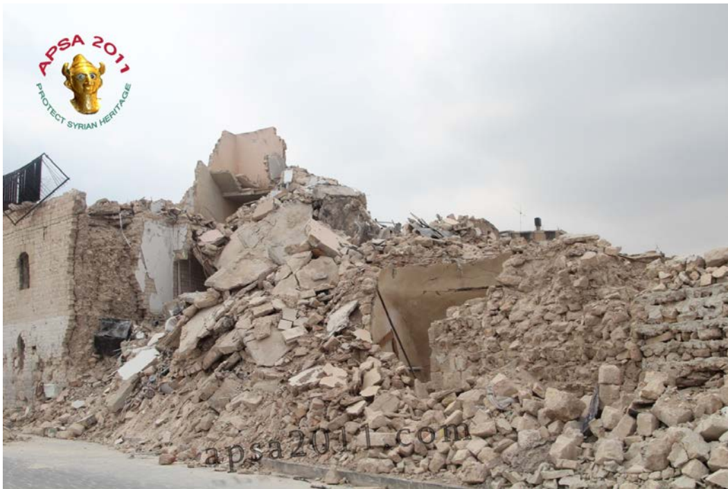
Damage to the Al-Maidani Mosque in Aleppo (APSA).