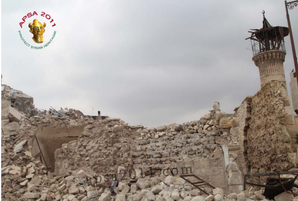
Damage to the Al-Maidani Mosque in Aleppo (APSA).