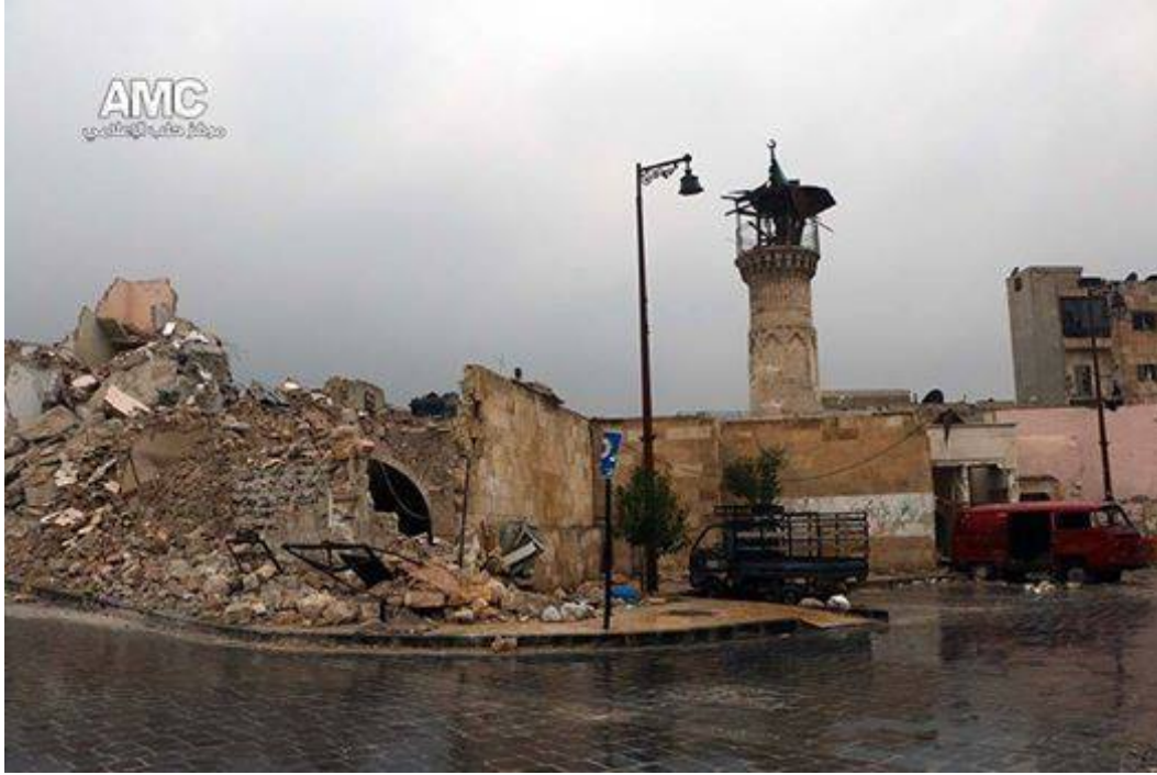
Damage to the Maidani Mosque area in Aleppo (APSA).