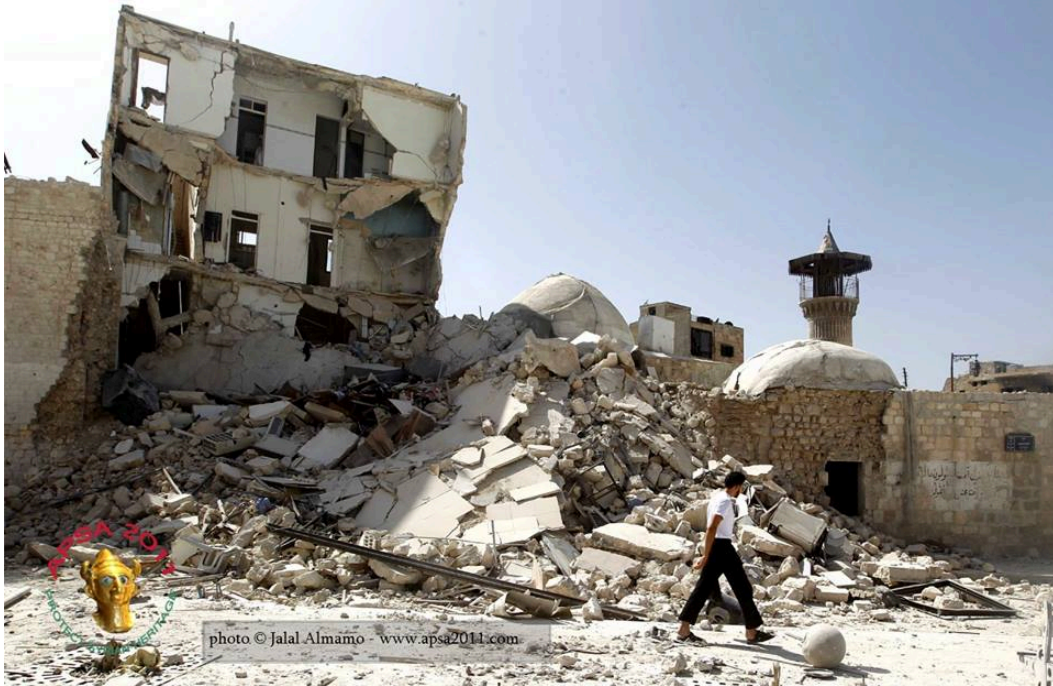
Combat damage to the Maidani Mosque in Aleppo (APSA).