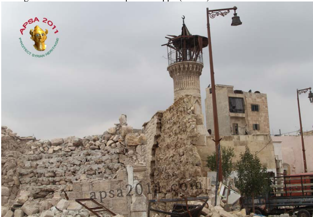
Damage to the Al-Maidani Mosque in Aleppo (APSA).