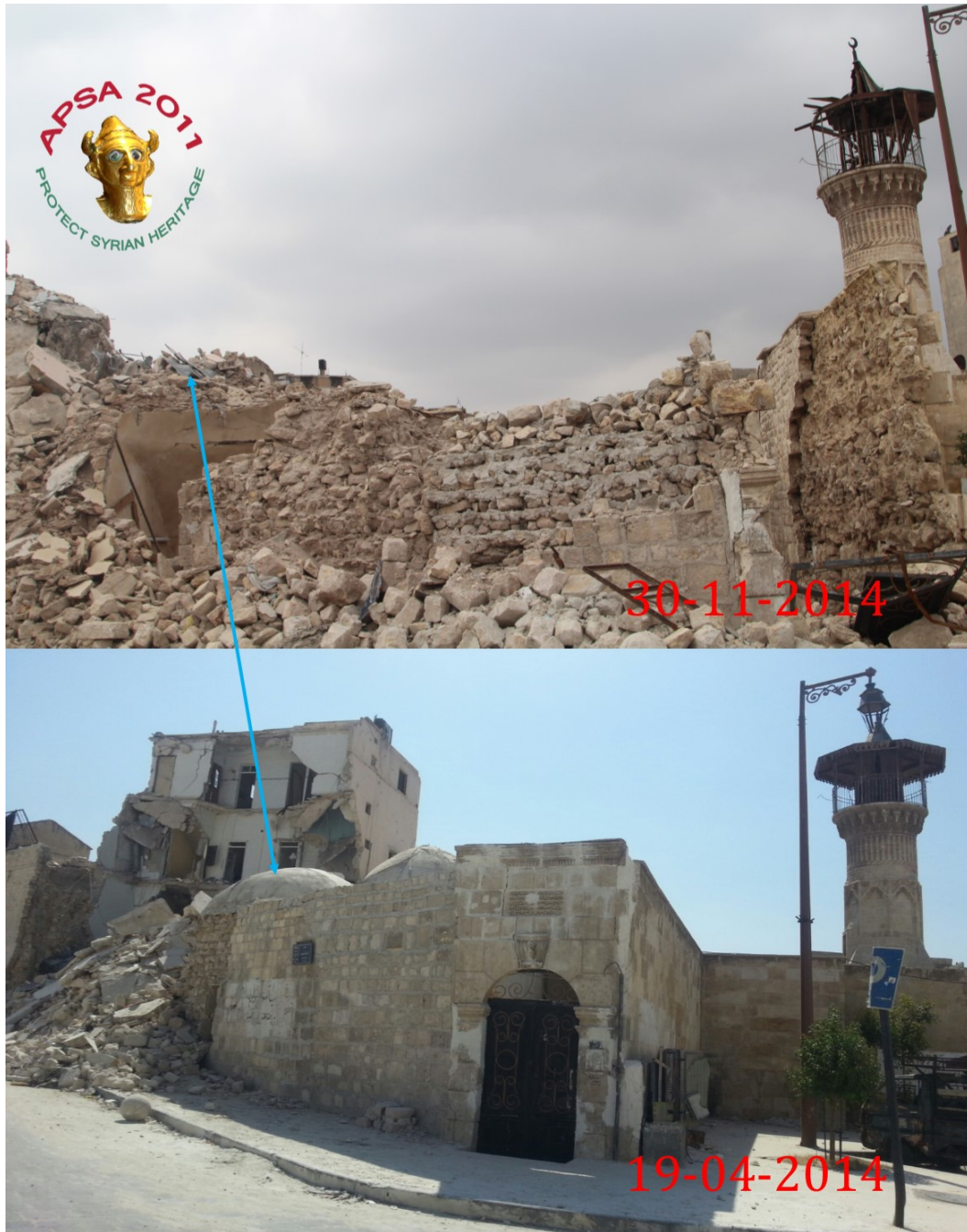
Before and after photos of the damage to the Maidani Mosque, UNESCO World Heritage Site, Ancient City of Aleppo (APSA).