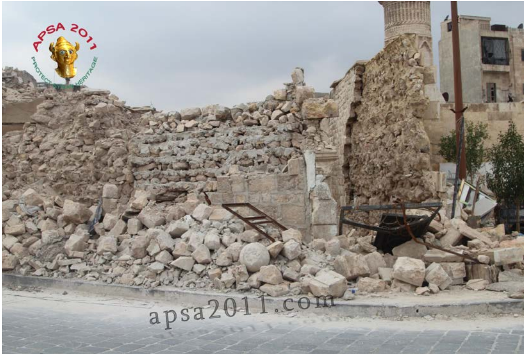
Damage to the Al-Maidani Mosque in Aleppo (APSA).