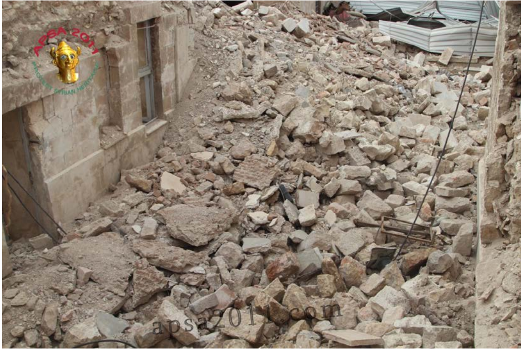
Damage to the Bab al-Nasr in Aleppo (APSA).