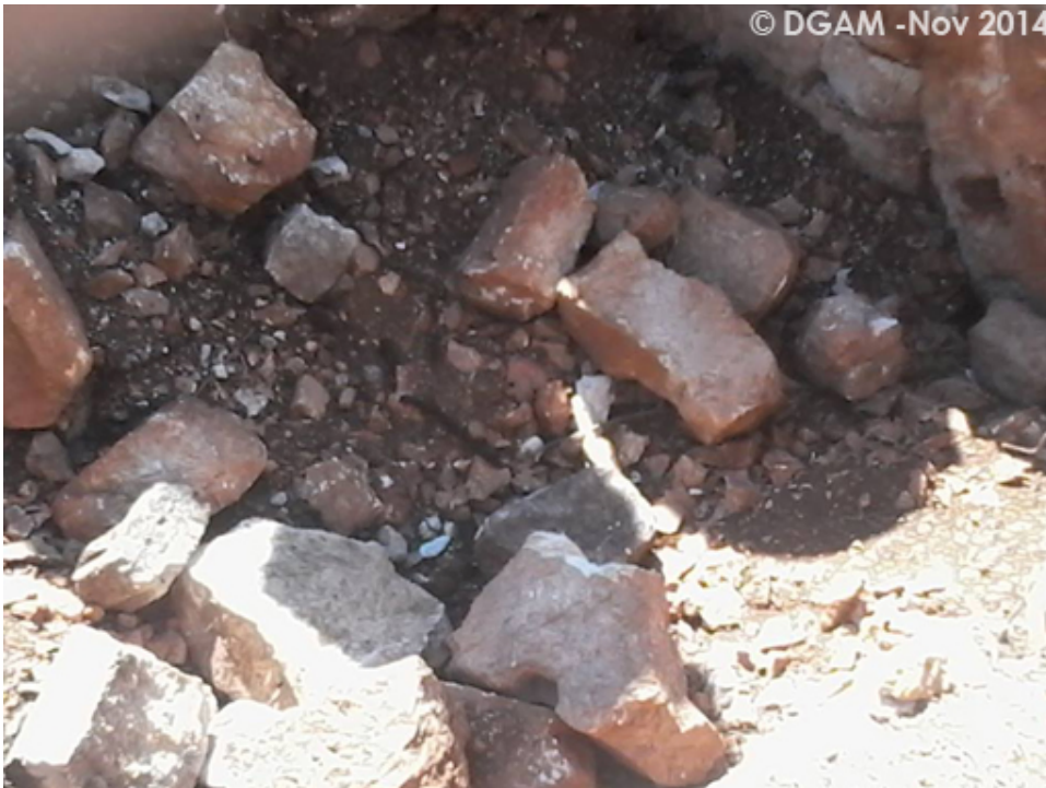
Kafr Aqab in the UNESCO WHS – Jebel Wastani Park.