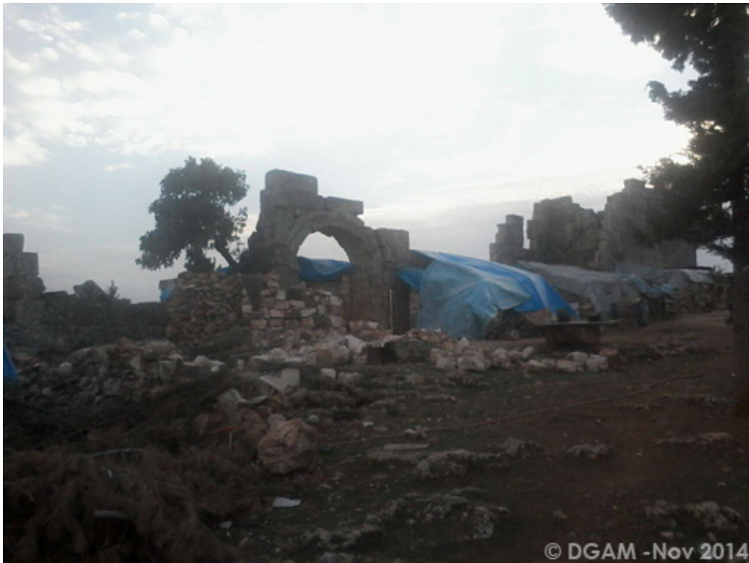
IDP settlement at the Byzantine site of Shinshara, Dead Cities region (APSA).