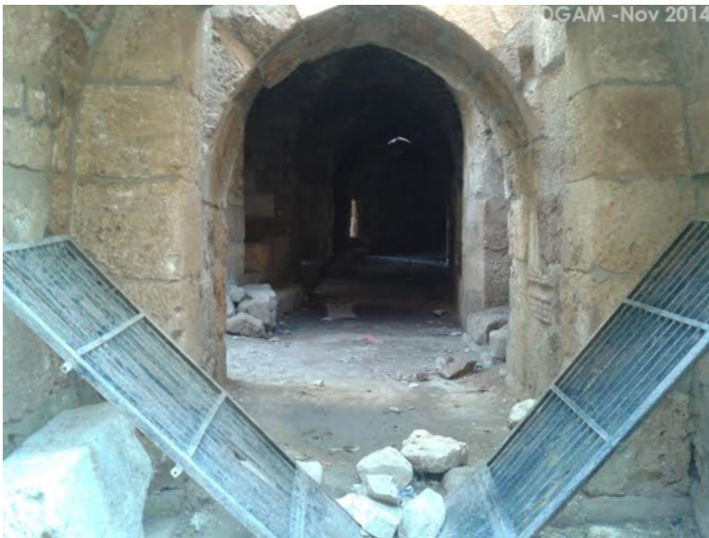
Iron Bars removed from passageways in Harim Castle (DGAM).