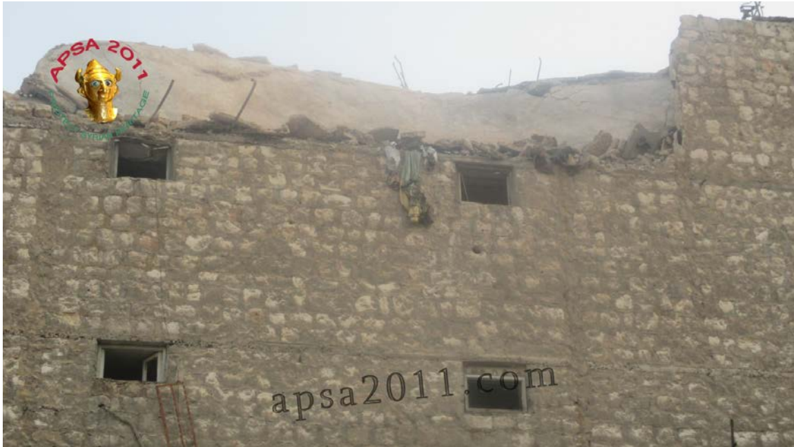
Recent photo of damage to the Bab al-Hadid.