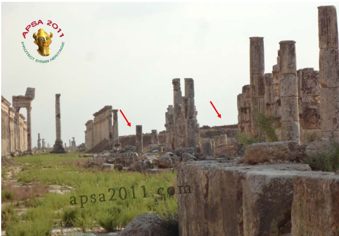
Looting damage at Apamea (ASPA).