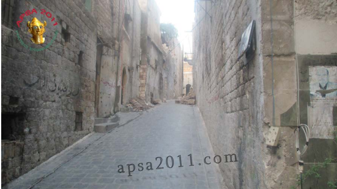
Recent photo of damage in the Suq Bab al-Hadid (APSA).