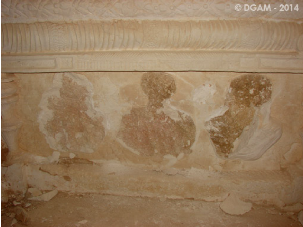
Taibul Tomb sculptures stolen from Palmyra (DGAM).