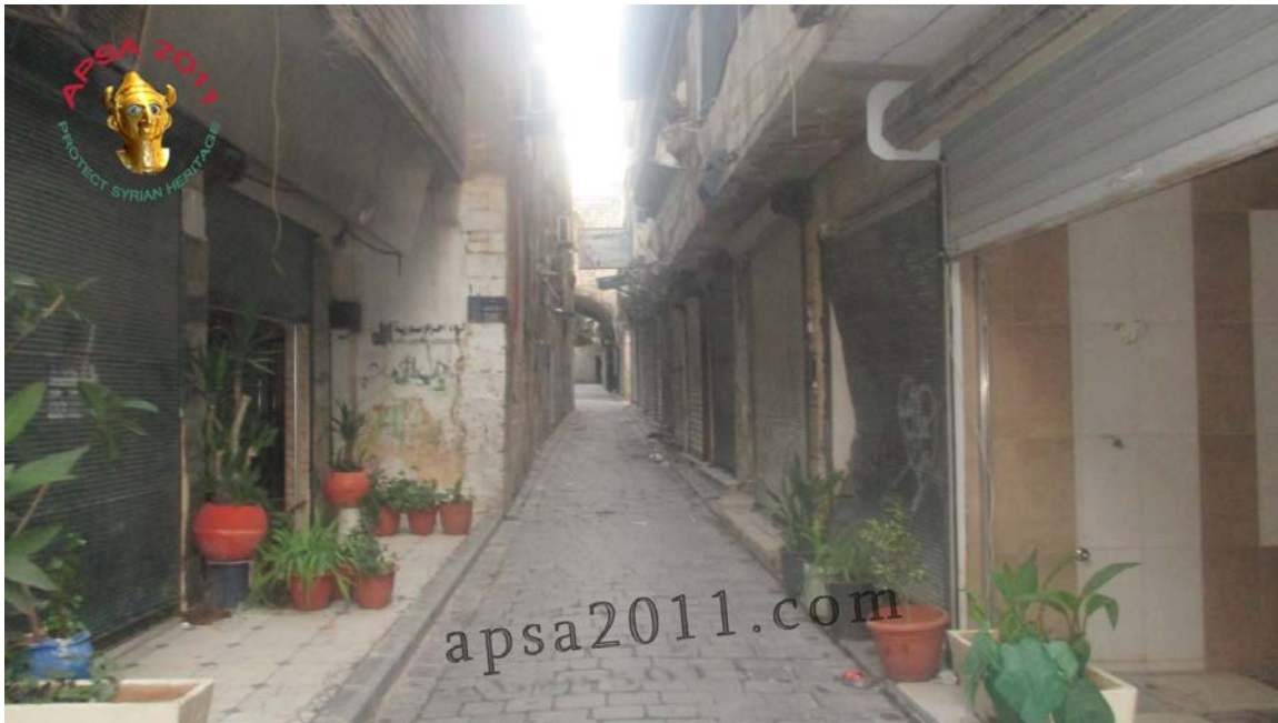
Undated photo of the Suq Bab al-Hadid (APSA).