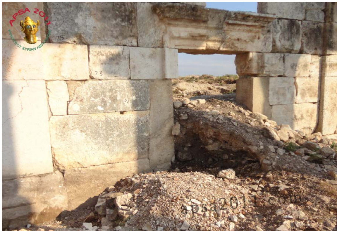
Looting damage at Apamea (APSA).