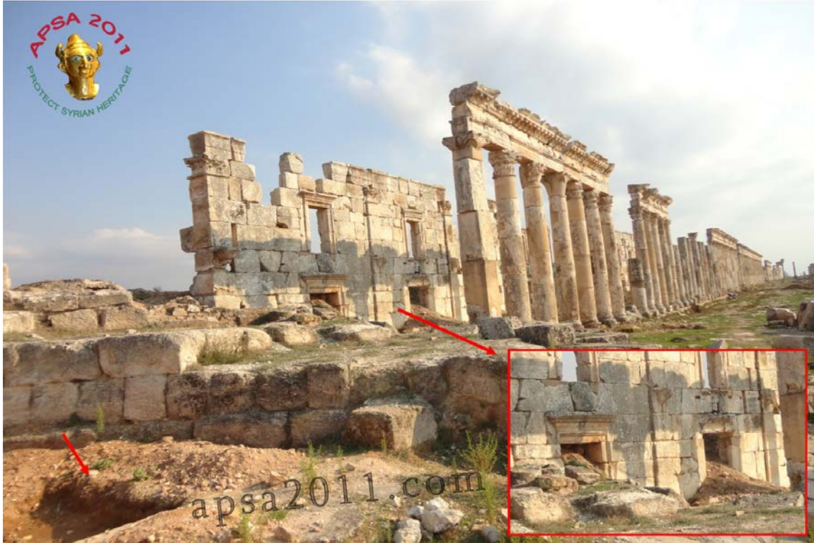
Looting damage at Apamea (APSA).