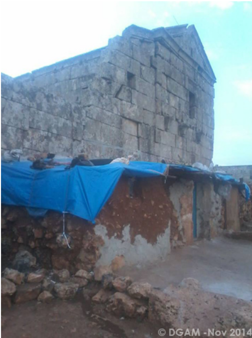
IDP settlement at the Byzantine site of Shinshara, Dead Cities region (APSA).