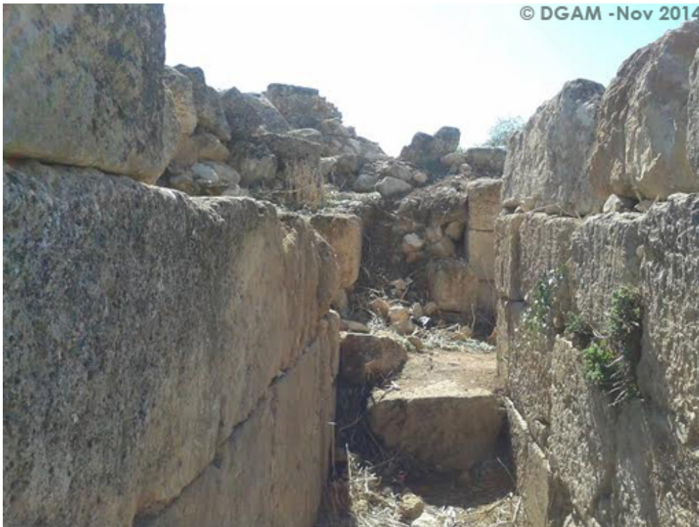
Harim Castle (DGAM).