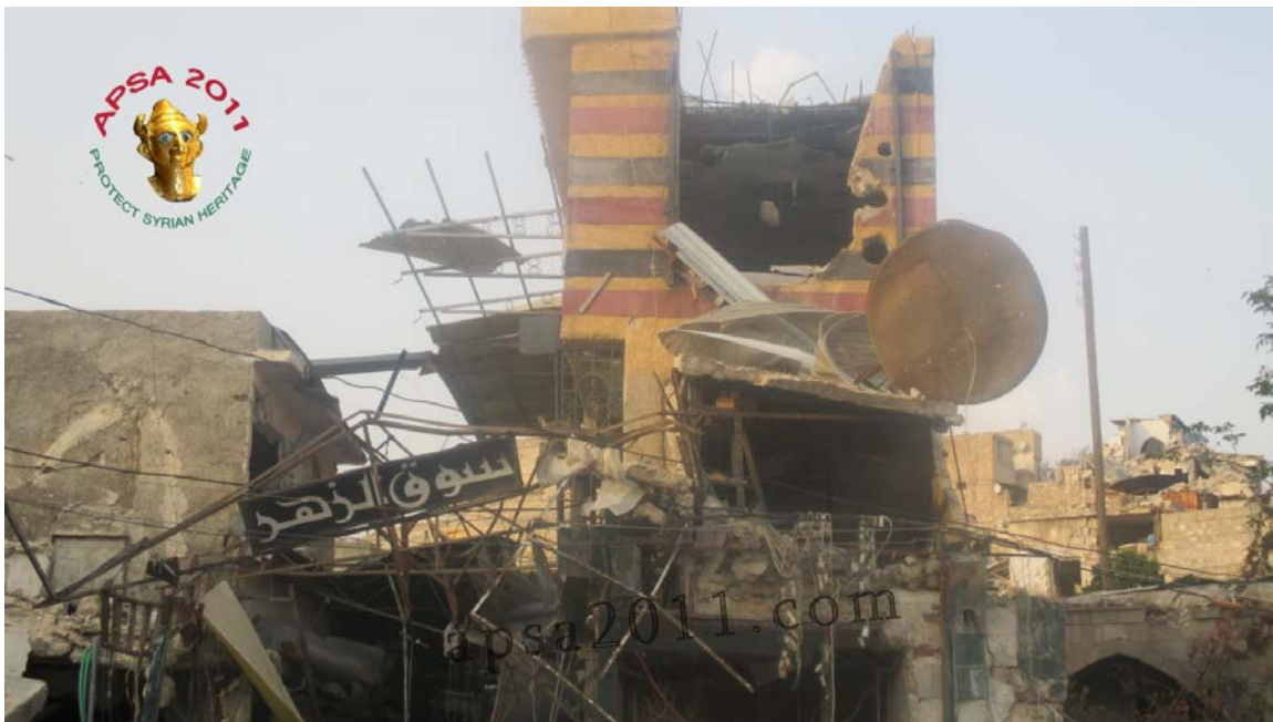
Recent photo of damage in the Suq Bab al-Hadid.