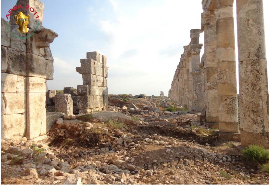
Looting damage at Apamea (APSA).