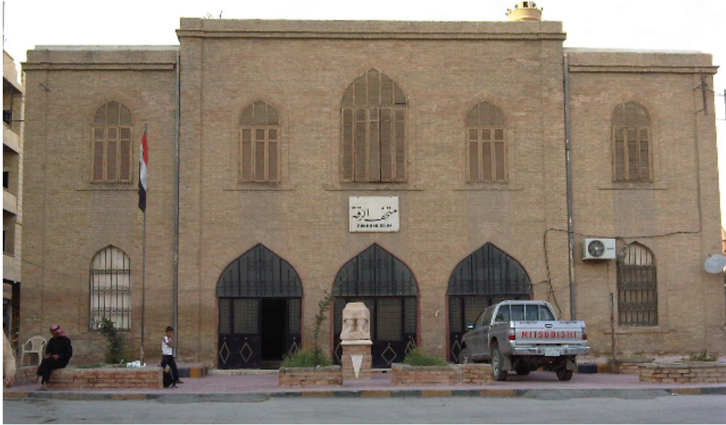
The Raqqa Museum prior to the airstrike (DGAM).