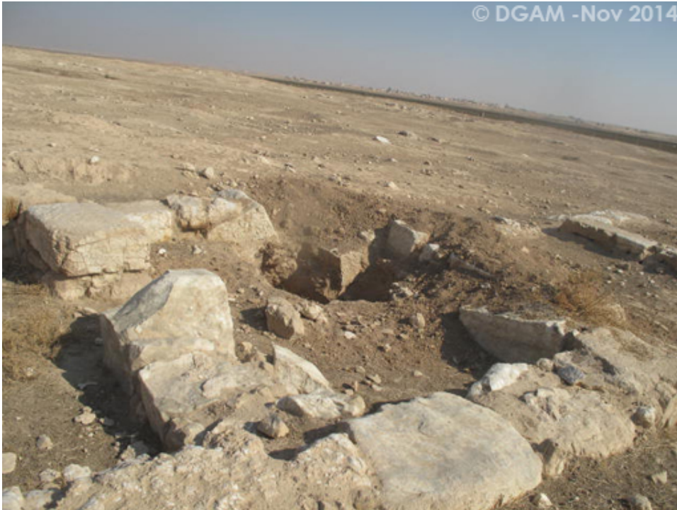
Tell Sheikh Hasan showing some evidence of disturbance of previously excavated areas (DGAM).