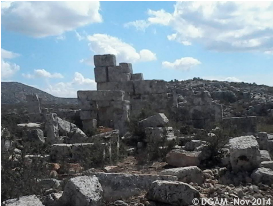
Kafr Aqab in the UNESCO WHS – Jebel Wastani Park.