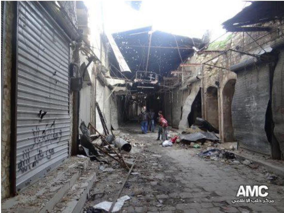
Recent photo of damage in the Suq Bab al-Hadid.