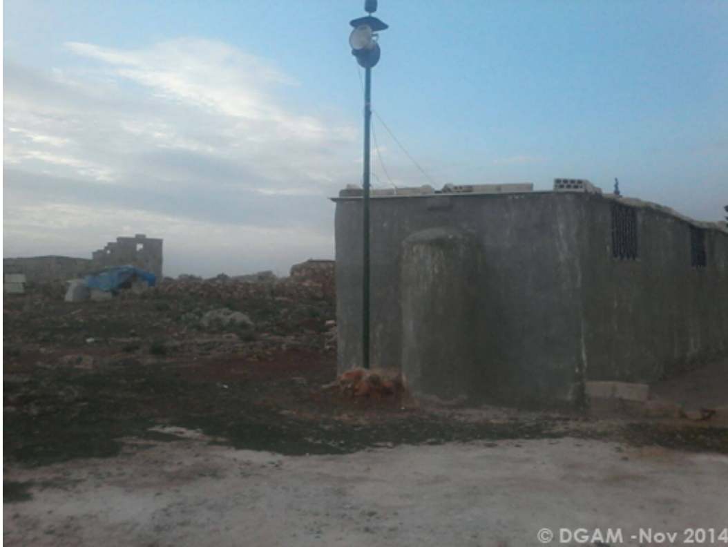
IDP settlement at Shinshara (left background) (APSA).