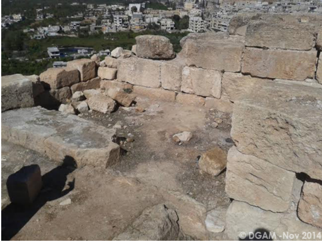
Harim Castle (DGAM).