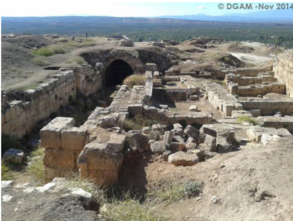
Harim Castle (DGAM).