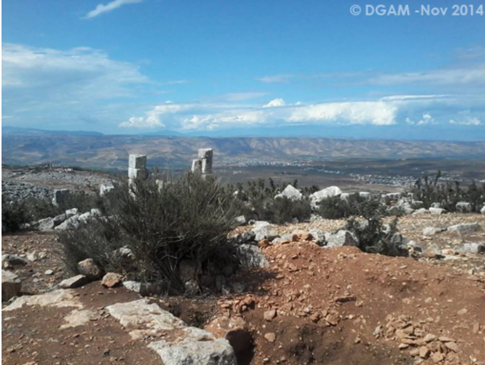
Kafr Aqab in the UNESCO WHS – Jebel Wastani Park.