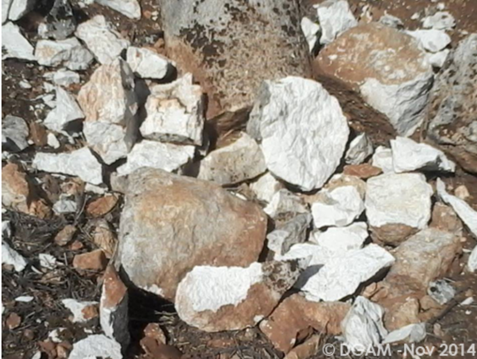
Kafr Aqab in the UNESCO WHS – Jebel Wastani Park.