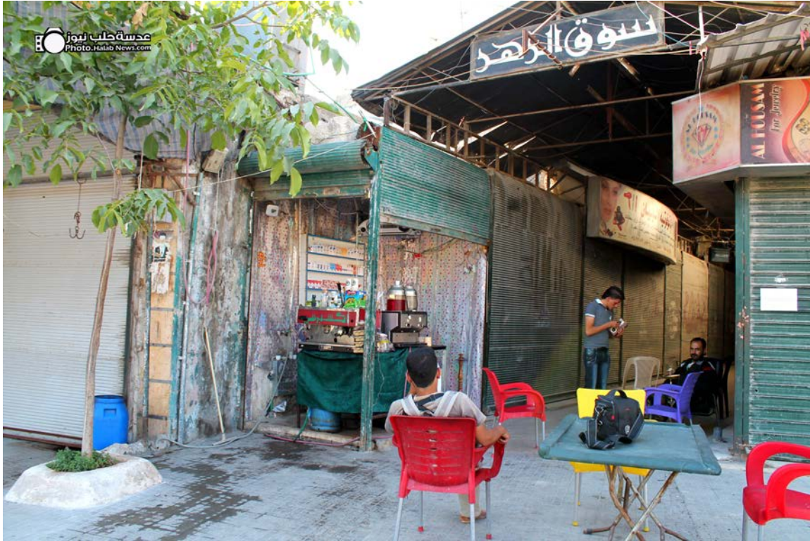
The Bab al-Hadid area prior to the destruction.