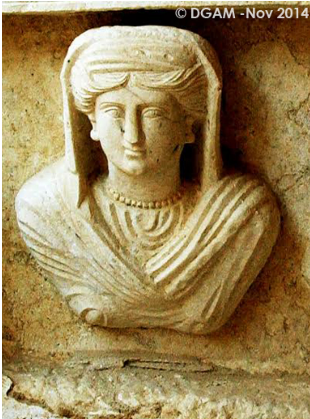
Taibul Tomb sculptures stolen from Palmyra and now recovered.