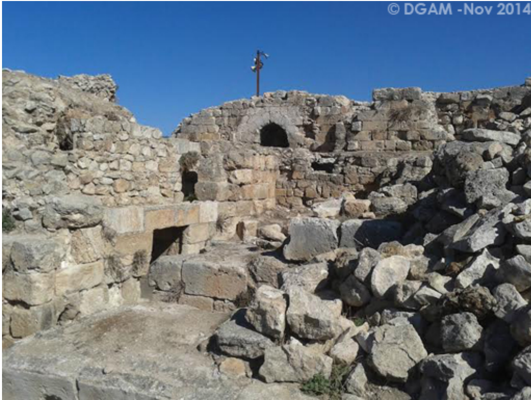
Harim Castle (DGAM).