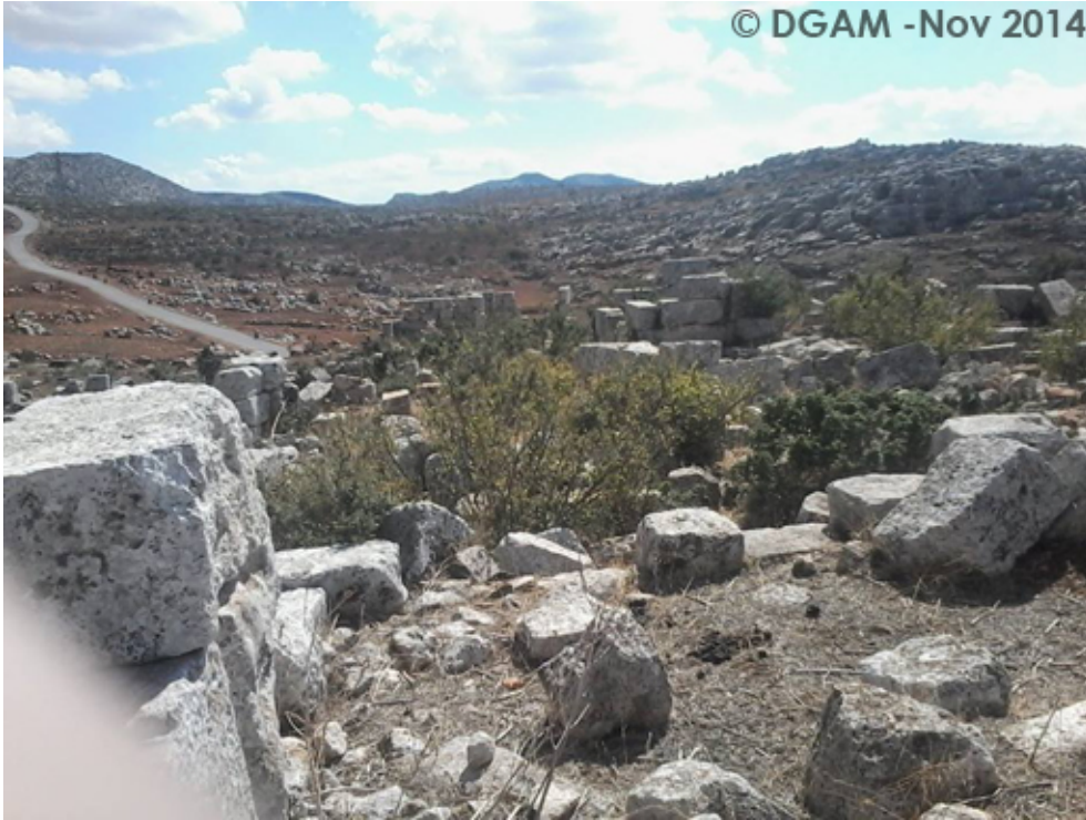
Kafr Aqab in the UNESCO WHS – Jebel Wastani Park (DGAM).