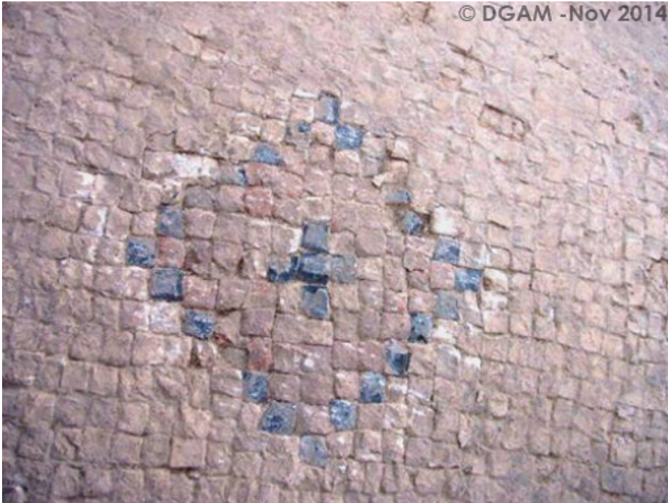
Tell Sheikh Hasan mosaic — date unknown.