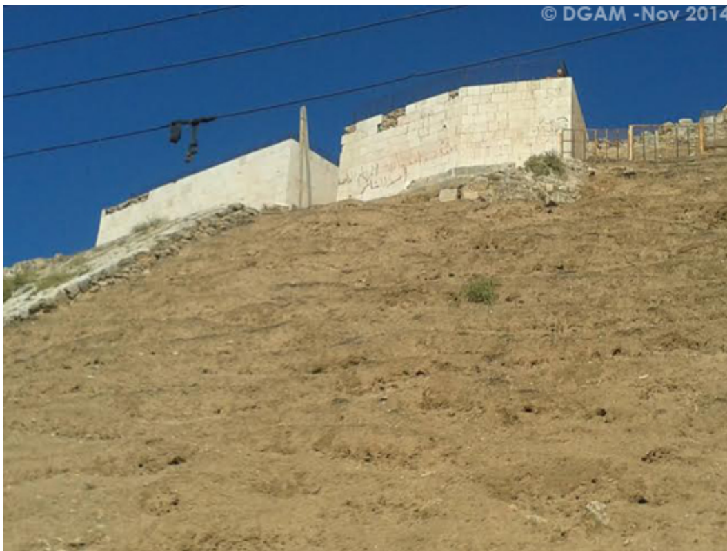
Harim Castle from the modern town (DGAM).