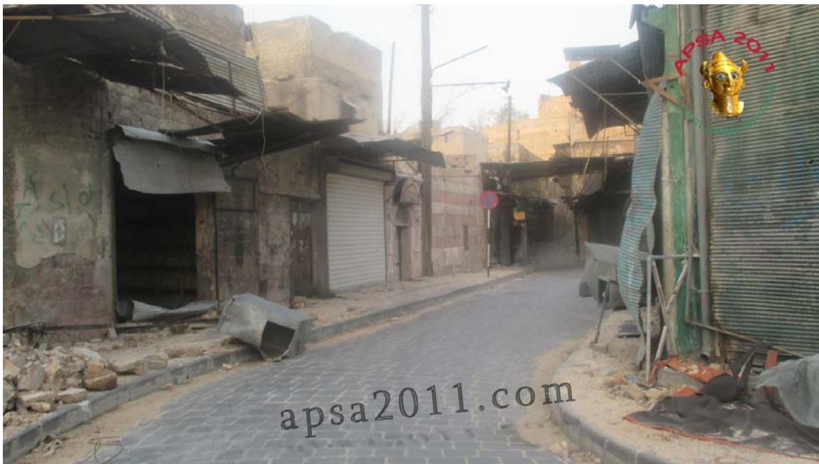
Recent photo of damage in the Suq Bab al-Hadid (APSA).