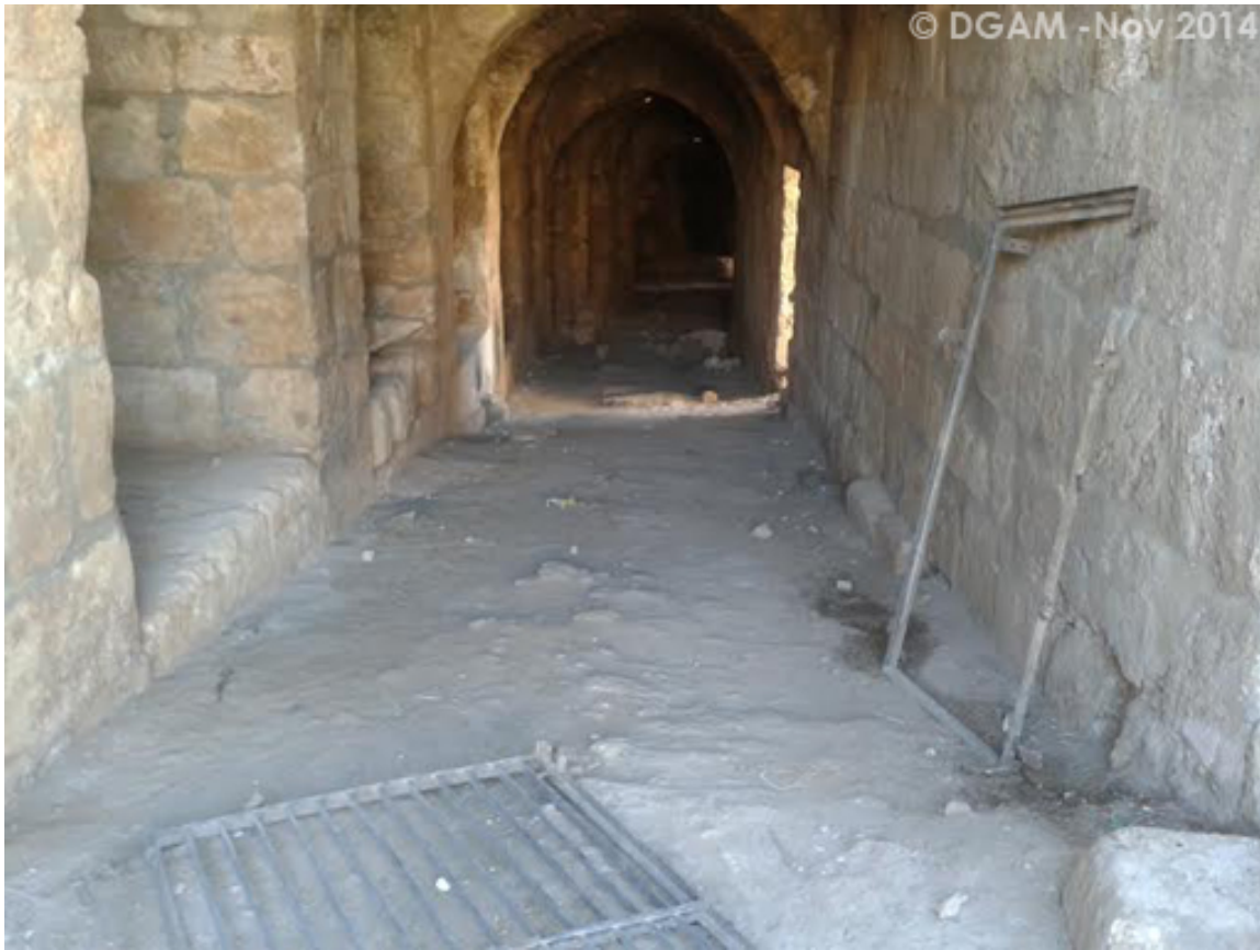
Recent damage to Harim Castle (DGAM).

Burns, Ross. 2009. The Monuments of Syria. A Guide. (I.B. Tauris), pp. 167–9.