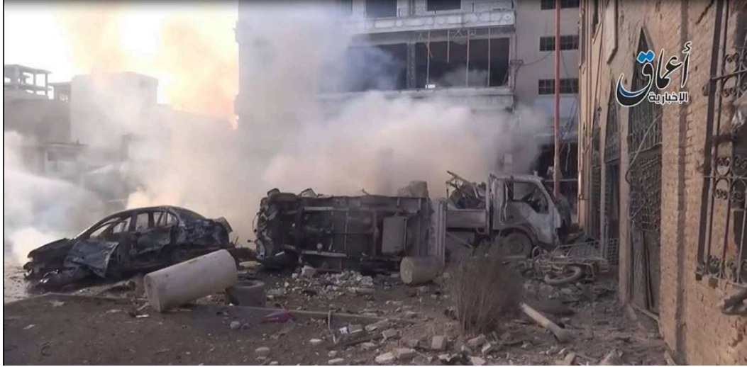
Airstrike damage to Arafat Square and the façade of the Raqqa Museum (right).