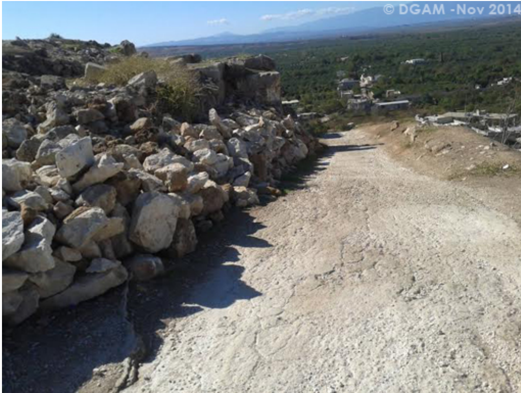
The pathway leading up to Harim Castle (DGAM).