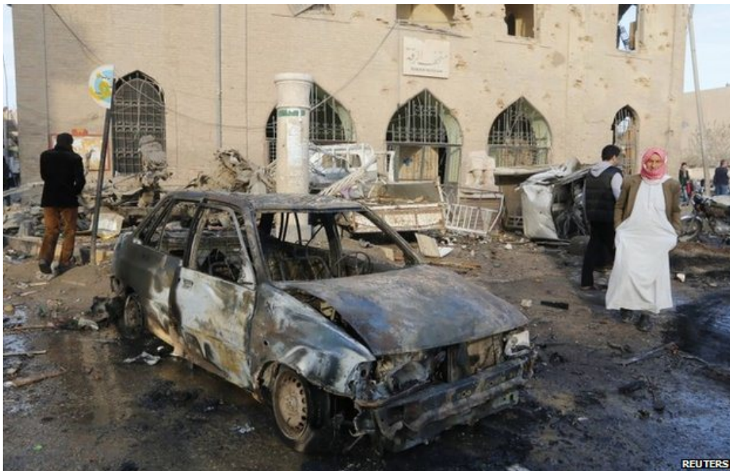
Airstrike damage to Arafat Square and the façade of the Raqqa Museum (DGAM).