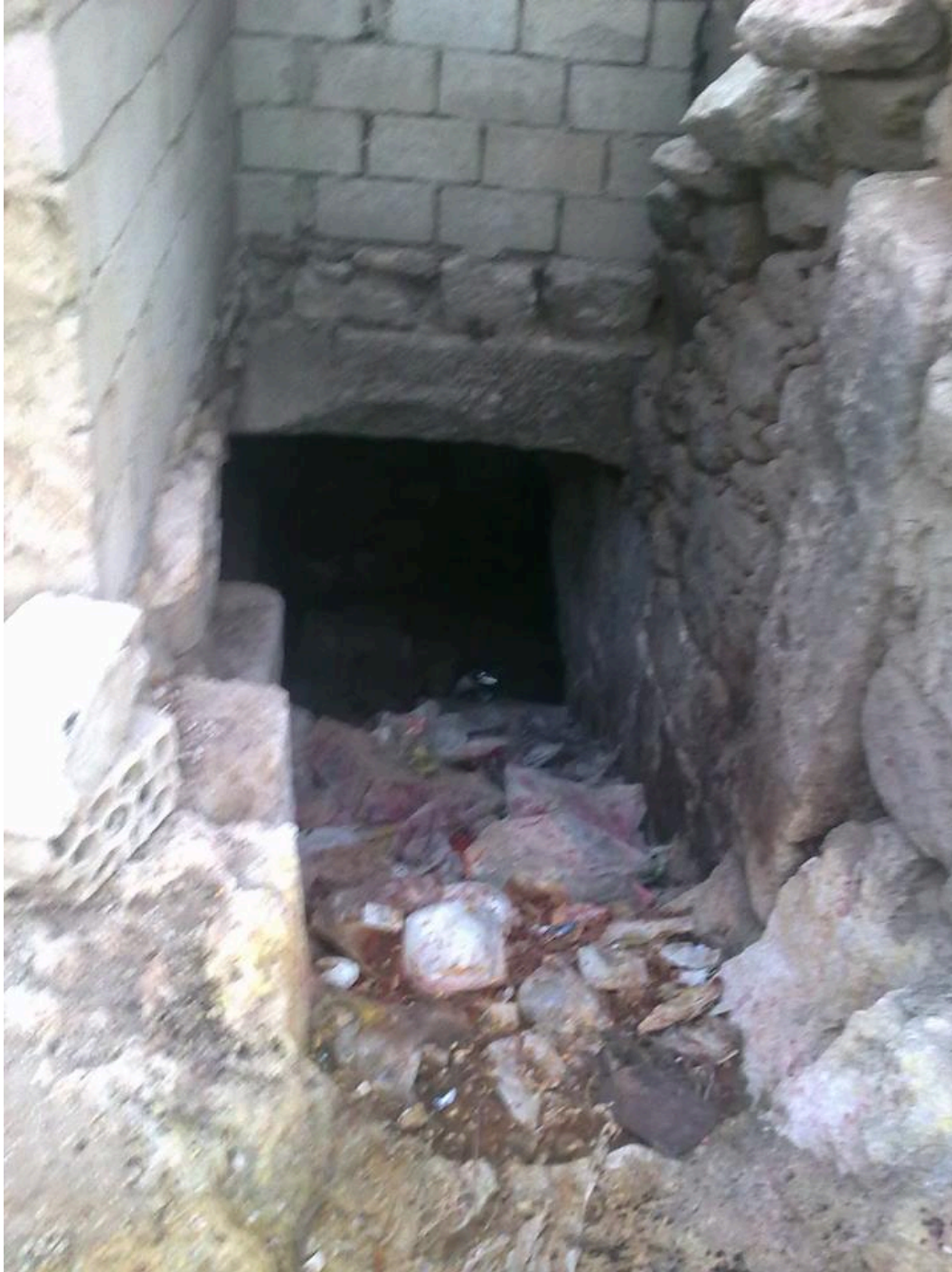
Illegal construction and excavation at Balyun, Idlib Governorate (DGAM).