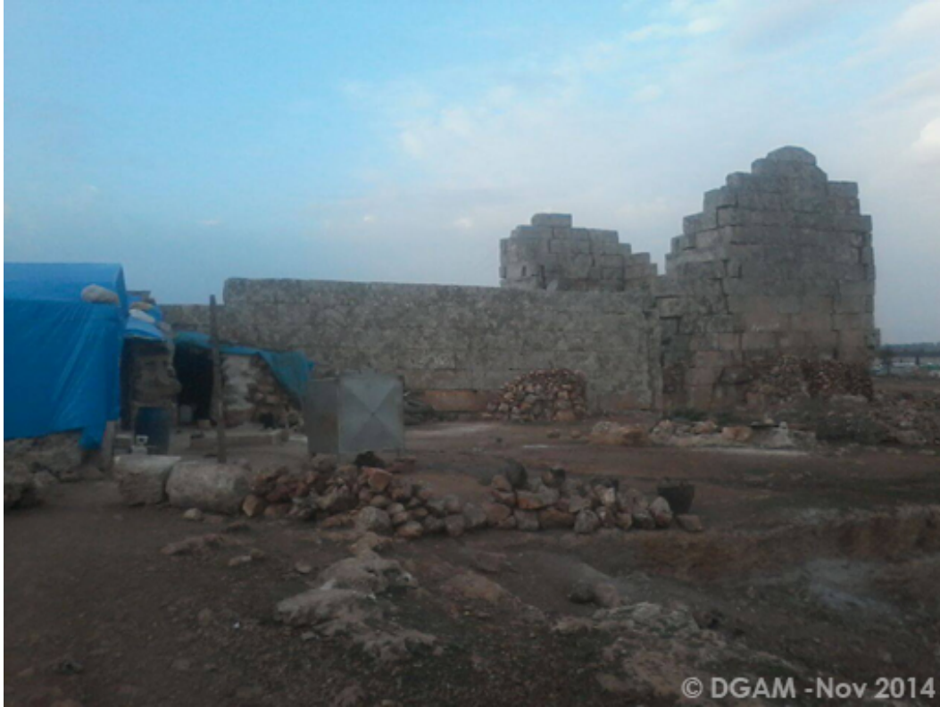
IDP settlement at the Byzantine site of Shinshara, Dead Cities region (APSA).