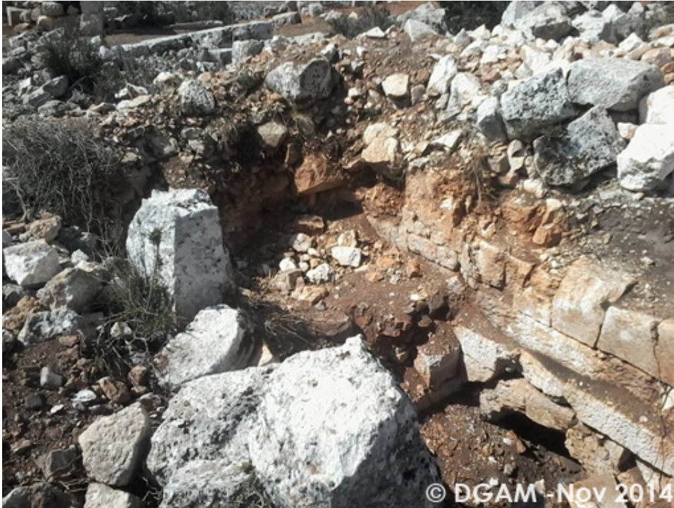
Kafr Aqab in the UNESCO WHS – Jebel Wastani Park.