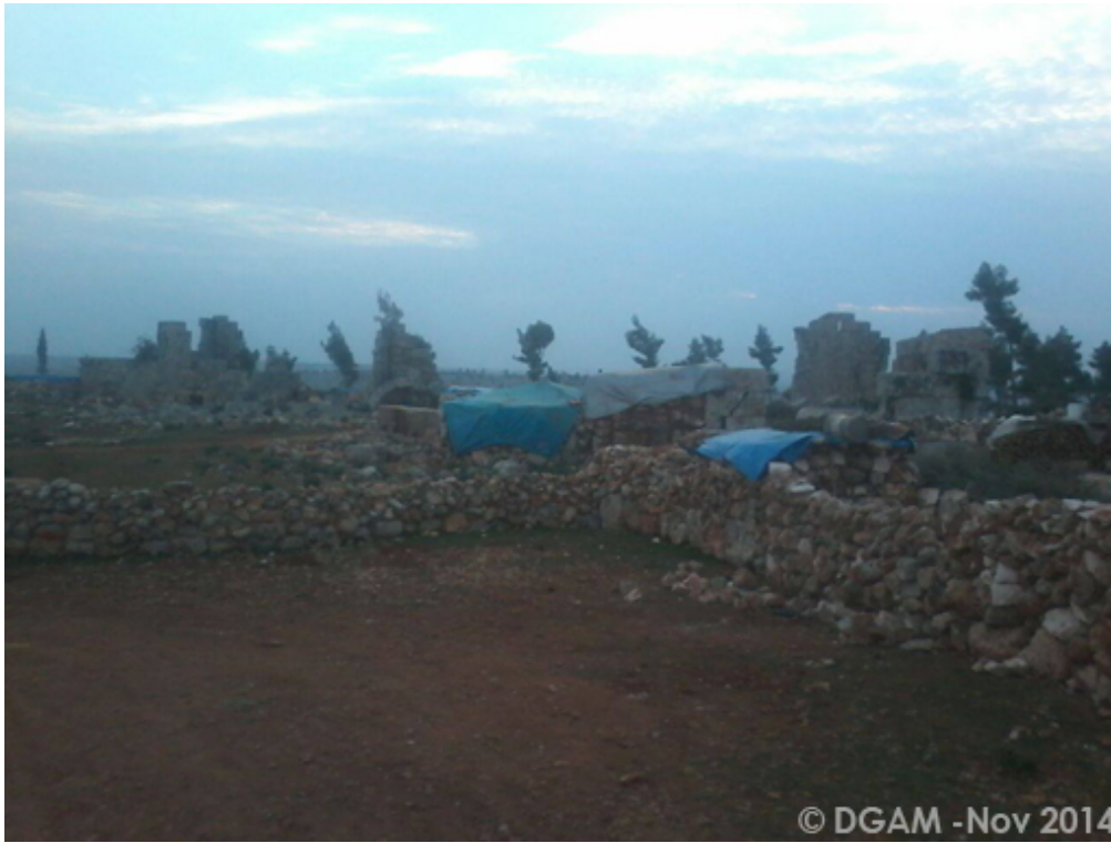
IDP settlement at the Byzantine site of Shinshara, Dead Cities region (APSA).