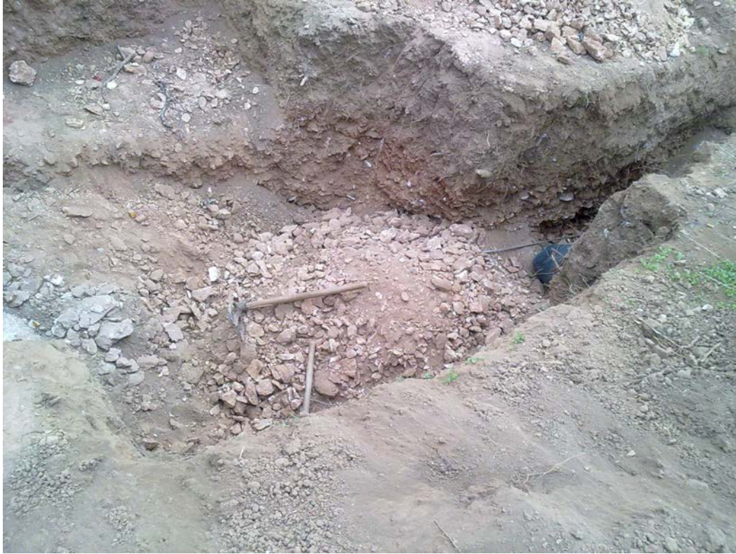
Illegal excavation at Balyun, Idlib Governorate (DGAM).