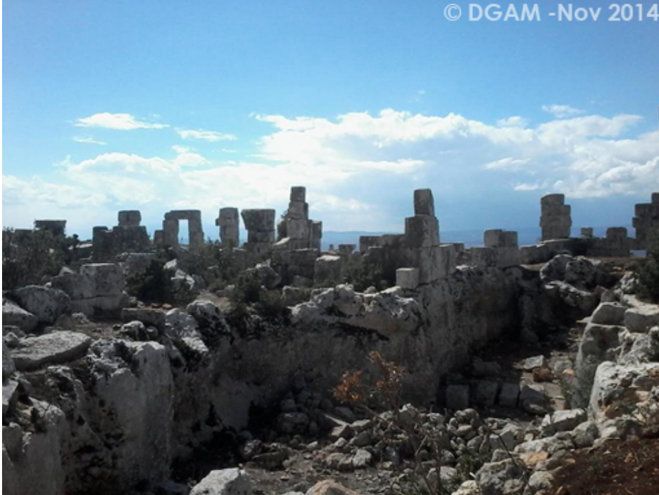
Kafr Aqab in the UNESCO WHS – Jebel Wastani Park.