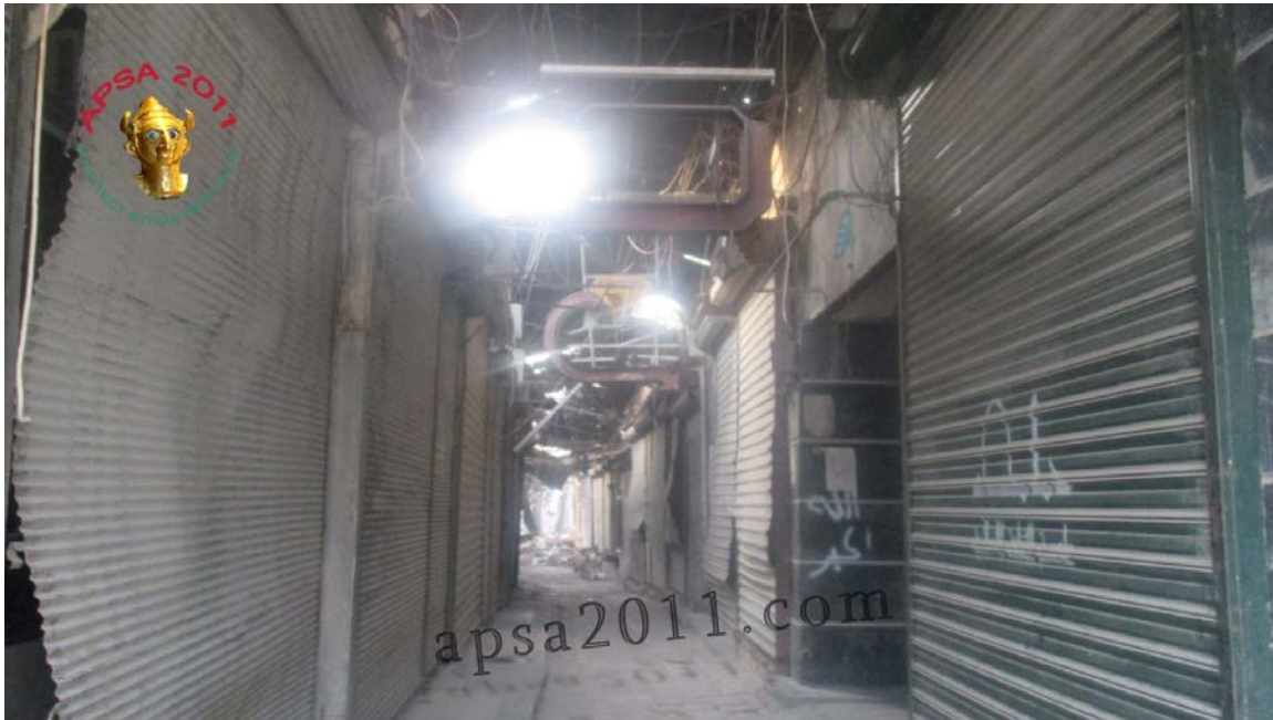
Recent photo of damage in the Suq Bab al-Hadid.