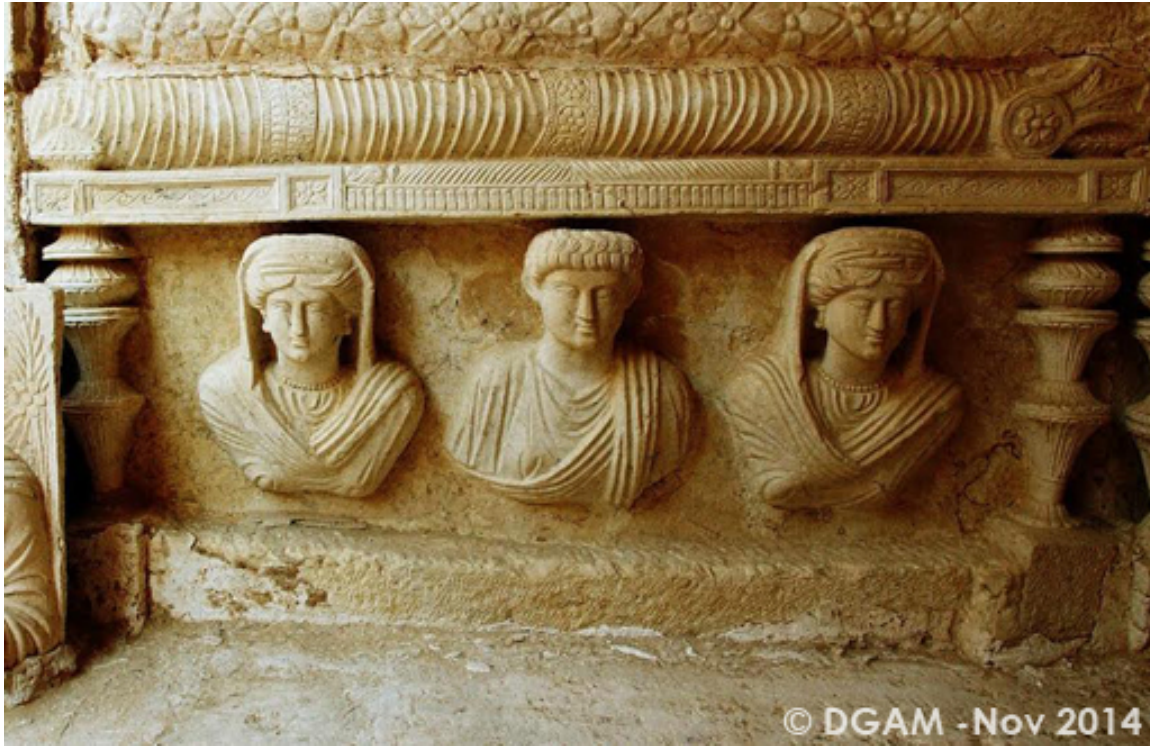
Taibul Tomb sculptures stolen from Palmyra and now recovered (DGAM).