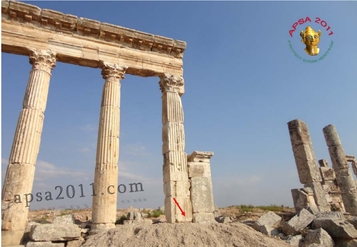
Looting damage at Apamea (APSA).