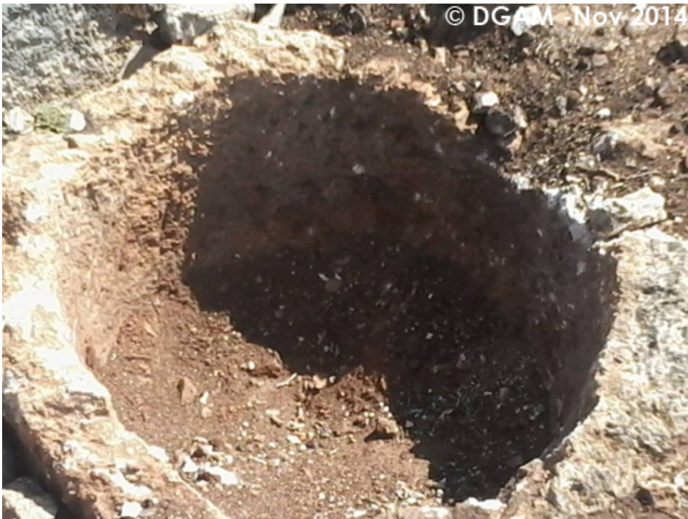
Kafr Aqab in the UNESCO WHS – Jebel Wastani Park.