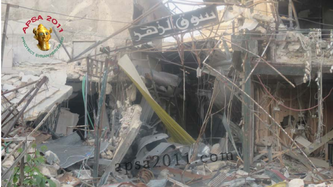
Recent photo of damage in the Suq Bab al-Hadid (APSA).