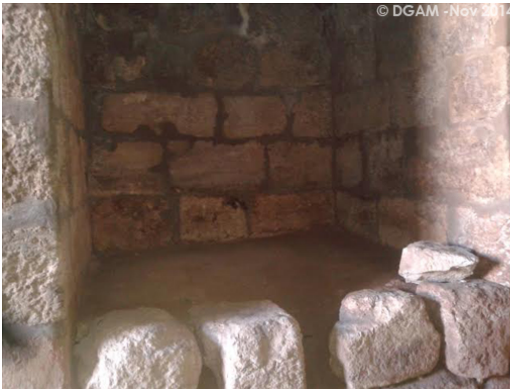
Interior of Harim Castle (DGAM).