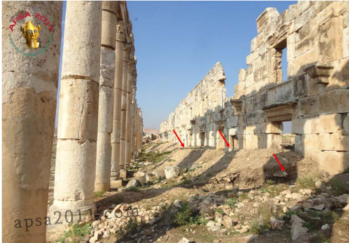
Looting damage at Apamea (APSA).