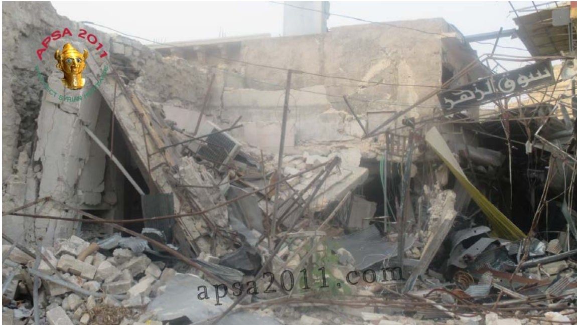
Recent photo of damage in the Suq Bab al-Hadid (APSA).