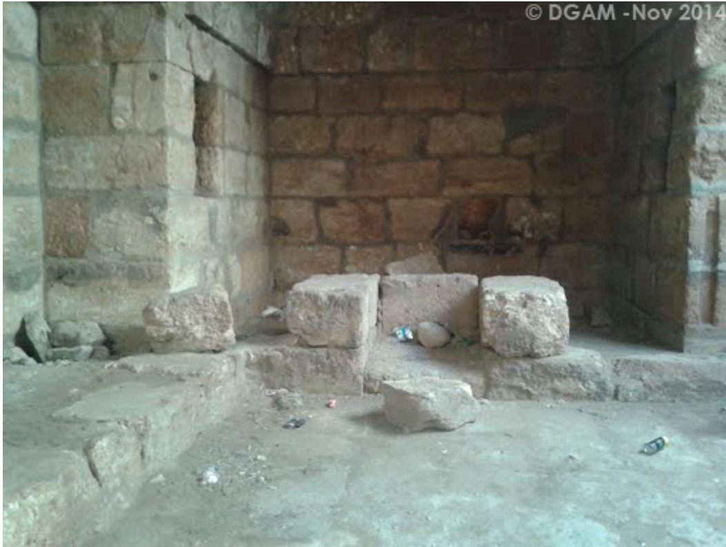
Interior of Harim Castle (DGAM).