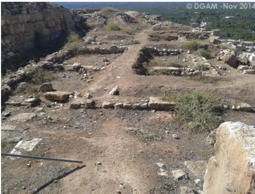
Excavation areas in the market area of Harim Castle (DGAM).