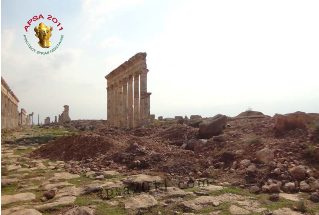
Looting damage at Apamea (APSA).