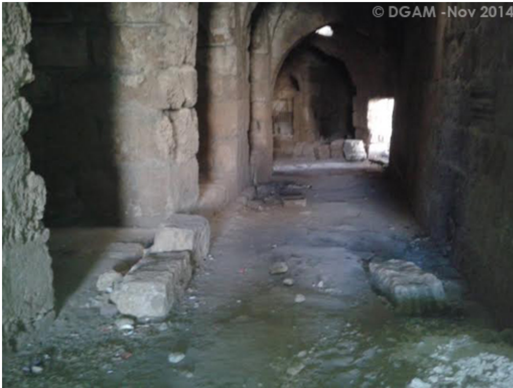
Interior of Harim Castle (DGMA).