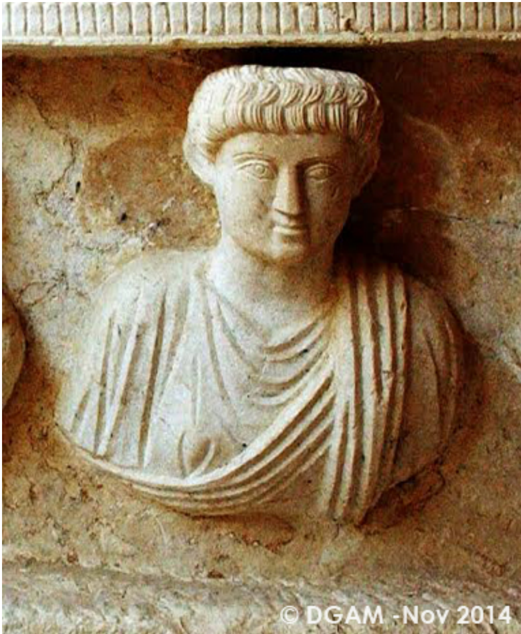
Taibul Tomb sculptures stolen from Palmyra and now recovered (DGAM).