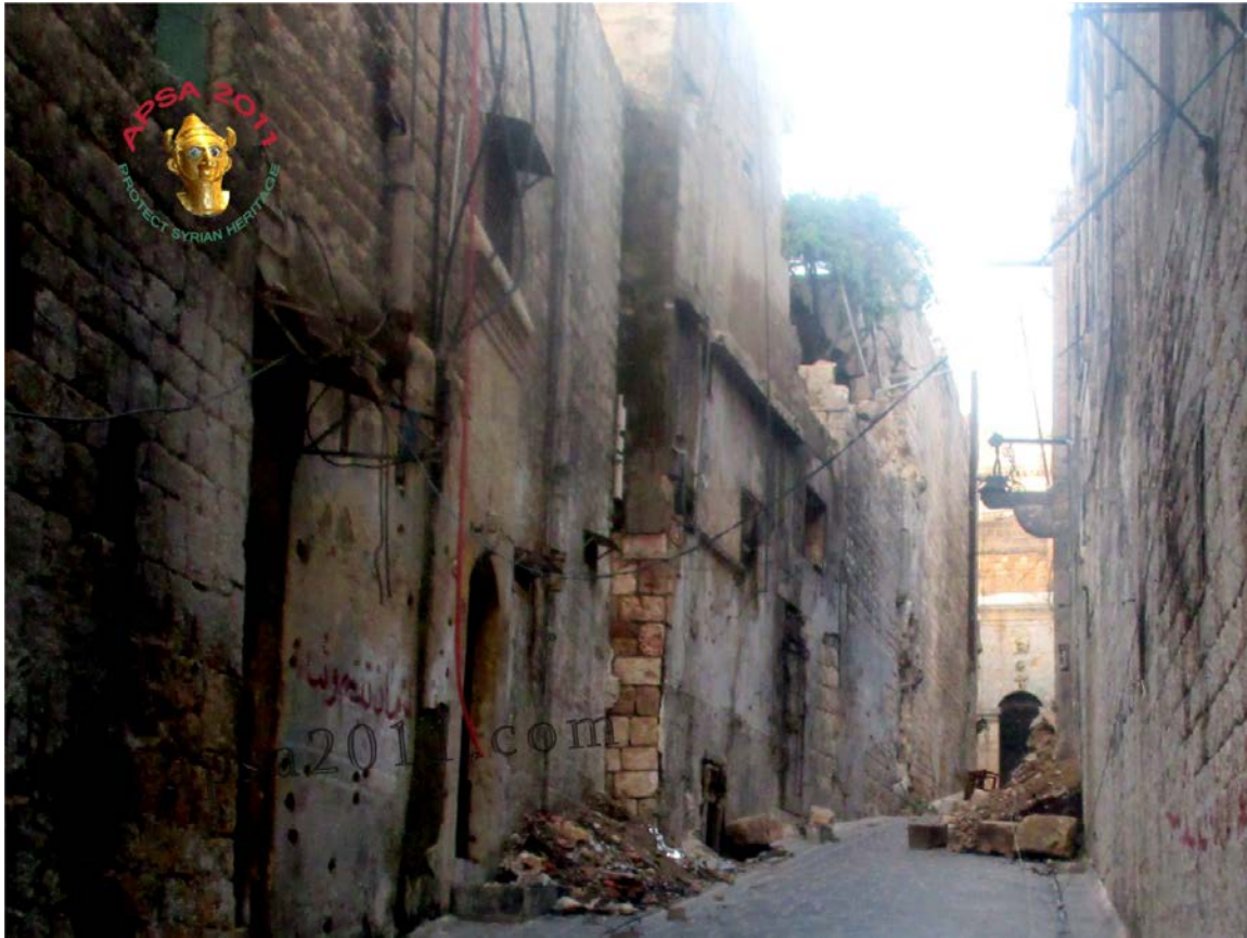
Recent photo of damage in the Suq Bab al-Hadid.