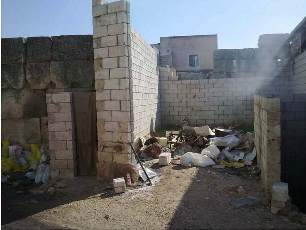
Balyun in Idlib Governorate (DGAM).