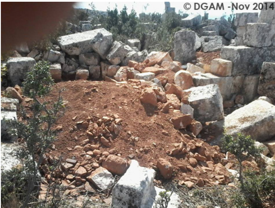
Kafr Aqab in the UNESCO WHS – Jebel Wastani Park (DGAM).