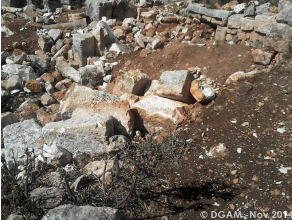
Kafr Aqab in the UNESCO WHS – Jebel Wastani Park.