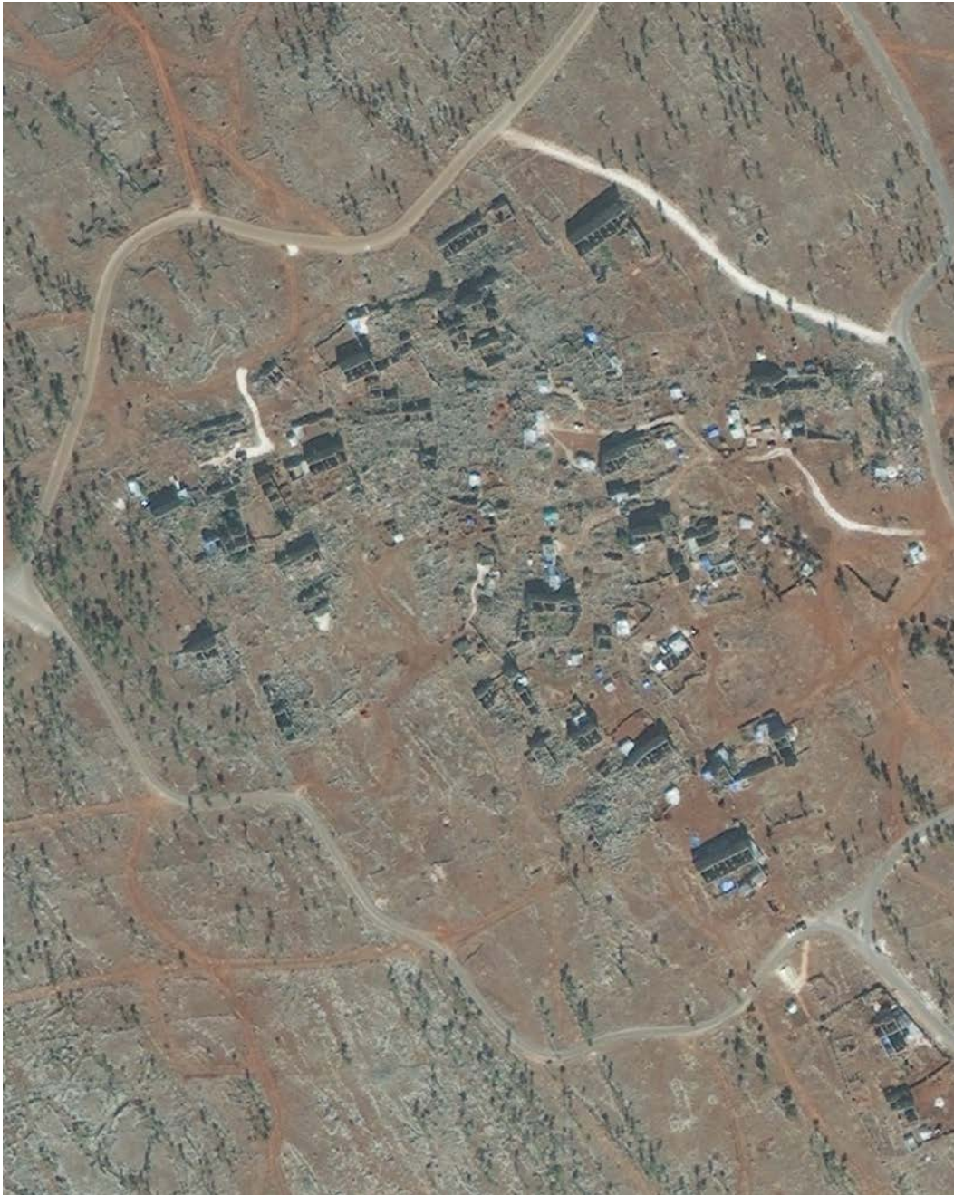
Digital Globe screen capture of the IDP settlement at Shinshara — note the blue tarps (Digital Globe, Oct. 12, 2013).

Ball, Warwick. 2007. Syria. A Historical and Architectural Guide . (Interlink Books), p. 185.