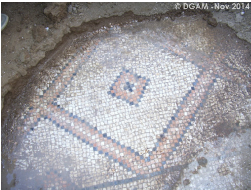
Tell Sheikh Hasan mosaic — date unknown.