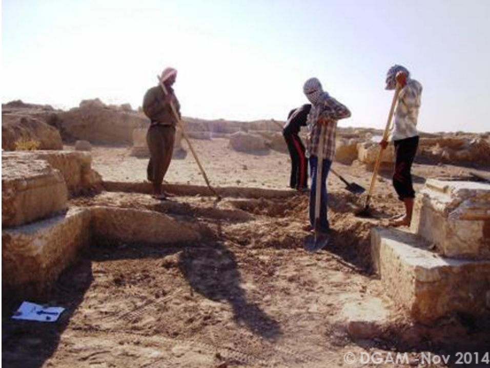
Excavations at Tell Sheikh Hasan — date unknown (DGAM).