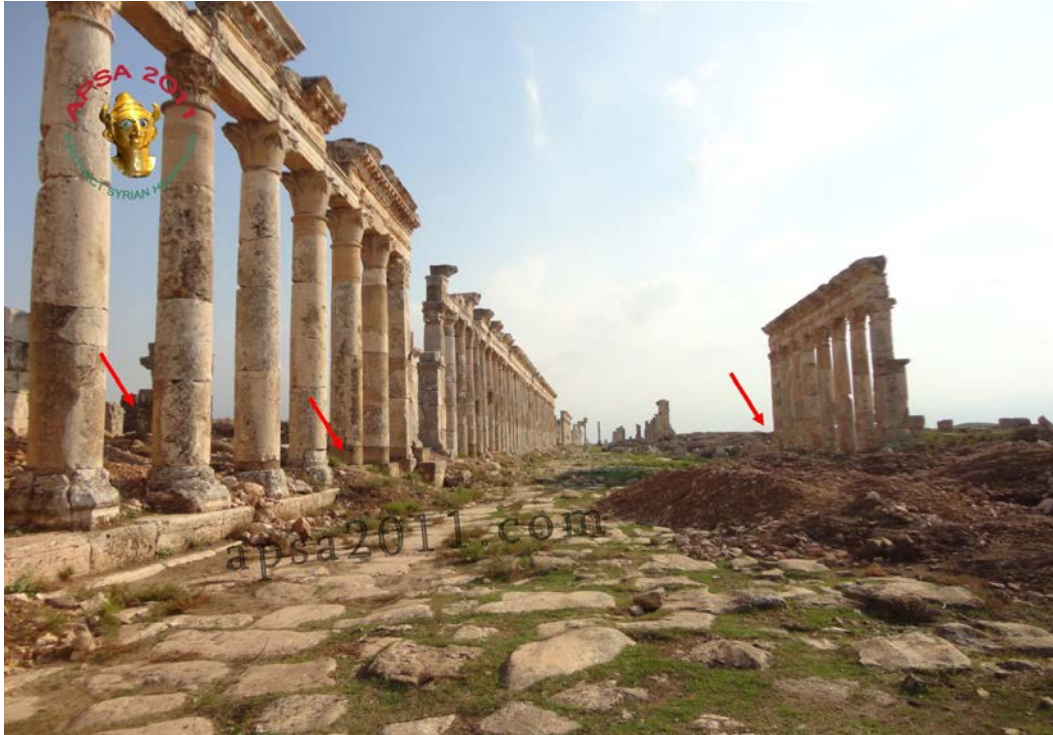
Looting damage at Apamea (APSA).