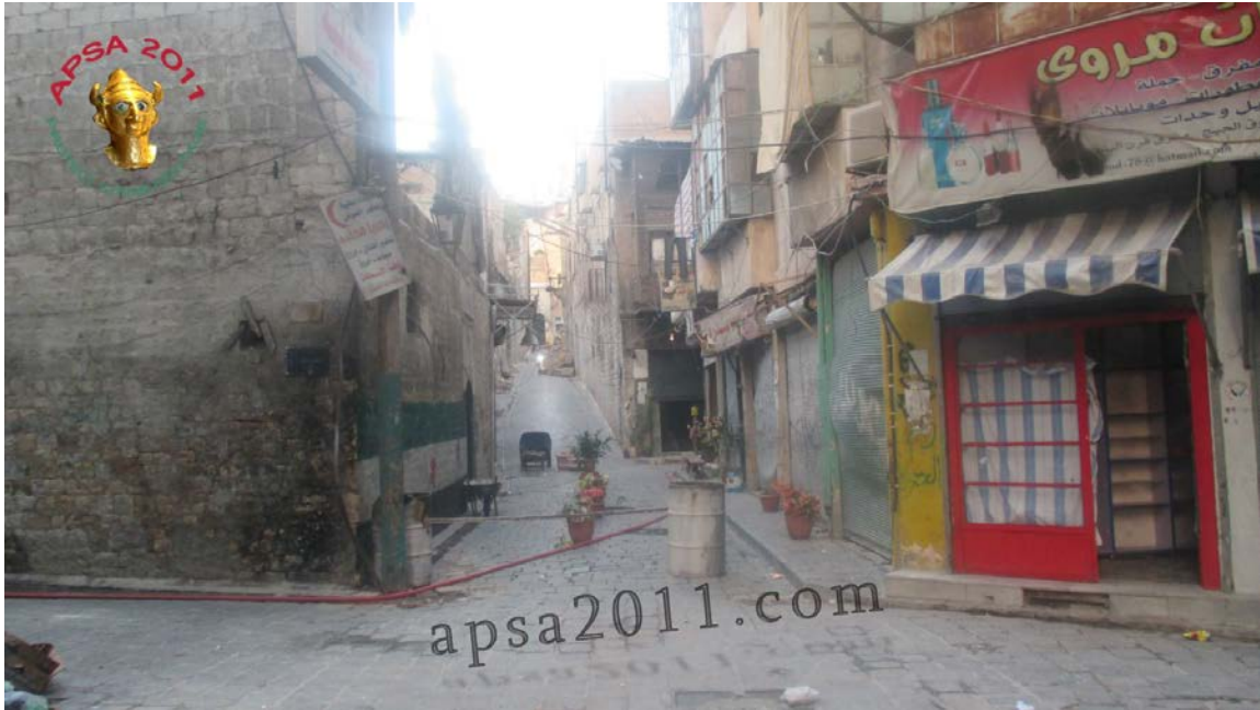
Undated photo of the Suq Bab al-Hadid.