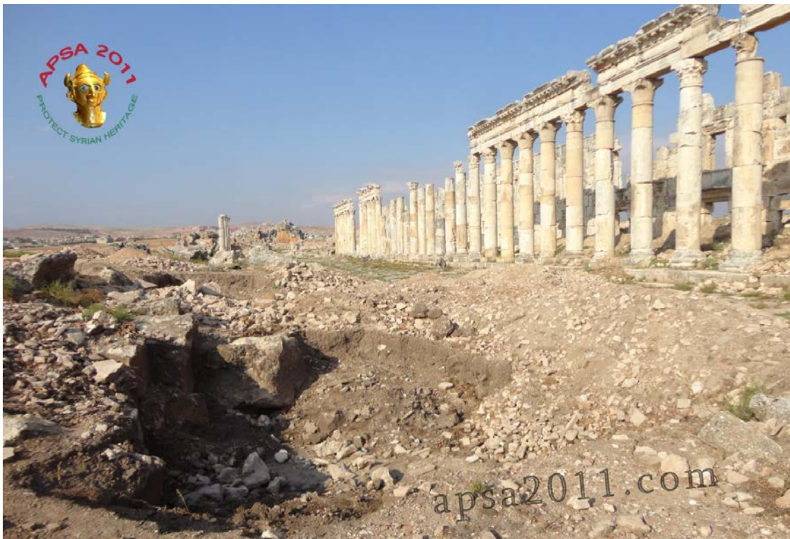
Looting damage at Apamea (APSA).