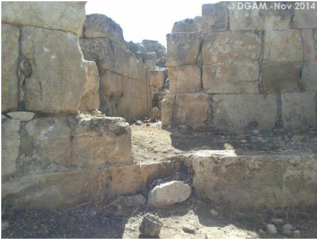
Harim Castle (DGAM).