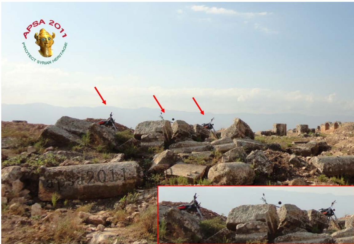
Motorcycles, probably belonging to looters, at Apamea (APSA).