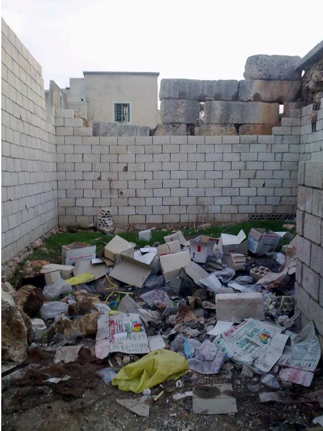
Illegal construction at Balyun, Idlib Governorate (DGAM).