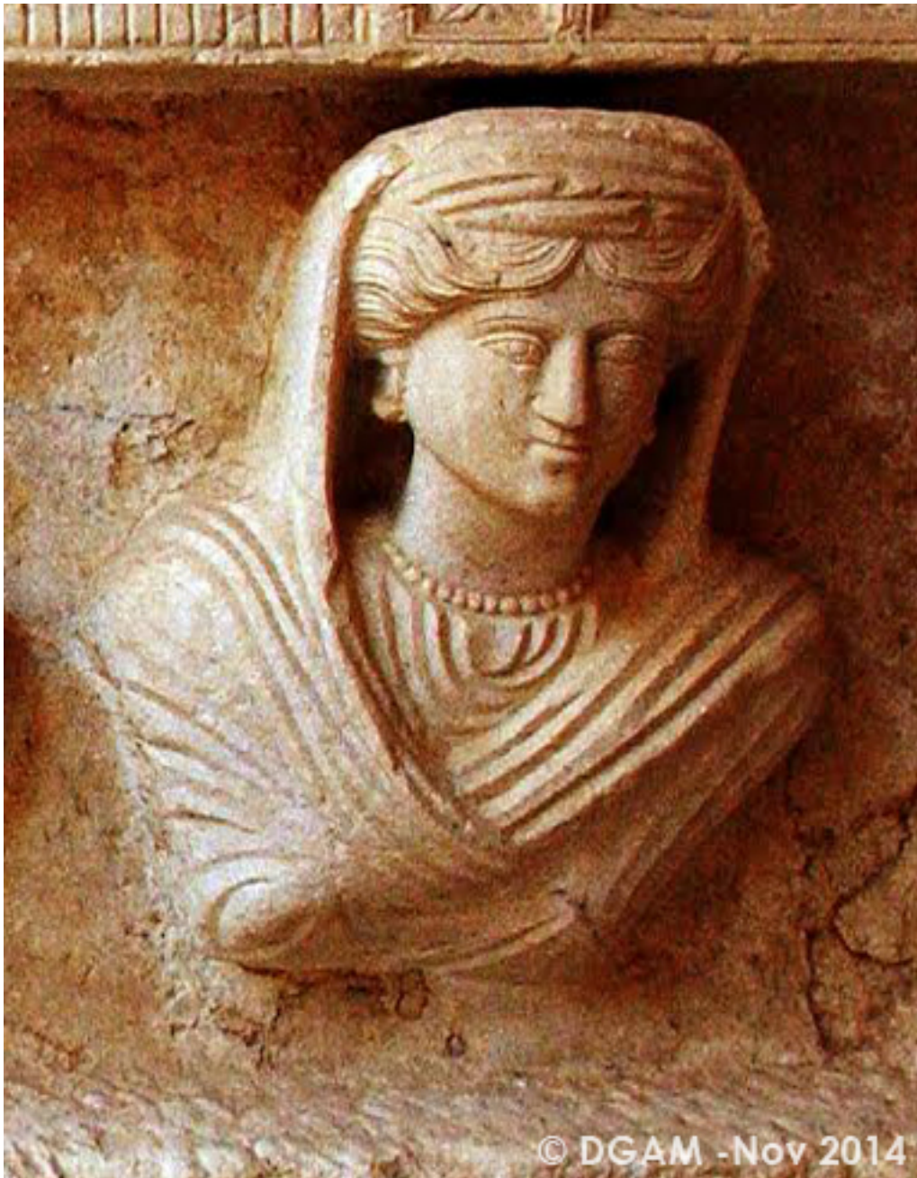
Taibul Tomb sculptures stolen from Palmyra and now recovered (DGAM).