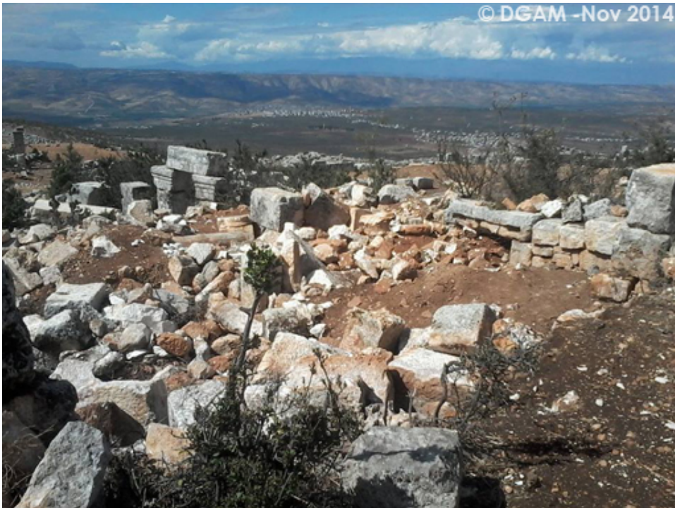
Kafr Aqab in the UNESCO WHS – Jebel Wastani Park.