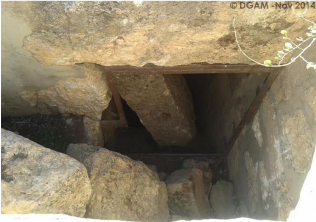
Interior corridors of Harim Castle showing recent vandalism (DGAM).