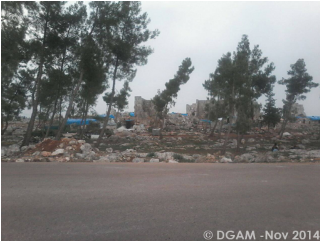
IDP settlement at the Byzantine site of Shinshara, Dead Cities region (APSA).