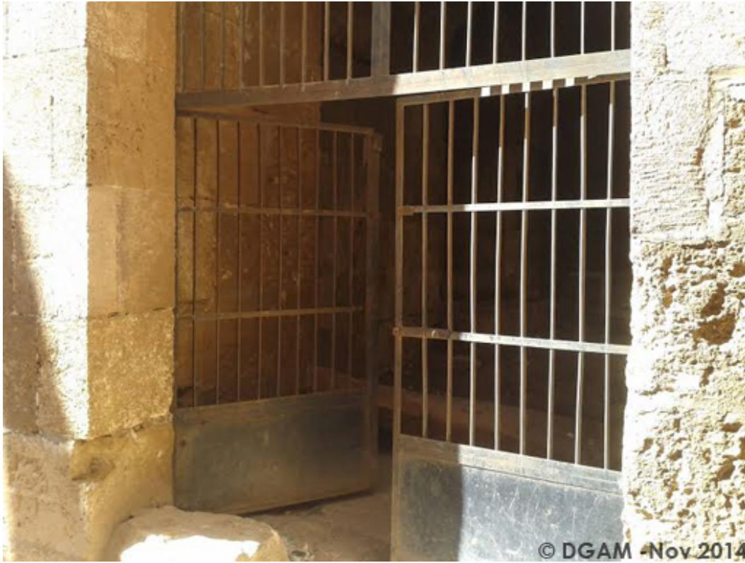
The main entrance of Harim Castle (DGAM).