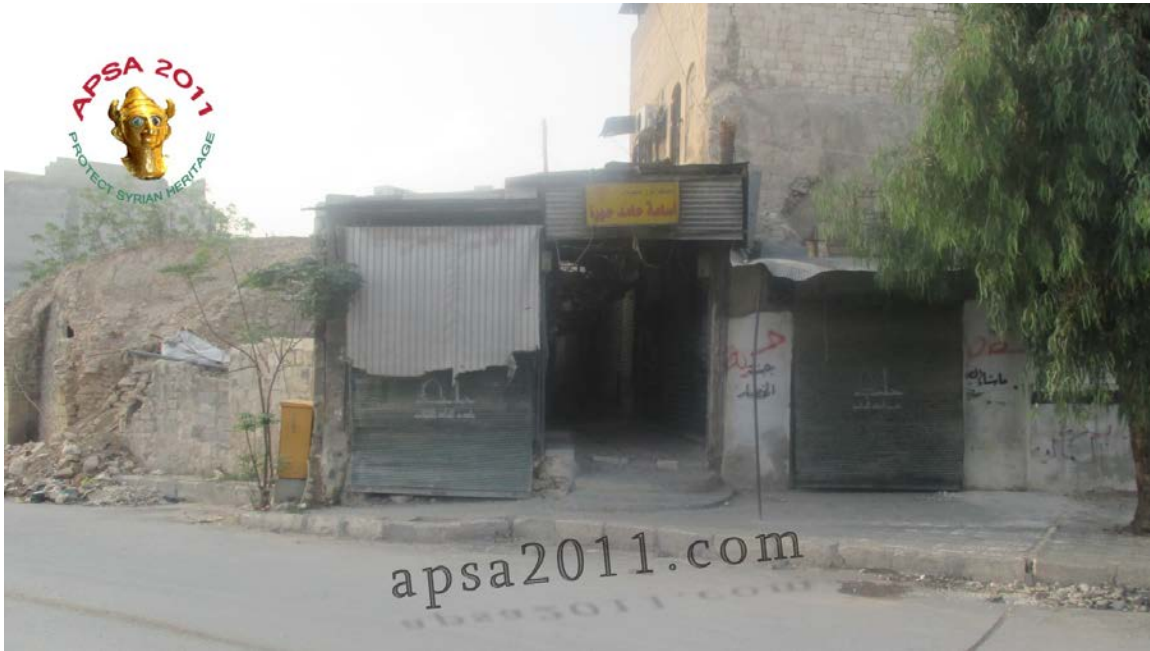
Recent photo of damage in the Suq Bab al-Hadid (APSA).