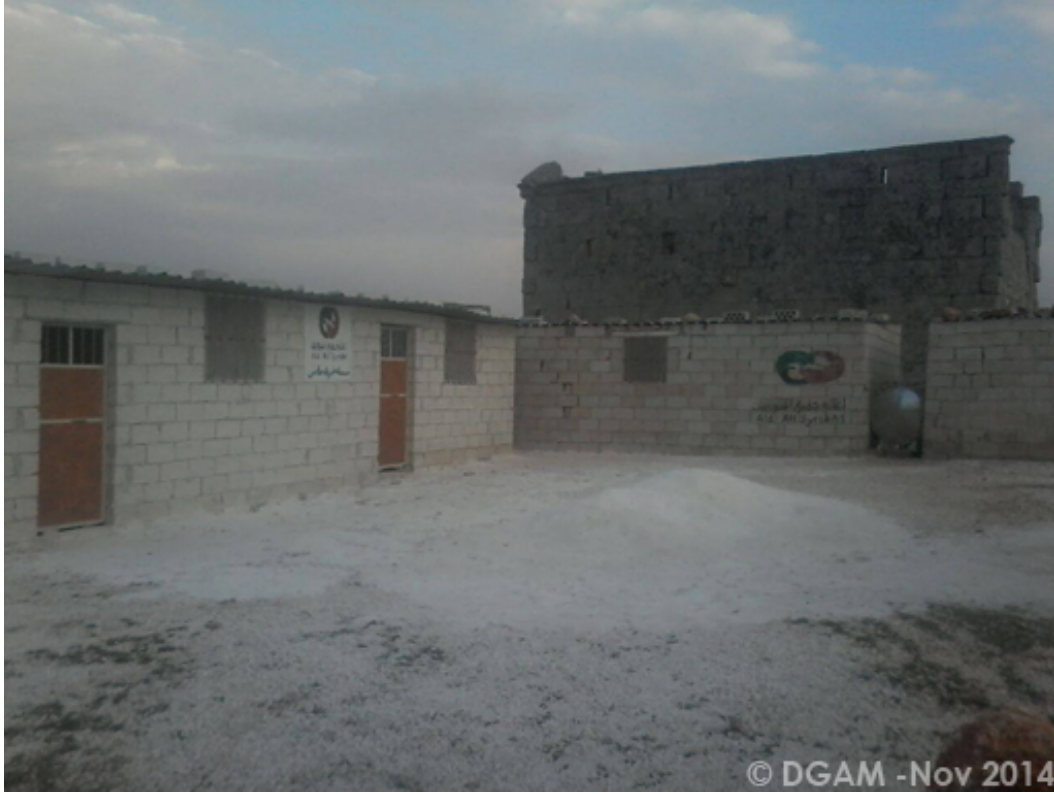
IDP settlement at the Byzantine site of Shinsharah, Dead Cities region (APSA).