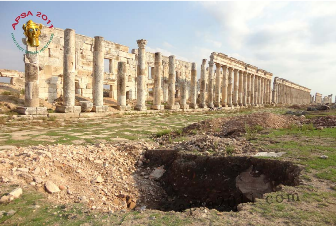
Looting damage at Apamea (APSA).