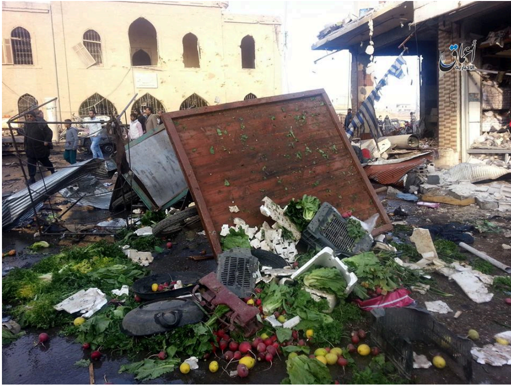
Airstrike damage to Arafat Square, the surrounding market, and the Raqqa Museum (DGAM).