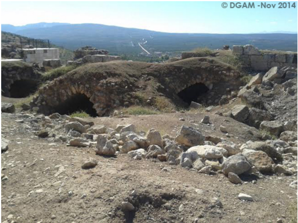
Harim Castle (DGAM).