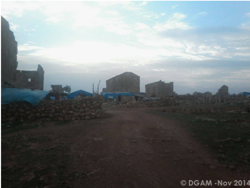
IDP settlement at the Byzantine site of Shinshara, Dead Cities region (APSA).