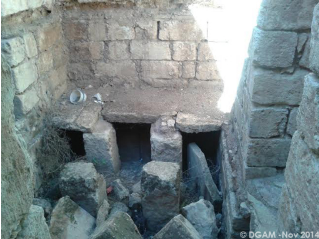
Harim Castle interior (DGAM).