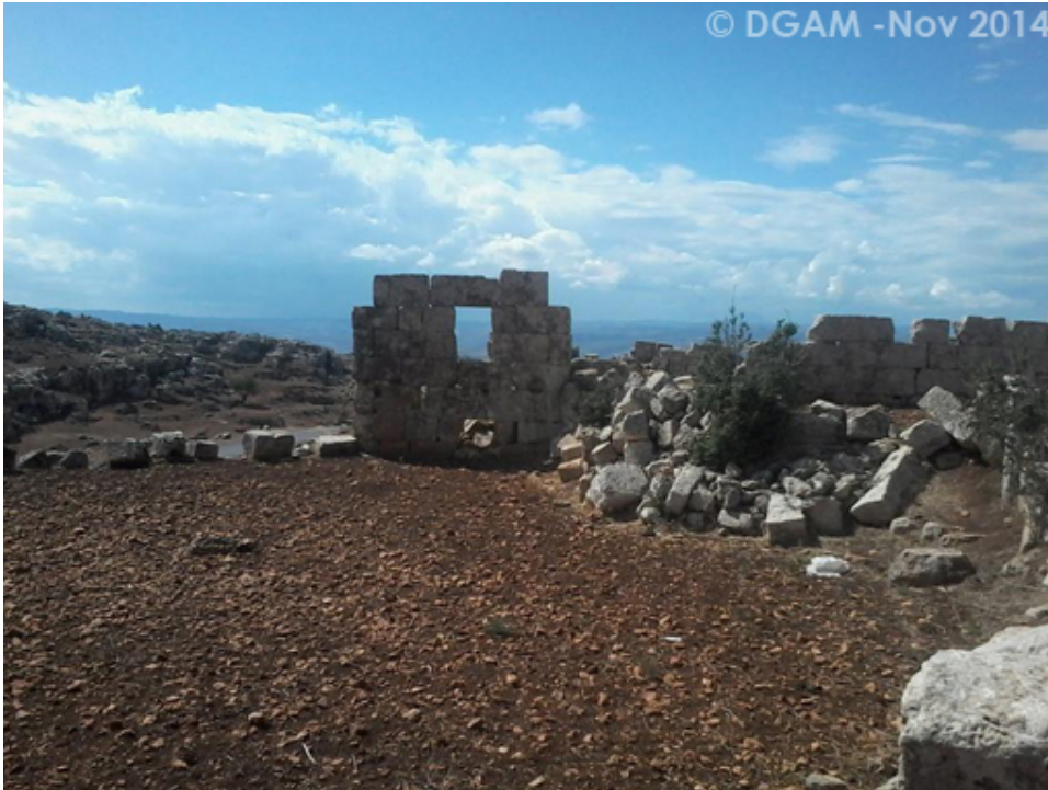
Kafr Aqab in the UNESCO WHS – Jebel Wastani Park.