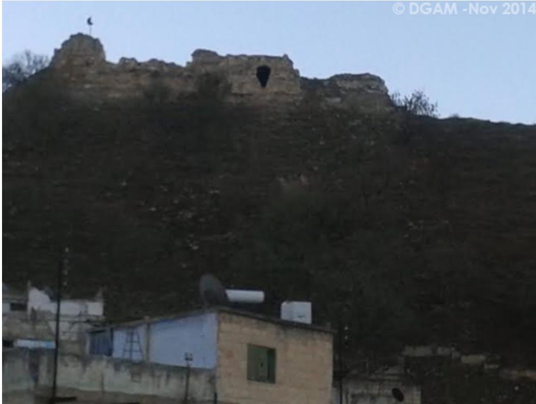
View of Harim Castle from the modern town of the same name (DGAM).