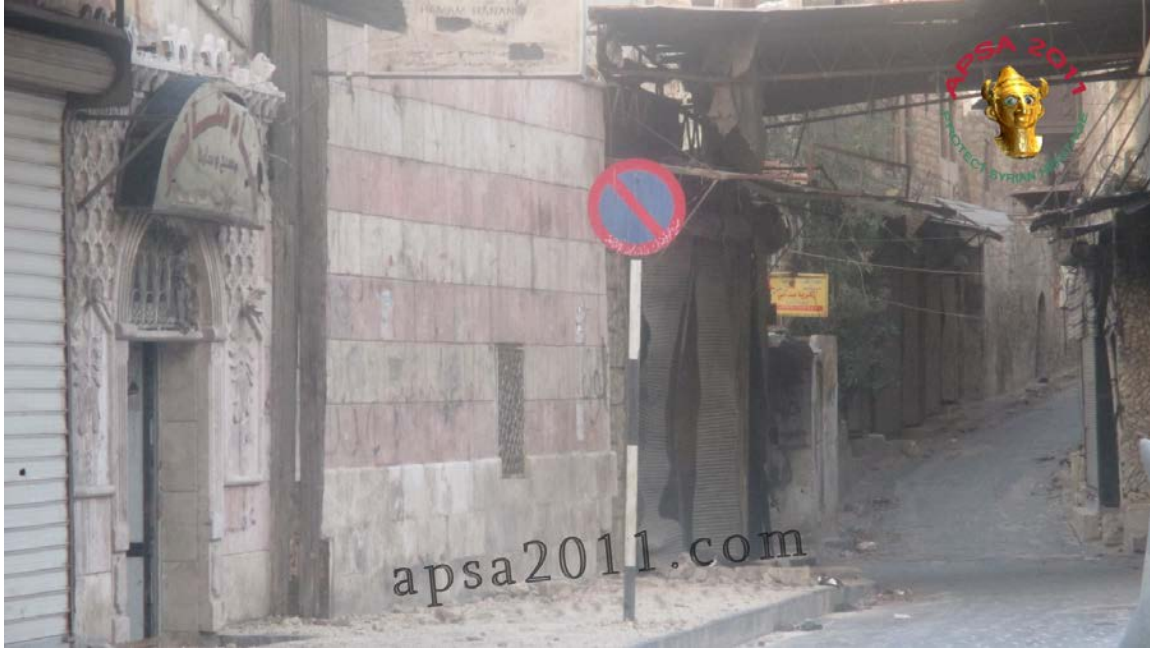
Recent photo of damage in the Suq Bab al-Hadid (APSA).