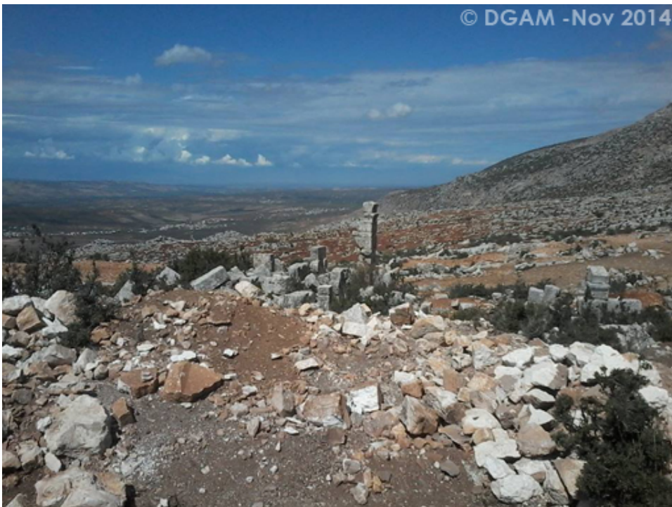
Kafr Aqab in the UNESCO WHS – Jebel Wastani Park.