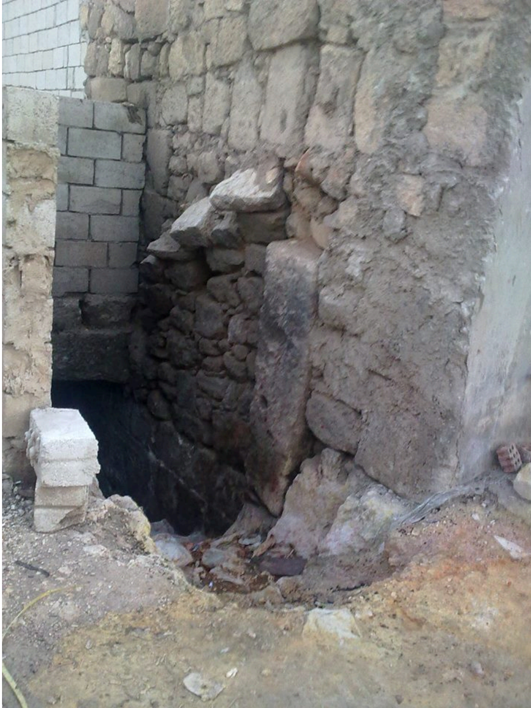
Illegal construction and excavation at Balyun, Idlib Governorate (DGAM).