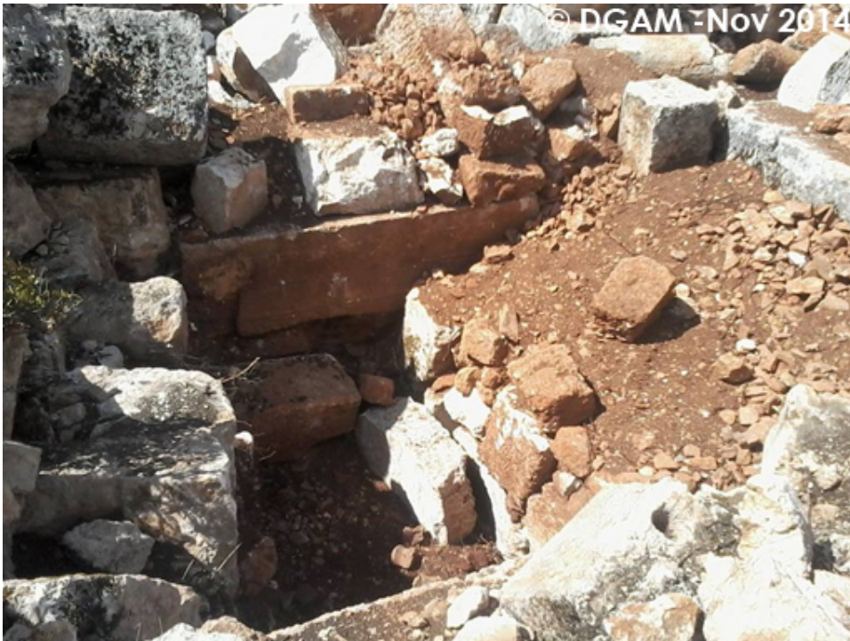
Kafr Aqab in the UNESCO WHS – Jebel Wastani Park.