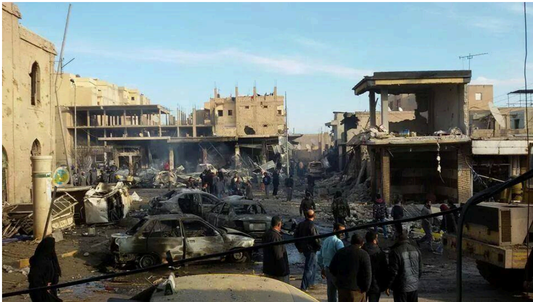
Airstrike damage to Arafat Square and the façade of the Raqqa Museum (left).