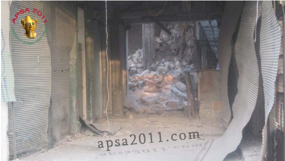
Recent photo of damage in the Suq Bab al-Hadid.