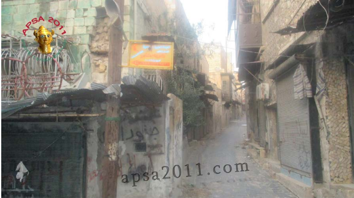
Recent photo of damage in the Suq Bab al-Hadid.