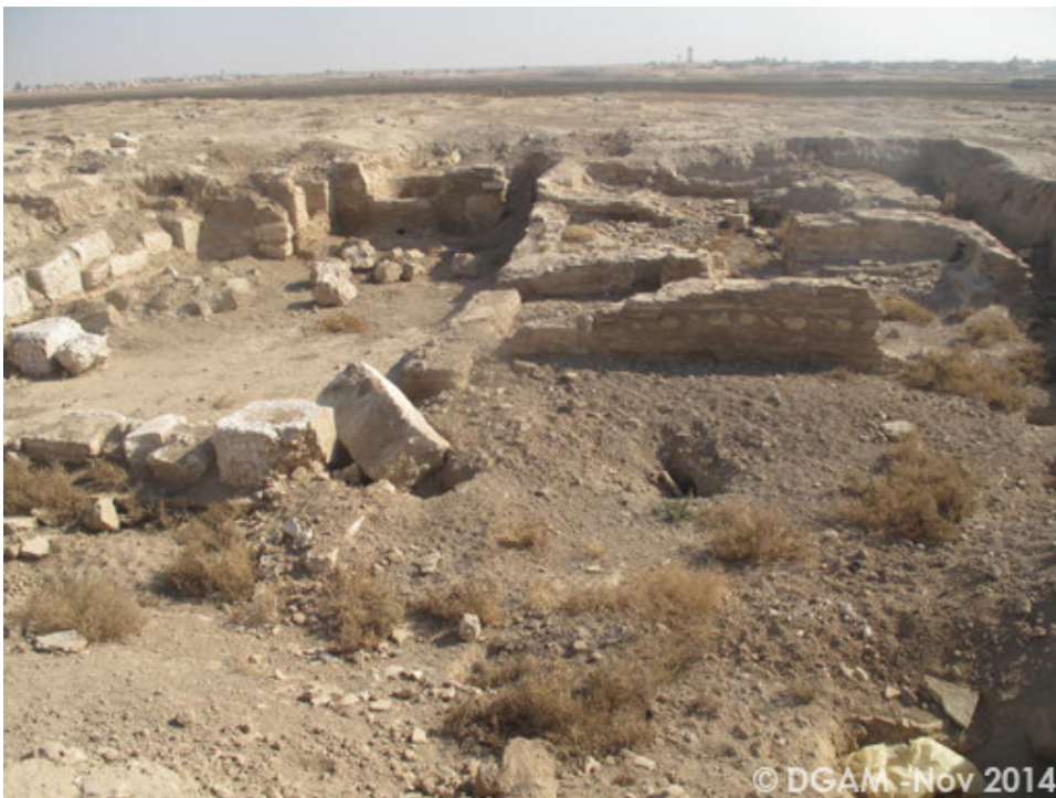
Tell Sheikh Hasan showing some evidence of disturbance of previously excavated areas.

_____. "Tell Sheikh Hassan: Funde aus römisch-parthischer, spätrömisch-frühbyzantinischer und islamischer Zeit." Archiv für Orientforschung (1999): 447–489.