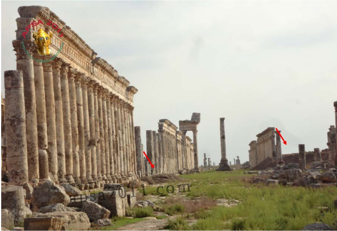
Looting damage at Apamea (APSA).