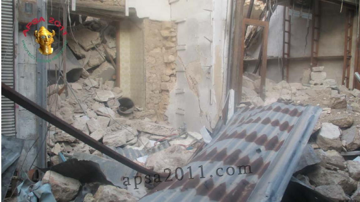
Recent photo of damage in the Suq Bab al-Hadid (APSA).