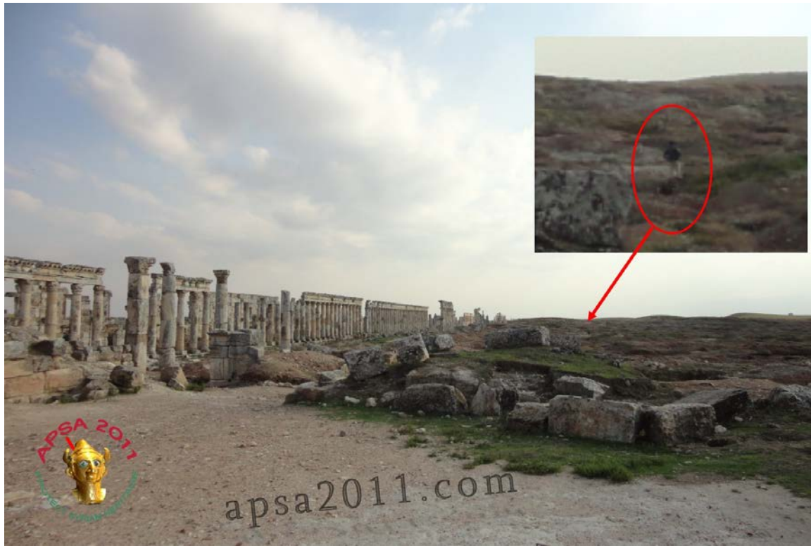
A looter (?) at Apamea (APSA).