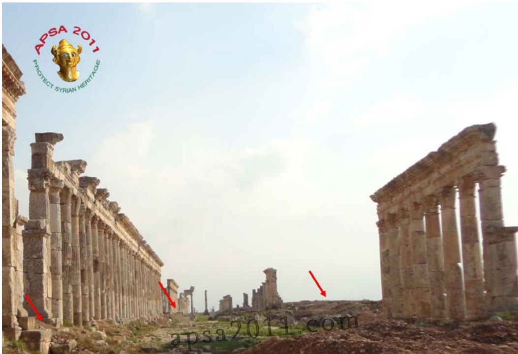
Looting damage at Apamea (APSA).