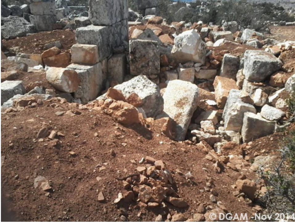
Kafr Aqab in the UNESCO WHS – Jebel Wastani Park (DGAM).