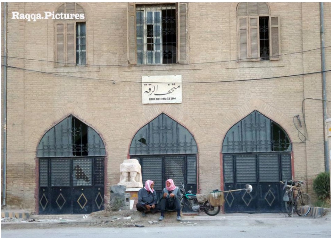
The Raqqa Museum prior to the airstrike (DGAM).