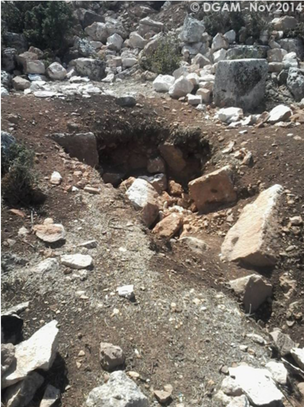
Kafr Aqab in the UNESCO WHS – Jebel Wastani Park.