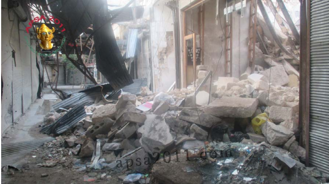
Recent photo of damage in the Suq Bab al-Hadid.