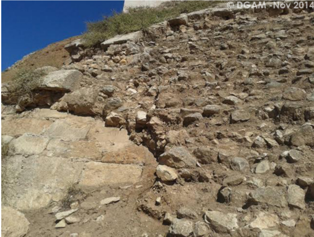
The glacis of Harim Castle near the main entrance — it is similar to that of the Aleppo Citadel (DGAM).