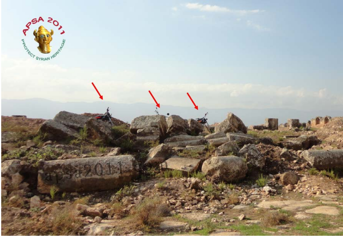
Motorcycles, probably belonging to looters, at Apamea (APSA).