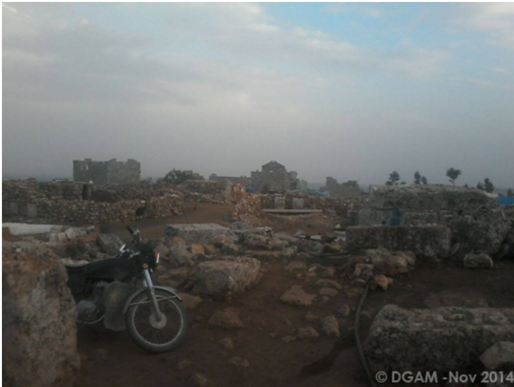
IDP settlement at the Byzantine site of Shinsharah, Dead Cities region (APSA).