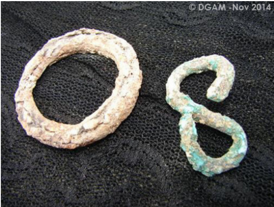
Objects allegedly from Tell Sheikh Hasan (DGAM).