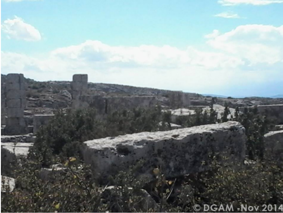
Kafr Aqab in the UNESCO WHS – Jebel Wastani Park.