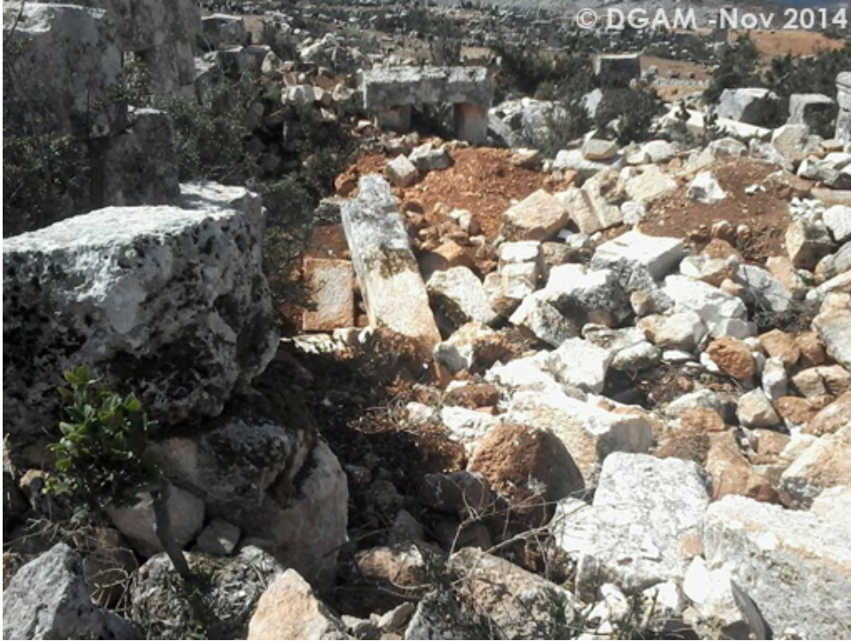
Kafr Aqab in the UNESCO WHS – Jebel Wastani Park.