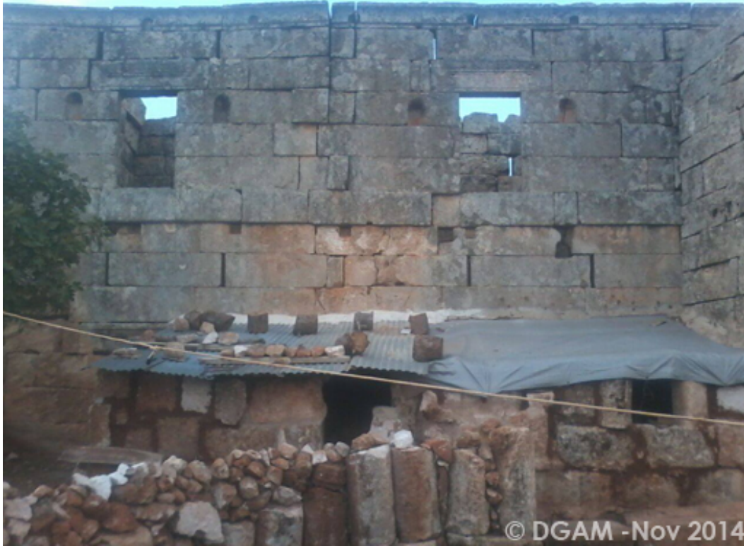
IDP settlement at the Byzantine site of Shinshara, Dead Cities region (APSA).