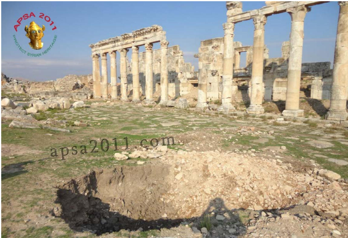
Looting damage at Apamea (APSA).