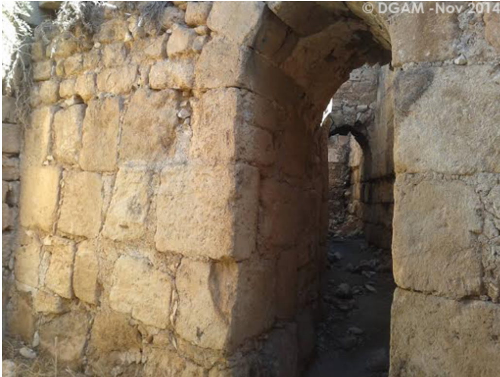
Interior of Harim Castle (DGAM).