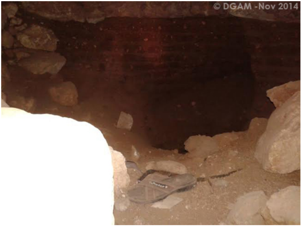
Interior of Harim Castle (DGAM).