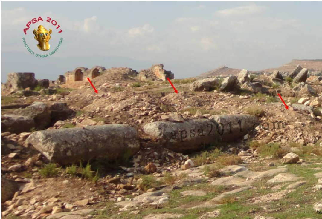
Looting damage at Apamea (APSA).