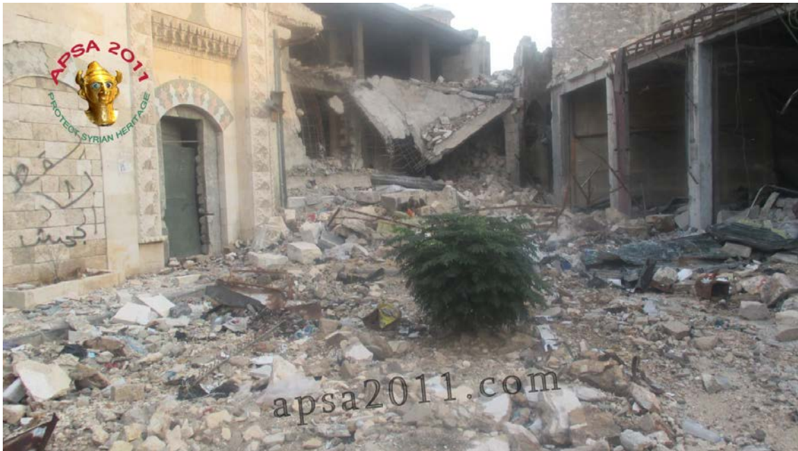
Recent photo of damage in the Suq Bab al-Hadid.