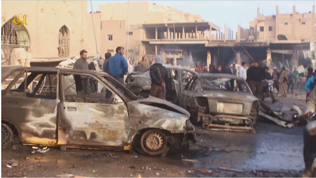
Airstrike damage to Arafat Square and the façade of the Raqqa Museum (left) (DGAM).