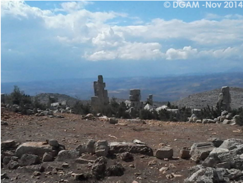
Kafr Aqab in the UNESCO WHS – Jebel Wastani Park.