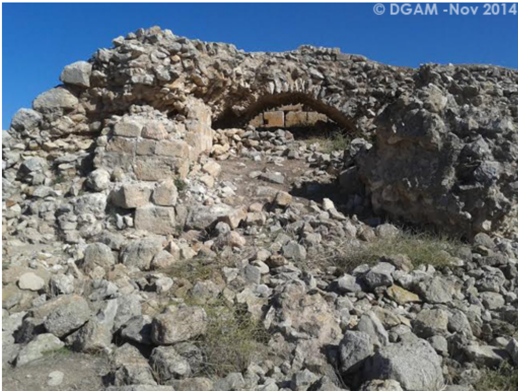
View of Harim Castle (DGAM).