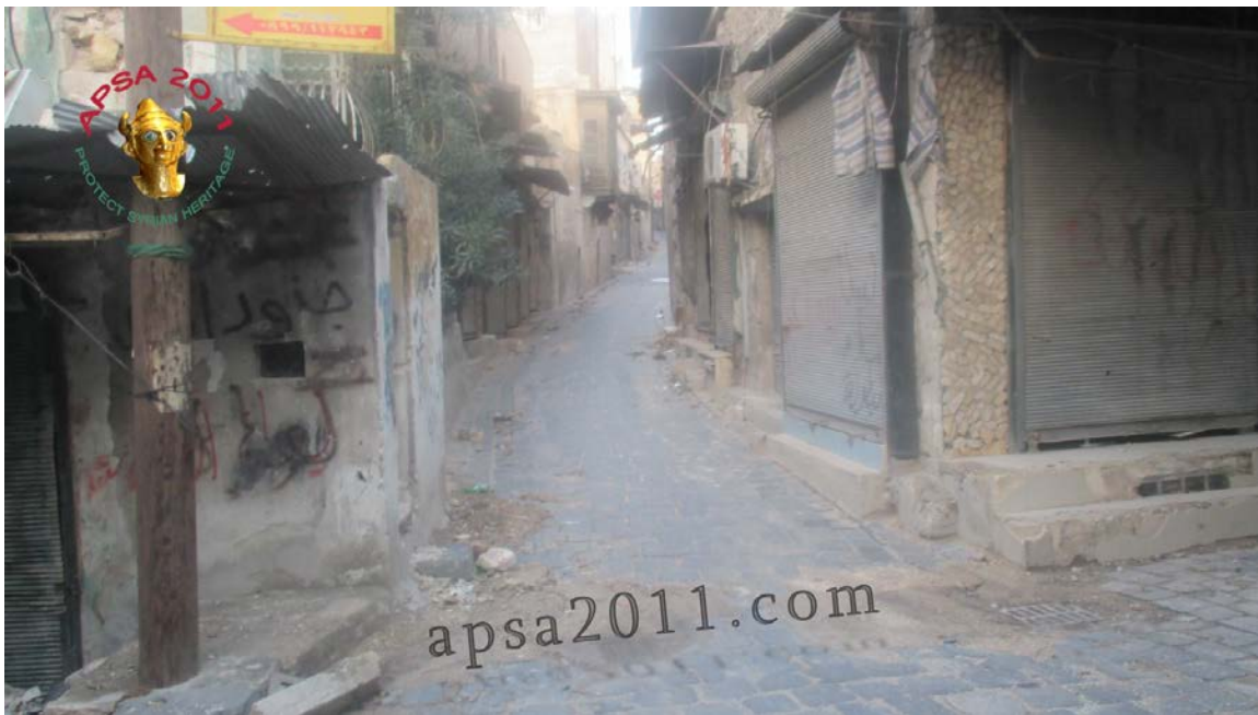
Recent photo of damage in the Suq Bab al-Hadid (APSA).