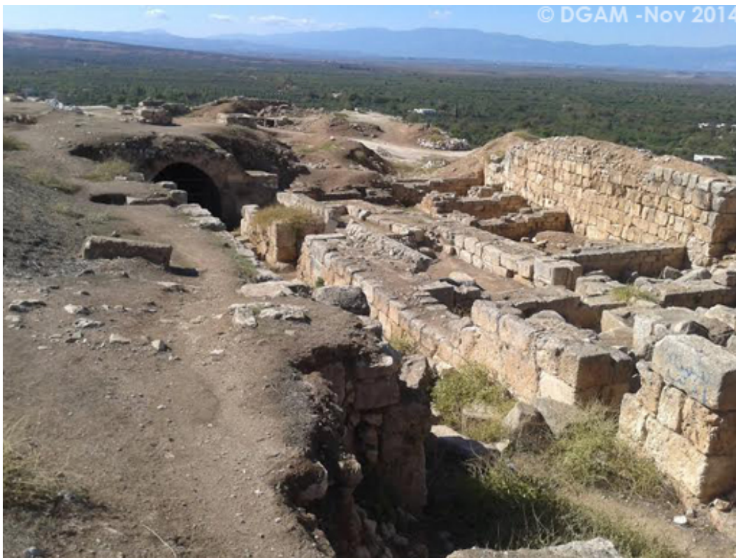
Harim Castle (DGAM).