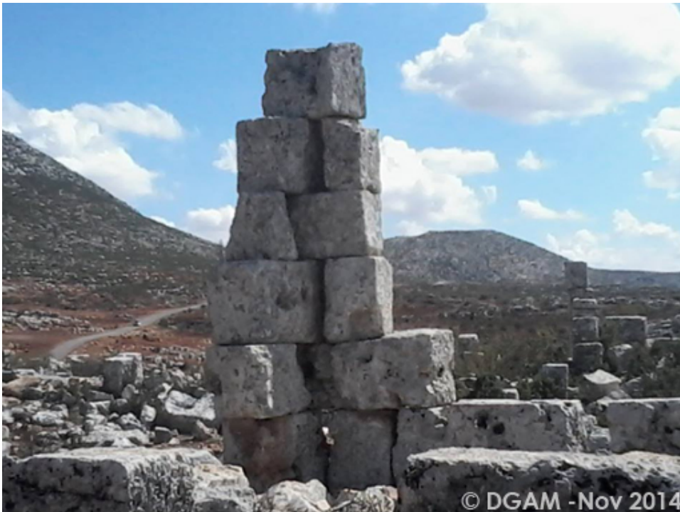
Kafr Aqab in the UNESCO WHS – Jebel Wastani Park (DGAM).