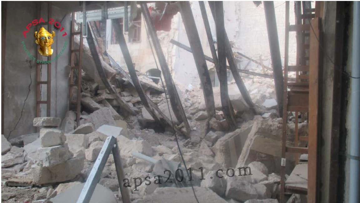
Recent photo of damage in the Suq Bab al-Hadid (APSA).