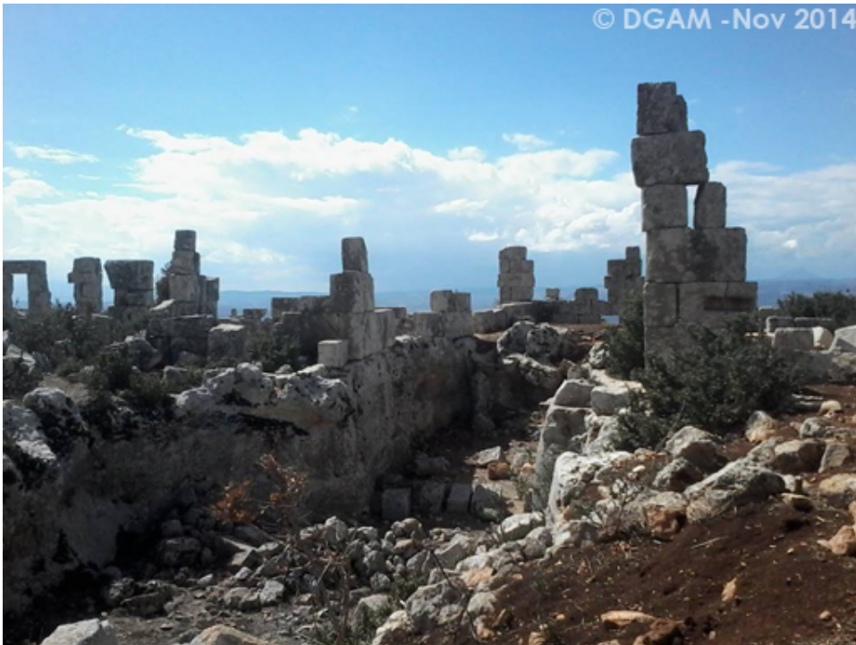
Kafr Aqab in the UNESCO WHS – Jebel Wastani Park.