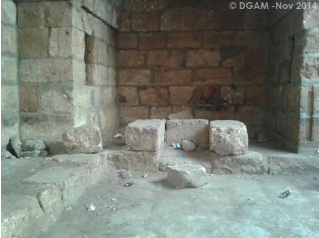
Harim Castle (DGAM).