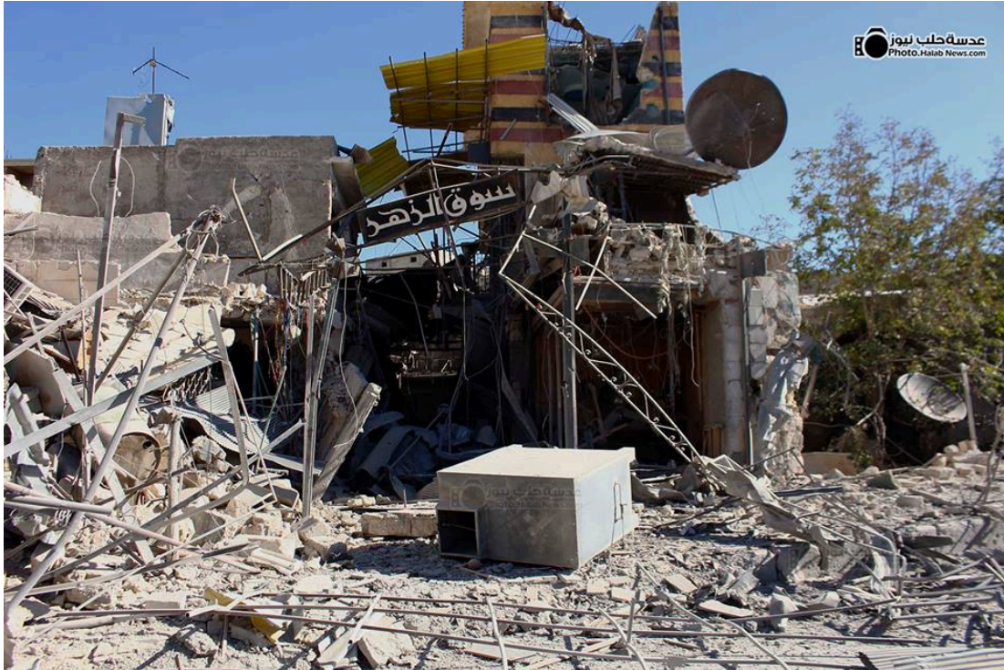
Recent photo of the Bab al-Hadid area (APSA).