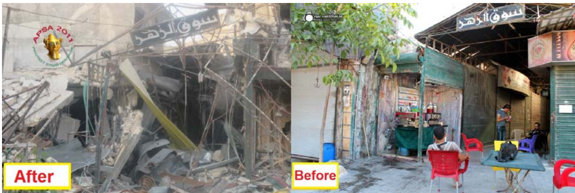
Before and after of the Bab al-Hadid destruction.