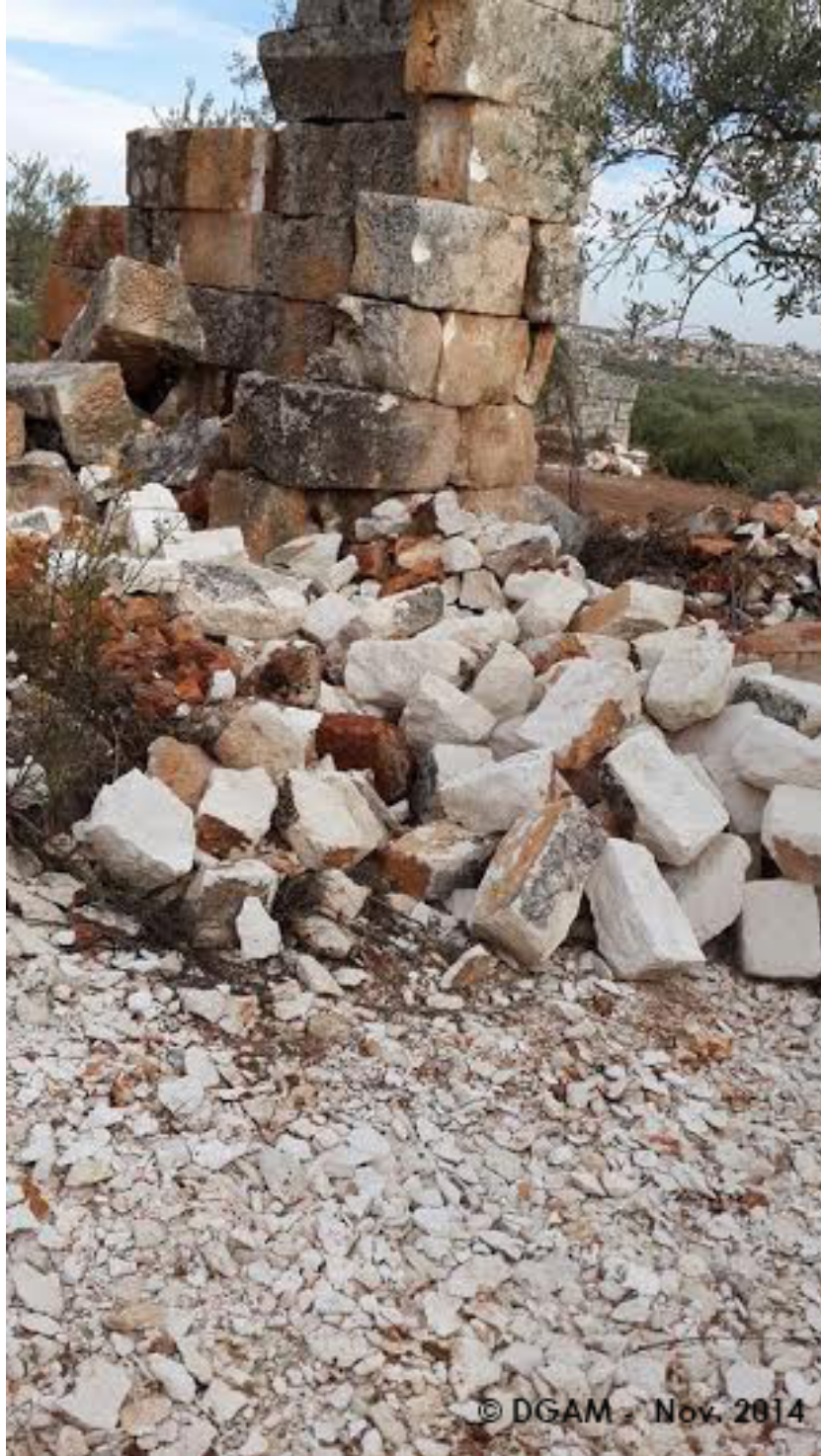
Damage to Al-Bara (DGAM).