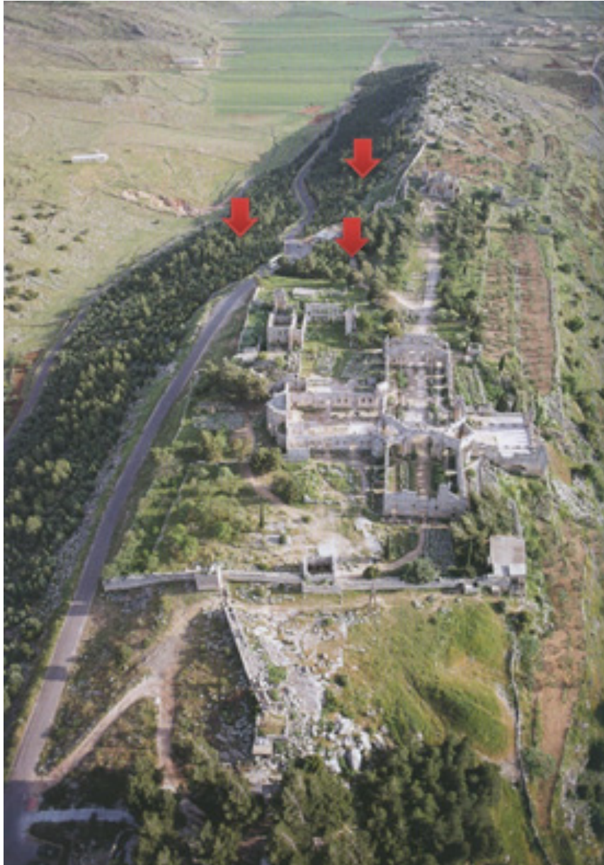
Qala'at Samaan Castle and areas affected by explosions while the site was occupied and looted by extremists (DGAM).