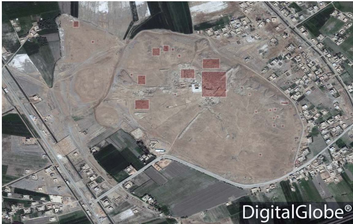
Satellite image of Mari dating to March 25, 2014 – significant looting evident and recent construction.