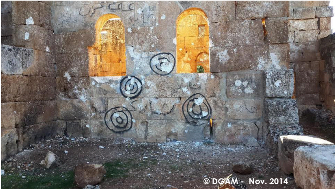
Damage to al-Bara, (DGAM).

Tchalenko, Georges. 1953–58. Villages antiques de la Syrie du nord. La massif du Bélus à l'époque romaine . Three volumes. Paris.