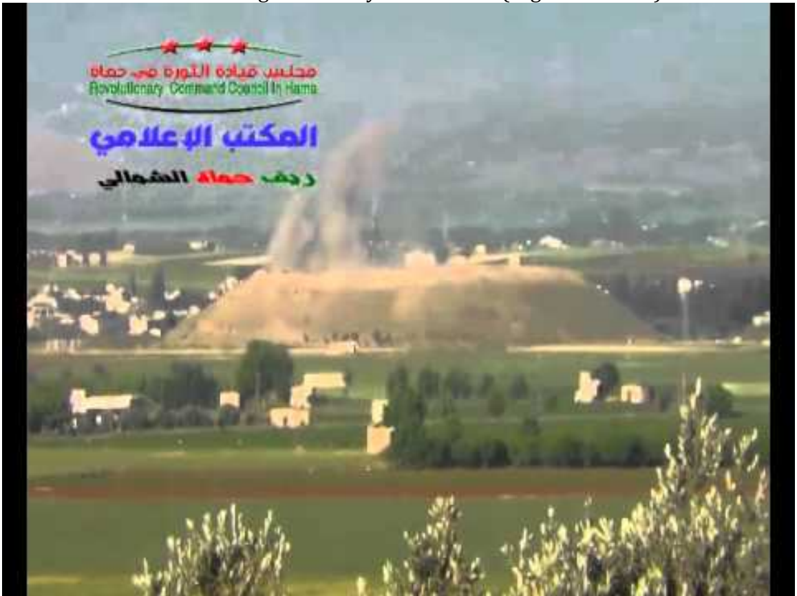
Tell Meleh (APSA).