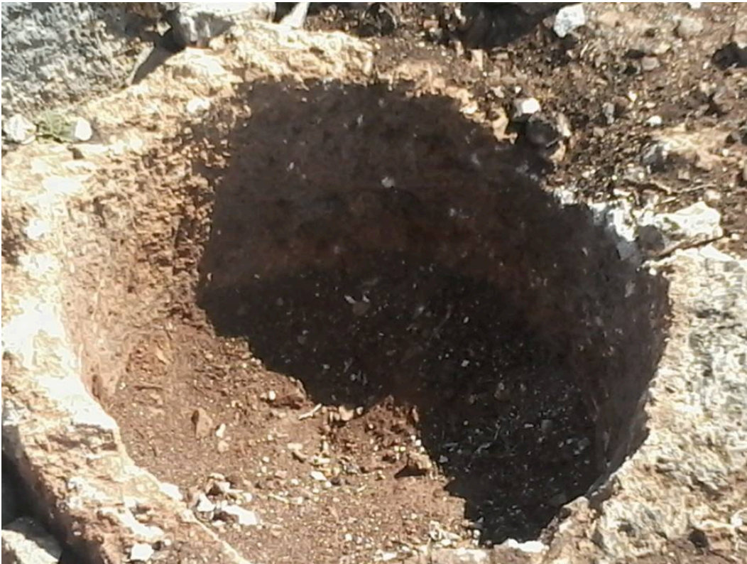
Damage to Kafr Aqab (APSA).