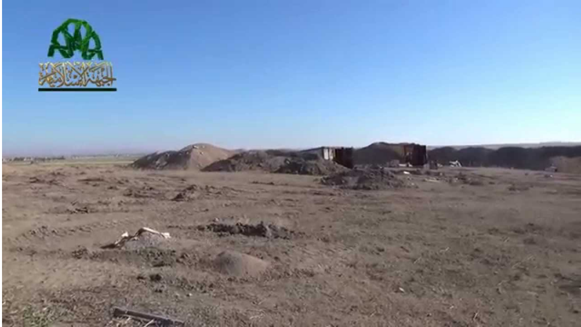
SARG earthworks on Tell Meleh.