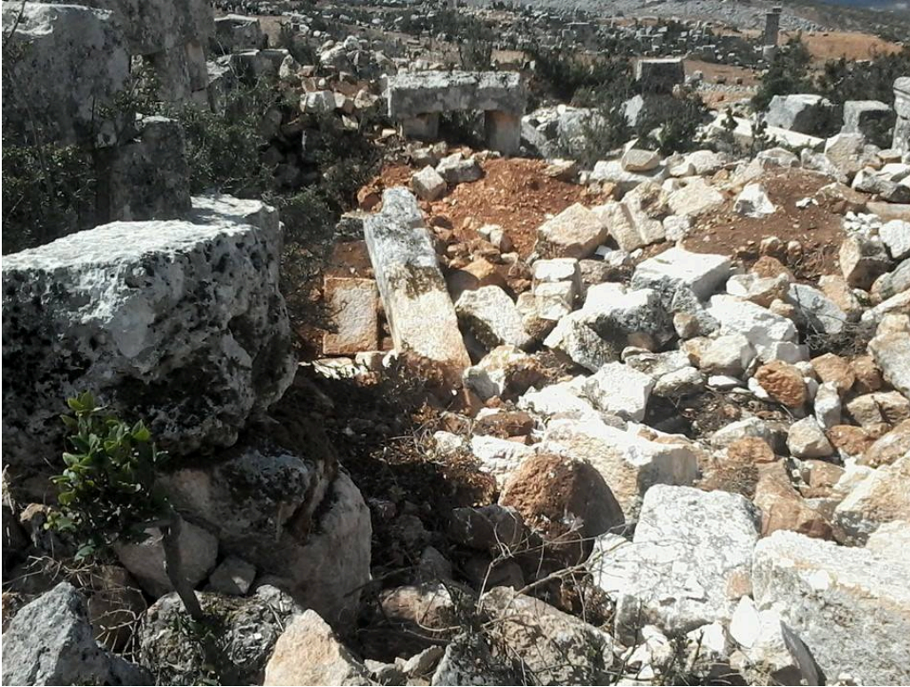
Damage to Kafr Aqab (APSA).