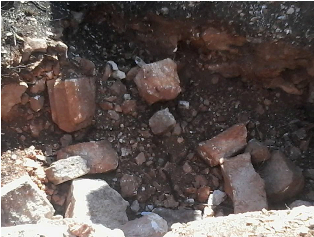
Damage to Kafr Aqab (APSA).