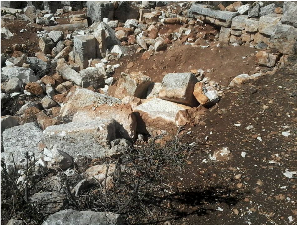
Damage to Kafr Aqab (APSA).