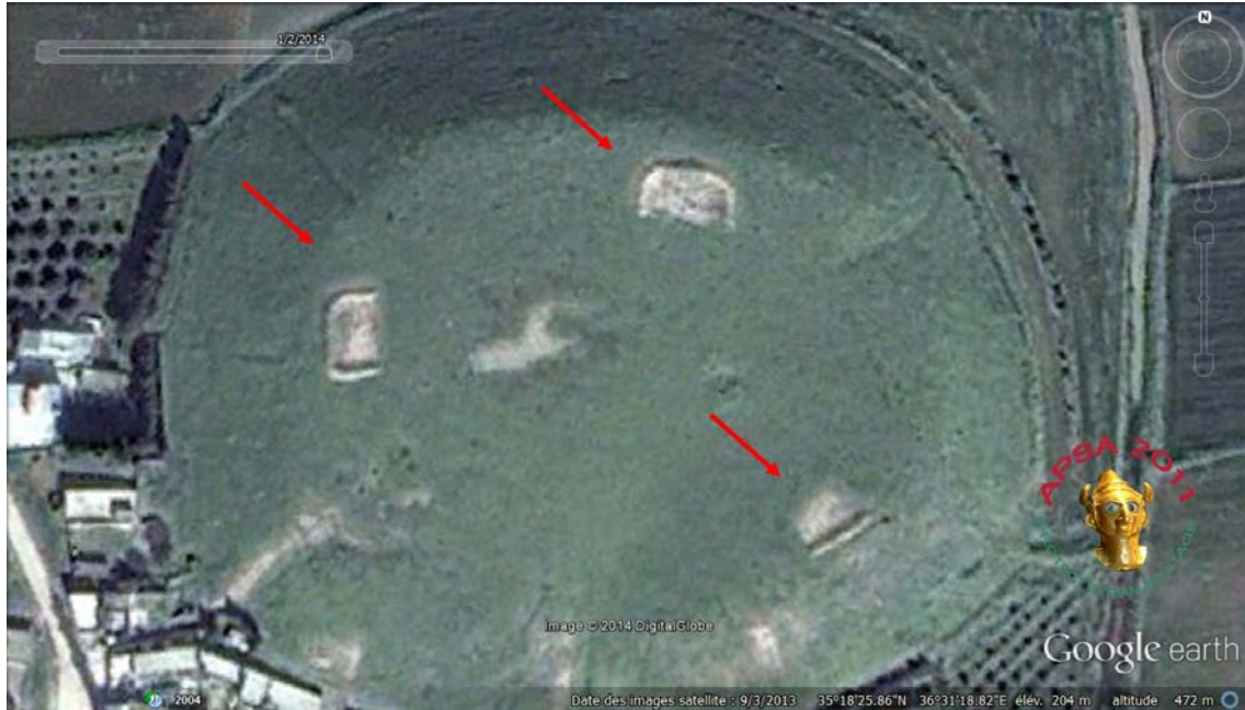
Some of the recent damage to Tell Meleh (APSA).