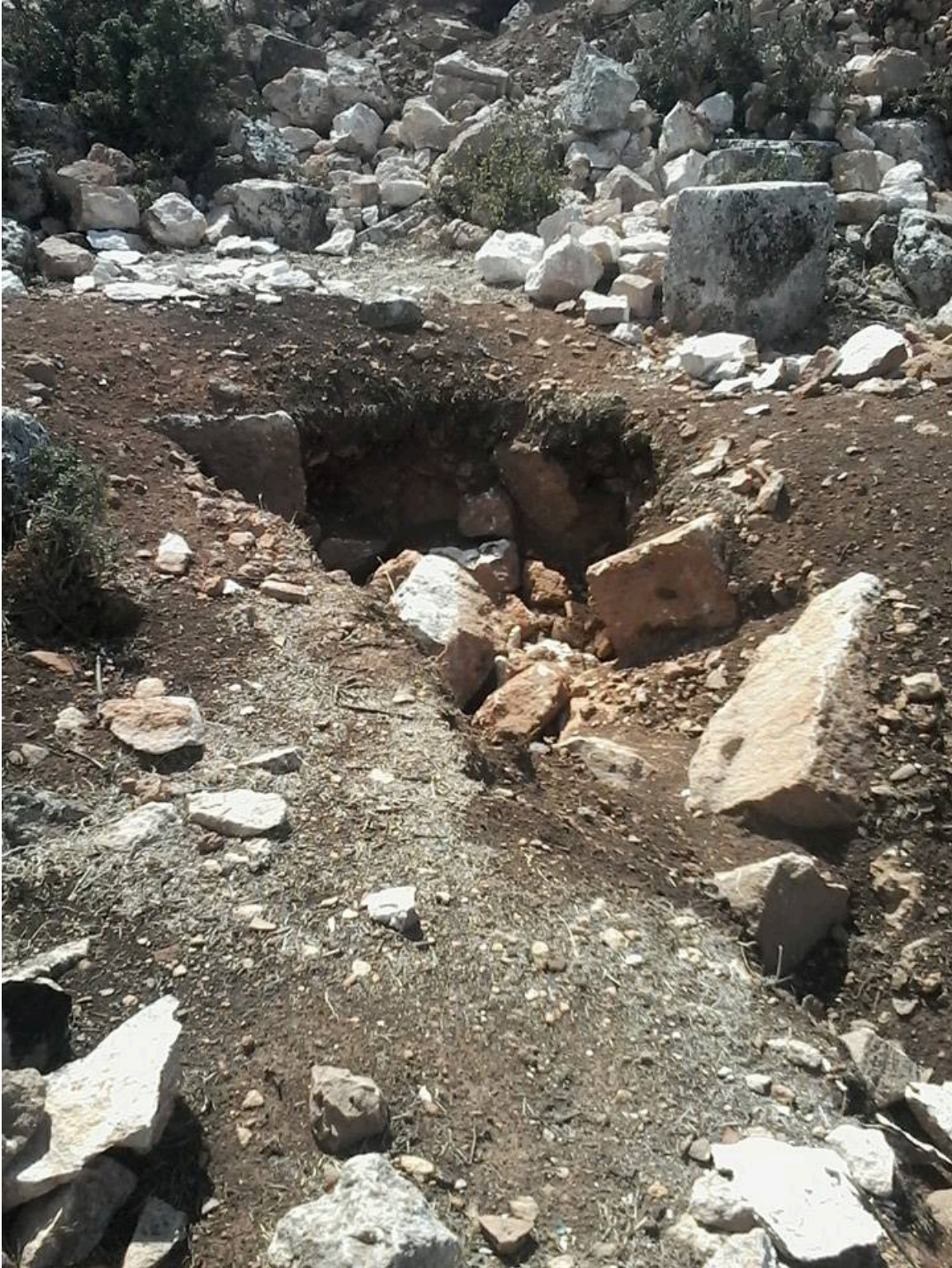
Damage to Kafr Aqab (APSA).