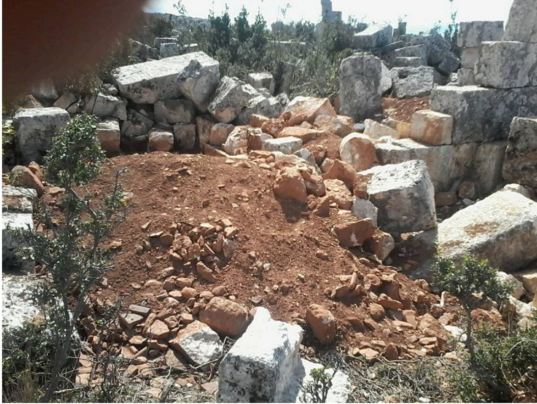
Damage to Kafr Aqab (APSA).