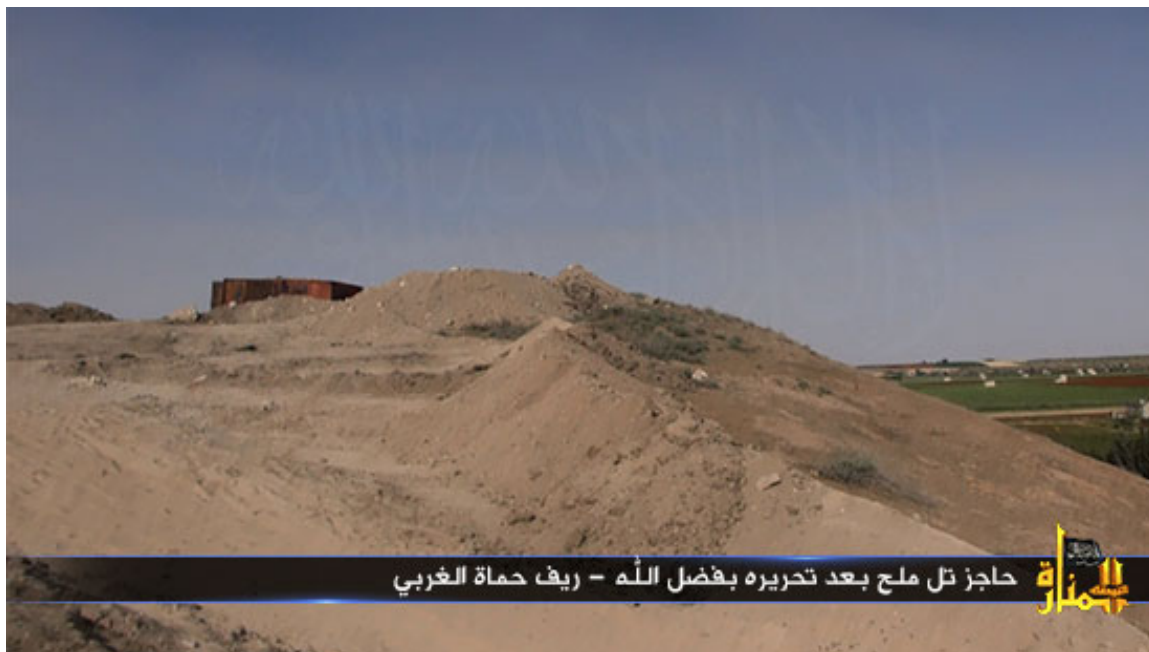
SARG earthworks on Tell Meleh.