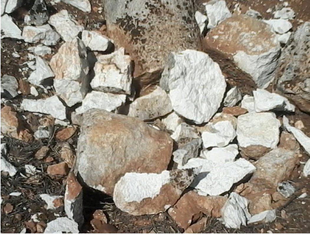
Damage to Kafr Aqab (APSA).