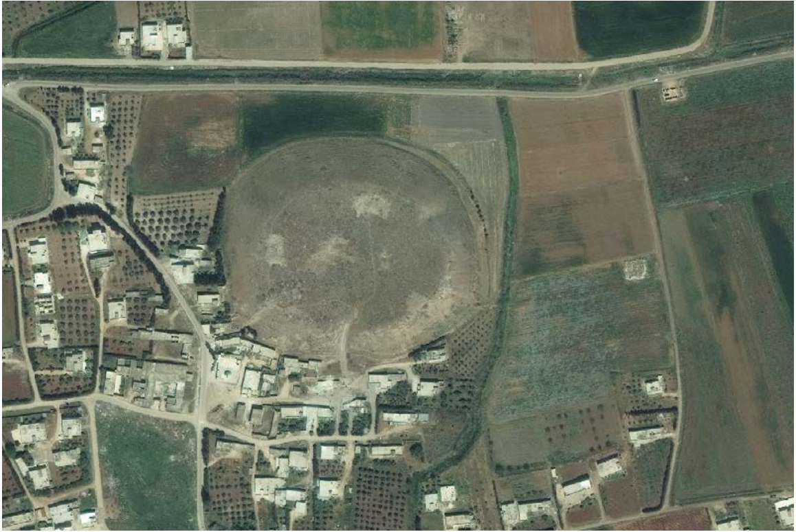
Tell Meleh before the damage caused by SARG forces.