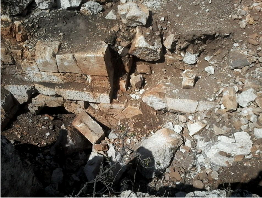
Damage to Kafr Aqab (APSA).