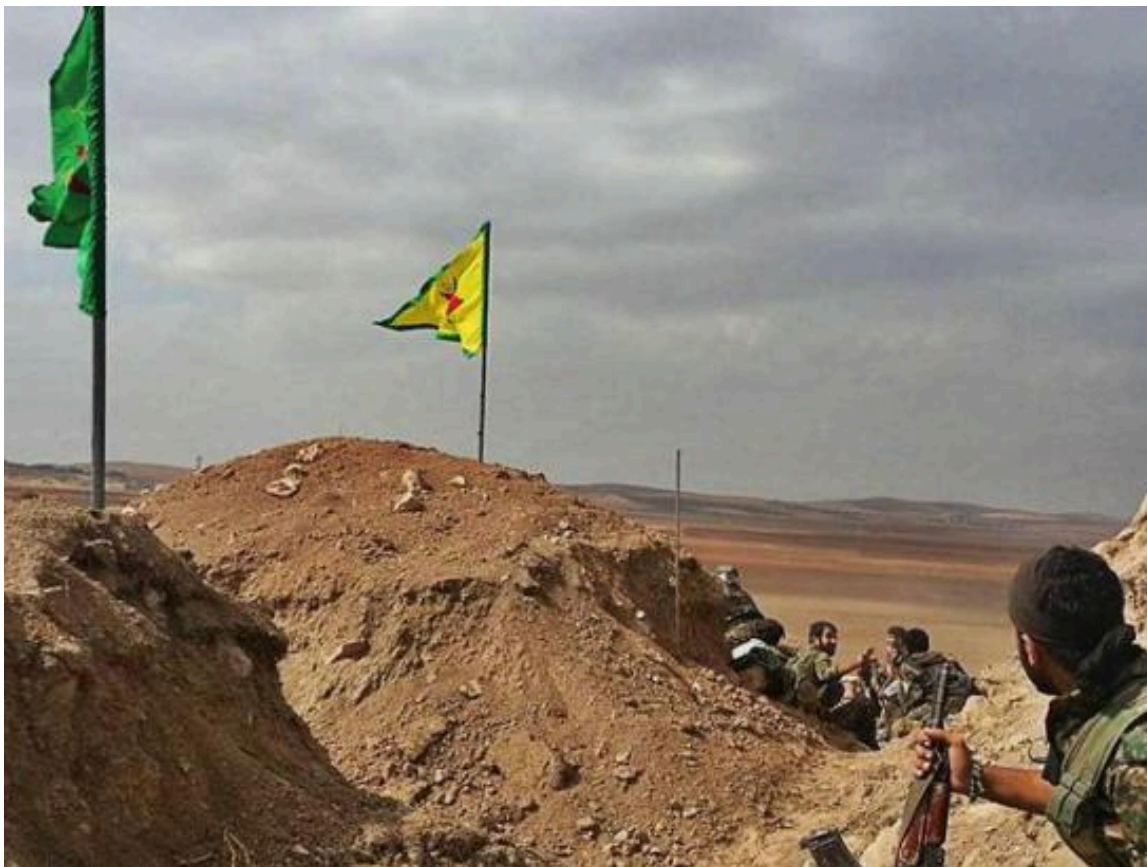
YPG fighters in trenches on Tell Sha'ir Oct. 14, 2014.