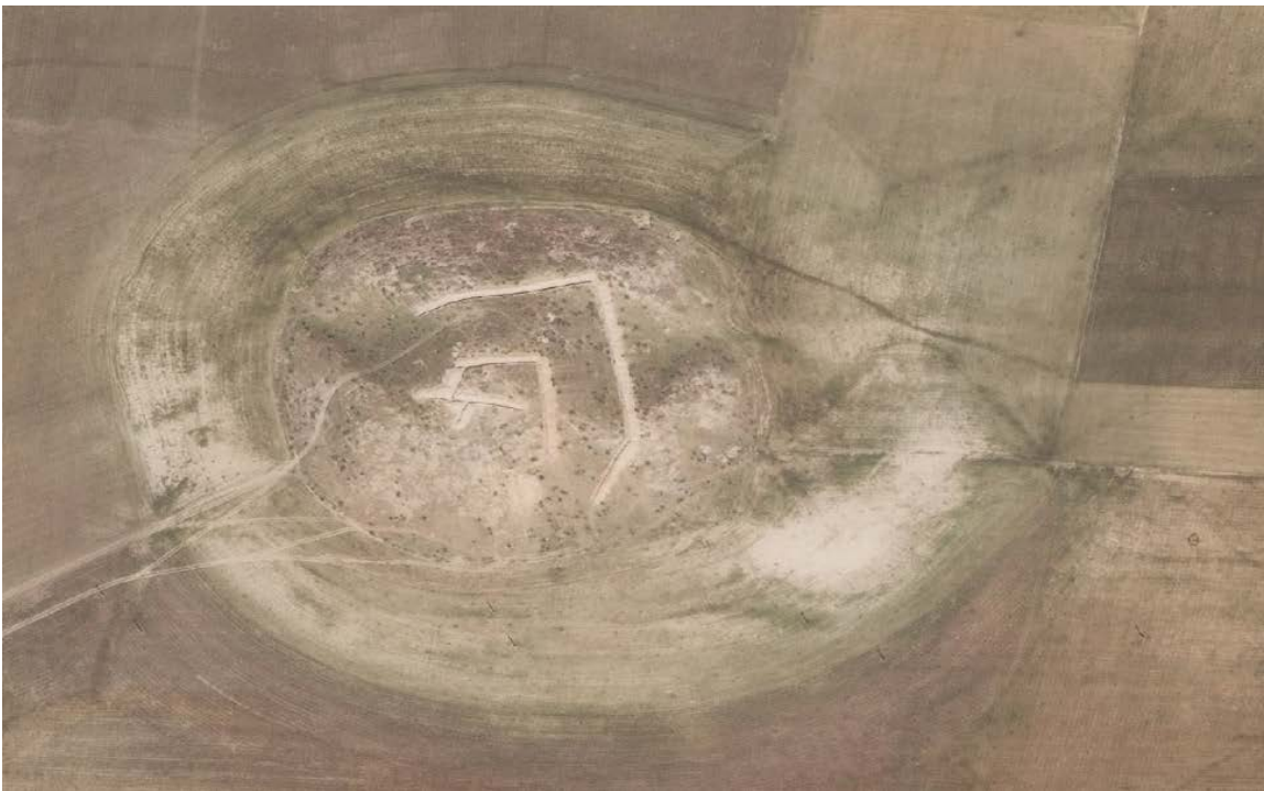
Satellite image of Tell Shair (April 2014) showing construction (Casana)