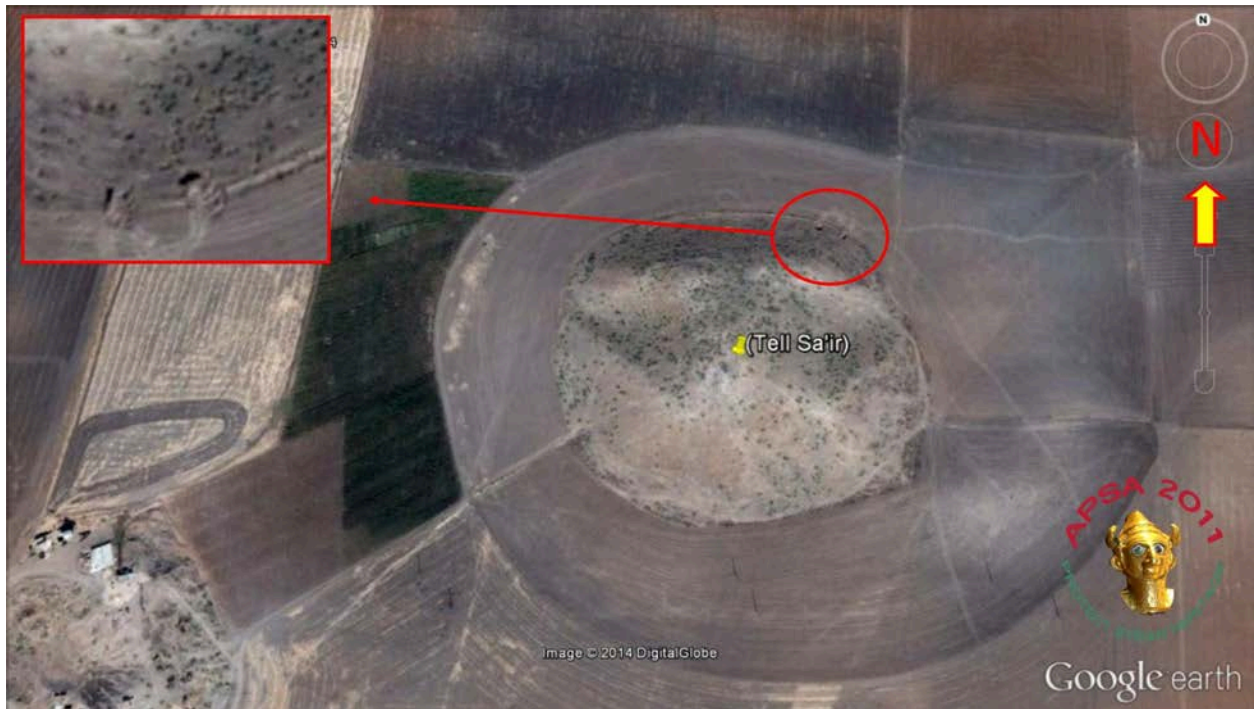
Tell Sha'ir (APSA).