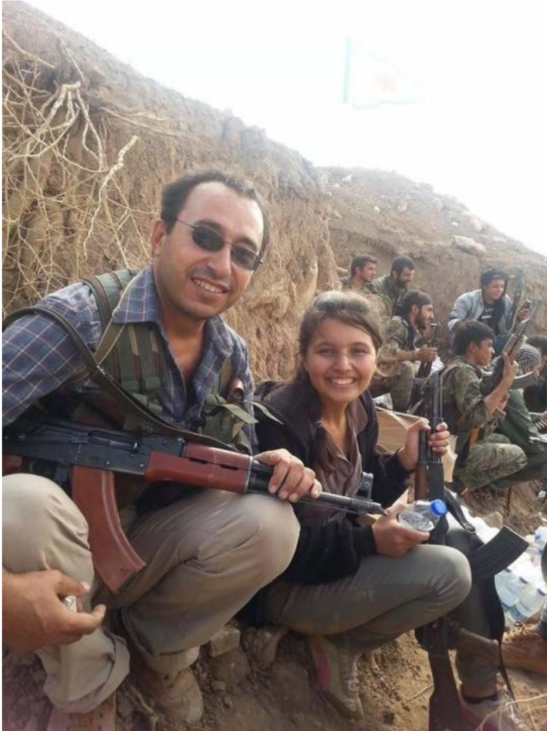
YPG fighters in trenches on Tell Sha'ir Oct. 14, 2014 (Today in Syria).