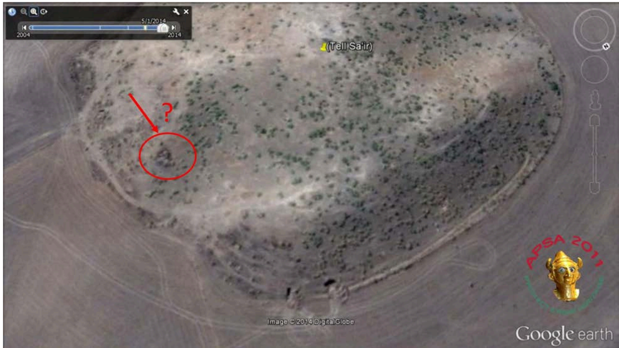
Tell Sha'ir (APSA).