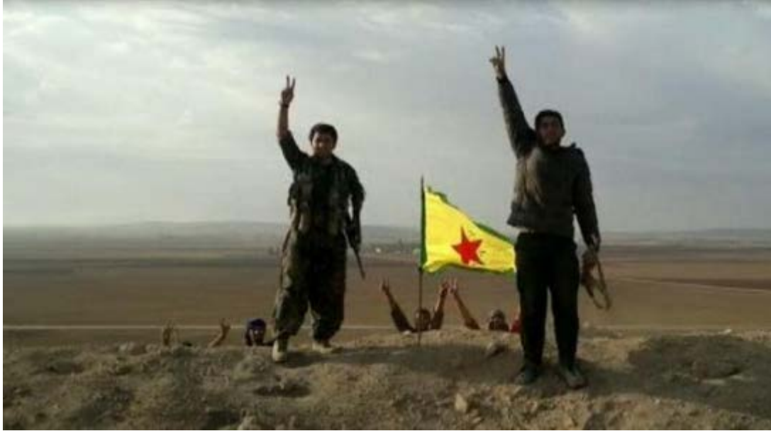
YPG fighters on Tell Sha'ir Oct. 14, 2014 (Today in Syria).