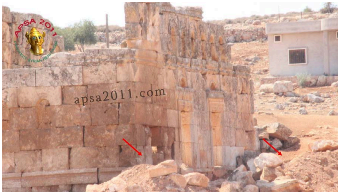
Illicit excavations at Kafr Lusein (APSA).