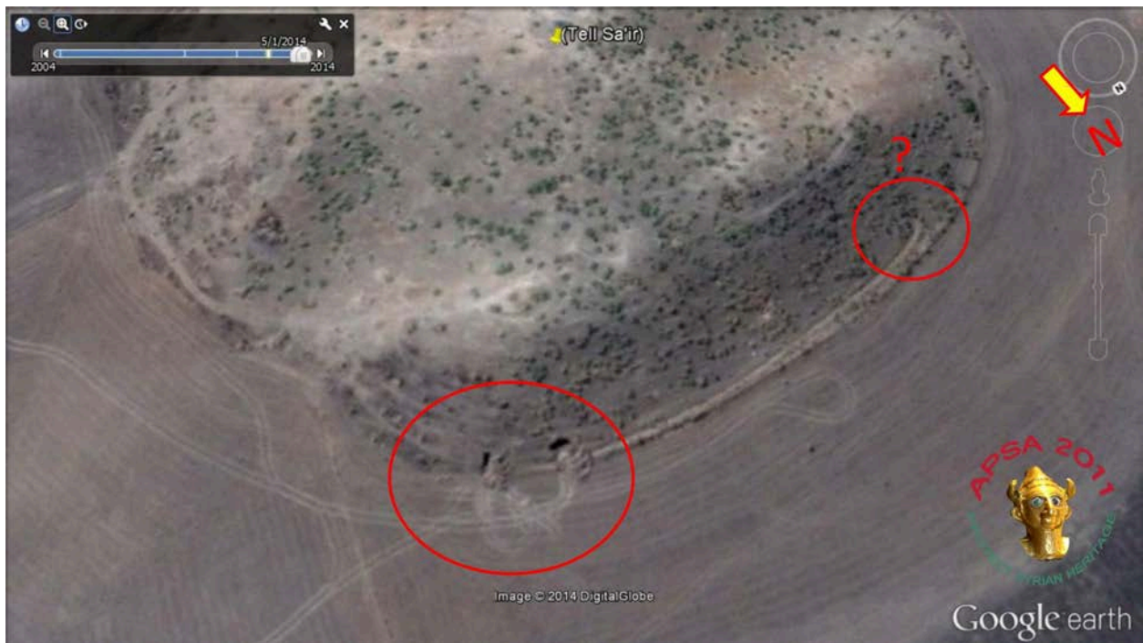
Tell Sha'ir (APSA).