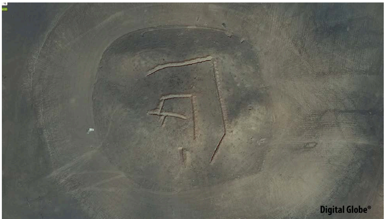
Military trenches in Tell Sha'ir (Digital Globe, Oct. 15, 2014).