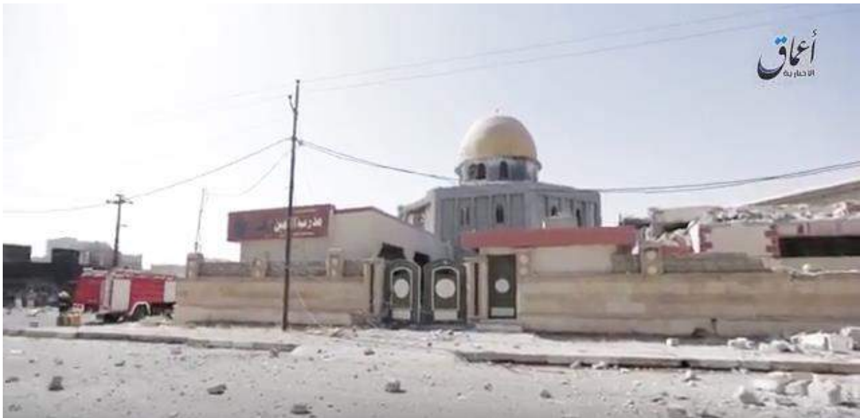
Video still of damage surrounding al-Rawda Muhammadiyah Mosque (October 6, 2016)