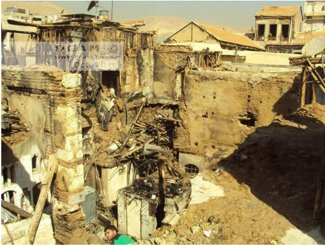
Fire damage to the historic house in Sarouja (DGAM; October 6, 2016)