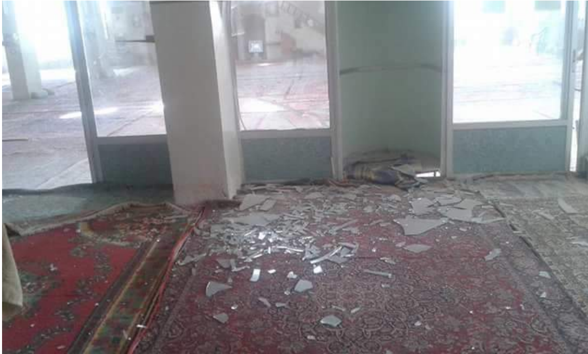
Damage to interior of al-Kabir Mosque (SNHR; October 12, 2016)