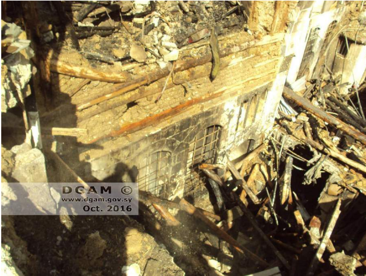
Fire damage to the historic house in Sarouja (DGAM; October 6, 2016)