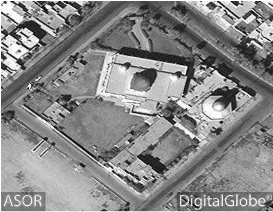
al-Rawda Muhammadiyah Mosque prior to damage (October 1, 2016)