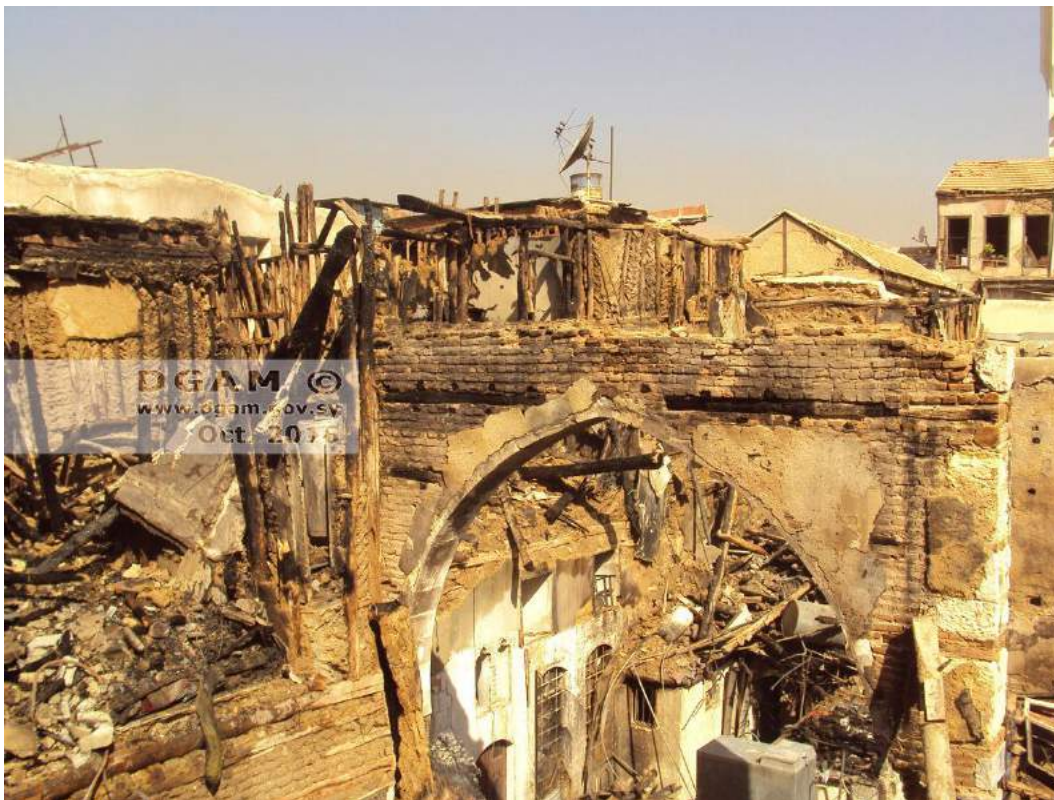
Fire damage to the historic house in Sarouja (DGAM; October 6, 2016)