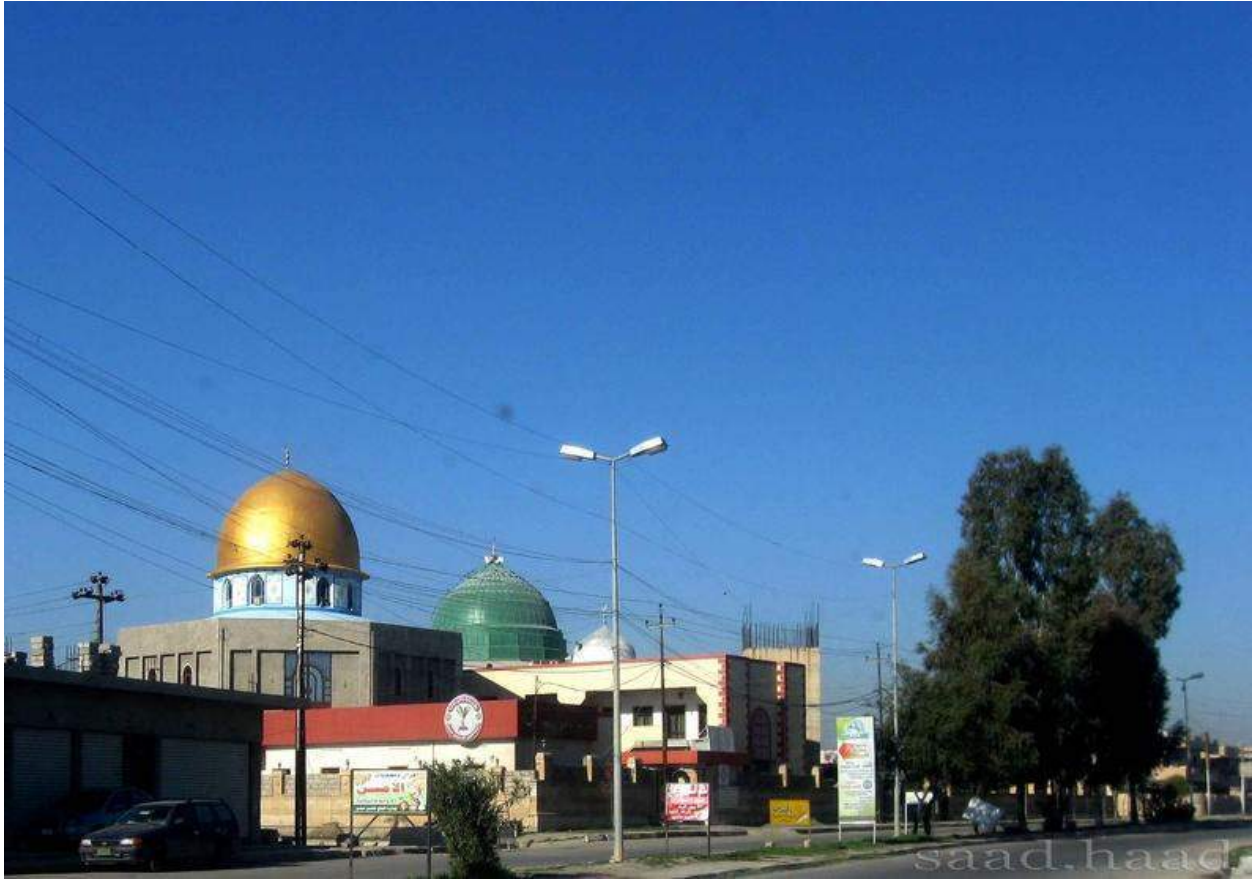
Pre-damage photograph of al-Rawda Muhammadiyah Mosque (Saeed Hadi; March 16, 2014)

al-Rafidain TV: http://alrafidain.org/2016/10/قناة-الرافدين-مقتل-7-مدنيين-وإصابة-11-بقص