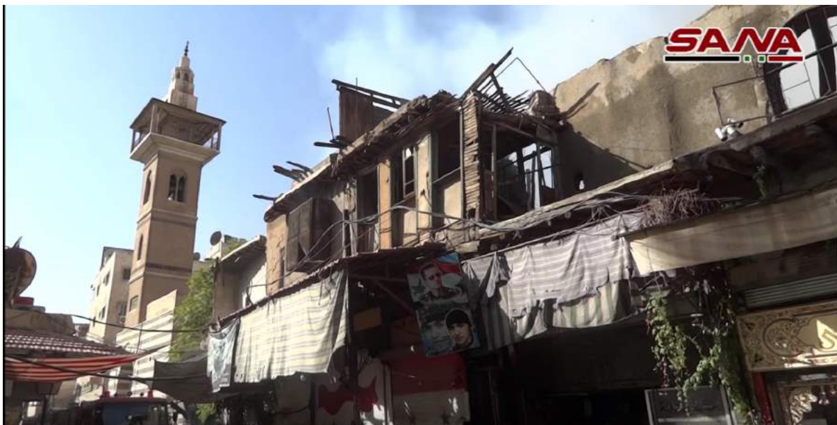
Video still of fire damage to historic house in Sarouja, with al-Ward Mosque in background (SANA; October 3, 2016)