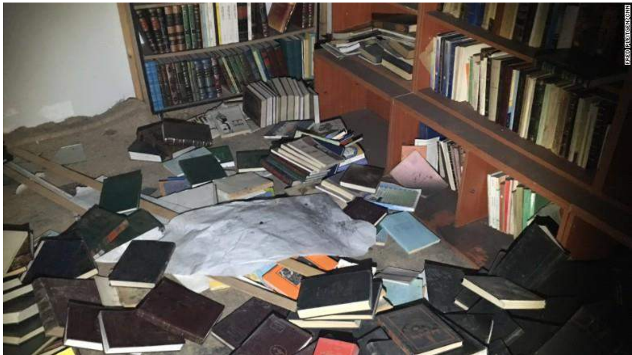
Books strewn about on floor of dismantled Daraya library (October 11, 2016)