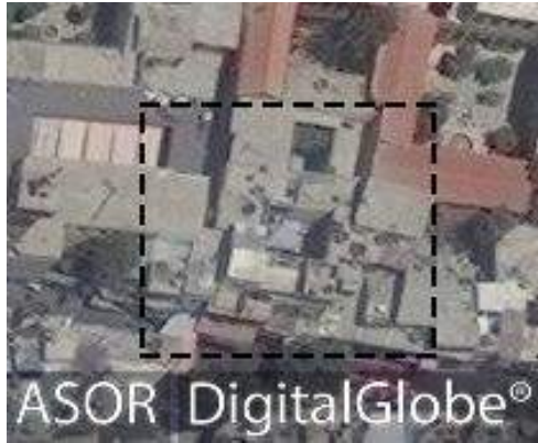
Historic house prior to the fire (DigitalGlobe; July 19, 2016)

DGAM: http://www.dgam.gov.sy/damages/eplace.php?placeid=27#