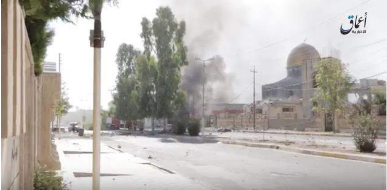
Video still of smoke as it continues to rise following the airstrike (Amaq News Agency; October 6, 2016)