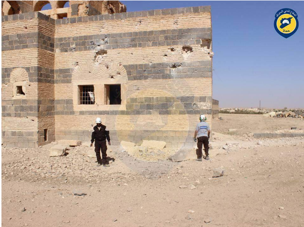
Damage to southern facade of the palace at Qasr ibn Wardan (SNHR; October 15, 2016)

Burns, Ross (2010) Monuments of Syria . London: I.B. Tauris.