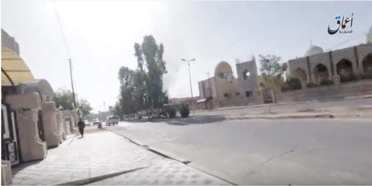
Video still of al-Rawda Muhammadiyah Mosque (October 6, 2016)