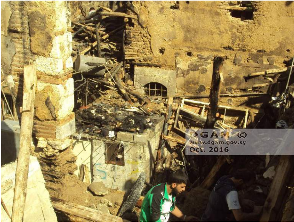
Fire damage to the historic house in Sarouja (DGAM; October 6, 2016)