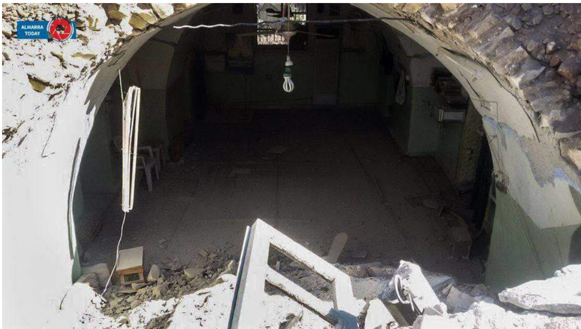
Damage to Uwais al-Qarni Mosque (SNHR; October 15, 2016)