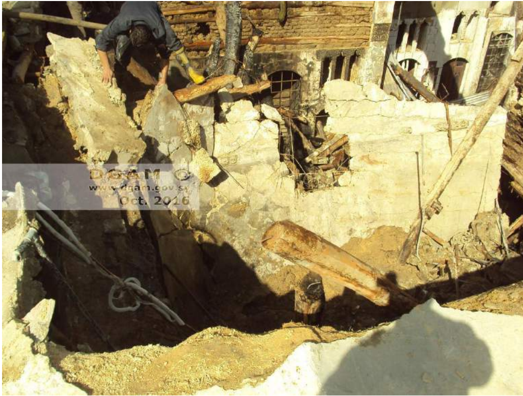
Fire damage to the historic house in Sarouja (October 6, 2016)