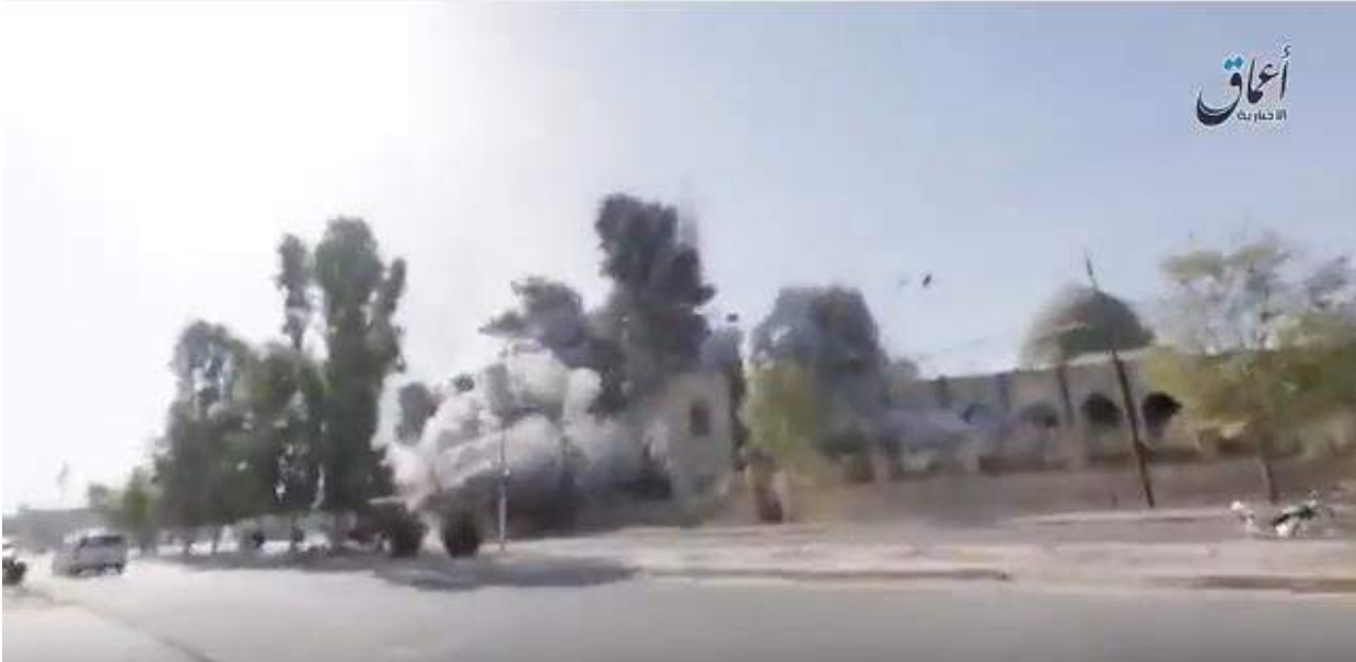
Video still of a missile striking al-Rawda Muhammadiyah Mosque (Amaq News Agency; October 6, 2016)