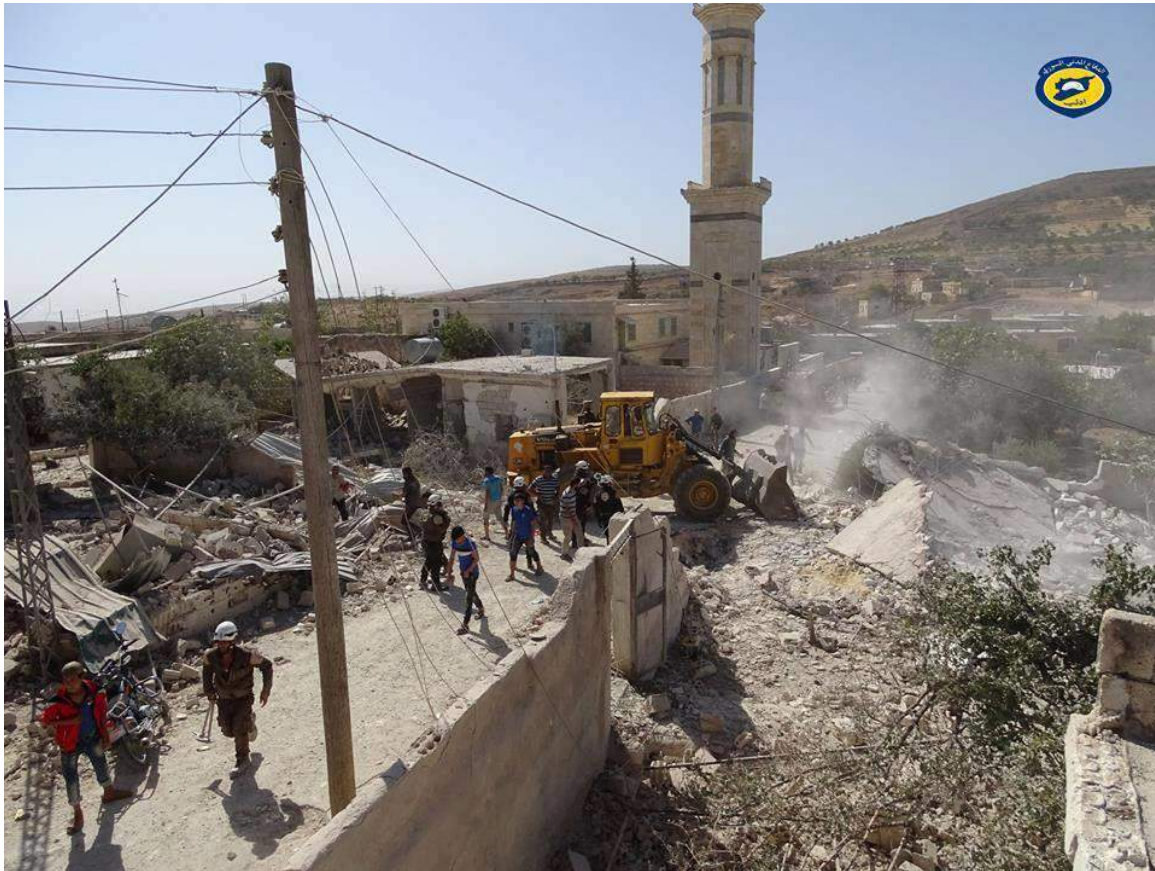
Airstrike damage to the area near Karsaa Mosque (SNHR; October 3, 2016)

October 15, 2016: http://sn4hr.org/blog/2016/10/15/government-forces-targeted-owais-al-garni-mosque-maaret-al-numan-city-idlib-governorate-october-15/