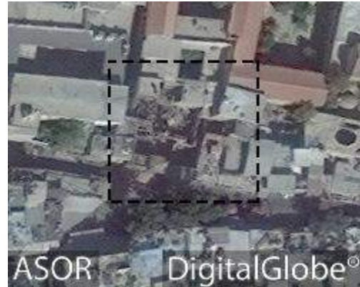
Historic house after the fire (October 26, 2016)