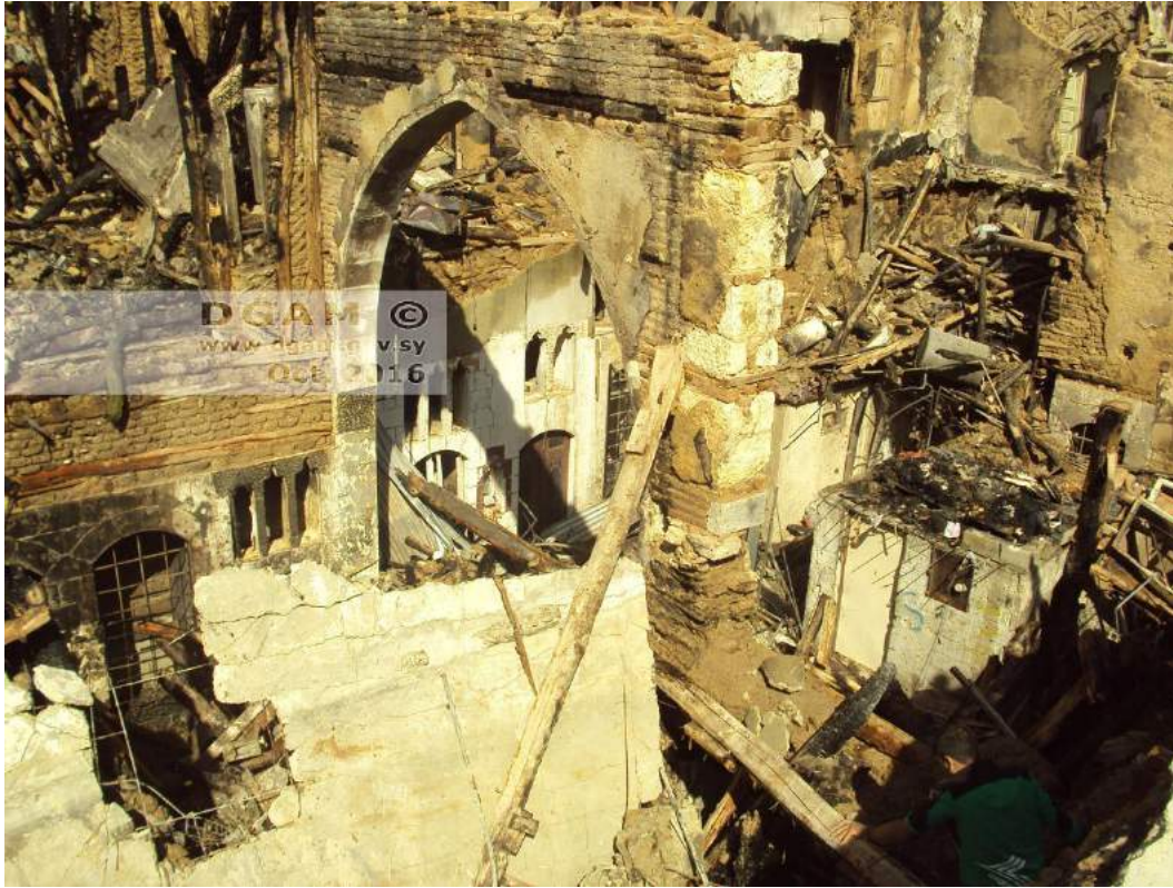
Fire damage to the historic house in Sarouja (October 6, 2016)