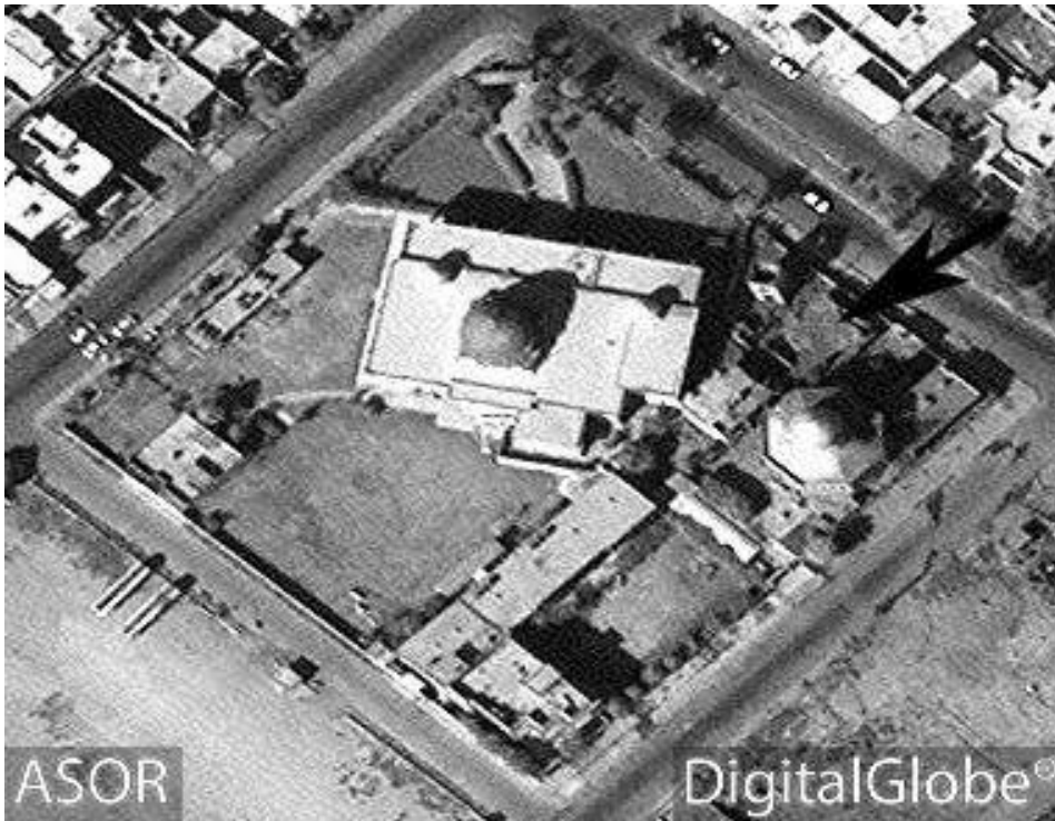
al-Rawda Muhammadiyah Mosque with visible damage to buildings within the complex (DigitalGlobe; October 10, 2016)