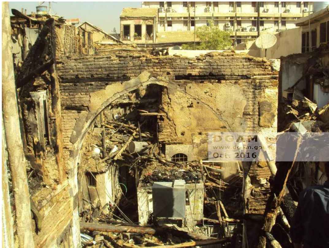
Fire damage to the historic house in Sarouja (DGAM; October 6, 2016)