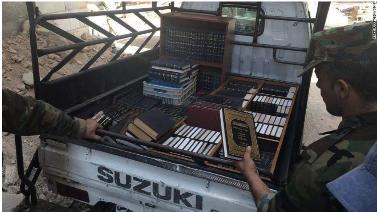
SARG soldiers loading Daraya library books onto pickup truck (CNN; October 11, 2016)