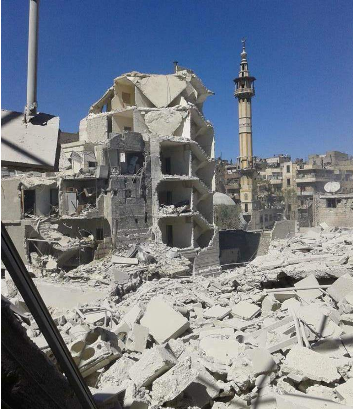
Damage to the area surrounding al-Sabhan Mosque (SNHR; October 13, 2016)

October 13, 2016: http://sn4hr.org/blog/2016/10/13/suspected-russian-forces-targeted-al-sabhan-mosque-aleppo-governorate-october-12/