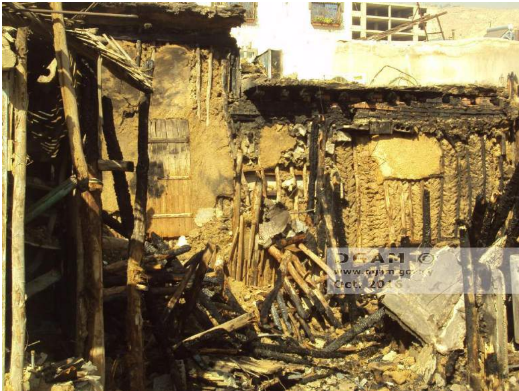
Fire damage to the historic house in Sarouja (DGAM; October 6, 2016)