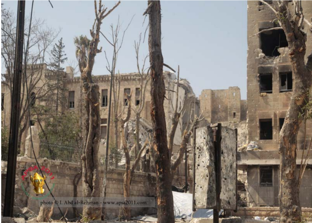
View of the historic Serail (APSA, Aug. 12, 2014). The east wing was completely destroyed by a tunnel bomb on July 29, 2014.