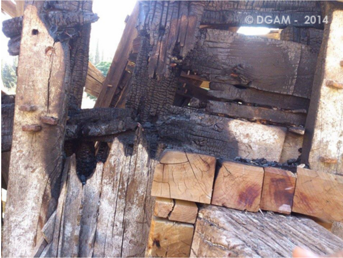
Fire damage to the Noria al-J'berihe, Hama.