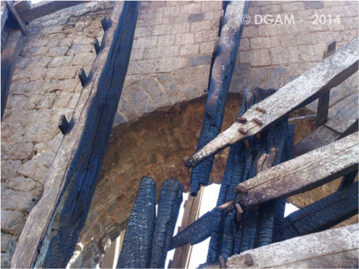
Fire damage to the Noria al-J'berihé, Hama (DGAM).