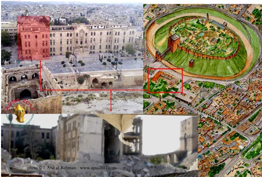
View of the historic Serail (APSA, Aug. 12, 2014). The east wing was completely destroyed by a tunnel bomb on July 29, 2014.