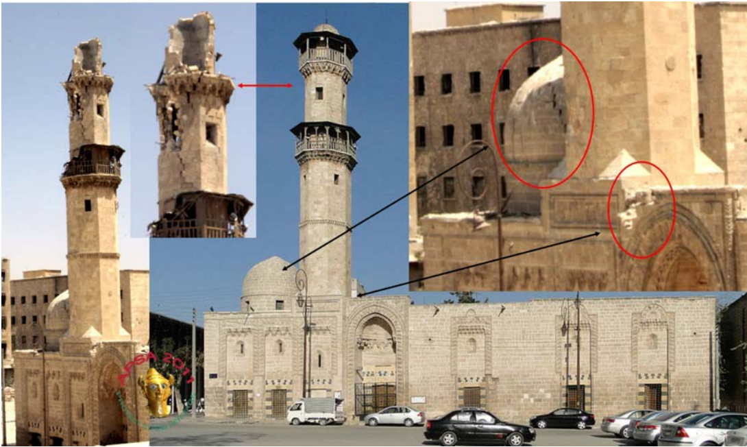
Damage to the al-Otrush Mosque.