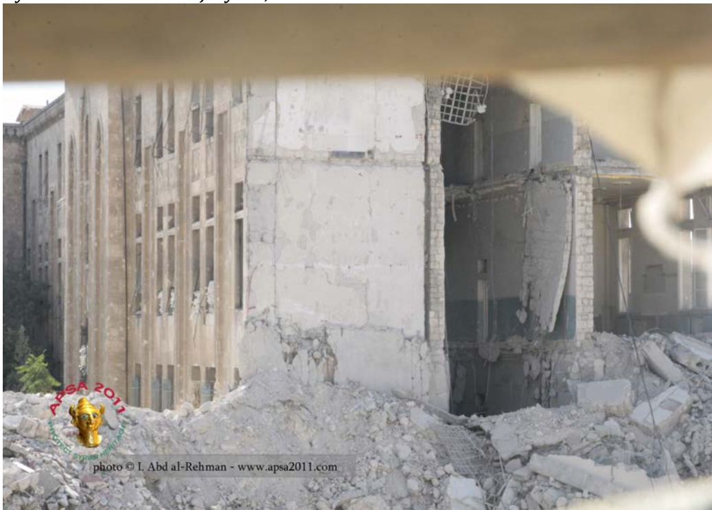
View of the historic Serail (APSA, Aug. 12, 2014). The east wing was completely destroyed by a tunnel bomb on July 29, 2014.