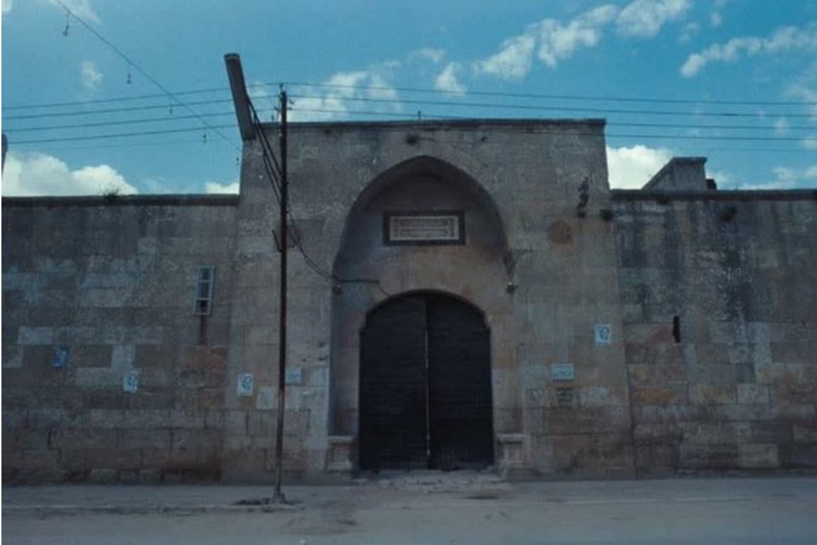
Entrance to the Khan Murad Pasha/Maarat al-Numan Museum.