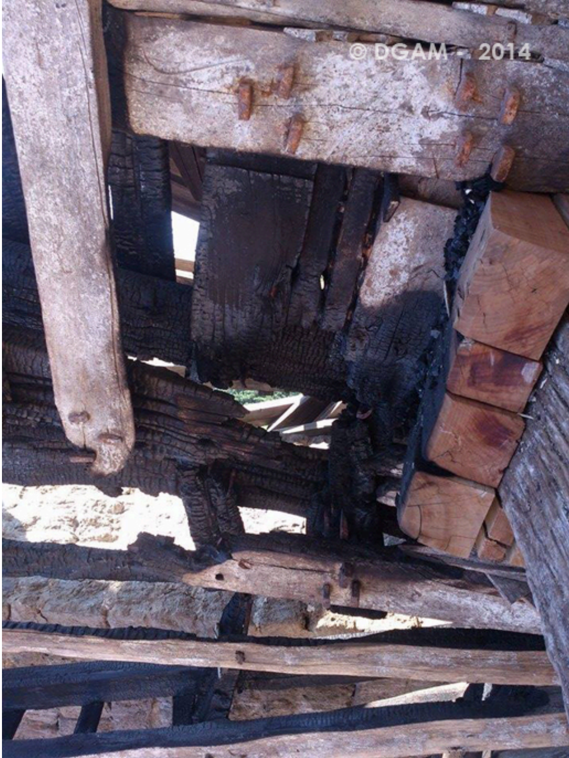
Fire damage to the Noria al-J'berihe, Hama.