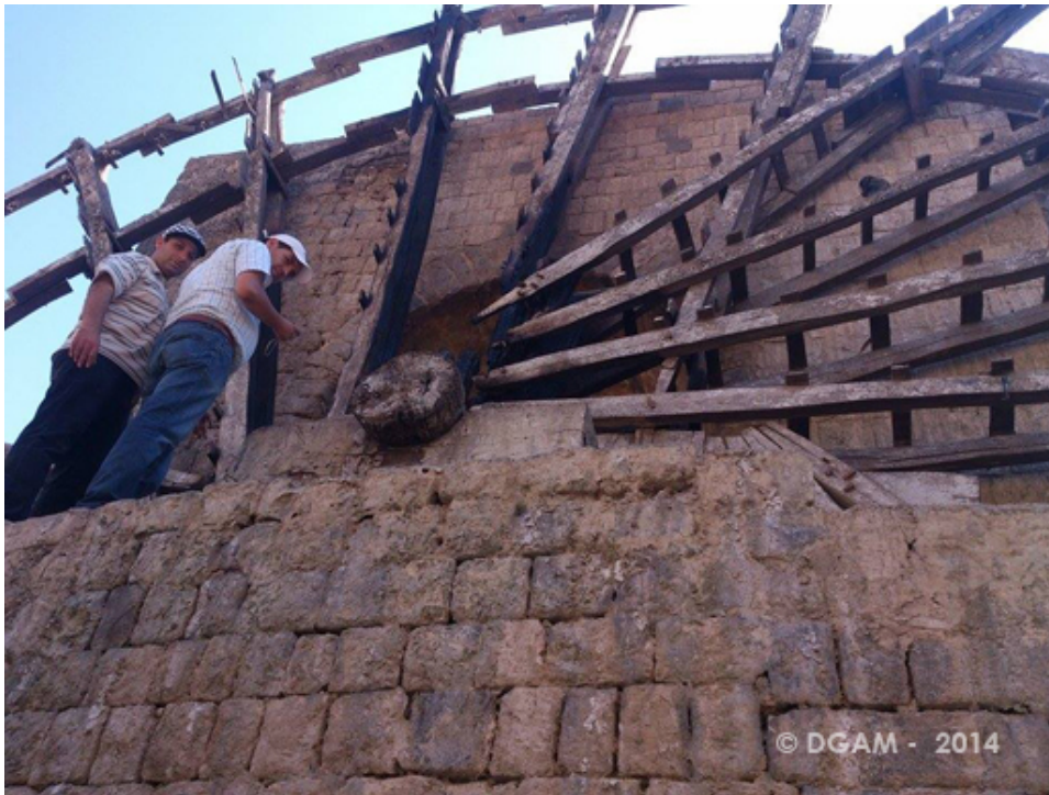
Fire damage to the Noria al-J'berihe, Hama.