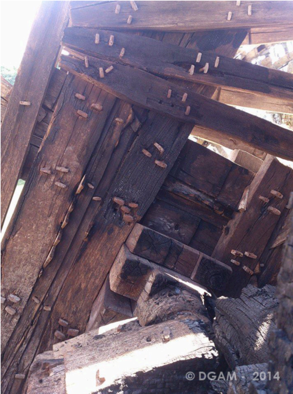
Fire damage to the Noria al-J'berihe, Hama.