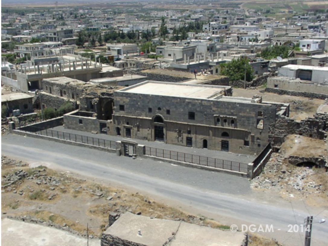
The Beit Hariri before the incident.