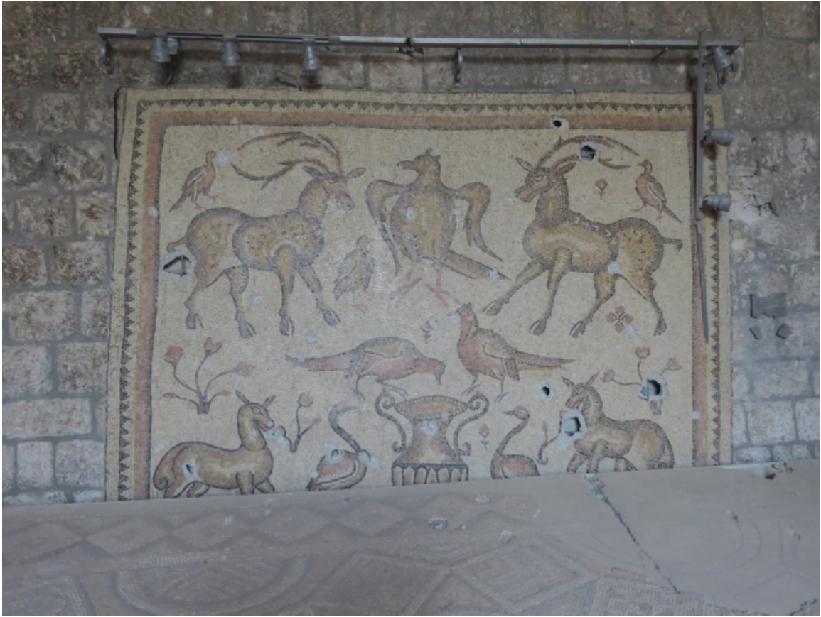
The damaged mosaic in the Maarat al-Numan Museum from the site of al-Firkiye (510 AD).