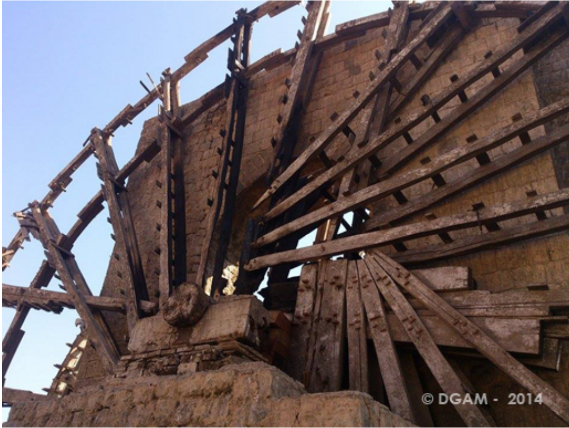
Fire damage to the Noria al-J'berihé, Hama.