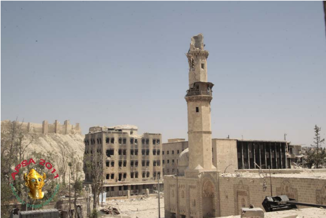
Damage to the al-Otrush Mosque.