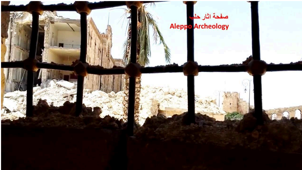
View of the rubble field of the east side of the Serail. The exposed rooms led into the missing east wing.