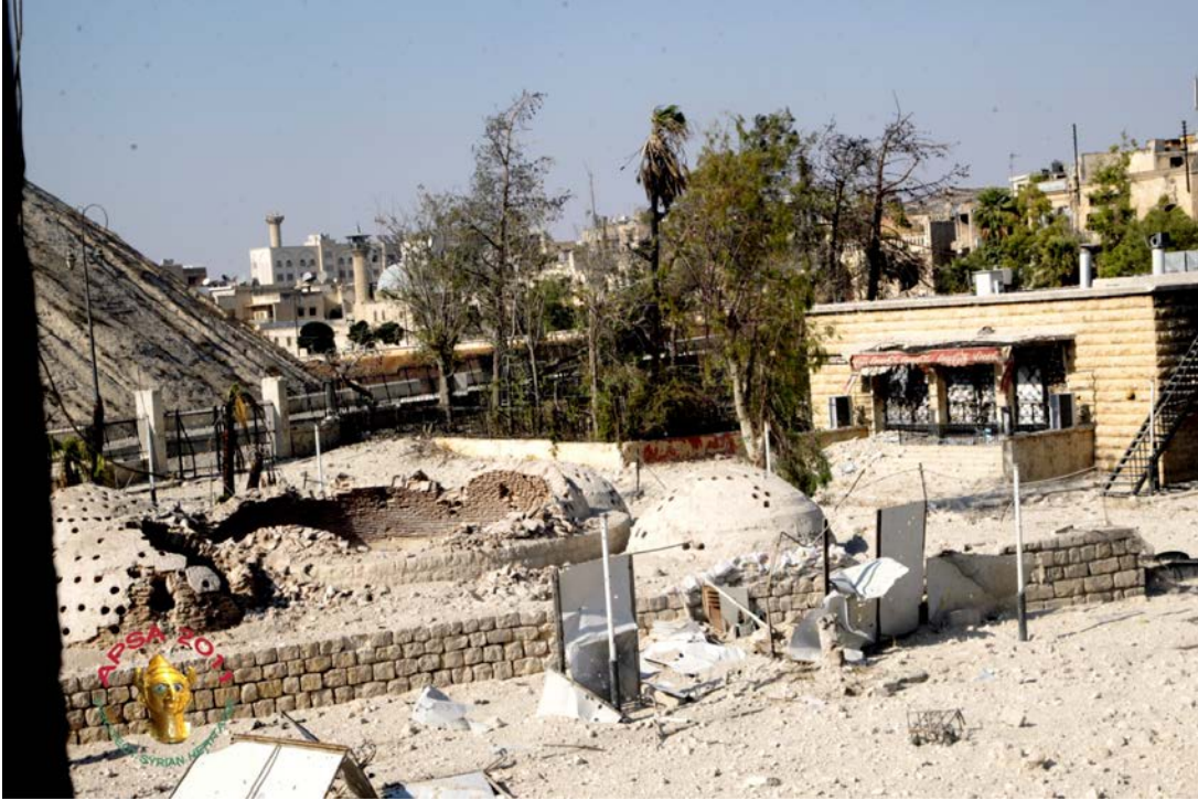
Damage to the Yalbugha Bath. The eastern portion of the bath (left) has been destroyed by the detonation of tunnel bombs nearby.