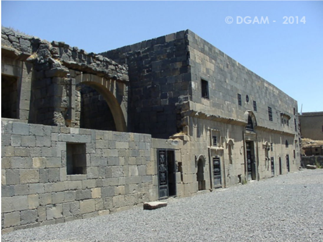
Beit Hariri before the incident.