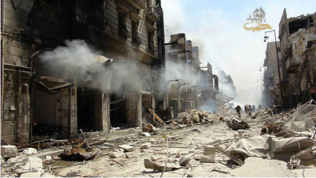
The Bab al-Nasri area fires in Aleppo.