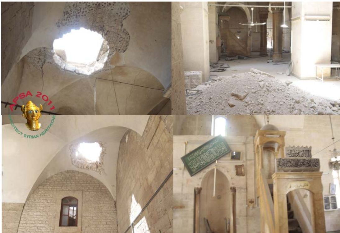
Damage to the al-Otrush Mosque (APSA).