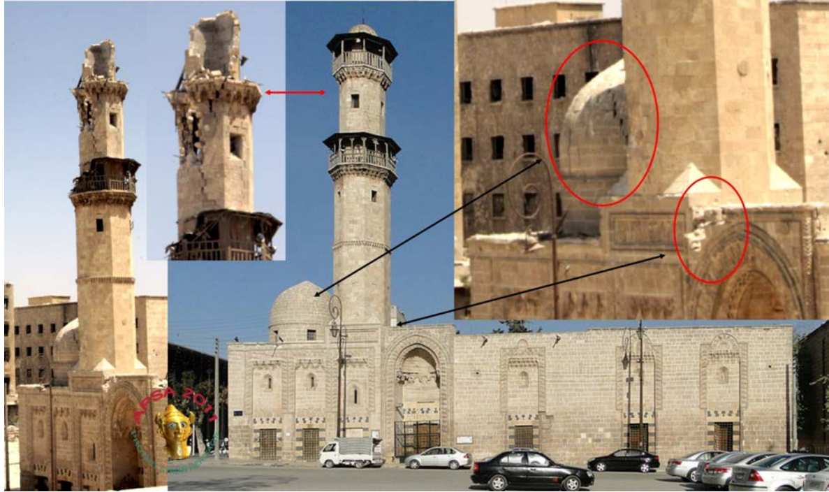
Damage to the al-Otrush Mosque (APSA).