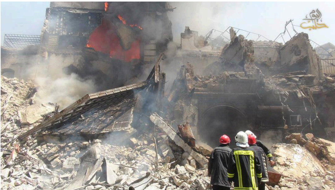
The Bab al-Nasri area fires in Aleppo.