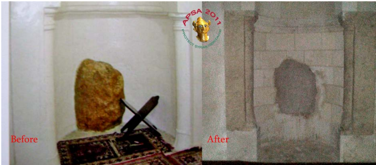
Alleged destruction of the Maqam Ibrahim Salihin in Aleppo. This purported damage seems falsified and must be verified (APSA).