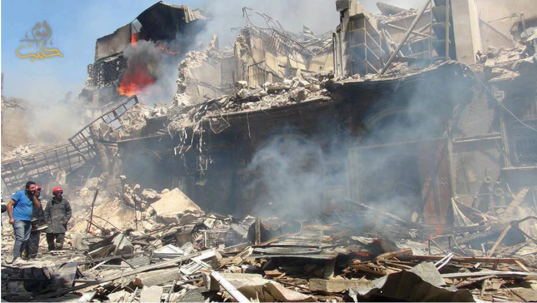
The Bab al-Nasri area fires in Aleppo (Eyes on Heritage).