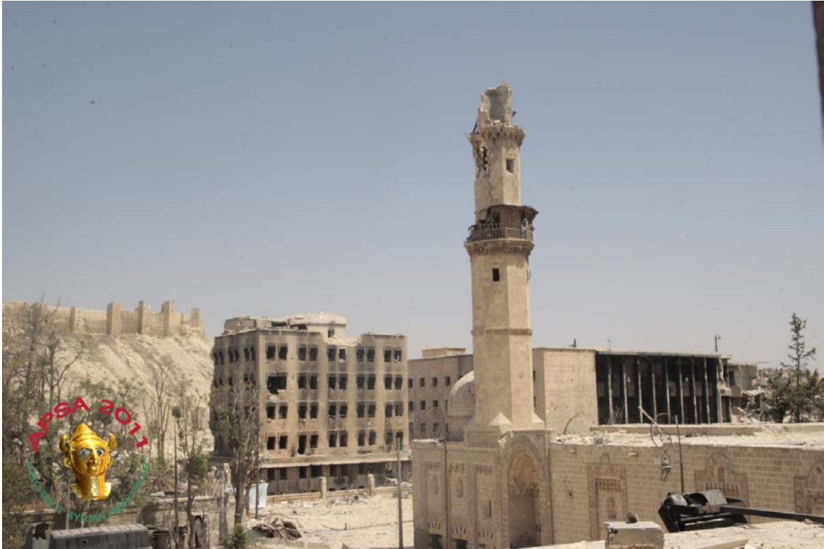
Damage to the al-Otrush Mosque.