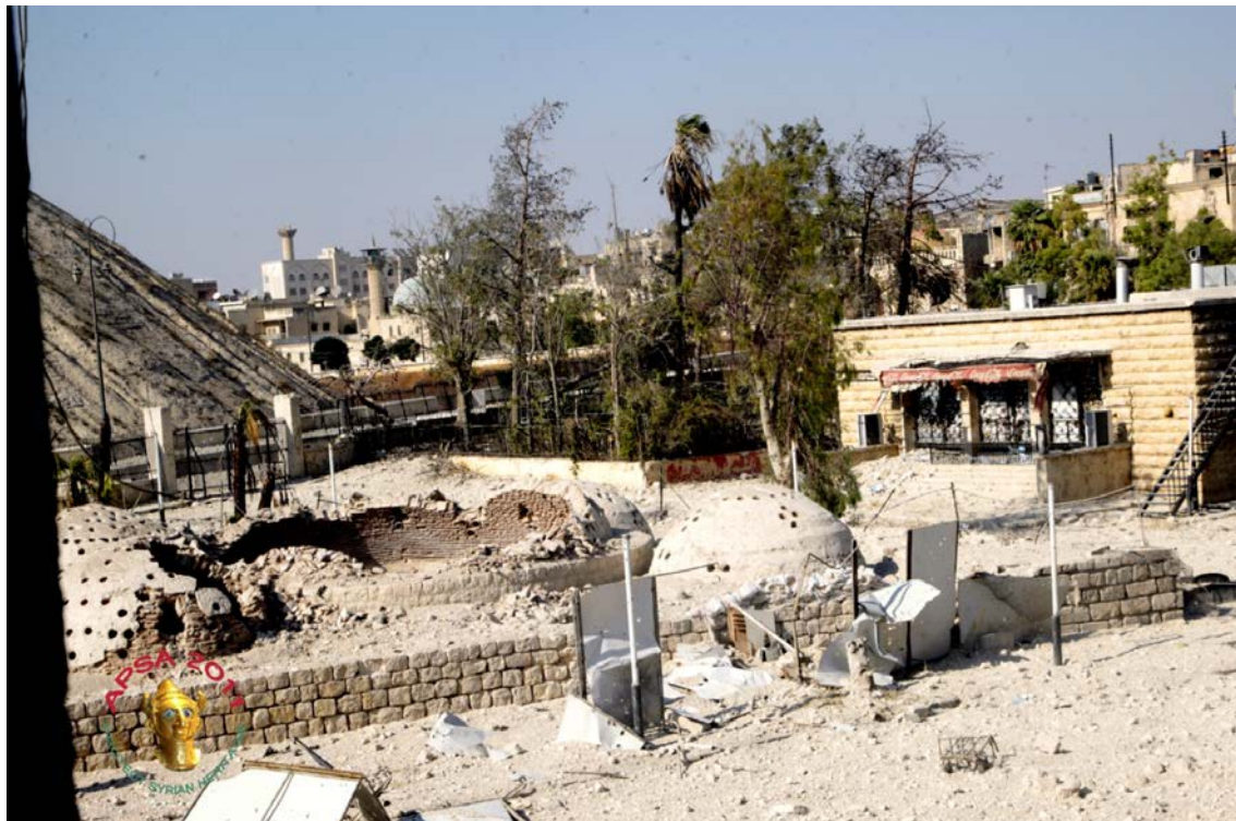
Damage to the Yalbugha Bath. The eastern portion of the bath (left) has been destroyed by the detonation of tunnel bombs nearby (APSA).