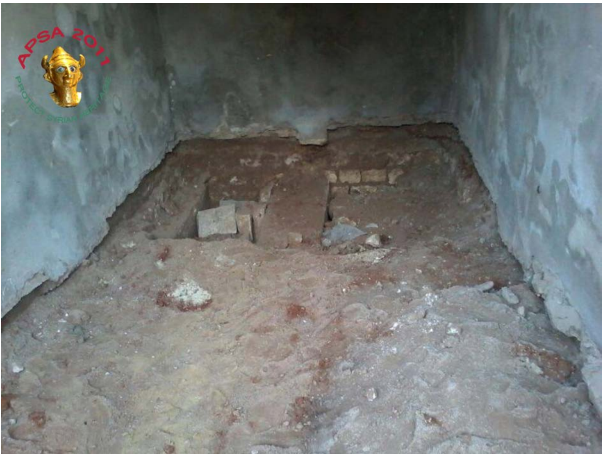
The alleged Sufi shrine/tomb at Maqam Ibrahim Salihin Aleppo. The specifics of this incident and the remains shown in this photo remain unverified.