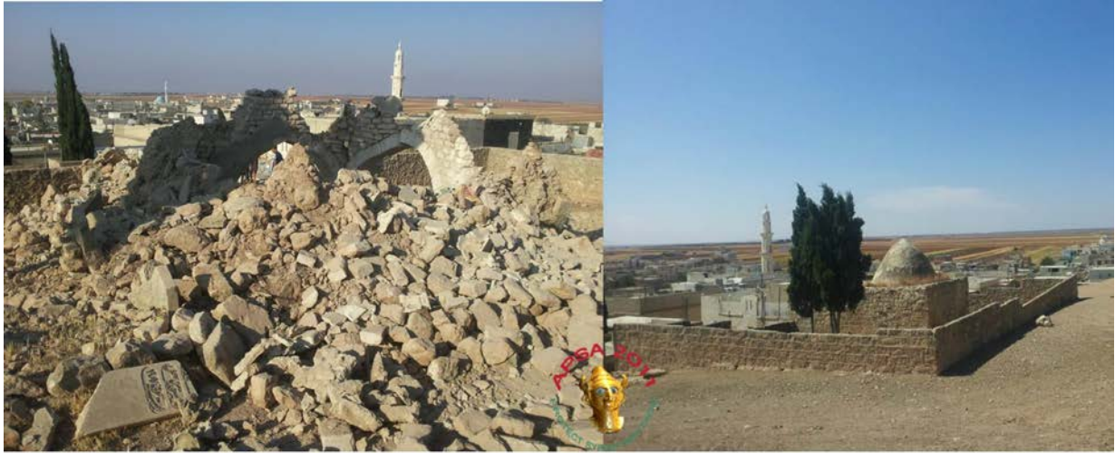
Before-and-after views of the destruction at Dabiq (APSA).