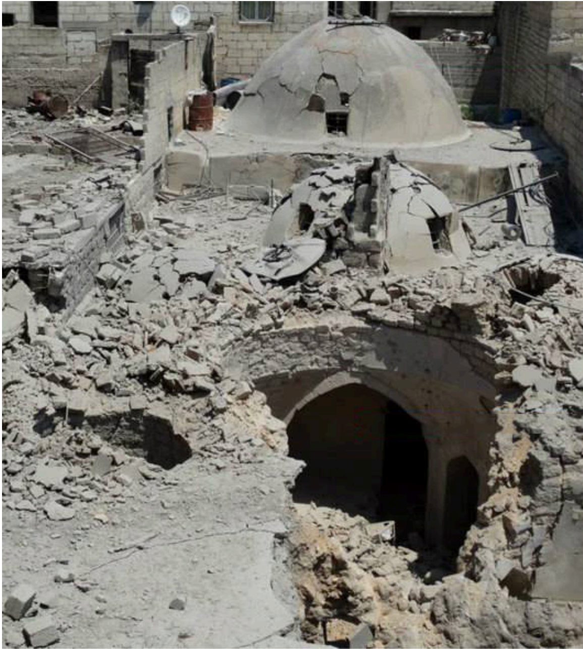
Airstrike damage to Kafr Takharim Hammam al-Souk.