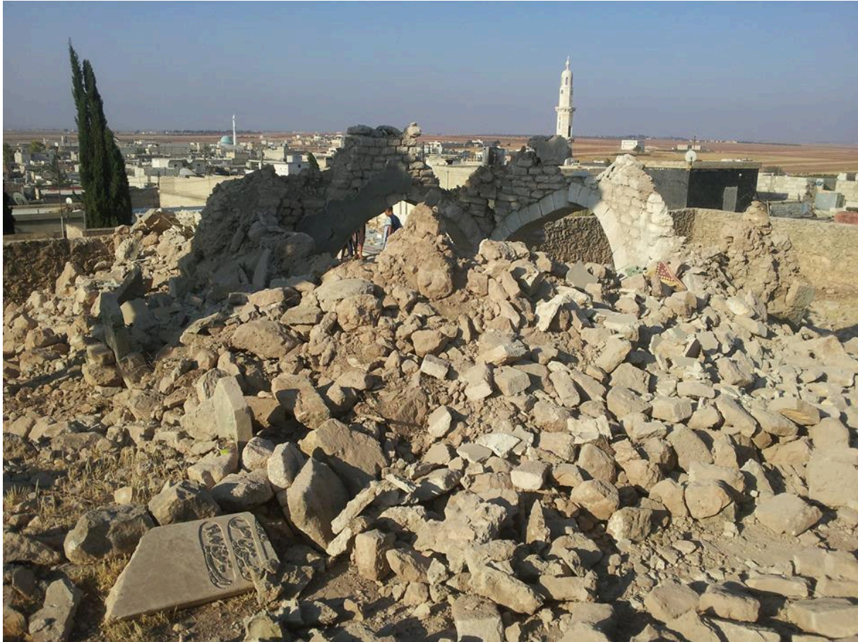
The destroyed tomb of Caliph Sulaymān ibn ʿAbd in Dabiq (APSA).