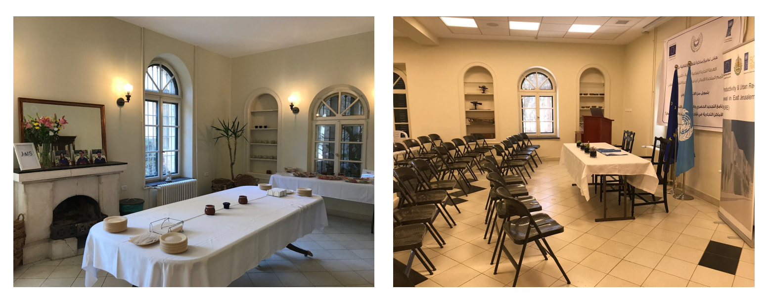
Above left: the setup for the JAIS high school graduation. Above right, a UNDP-EU agreement-signing in the DH.