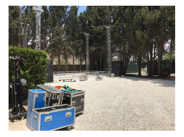
A stage was built on the rear parking lot of the Albright, and hosted concerts both evenings, the first night contemporary Palestinian rock, and the second night a group playing and singing traditional Arabic music.

It was wonderful to welcome the local community and strengthen the Albright's ties to another cultural institution in Jerusalem, as well as aid the consulate in their goal of providing positive activities and connecting locals to their cultural heritage.