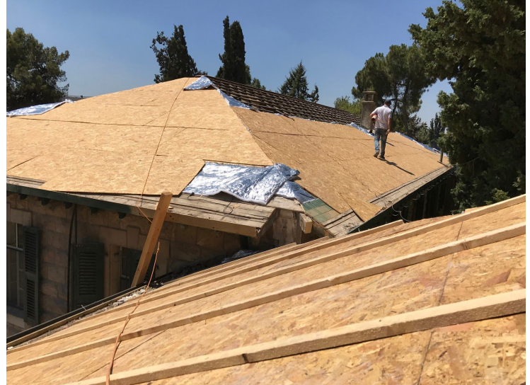
More work on the roof