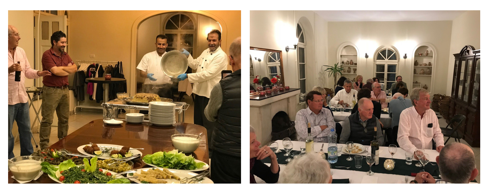
Tour group at dinner at the Albright in October 2017. Below, the set-up for the meal.