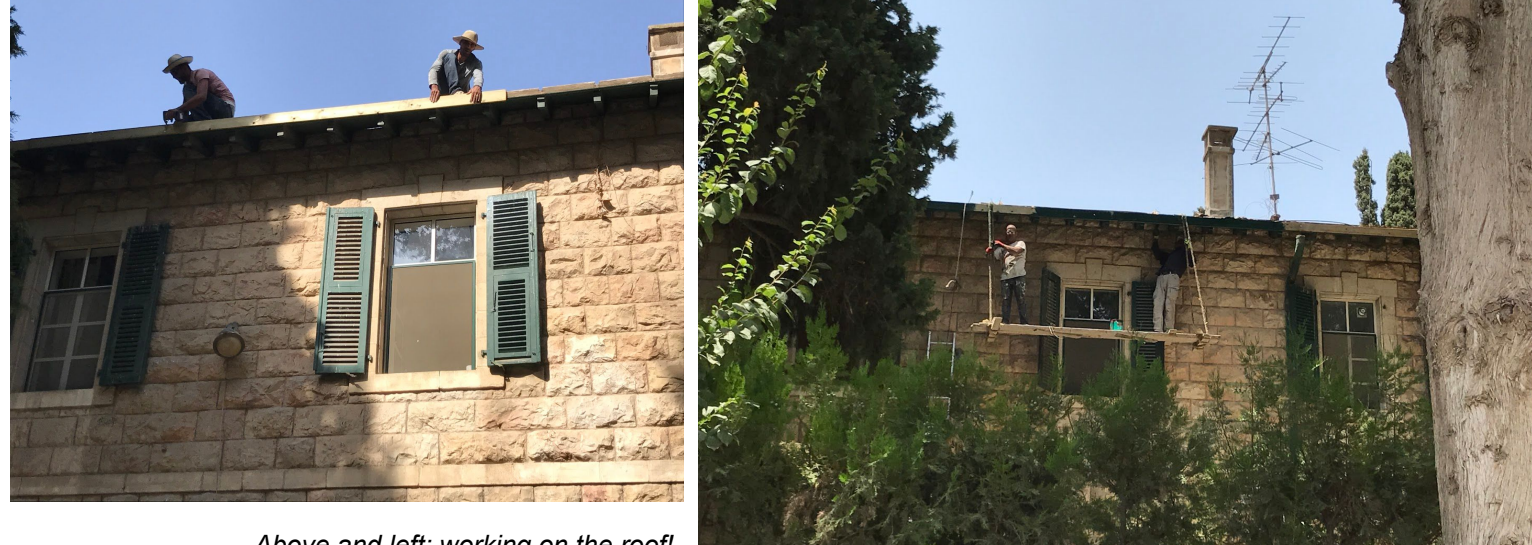
Above and left: working on the roof!

The aging leaky roofs have been replaced! It has been a long time coming but the project is now complete. The contactors dismantled existing roofs down to the joists, refurbished existing eaves, repaired chimneys, and put down new waterproof insulation before retiling the roof and replacing all of the gutters. New features include fire retardant insulation, covered gutters for keeping leaves out, and a safety harness system for roof maintenance.