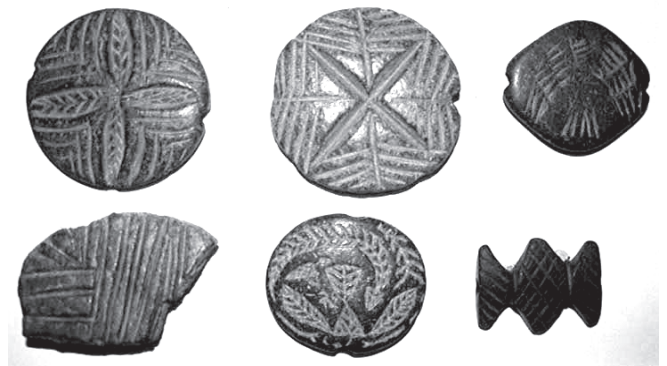
Ubaid Period stone seals