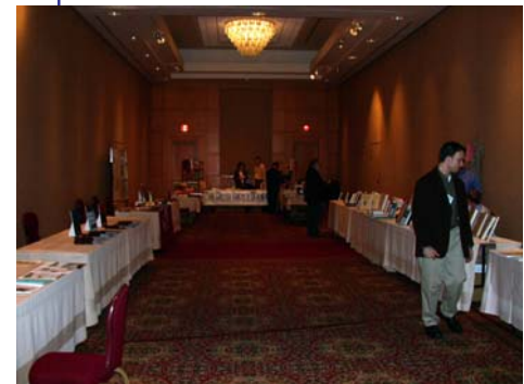
A view of a part of the book display.