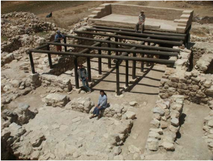
"Four-room" House at Tall al-'Umayri.