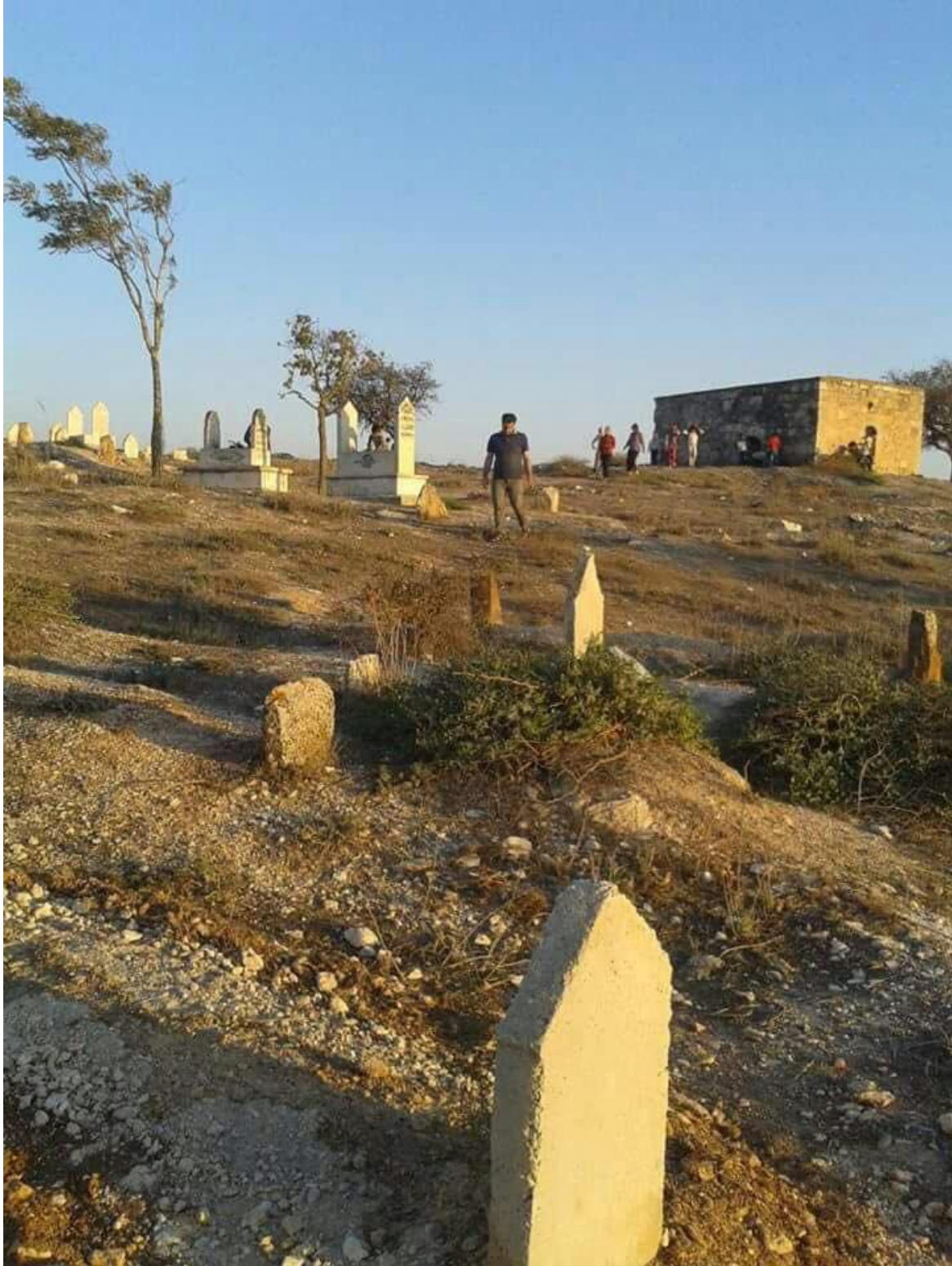
The cemetery with Ali Dada Shrine visible in the upper right corner (Afrin Media Center; June 20, 2018)