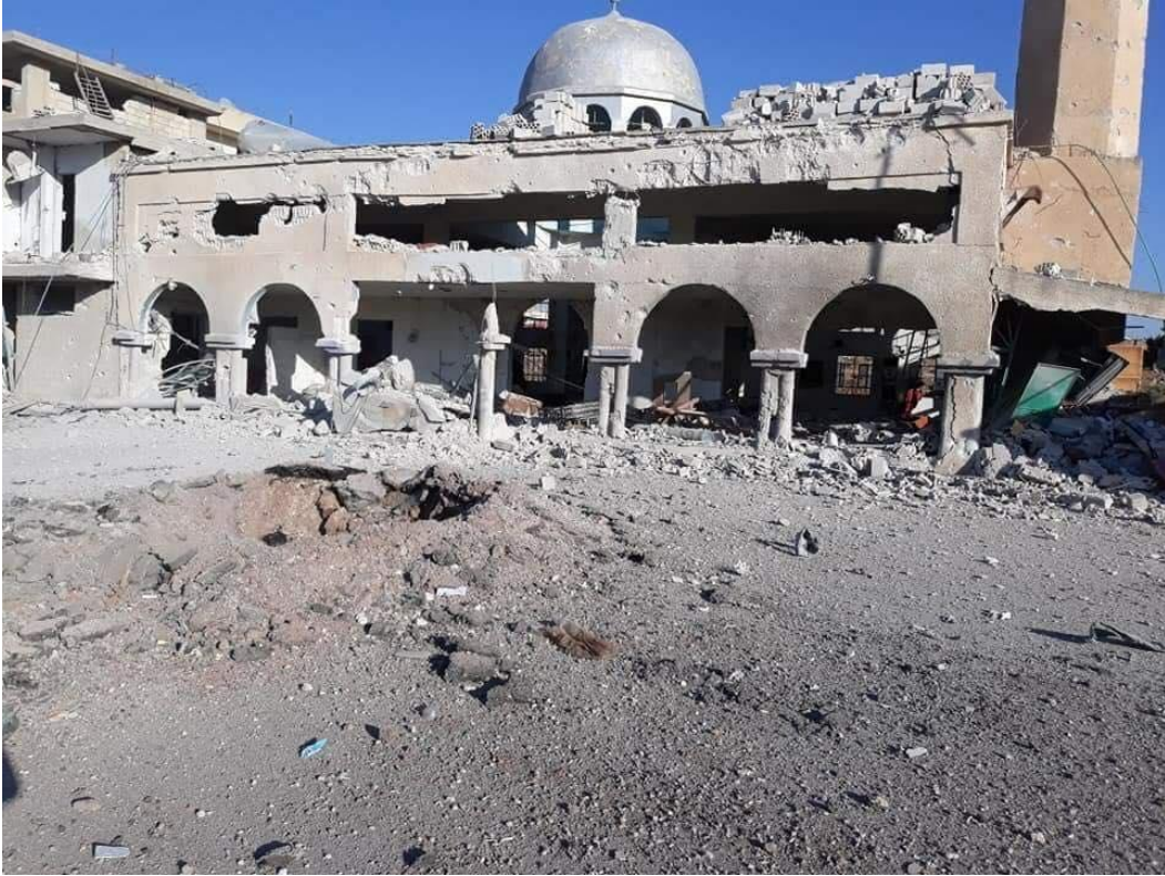
Severe damage to the Abu Bakr al-Seddeiq Mosque (SNHR; June 27, 2018)