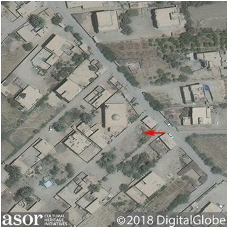
A crater is seen to the southeast of the mosque (July 10, 2018)