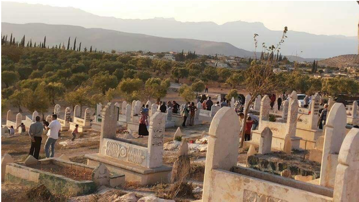
The cemetery before its militarization (Afrin Media Center; June 20, 2018)

https://www.facebook.com/snaraneews/photos/pcb.2040161842924794/2040161759591469/