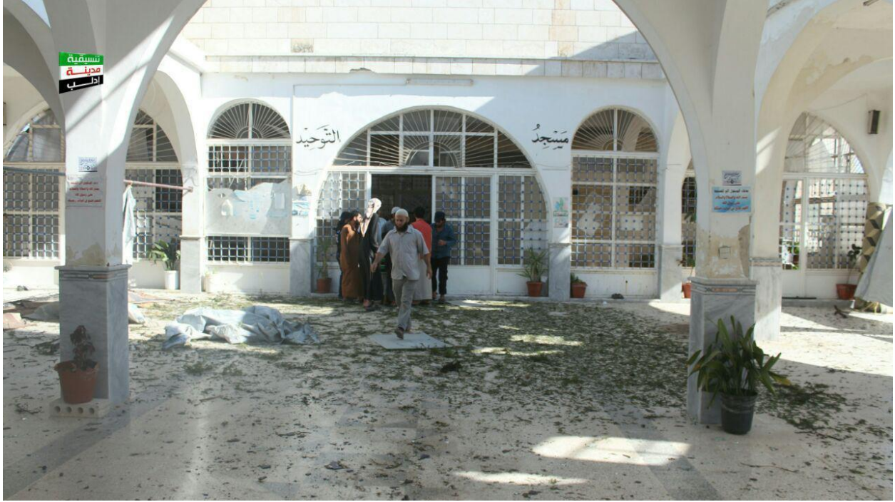
Damage to the al-Tawhid Mosque (SNHR; June 21, 2018)