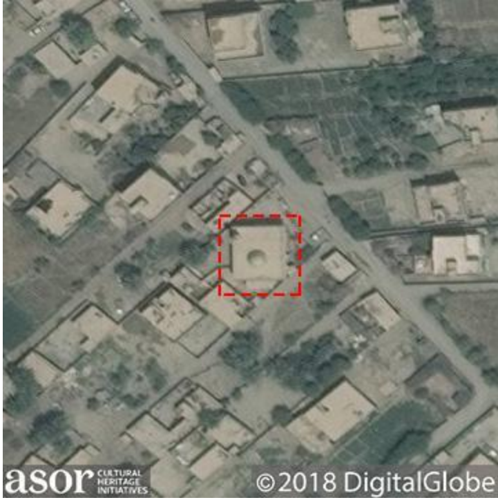
The mosque prior to the airstrike (May 11, 2018)