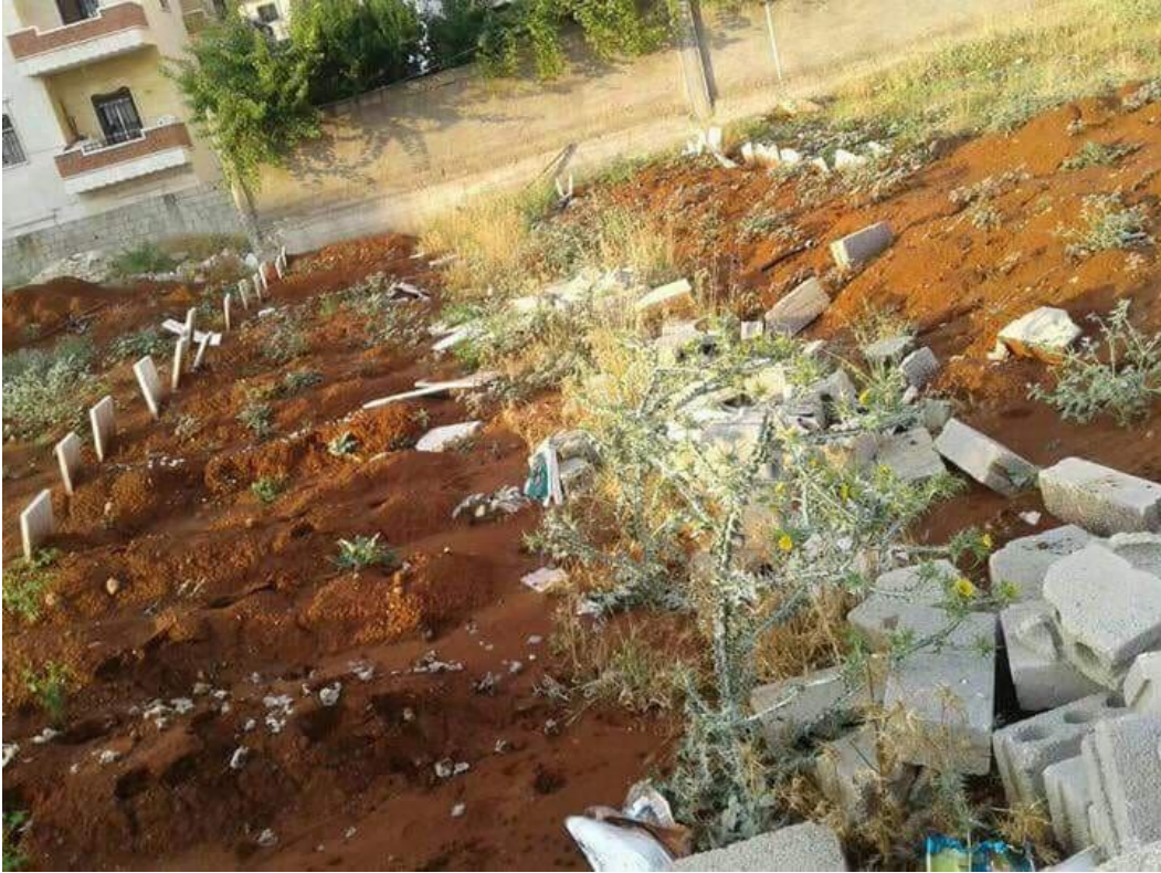
Vandalism to an unnamed cemetery in Afrin (June 17, 2018)