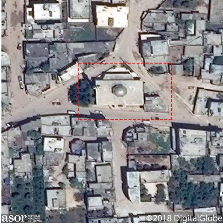
The Saad bin Mu'ath Mosque prior to any visible damage (April 24, 2018)