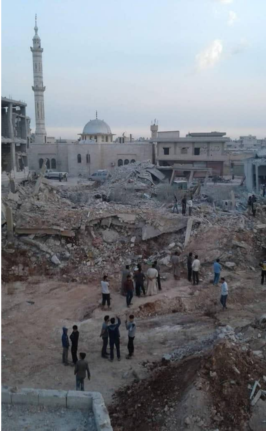
Destruction of buildings south of Saad bin Mu'ath Mosque (June 7, 2018)