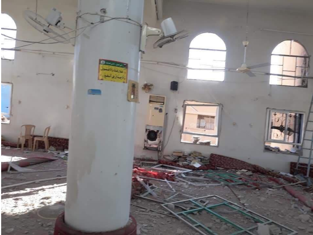
Severe damage to the Abu Bakr al-Seddeiq Mosque (SNHR: June 27, 2018)