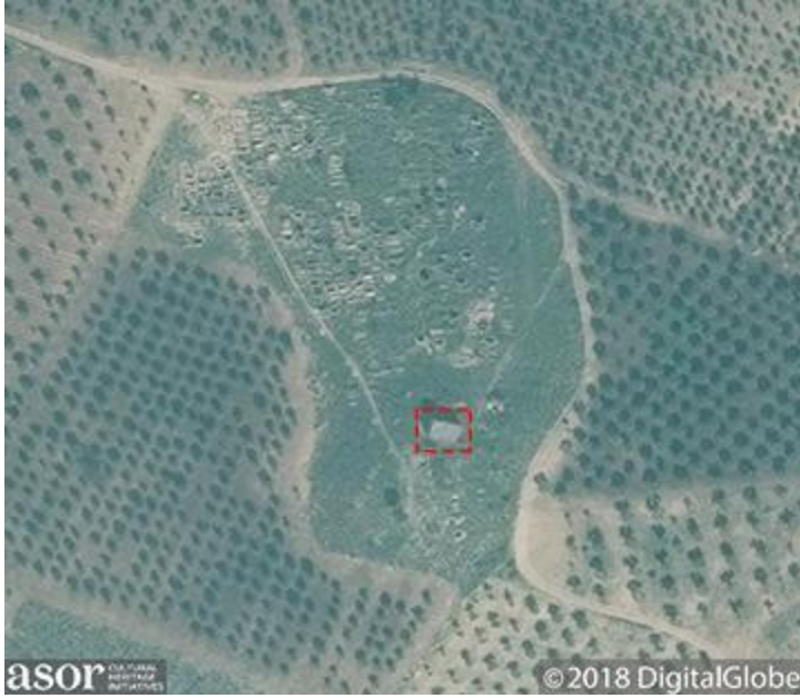
Anqale cemetery and Ali Dada shrine (located in the red rectangle) prior to destruction (© 2018 DigitalGlobe; February 5, 2018)