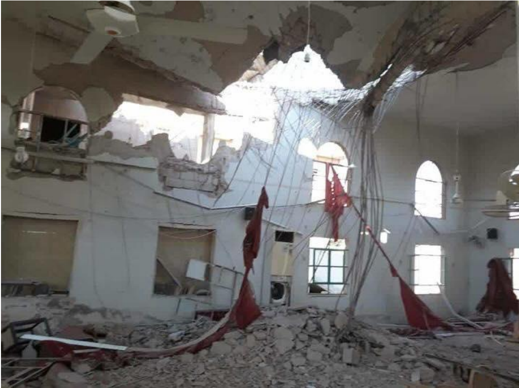
Severe damage to the Abu Bakr al-Seddeiq Mosque (SNHR: June 27, 2018)