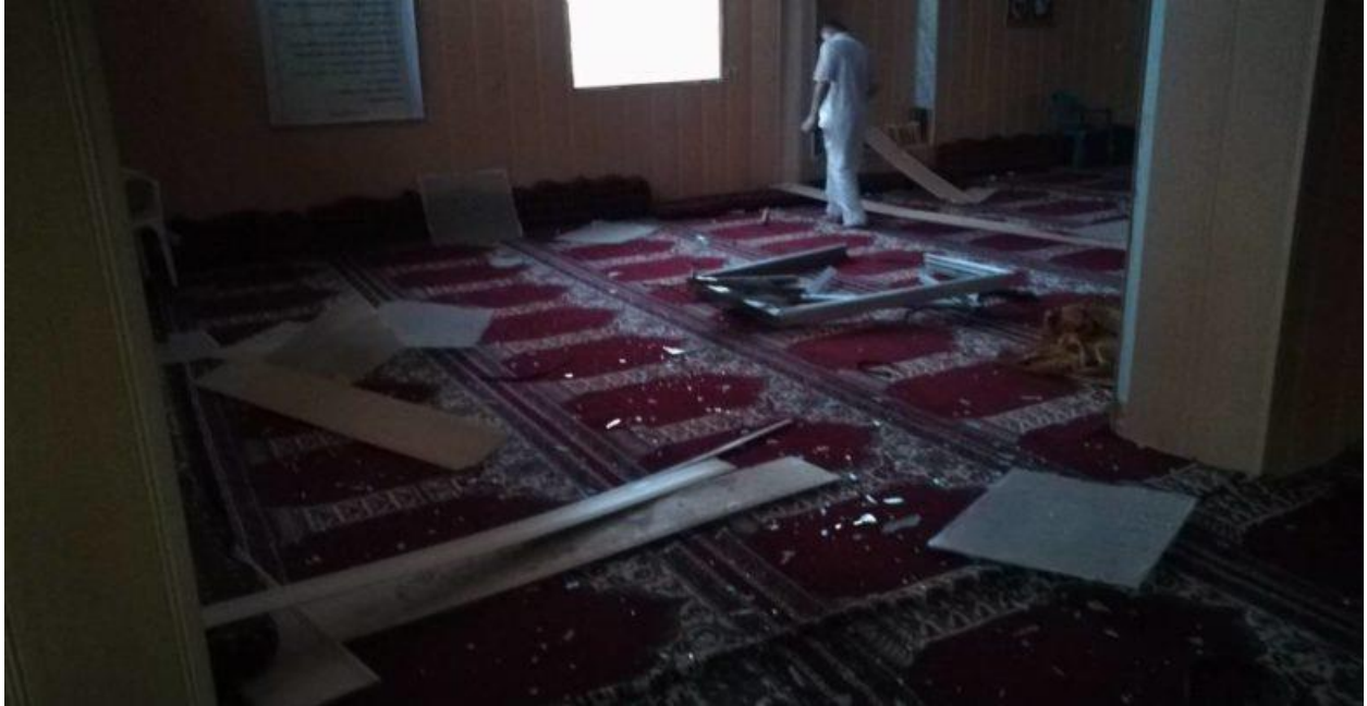
Damage to the interior of the Abu Obayda bin al-Jarrah Mosque (SNHR; July 8, 2018)