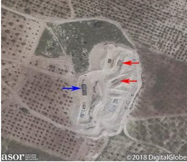
Extension of the military post to the western edge of the cemetery and the placement of vehicles (red arrows) and tents (blue arrow) on the site (April 24, 2018)