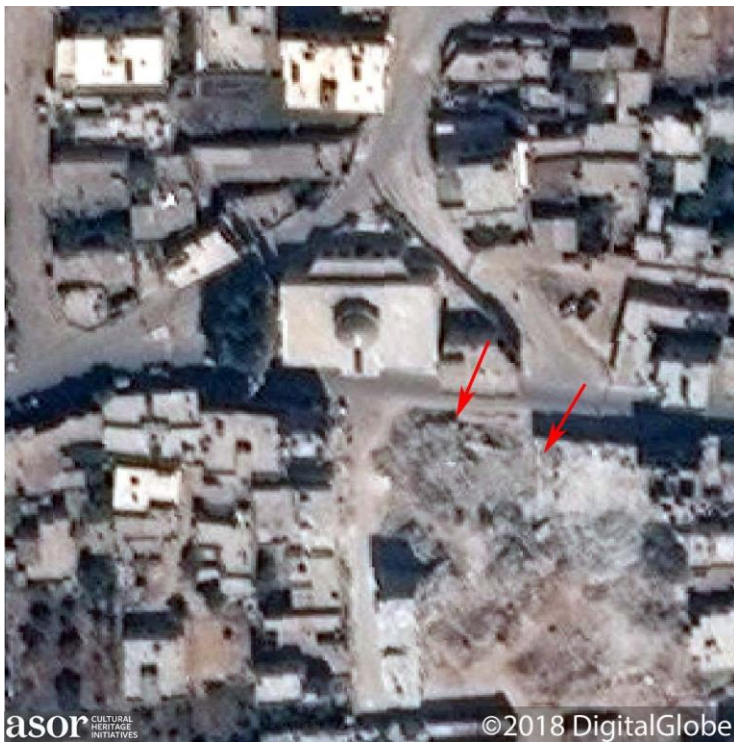
Red arrows indicate the area of damage from airstrikes south of the mosque; there is no visible evidence of damage to the mosque itself (September 18, 2018)