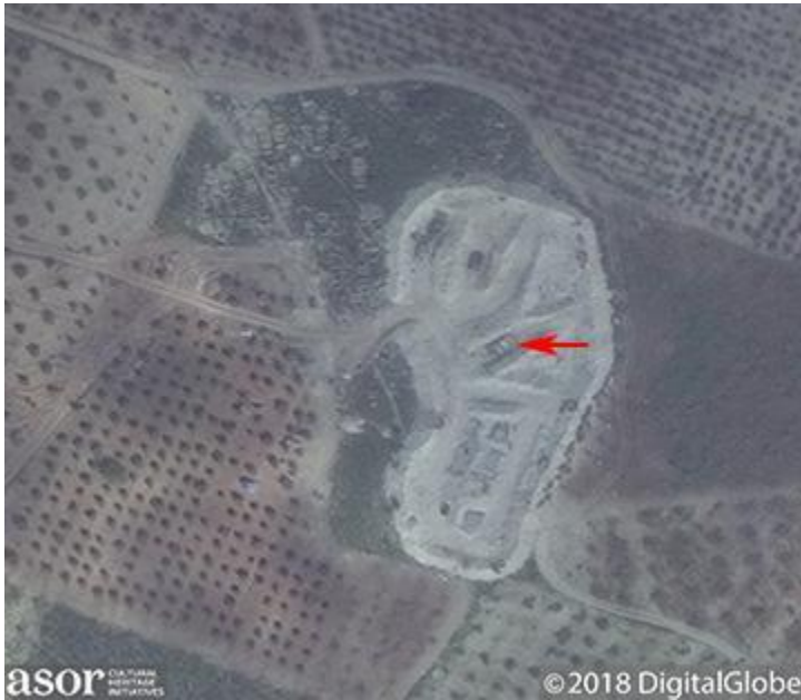
Military post built over the southern portion of the cemetery and the Ali Dada shrine destroyed. A military vehicle can be seen on site (red arrow). The northern part of the cemetery is intact (March 17, 2018)