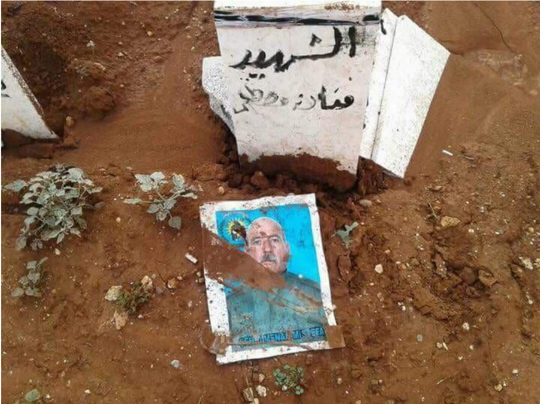
Vandalism to an unnamed cemetery in Afrin (Afrin Resistance/Facebook; June 17, 2018)