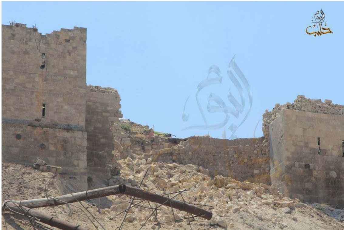
Aleppo Citadel (APSA; July 12, 2015)