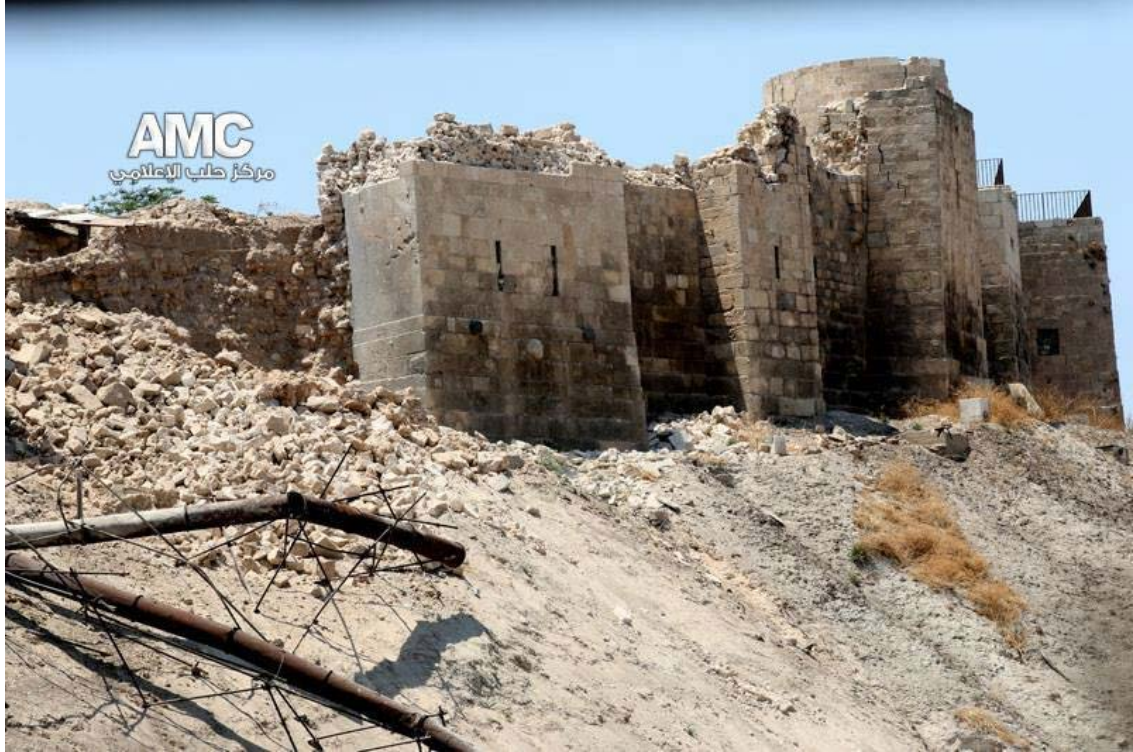
Aleppo Citadel (APSA; July 12, 2015)