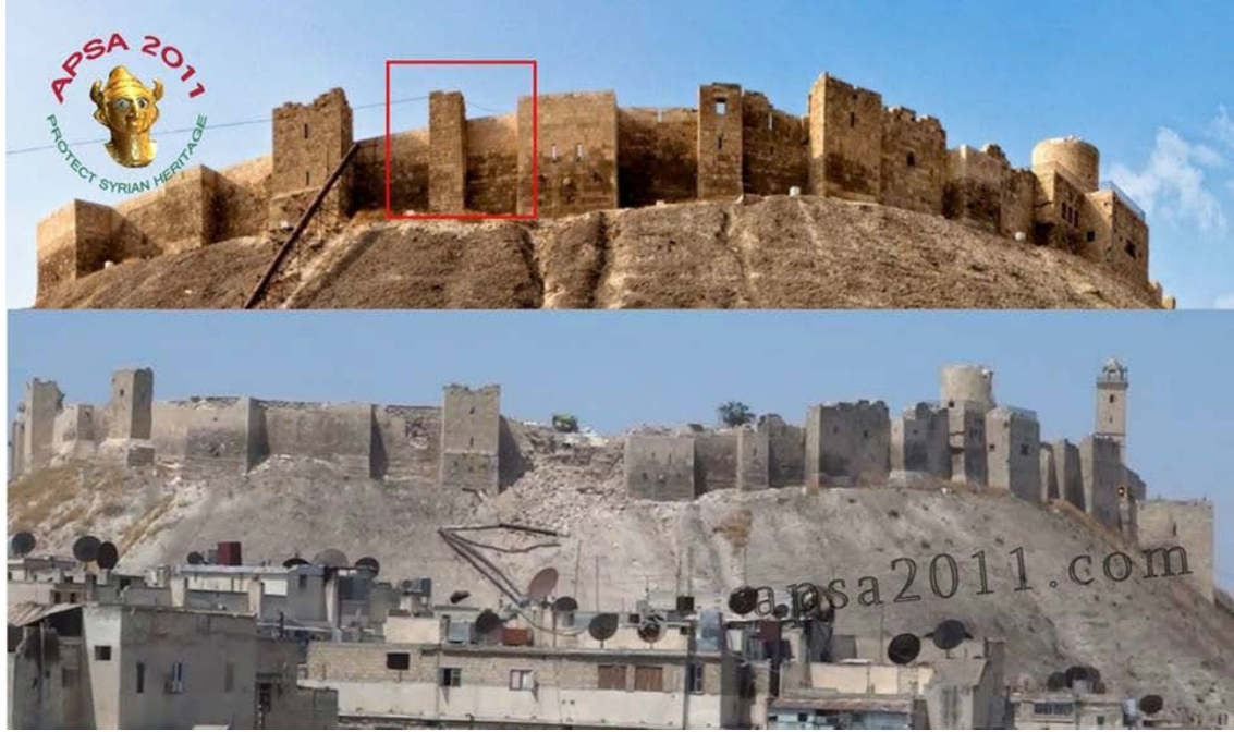
Aleppo Citadel (APSA; July 12, 2015)