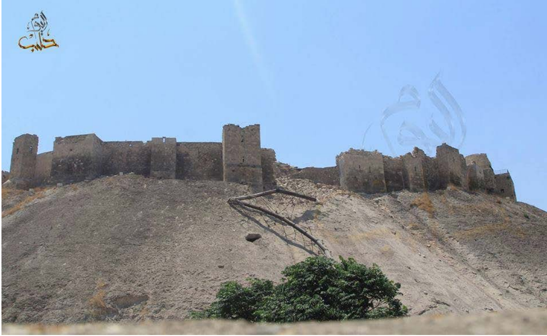
Aleppo Citadel (APSA; July 12, 2015)