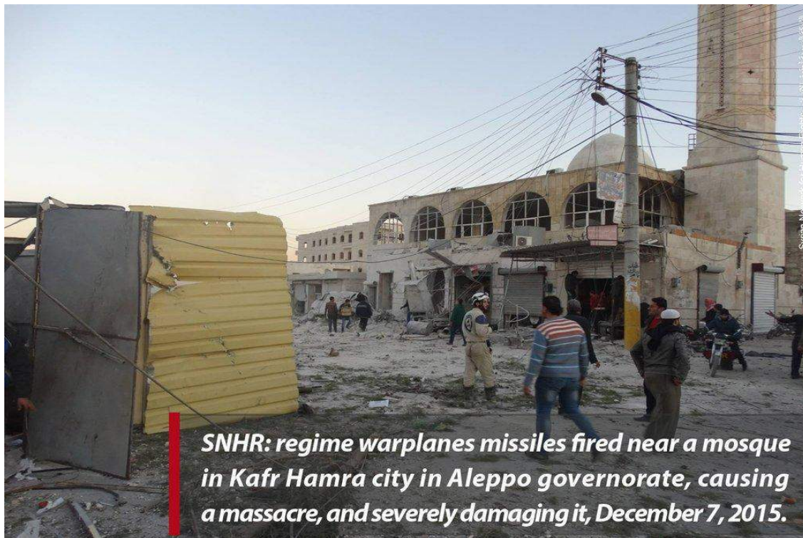
SNHR: regime warplanes missiles fired near a mosque in Kafr Hamra city in Aleppo governorate, causing a massacre, and severely damaging it, December 7, 2015.