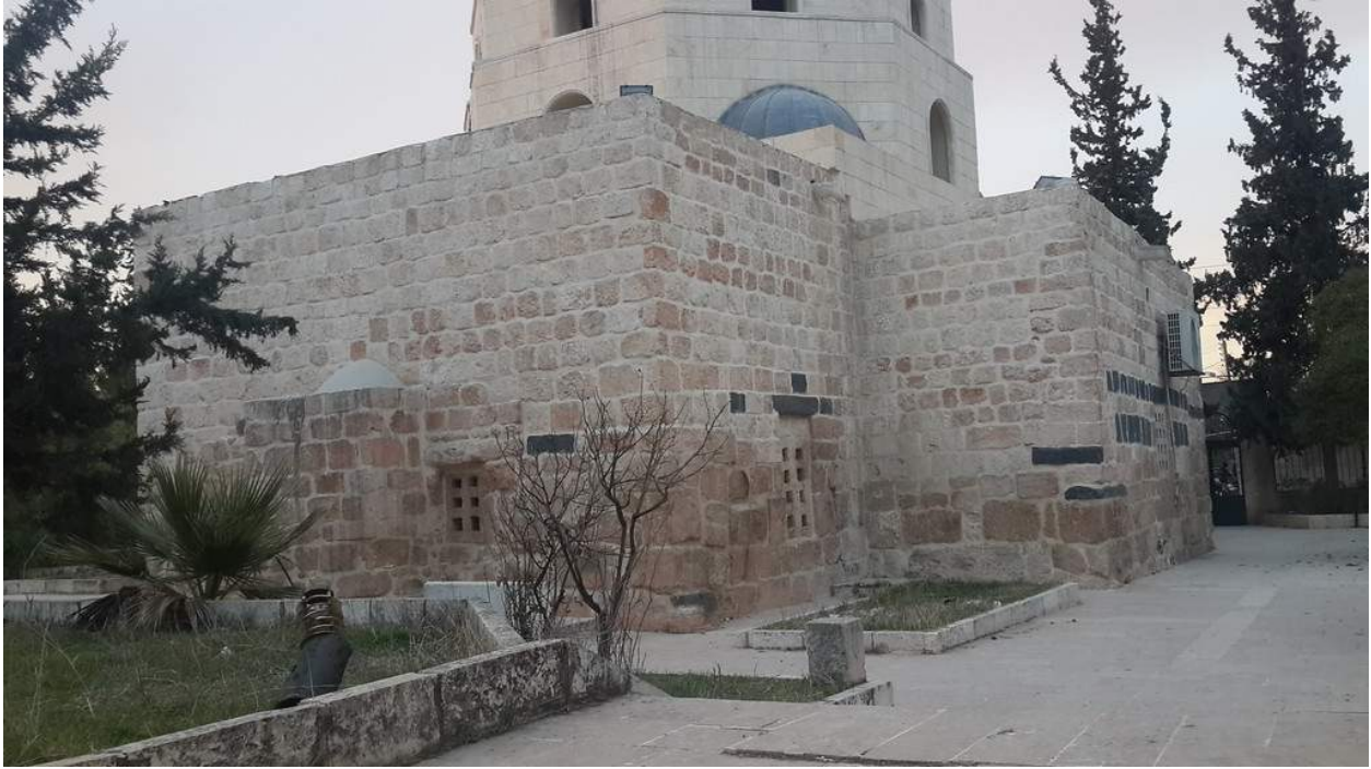
Tomb of Omar Bin Abdul Aziz (Reported November 30, 2015)