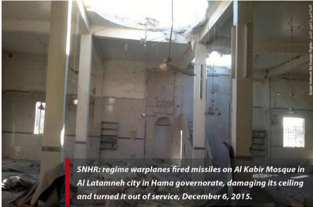
Damage to Al Kabir Mosque (Syrian Network for Human Rights; December 6, 2015)