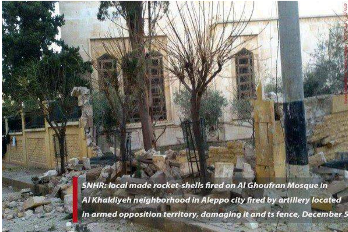
SNHR: local made rocket-shells fired on Al Ghoufran Mosque in Al Khaldiye neighborhood in Aleppo city fired by artillery located in armed opposition territory, damaging it and its fence, December 5