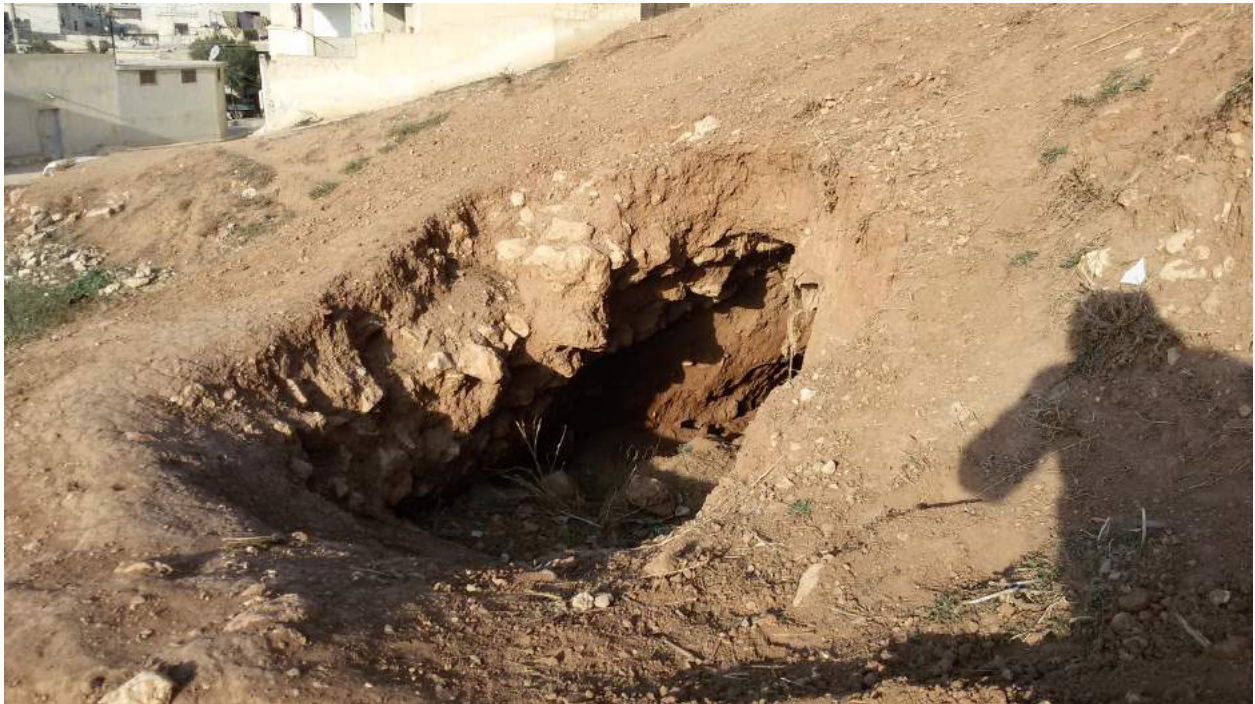
Al-Atareb, evidence of digging in search of antiquities (Reported November 30, 2015)