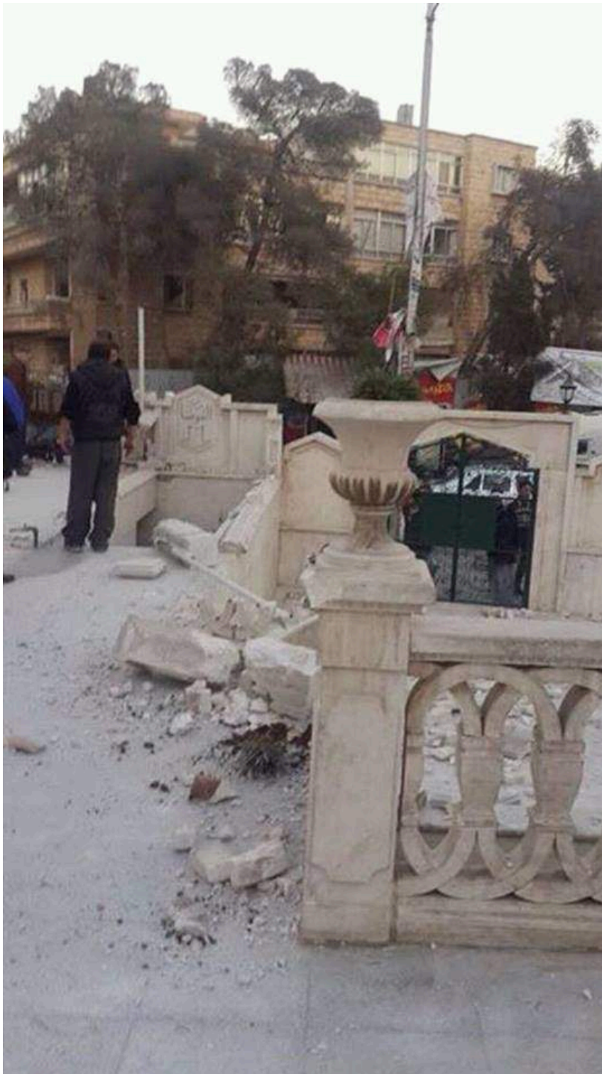
Damage to Al Rawda Mosque (Syrian Network for Human Rights; November 25, 2015)

Hretan City Media: https://www.youtube.com/watch?v=E8JZoTlwWfQ