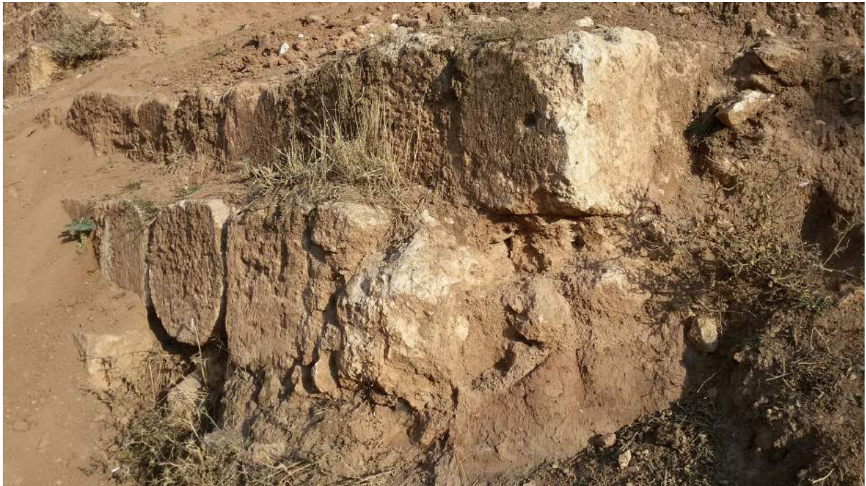
Al-Atareb, damage from gunfire (Reported November 30, 2015)