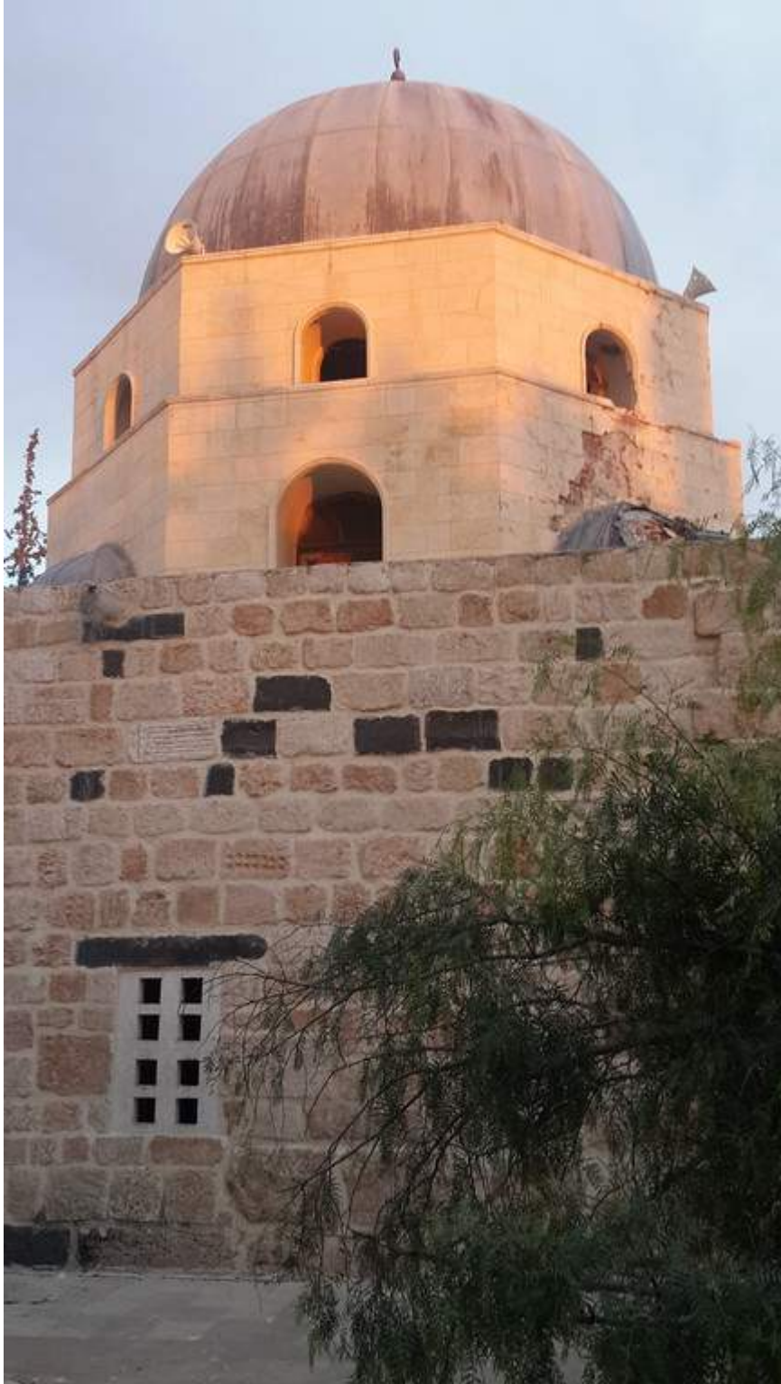
Tomb of Omar Bin Abdul Aziz (Reported November 30, 2015)