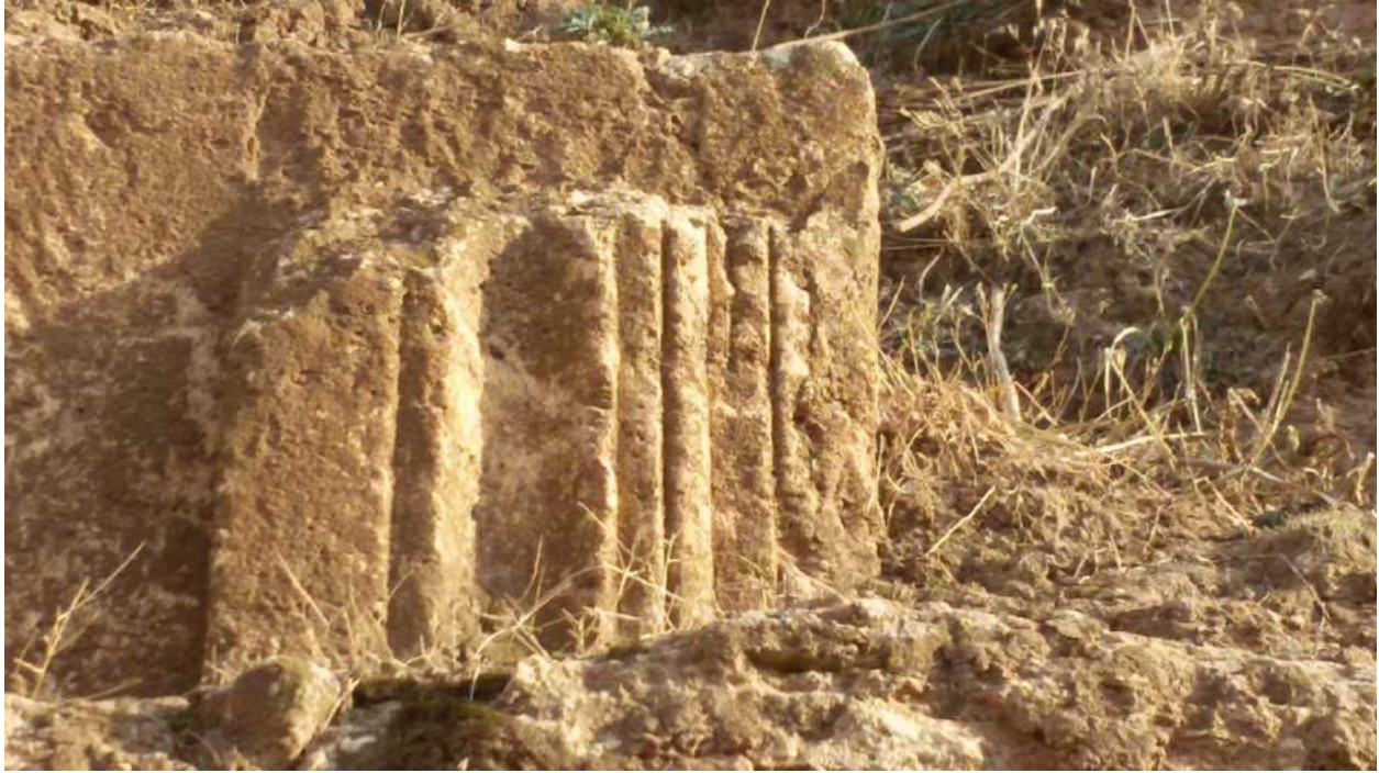
Al-Atareb, carved architectural element from the ancient theater (Reported November 30, 2015)