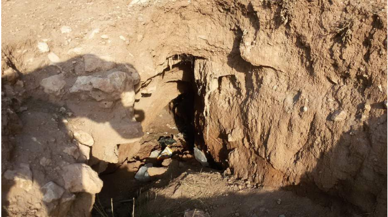
Al-Atareb, evidence of digging in search of antiquities (Reported November 30, 2015)