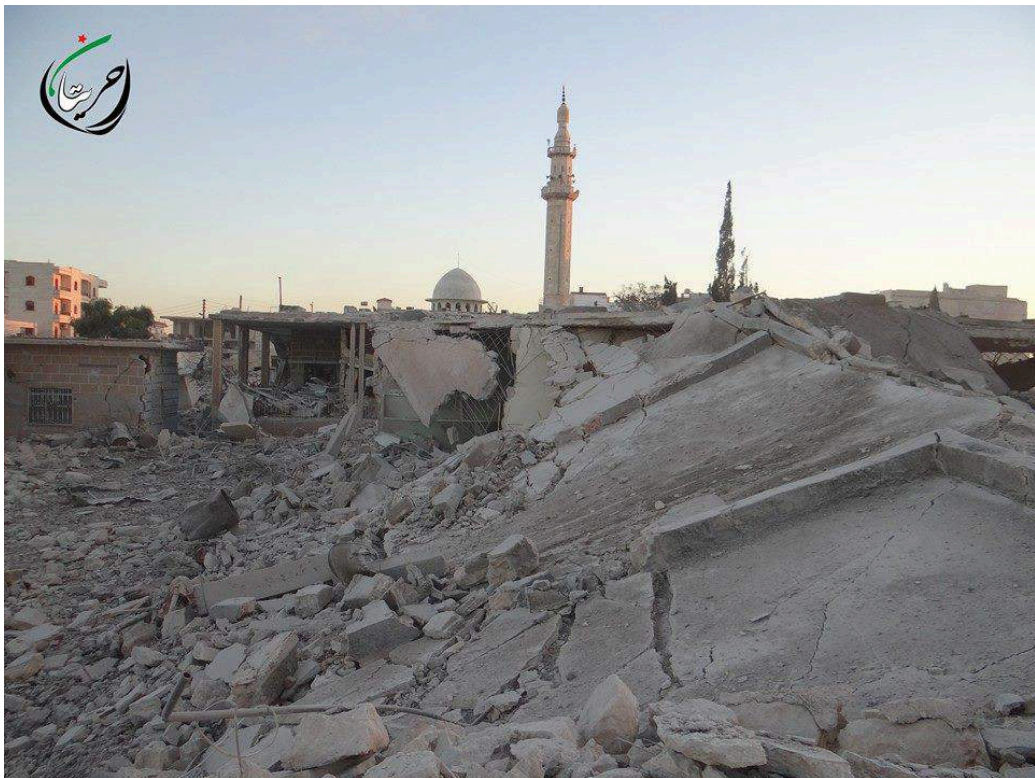
Damage surrounding mosque in Kafr Hamra (December 7, 2015)