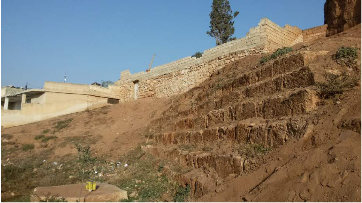
Al-Atareb, ancient theater on the shoulder of the hill (Reported November 30, 2015)