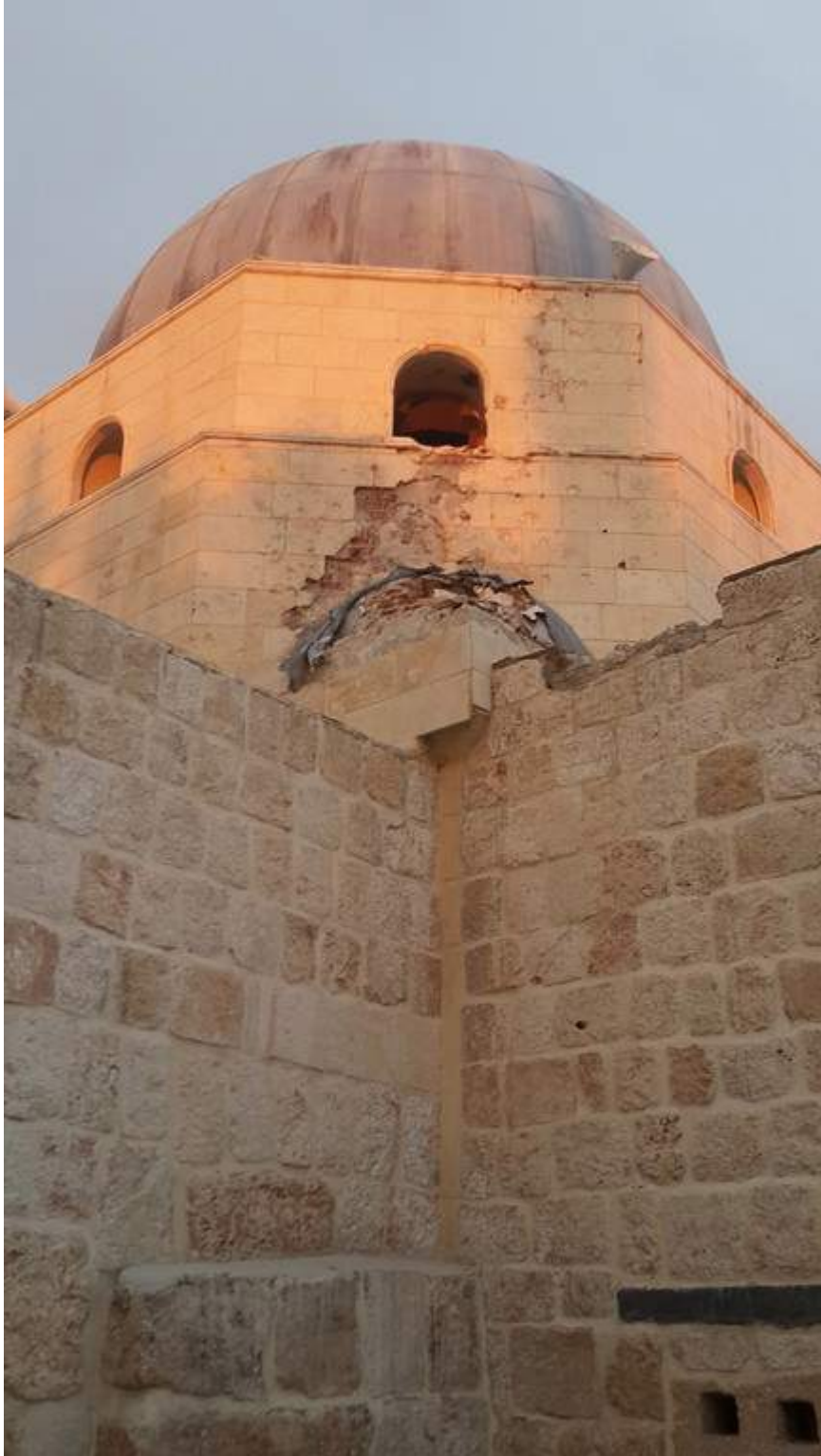
Tomb of Omar Bin Abdul Aziz, exterior of the shrine viewed from the western side showing the bombardment of the roof (Reported November 30, 2015)