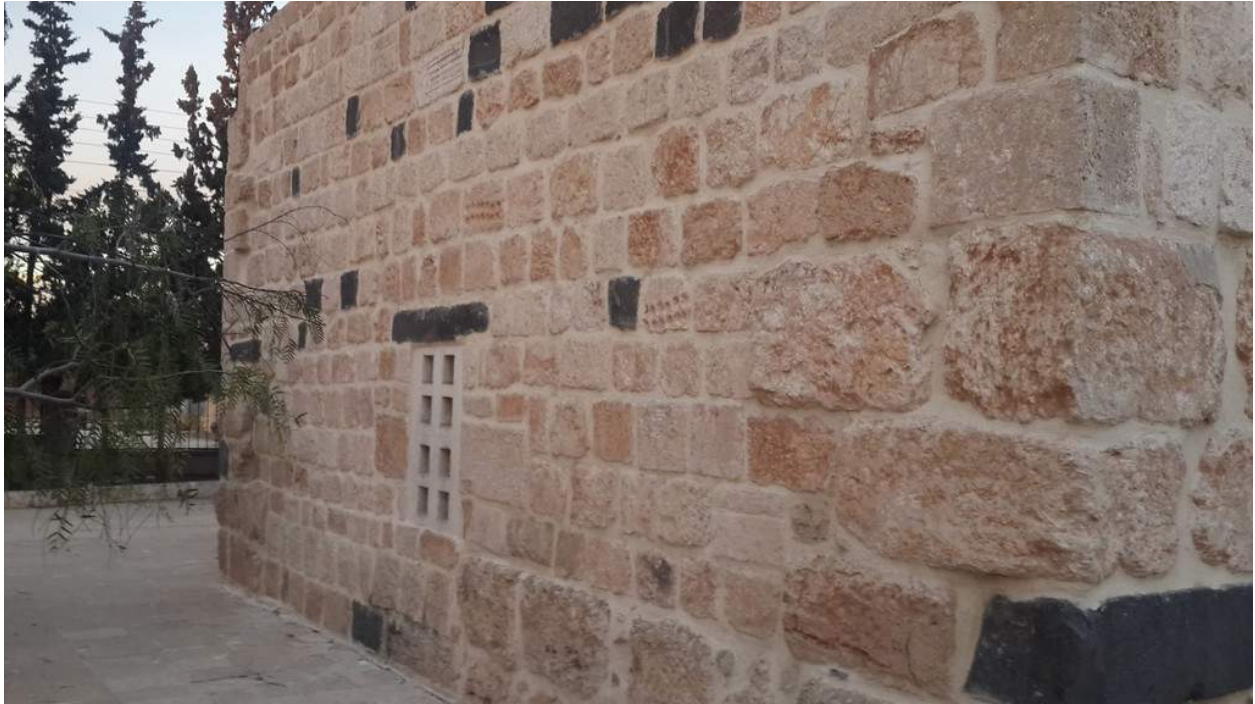
Tomb of Omar Bin Abdul Aziz (Reported November 30, 2015)