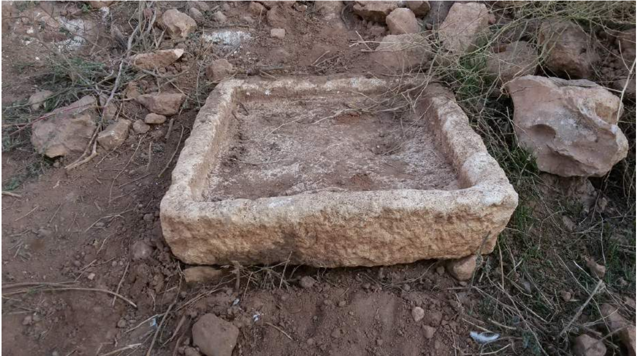
Al-Atareb, exposed basin (Reported November 30, 2015)