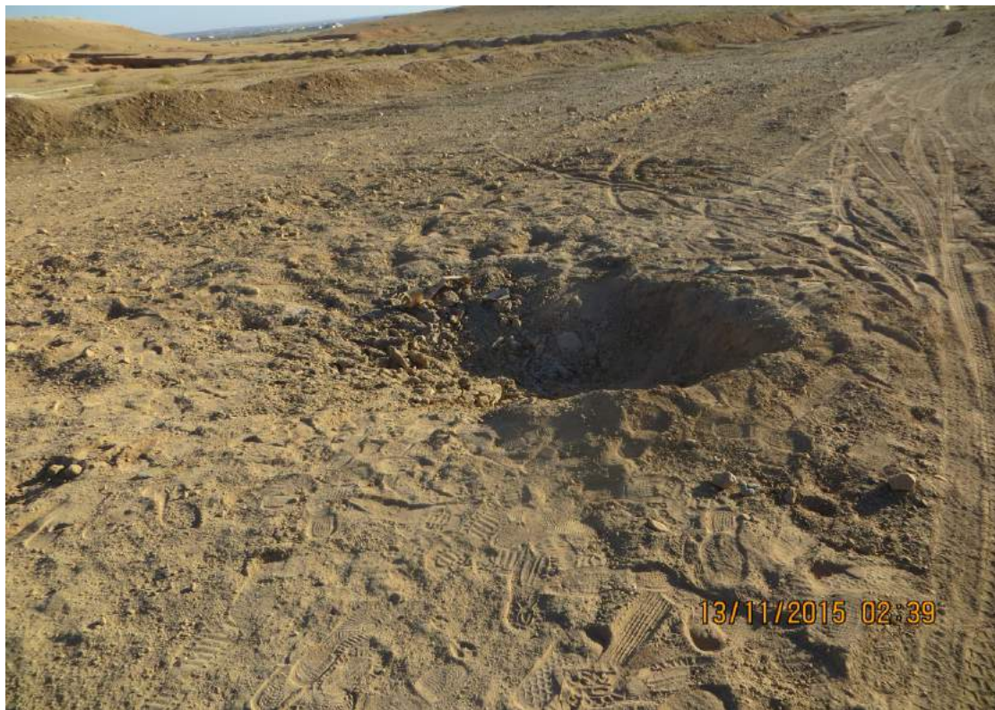
The eastern slope the damages from the Russian air attack