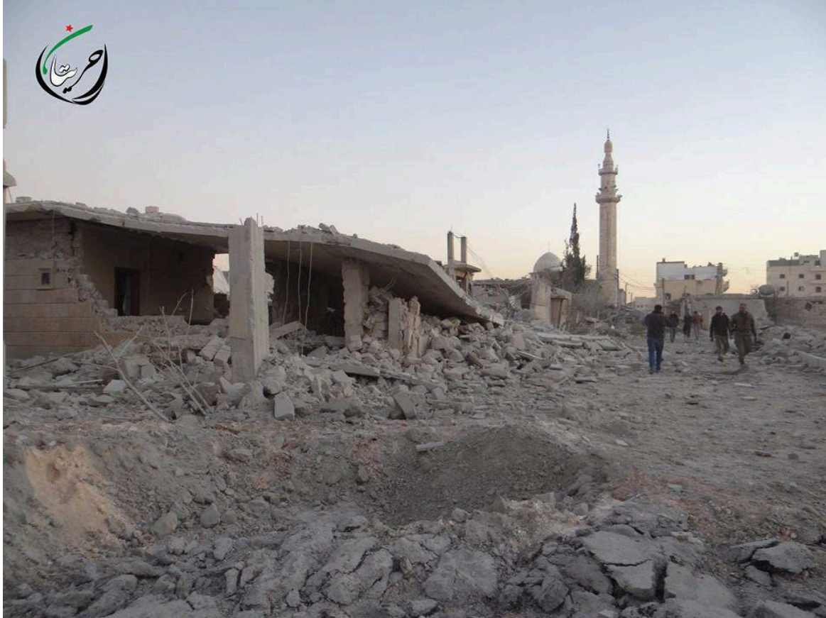
Damage surrounding mosque in Kafr Hamra (December 7, 2015)