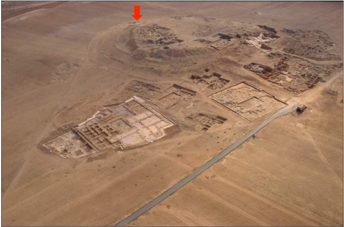
The eastern slope where the Russian air attack took place