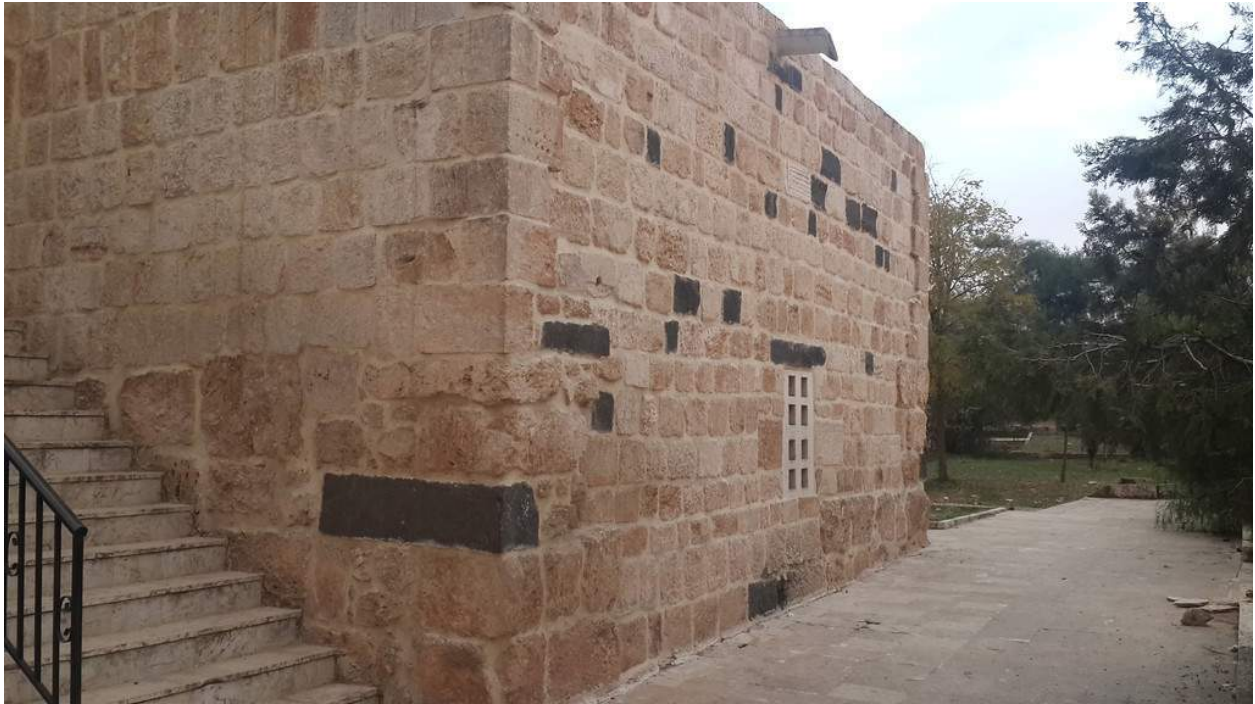
Tomb of Omar Bin Abdul Aziz (Reported November 30, 2015)