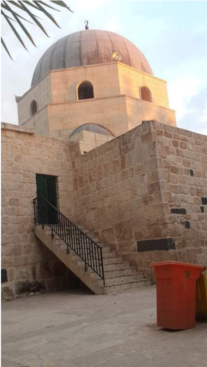
Tomb of Omar Bin Abdul Aziz (Reported November 30, 2015)