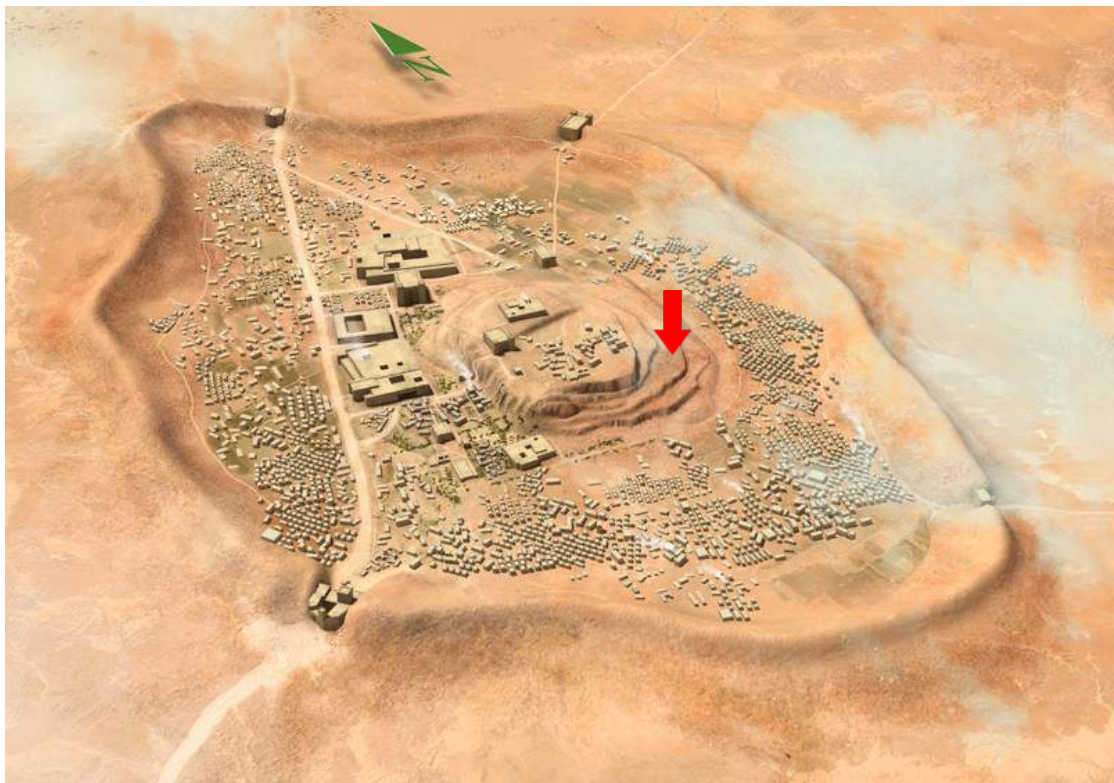
The eastern slope where the Russian air attack took place