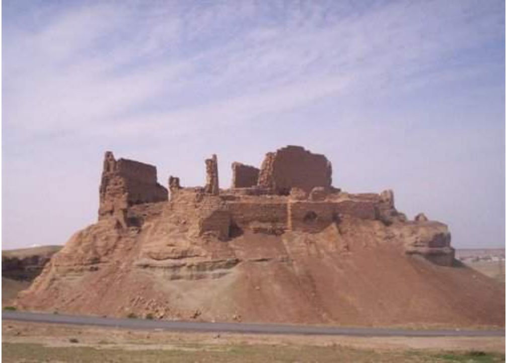
Qaalat al-Rahbehh (Raqqqa is Being Slaughtered Silently; December 3, 2015)