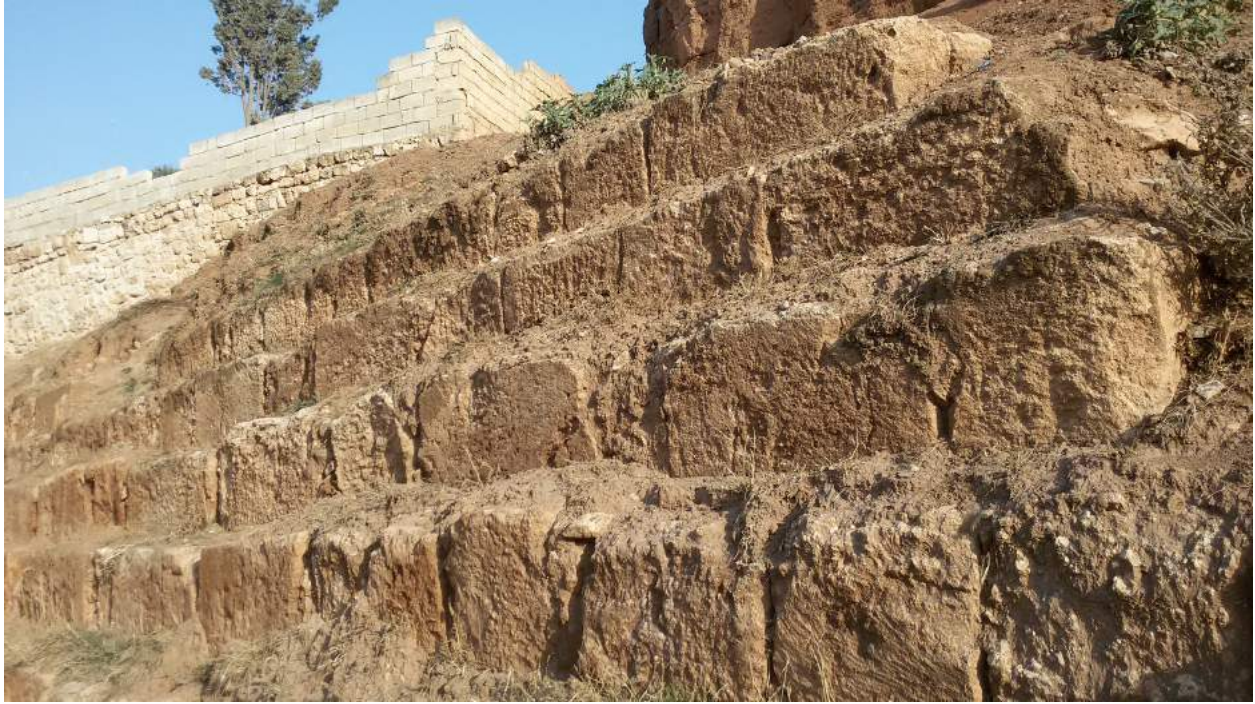
Al-Atareb, ancient theater on the shoulder of the hill (Reported November 30, 2015)