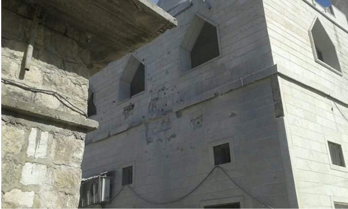
Possible image of the exterior of Bab Al Hawa Mosque with visible damage to the exterior wall (December 7, 2015)