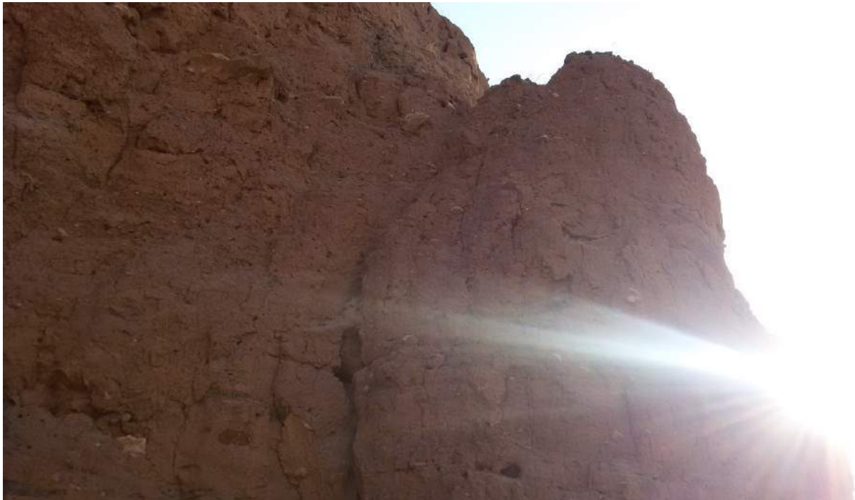
Al-Atareb, view of the collapse from on top of the ancient hill (Reported November 30, 2015)