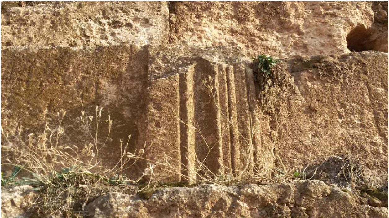
Al-Atareb, carved architectural element from the ancient theater (Reported November 30, 2015)