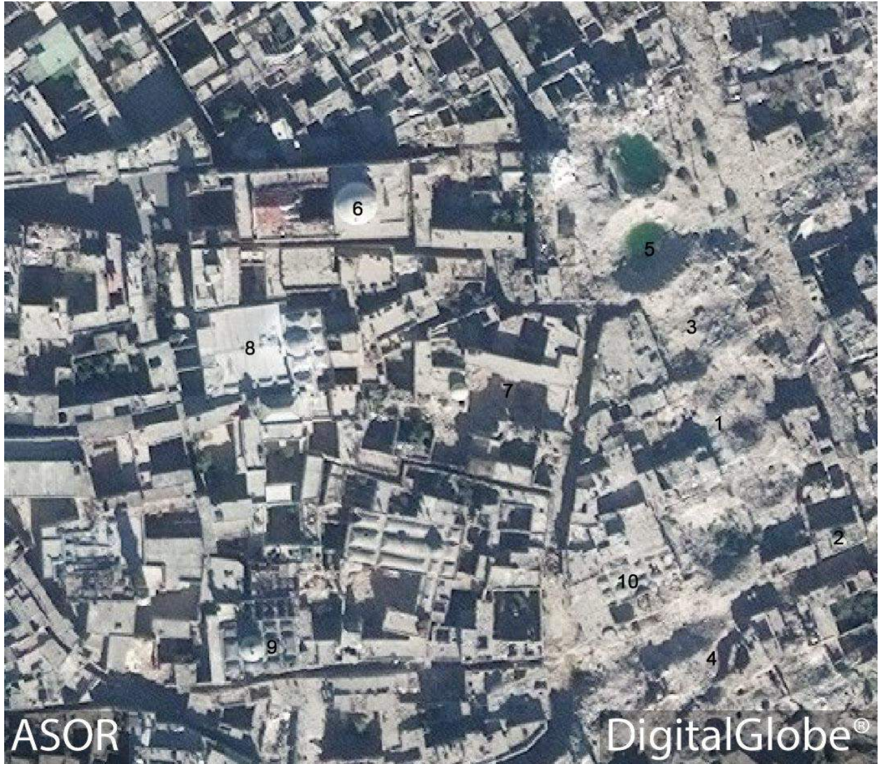
Jdeide Quarter in Aleppo. Sites featured are: 1. Endowment of Ibshir Pasha; 2. Ibshir Pasha Mosque; 3. Khan Hatab; 4. Hammam Bahram Pasha; 5. Qastal Ozdmer; 6. Maronite Church; 7. Beit Ghazale; 8. Greek Catholic Church; 9. Greek Orthodox Church; 10. Historic Coffee House (DigitalGlobe; November 22, 2015)