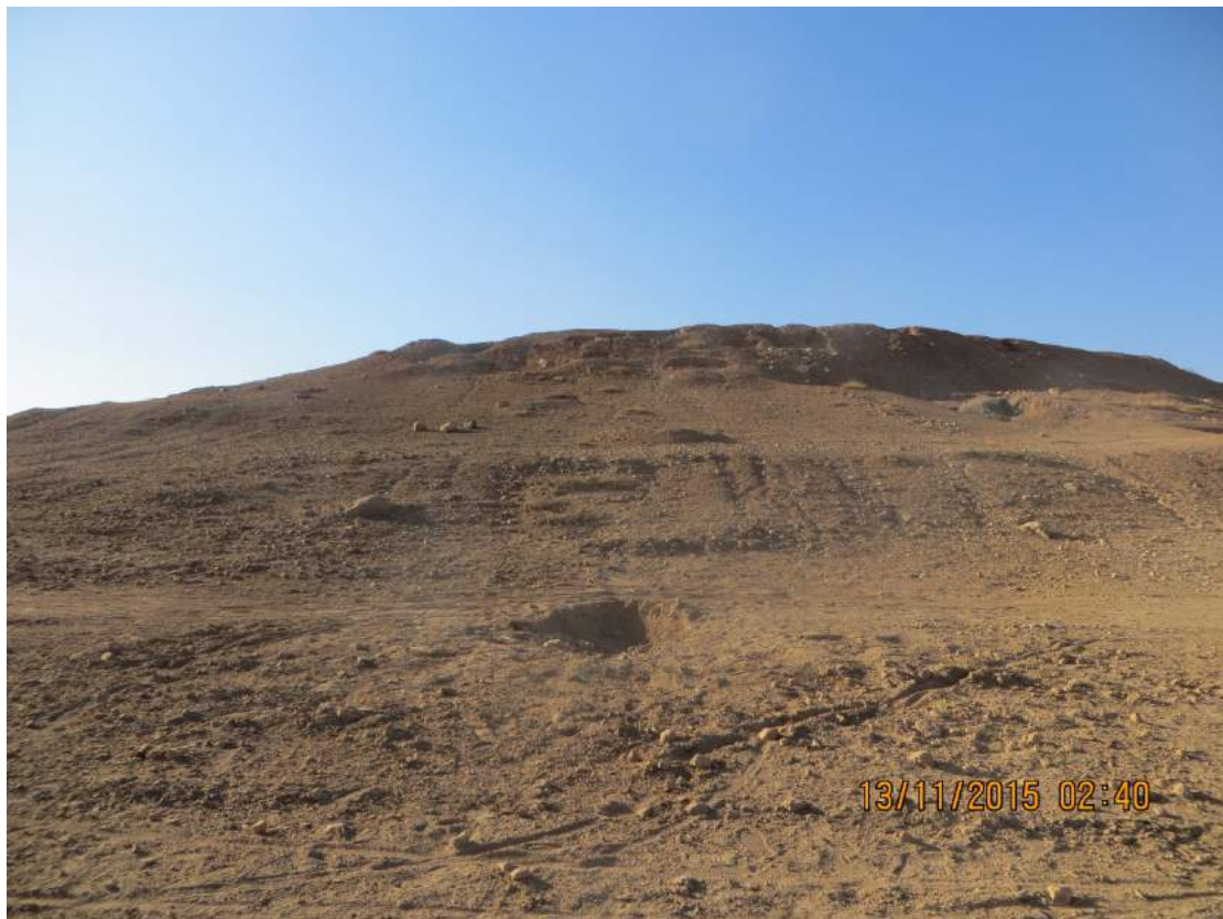
The eastern slope the damages from the Russian air attack