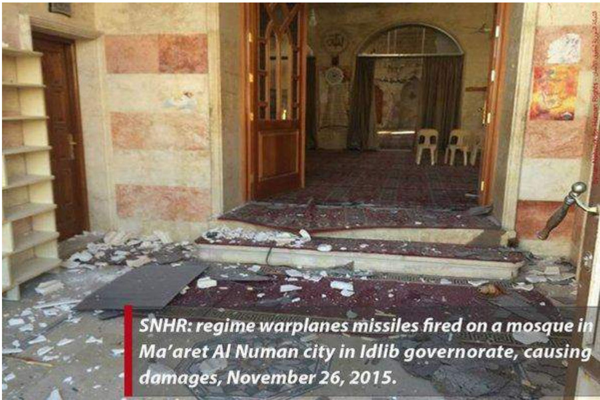
SNHR: regime warplanes missiles fired on a mosque in Ma'aret Al Numan city in Idlib governorate, causing damages, November 26, 2015.