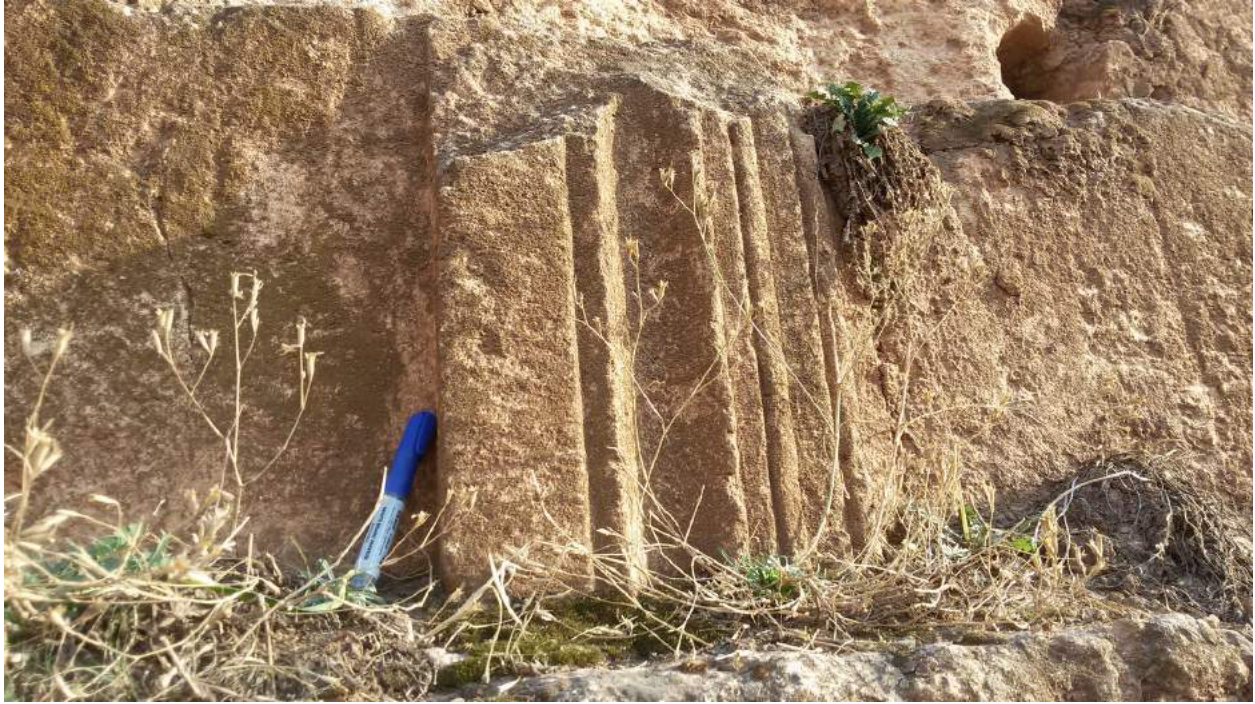
al-Atareb, carved architectural element from the ancient theater (Reported November 30, 2015)