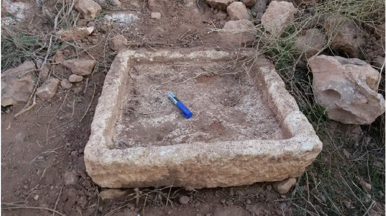
Al-Atareb, exposed basin (Reported November 30, 2015)