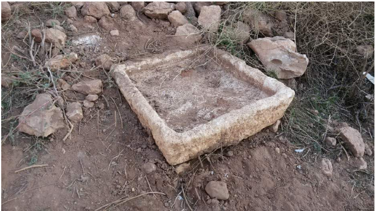
Al-Atareb, exposed stone basin (Reported November 30, 2015)