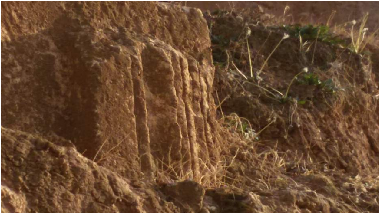
al-Atareb, carved architectural element from the ancient theater (Reported November 30, 2015)