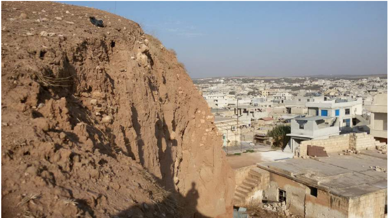
Al-Atareb, view of the collapse from on top of the ancient hill (Reported November 30, 2015)