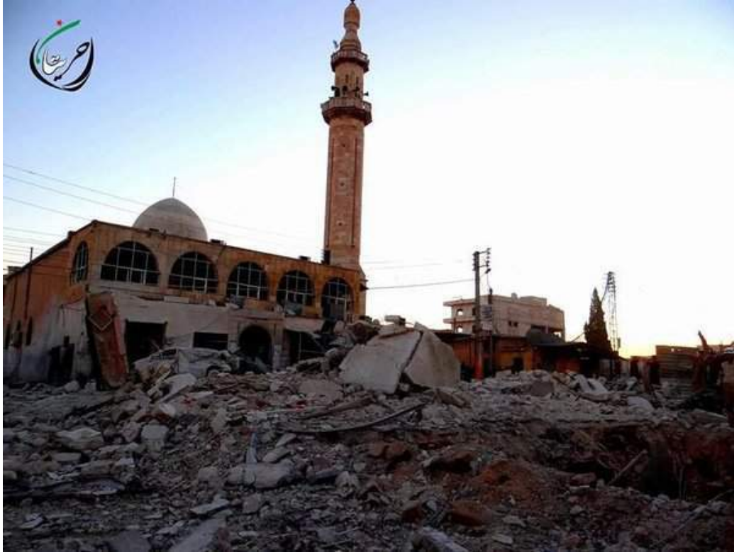
Damage surrounding mosque in Kafr Hamra (Hretan City Media; December 7, 2015)