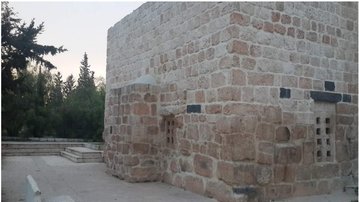
Tomb of Omar Bin Abdul Aziz (Reported November 30, 2015)