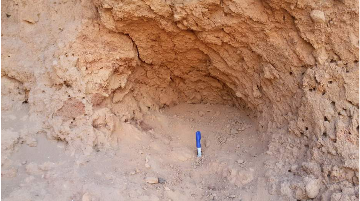
Al-Atareb, evidence of digging in search of antiquities (Reported November 30, 2015)