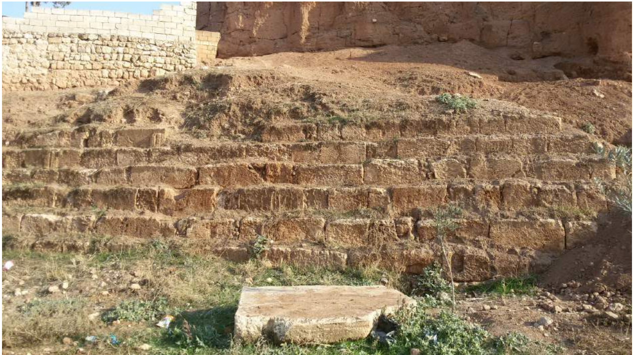
Al-Atareb, ancient theater on the shoulder of the hill (Reported November 30, 2015)