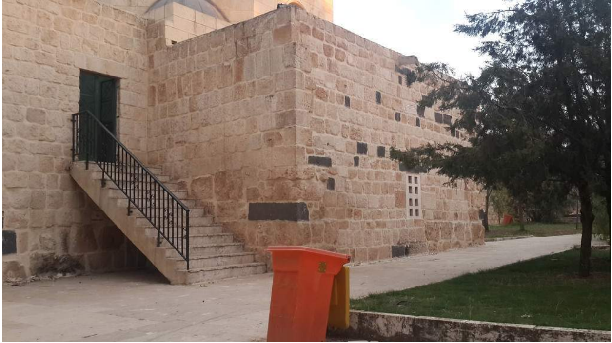
Tomb of Omar Bin Abdul Aziz (Reported November 30, 2015)