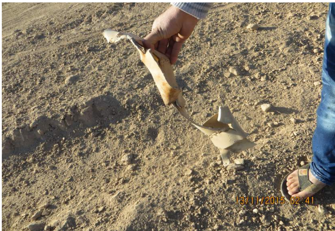
The remnants of the Russian rocket