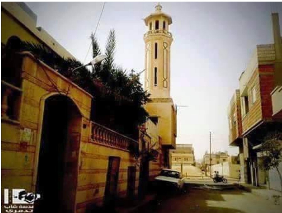
Al Eman Mosque