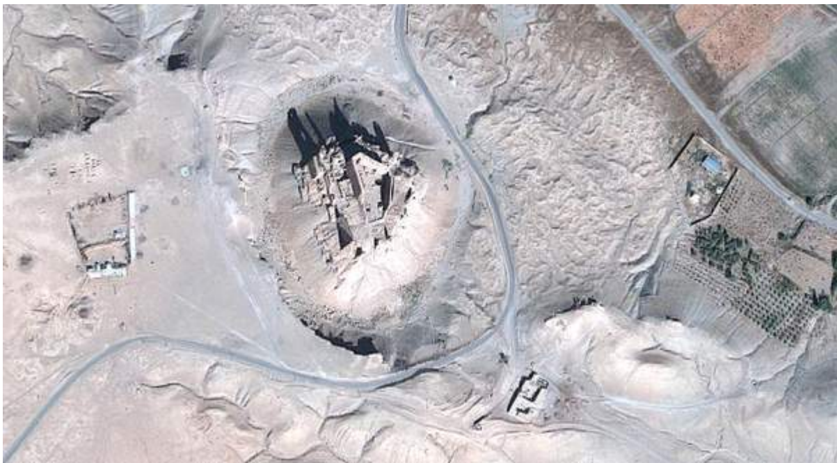
Qaalat al-Rahbeh satellite image (Raqqa is Being Slaughtered Silently; December 3, 2015)