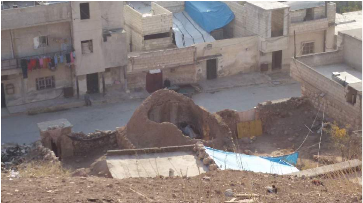
Al-Atareb, older domed house at the base of the hill (Reported November 30, 2015)

Burns, Ross (2009) The Monuments of Syria: A Guide . I. B. Tauris; Revised and expanded edition.