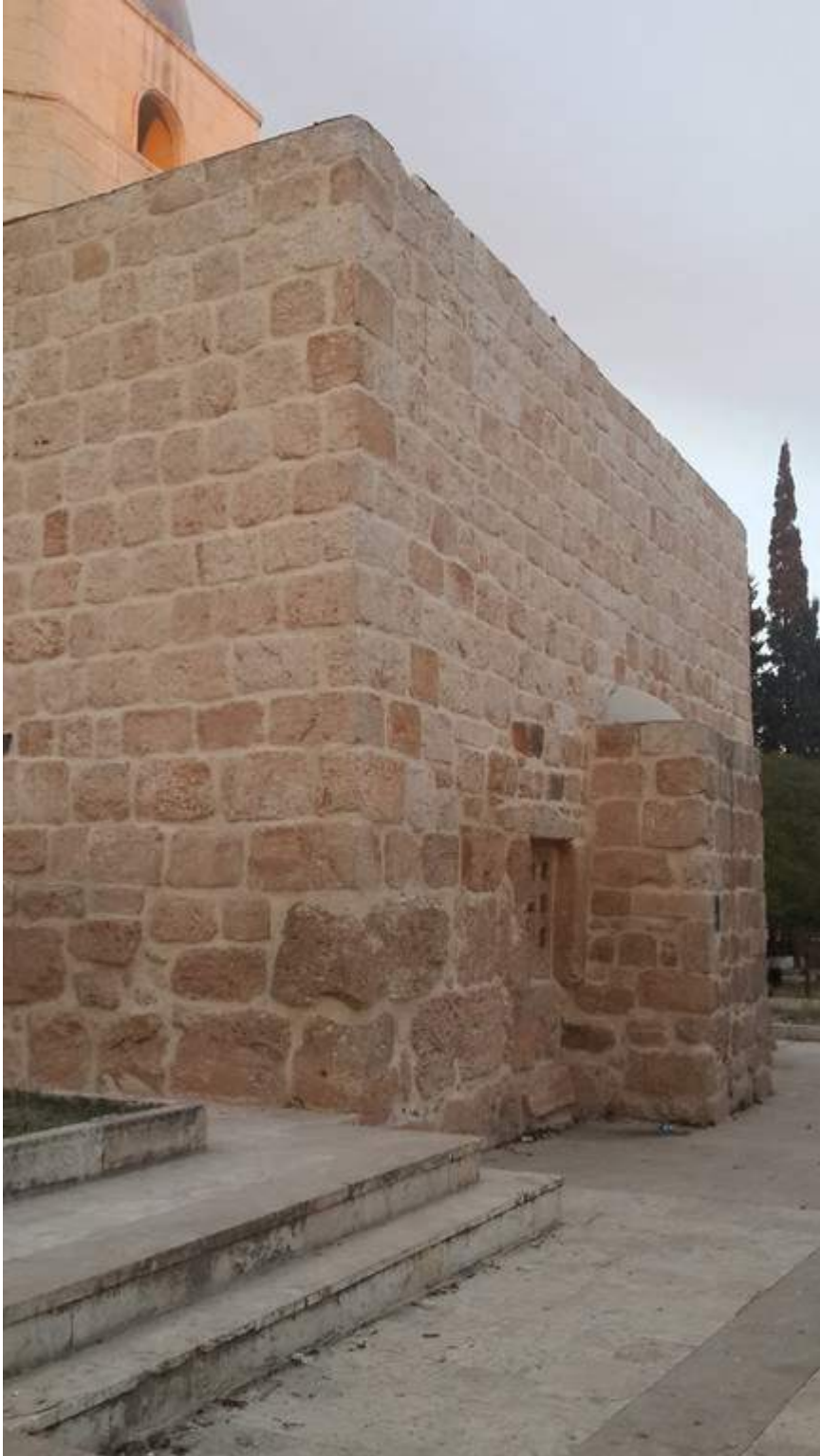
Tomb of Omar Bin Abdul Aziz (Reported November 30, 2015)