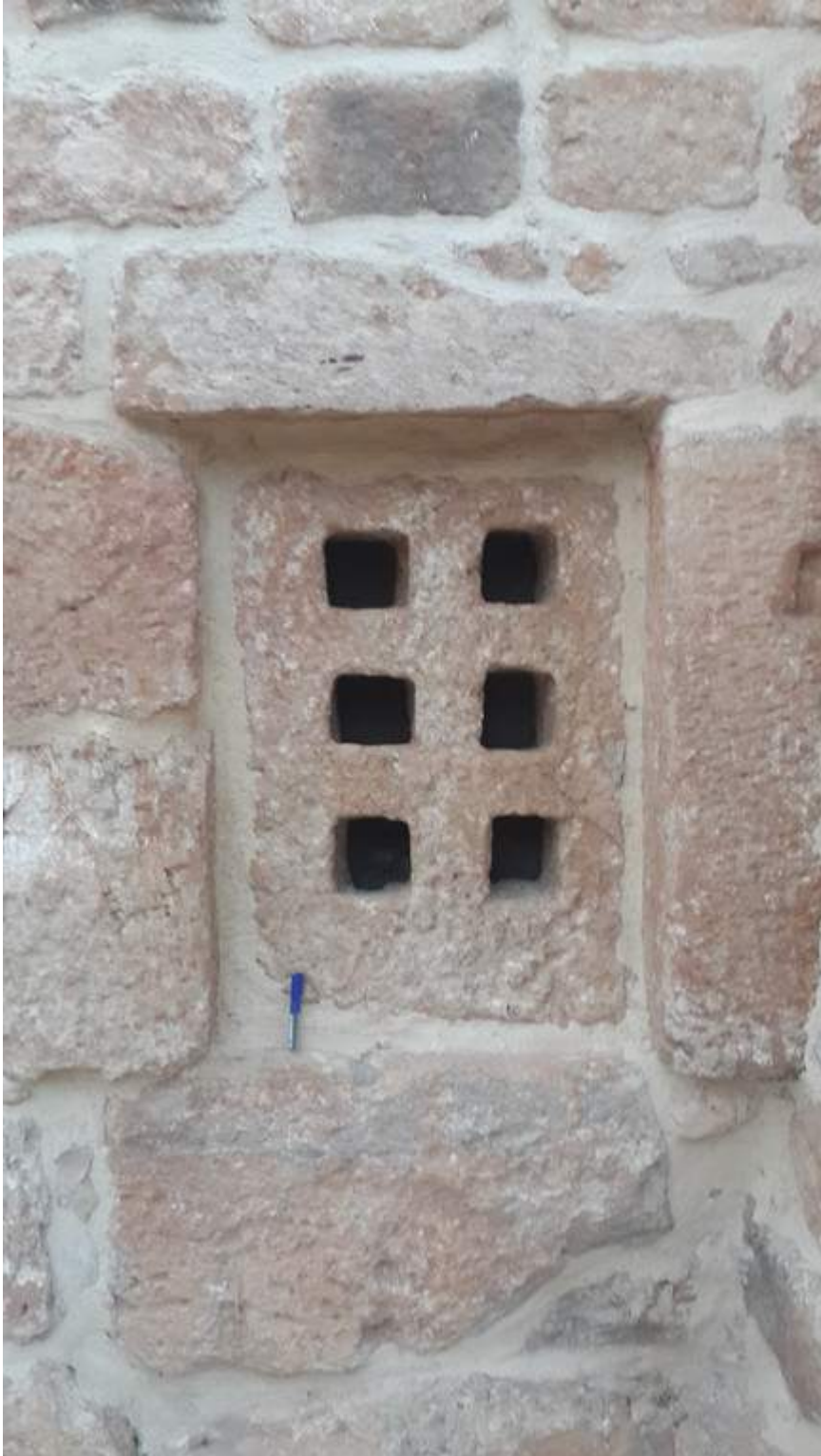
Tomb of Omar Bin Abdul Aziz, detail of window (Reported November 30, 2015)