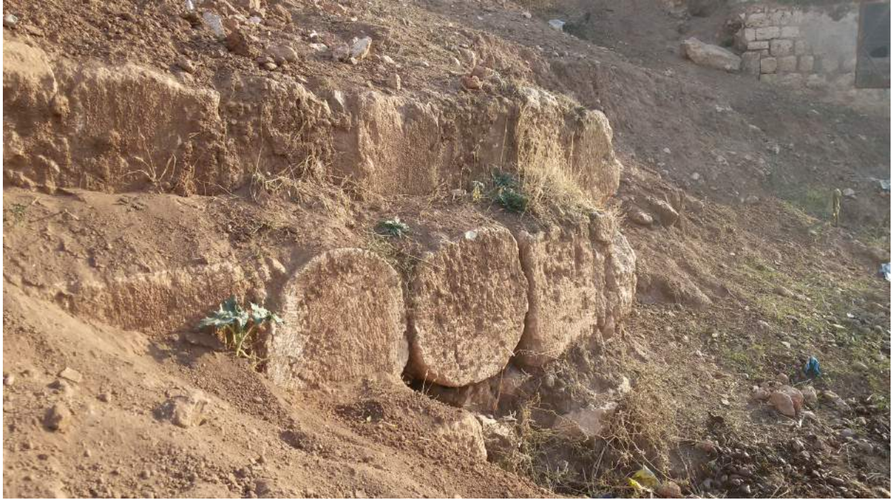
Al-Atareb, damage from gunfire (Reported November 30, 2015)