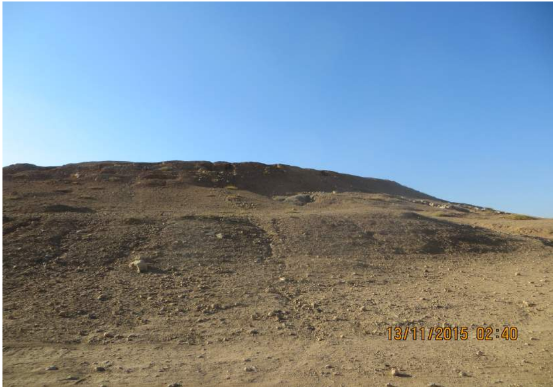
The eastern slope of the acropolis in Ebla