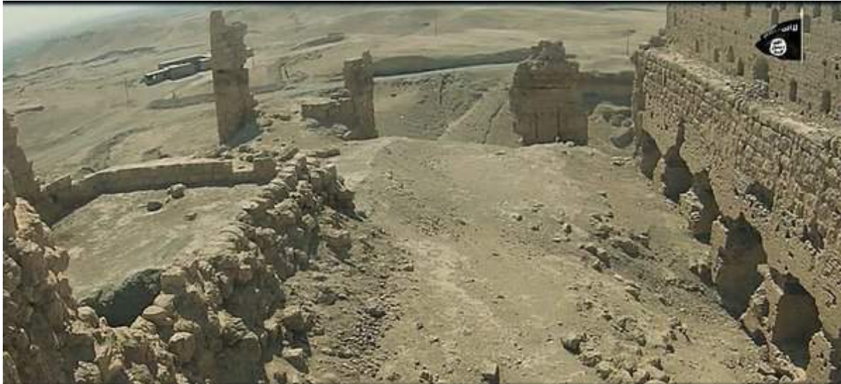
Qaalat al-Rahbeh, image still of from ISIL training video (Raqqa is Being Slaughtered Silently; December 3, 2015)

Burns, Ross (2009) The Monuments of Syria: A Guide . I. B. Tauris; Revised and expanded edition.