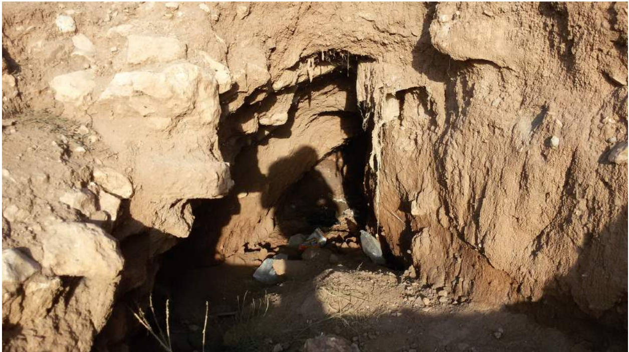
Al-Atareb, evidence of digging in search of antiquities (Reported November 30, 2015)