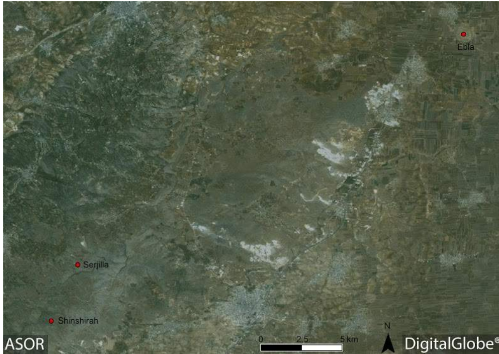
Location of three Idlib heritage sites allegedly hit by Russian Airstrikes (DigitalGlobe; October 10, 2015)