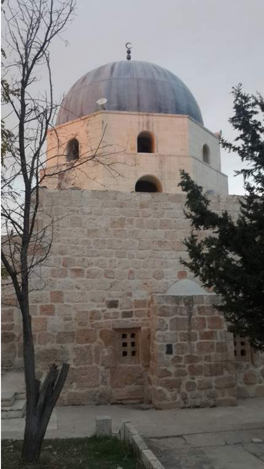
Tomb of Omar Bin Abdul Aziz (Reported November 30, 2015)