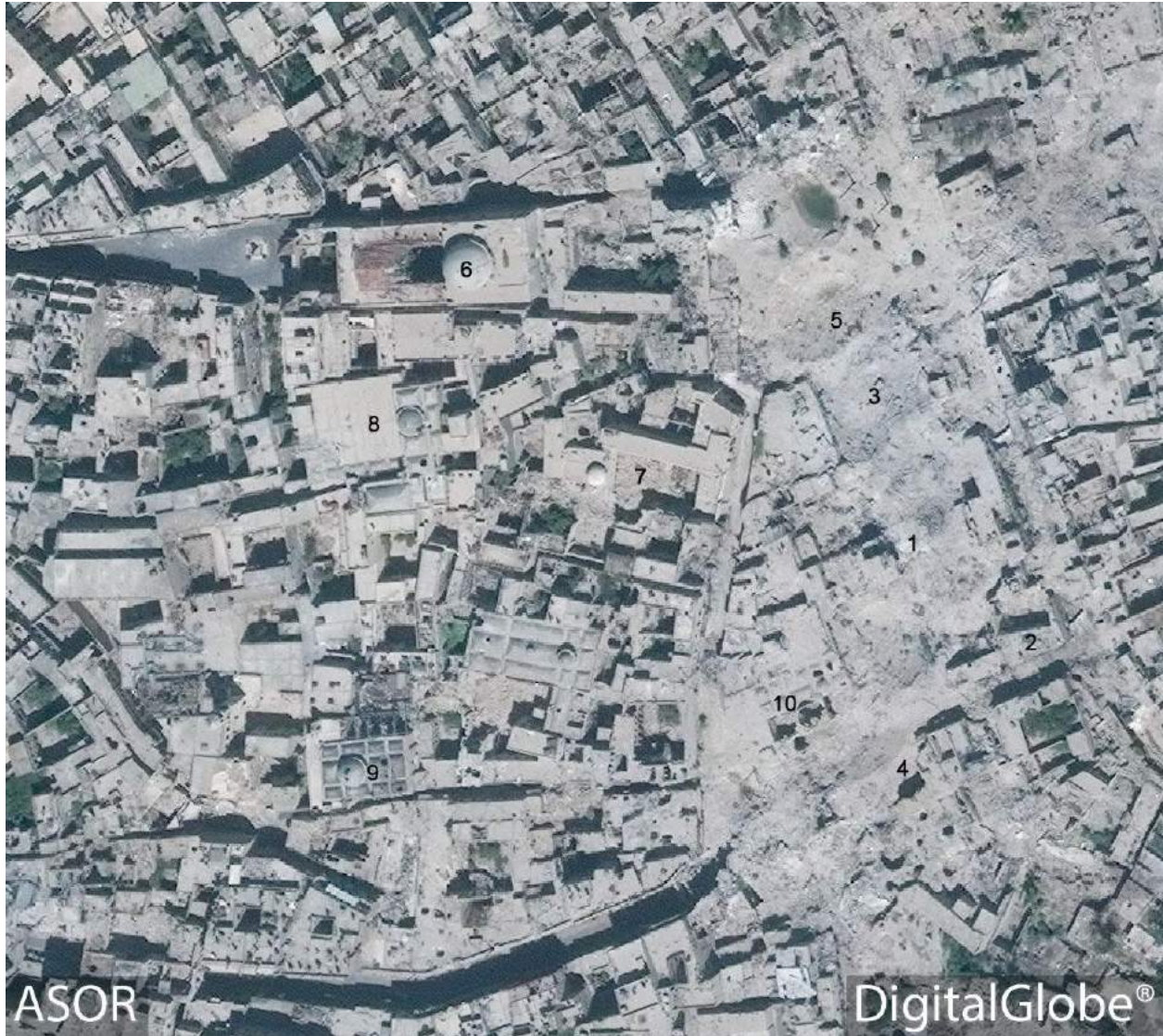
Jdeide Quarter in Aleppo. Sites featured are: 1. Endowment of Ibshir Pasha; 2. Ibshir Pasha Mosque; 3. Khan Hatab; 4. Hammam Bahram Pasha; 5. Qastal Ozdmer; 6. Maronite Church; 7. Beit Ghazale; 8. Greek Catholic Church; 9. Greek Orthodox Church; 10. Historic Coffee House (DigitalGlobe; August 18, 2015)