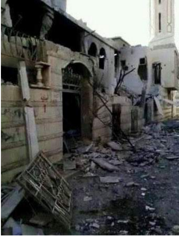
Al Eman damaged (Twitter, https://twitter.com/PalmyraPioneer/status/674763420126810112 ; December 9, 2015)