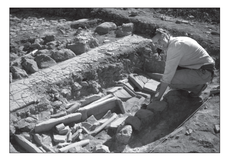
ASOR Newsletter, Winter 2010

I spent approximately 10 hours in lab each week drawing late Roman and Iron Age I pottery in preparation for publication. I also learned how to clean and sort pottery. Fieldtrips throughout the season complemented my field and lab work, and included visits to the national museums in Damascus and Aleppo and significant archaeological sites around Syria. *