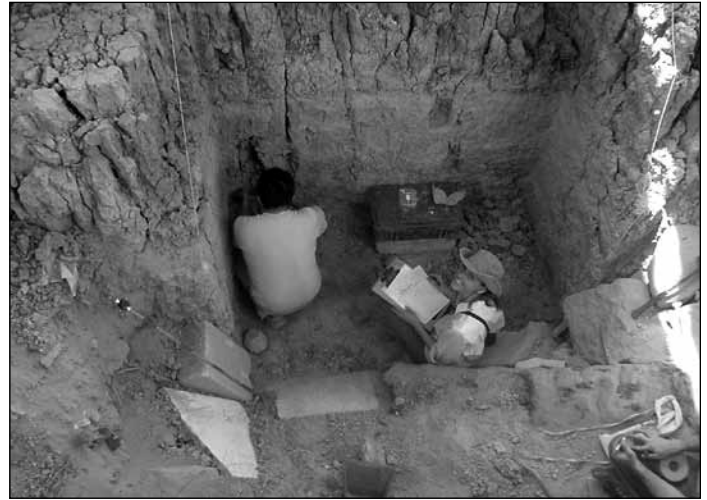
The Druze Marsh Paleolithic Project: Results of the 2009 Excavation Season

My involvement in the project, made possible in part by a 2009 Heritage Fellowship, centered around two main duties and/or goals. First, as an assistant crew member I fulfilled the need and desire to receive more practical field-work experience. I received training in excavation and lithic analysis, became involved in and thus learned some of the specialized knowledge attributable to the various areas of expertise of the collaborators involved (i.e. geoarchaeology, lithic analysis, zooarchaeology) and, was introduced to some of the logistics involved in the research process. Second, as a student looking toward becoming more involved in the project by undertaking independent research, I began to develop an MA thesis for my upcoming graduate work which commences this September (2009). I aim to undertake, in conjunction with similar and complementary paleoenvironmental studies already completed or underway in the re-