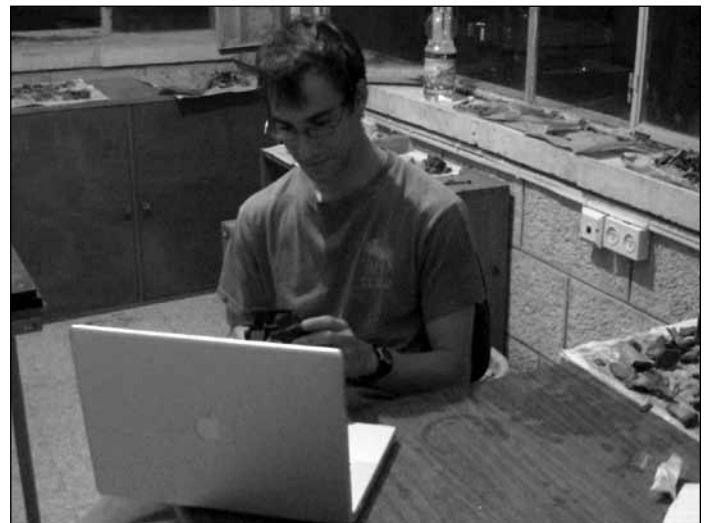
Picture: Analyzing the fauna at the Kenyon Institute, Jerusalem.

I began analyzing the fauna from Marj Rabba at the Givat Ram campus of Hebrew University in Jerusalem, which maintains a very comprehensive comparative collection of