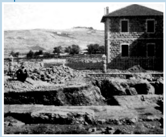
Albright Institute during it's early year's in Jerusalem