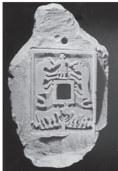
Late Early Dynastic plaque (7 N 407) from the Inanna Temple at Nippur, discovered during the 1960–1961 field season.