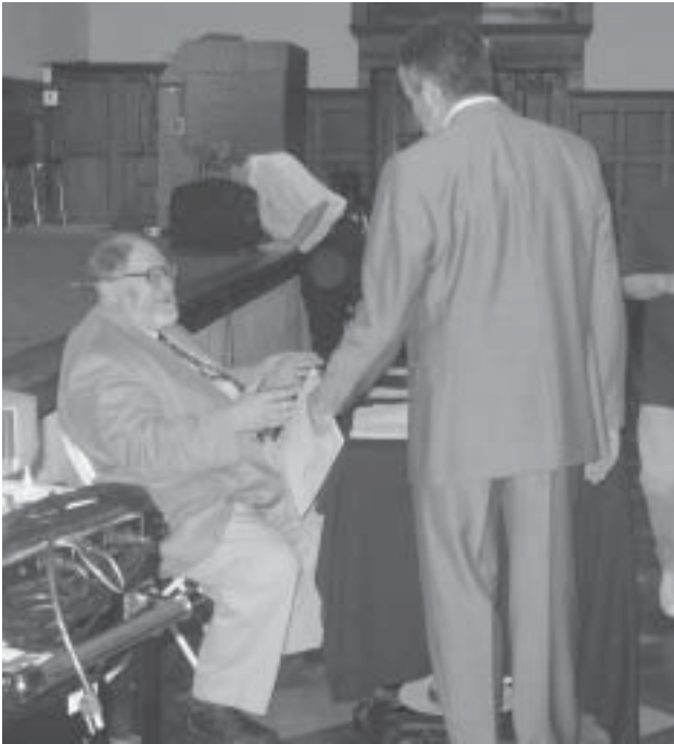
Larry Stager, left, and Israel Finkelstein, preparing for the Great Debate.

as well. Questioning traditional assumptions, such as has been the case in the “Solomonic” architecture debate, forces all scholars involved to examine the material in a way not done previously and hopefully will force scholars to be more specific than generalizing in the future and more careful about interpreting what their data mean.